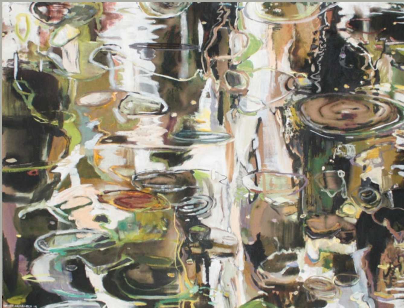
David Alexander, A Sequel to Green Water , 2013, acrylic on canvas, 35.5 x 47.5 inches