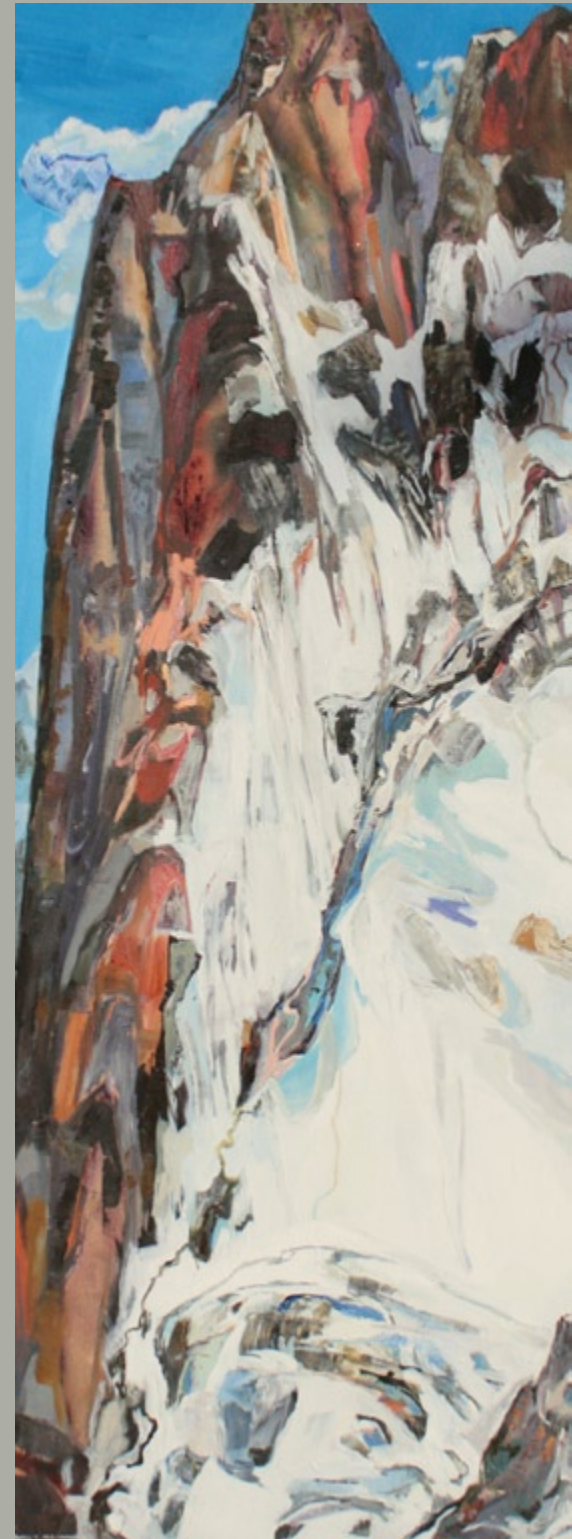
David Alexander, The Taller Ice Route , 2014, acrylic on canvas, 95.25 x 33.75 in.; Arrows to Hope , 2014, acrylic on canvas, 95.25 x 33.5 in.; Exposed Again + Again , 2014, acrylic on canvas, 83.25 x 29.5 in.