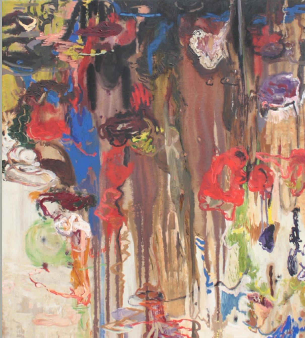
David Alexander, Casting Flowers , 2013, acrylic on canvas, 57.5 x 51.5 inches