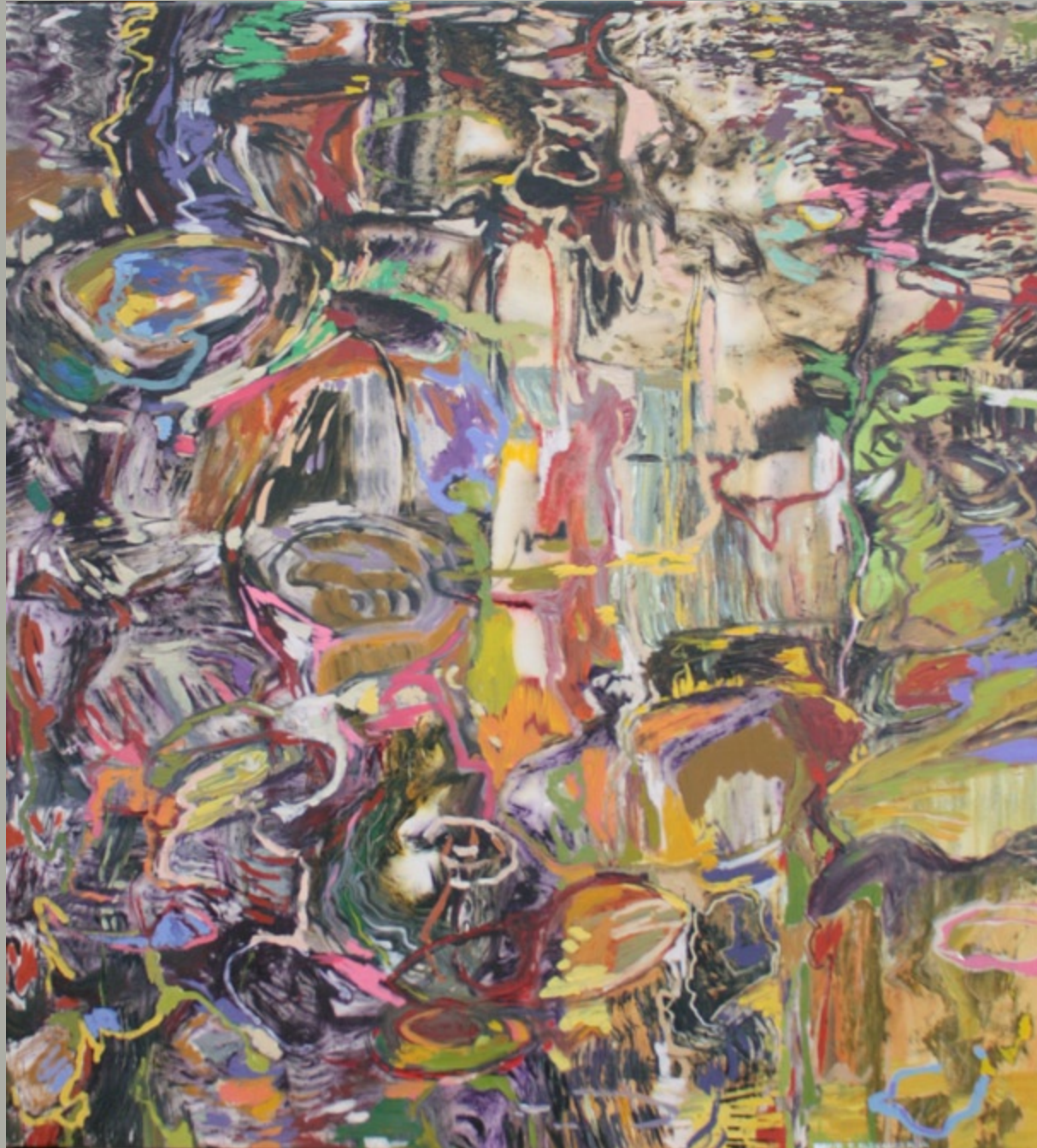
David Alexander, Water as Graffiti Evidence , 2013, acrylic on canvas, 57 x 51 inches