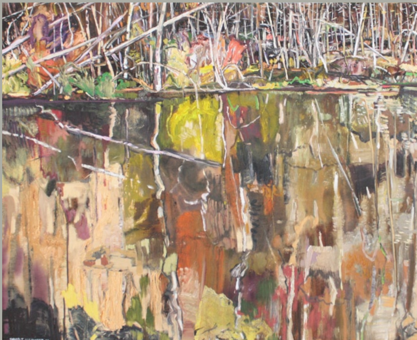
David Alexander, Upon Being Lost and Found , 2014 acrylic on canvas, 31.5 x 39.5 inches