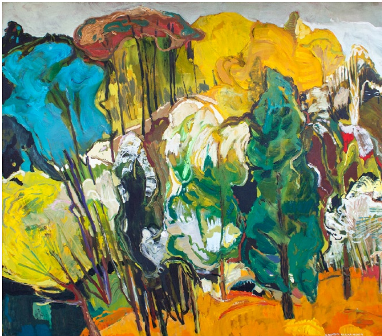
A Coastal Copse Theatre acrylic on canvas 46 x 52 inches