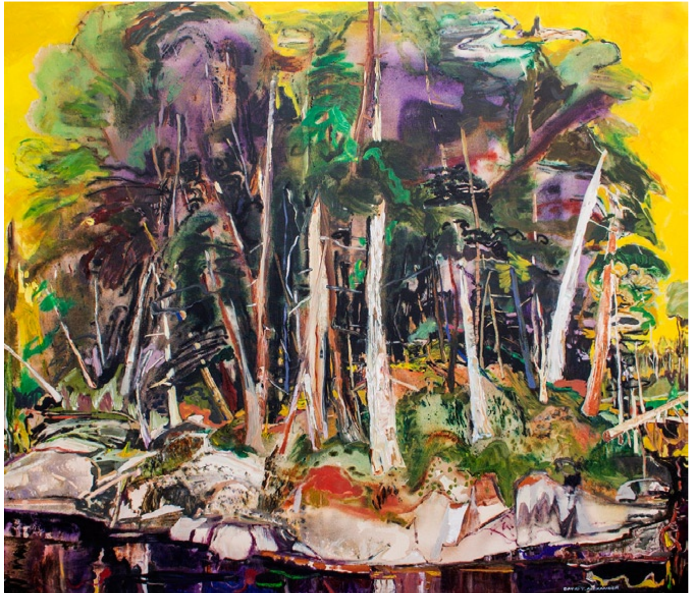
When They Fall the Rock Island Remains & History Becomes Mystery acrylic on canvas 56.5 x 66 inches