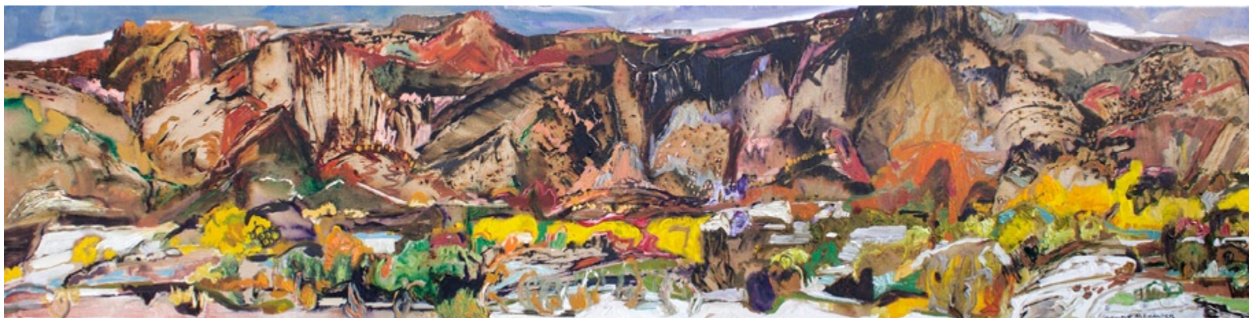
Heading Through To The Cariboo acrylic on canvas 24 x 96 inches