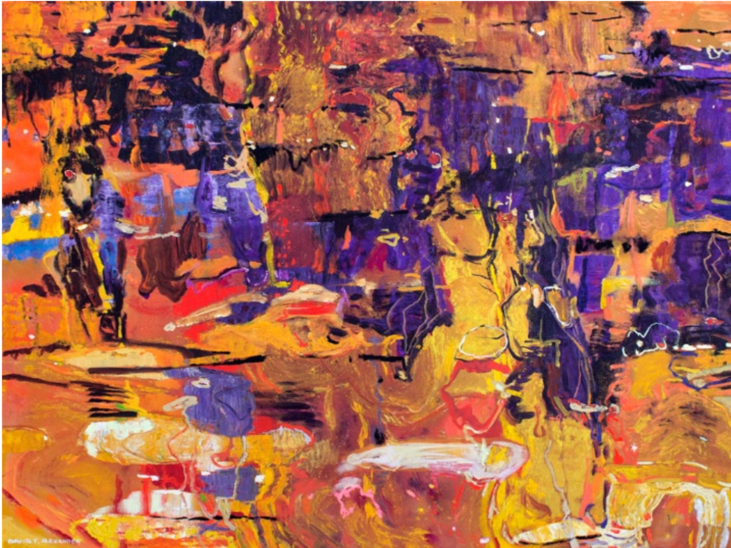
Last Five Minutes Of The Last Day, Kaloya acrylic on canvas 36 x 48 inches