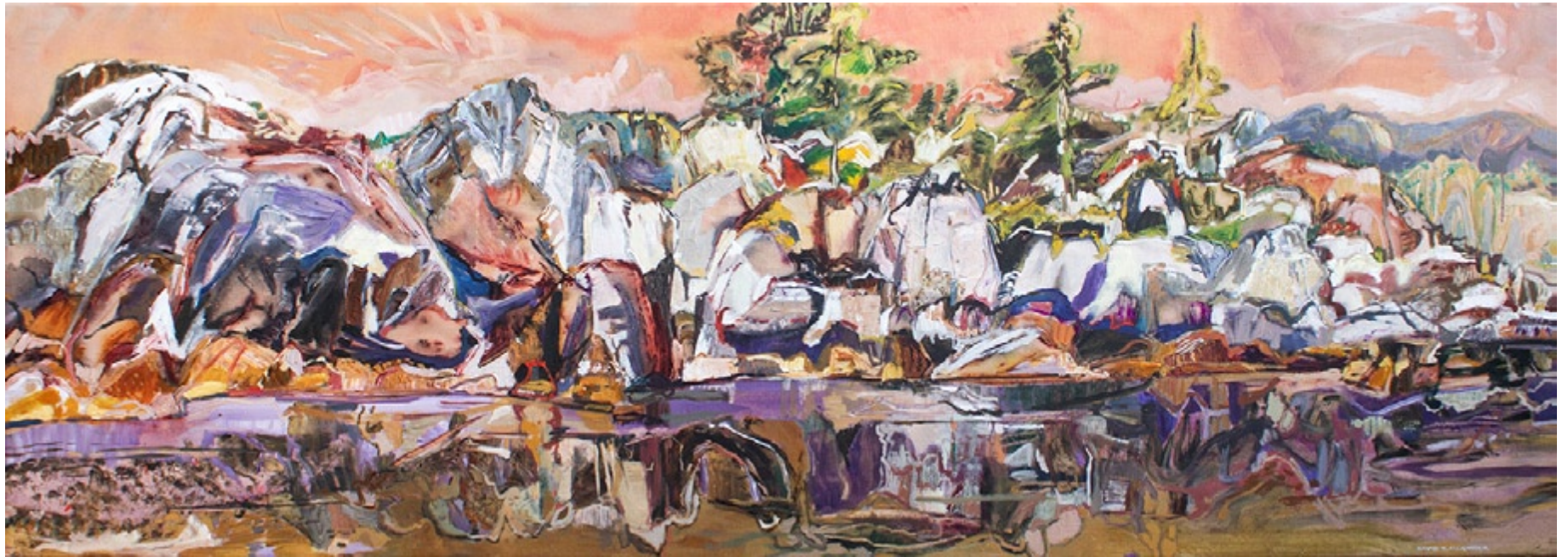
White Outer Island Rocks acrylic on canvas 34 x 96 inches