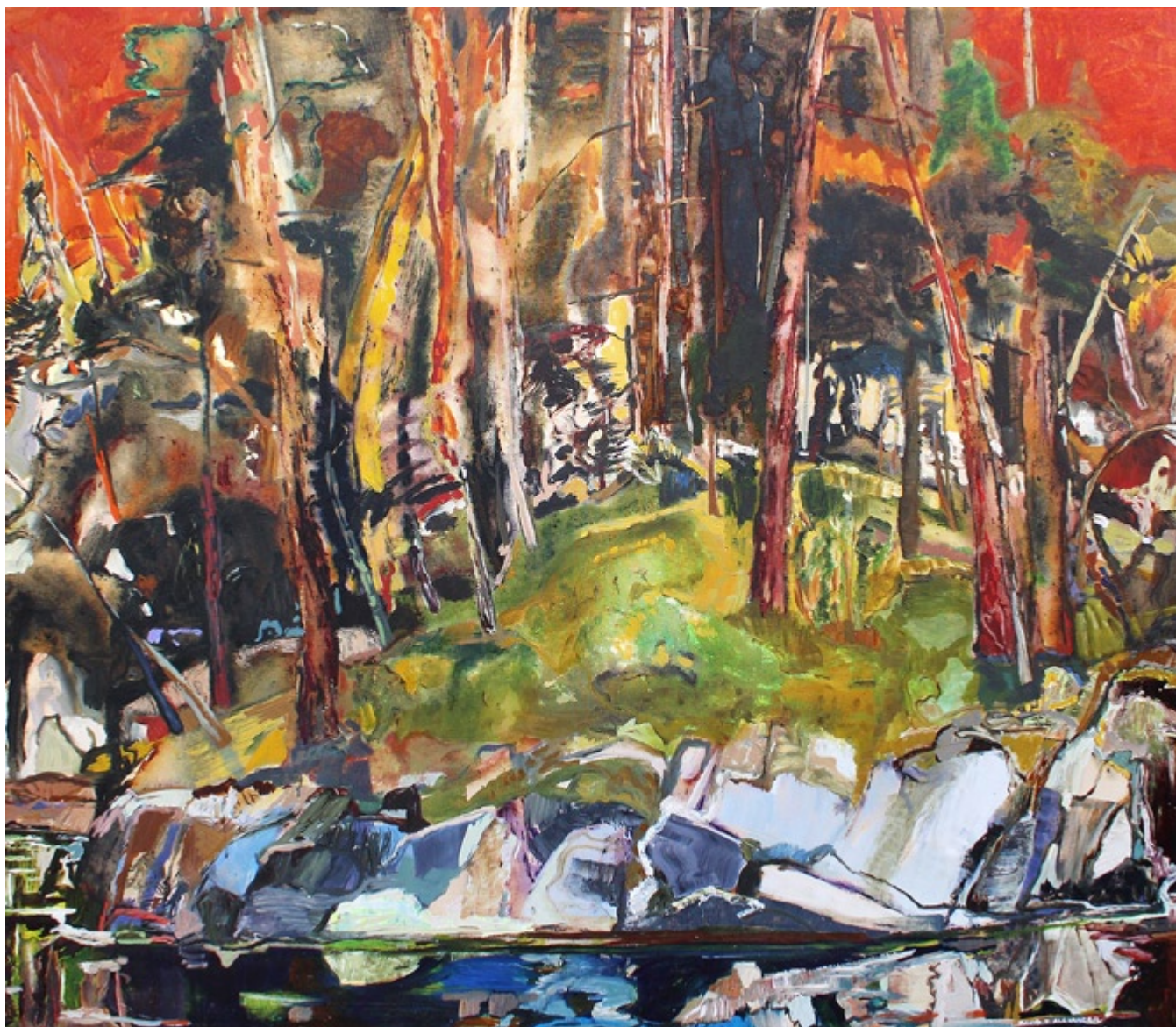
Time And Place For A Rehearsal For A Pole acrylic on canvas 57 x 65 inches