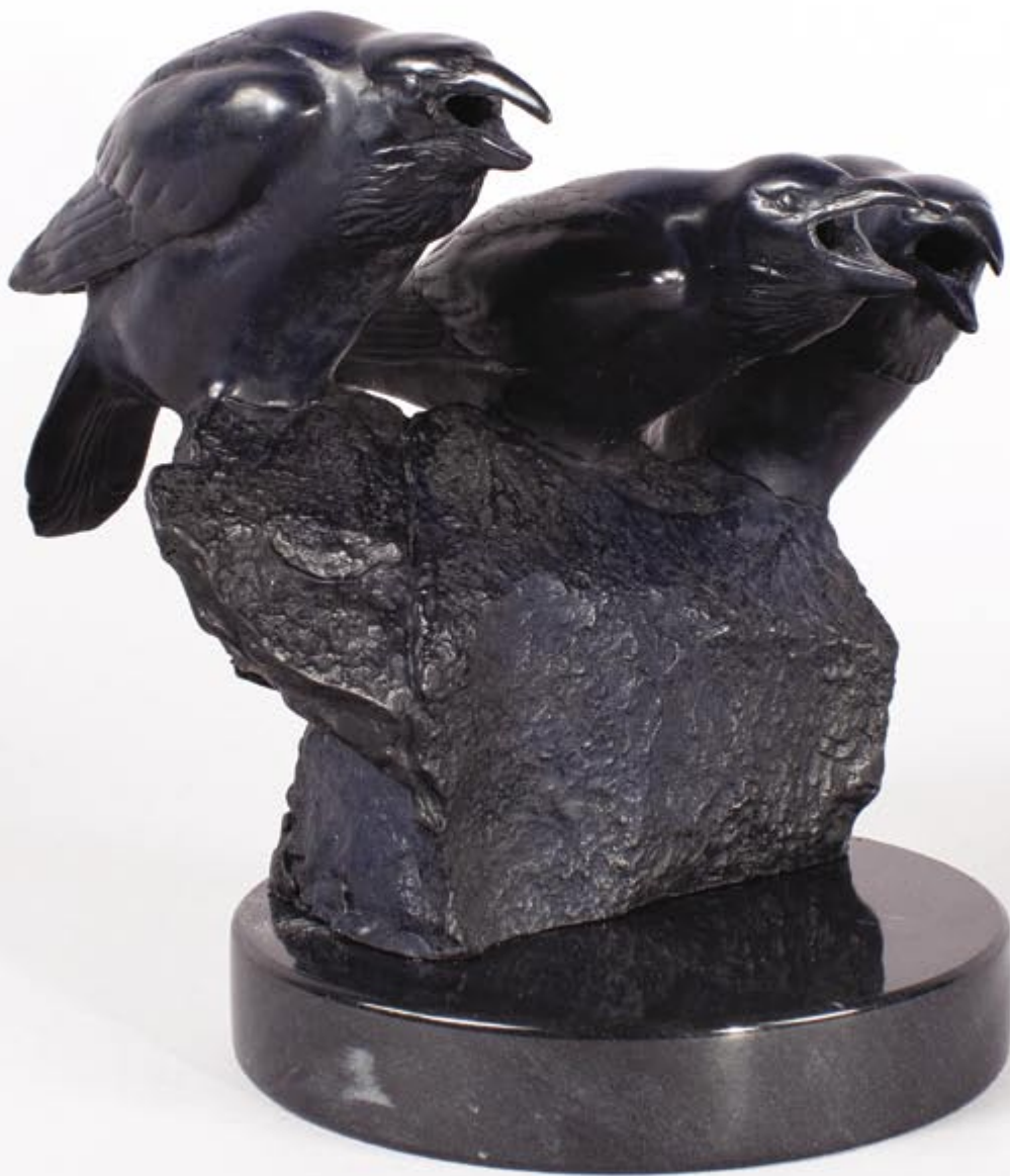
Conspiracy of Ravens , AP 1/1, edition of 6, bronze, 8 x 8.5 x 7.5 inches

The sagacious nature of ravens becomes apparent to anyone who has spent time in their company. When walking through the woods about my studio I hear them croaking and cackling from the tree canopy overhead. I wonder about their conversations and I have no doubt that they are capable of sharing unique raven insights developed through their thousands of years in close association with humankind. Are they up to something I wonder? Is there a conspiracy afoot?