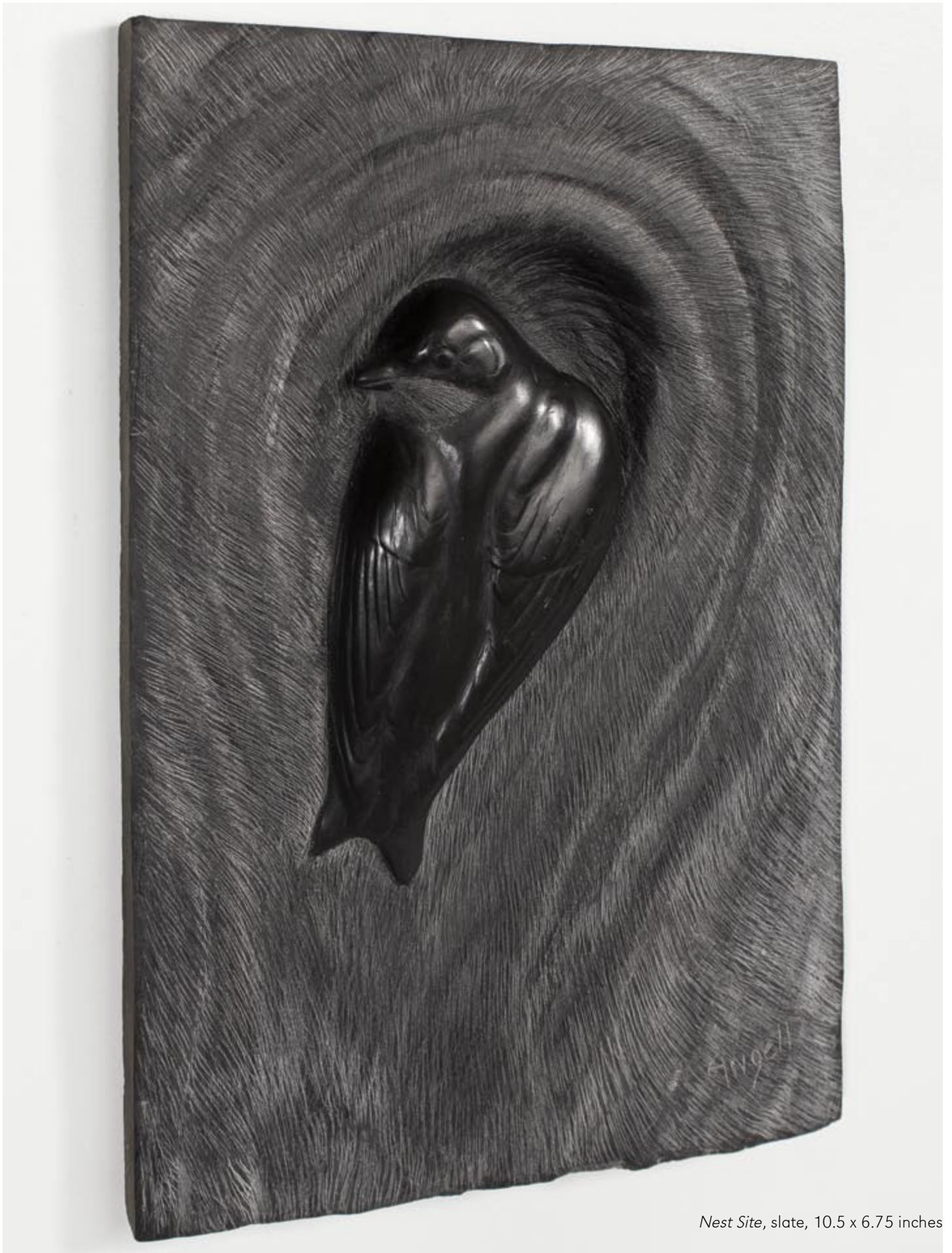
Nest Site , slate, 10.5 x 6.75 inches