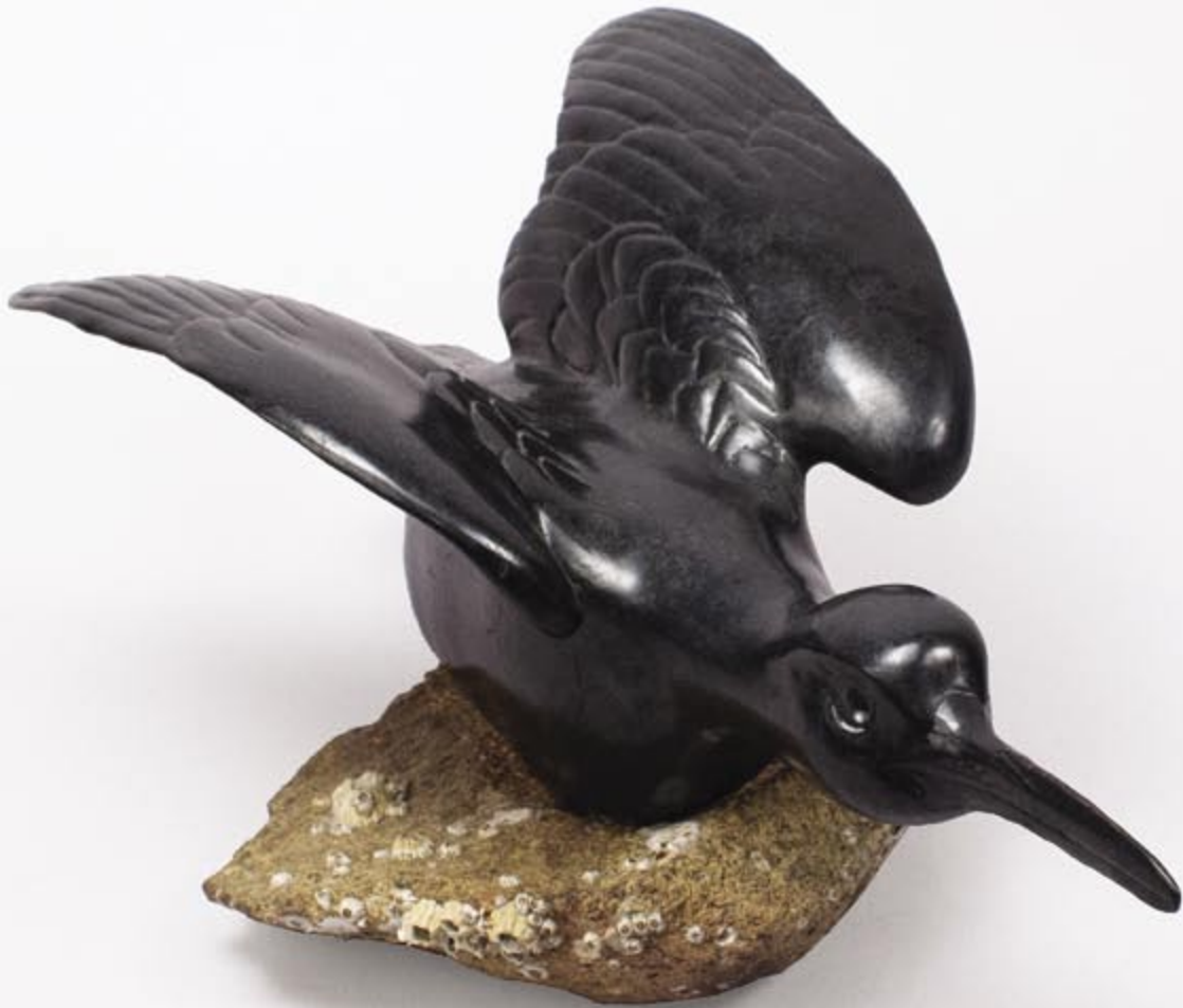
Wing Stretch , 1/1, bronze, stone, 6.75 x 14.5 x 8.5 inches

Our shorebirds in the Northwest possess an extraordinary range in the shapes and sizes of their bills, all tailored to exploit a wide range of feeding niches along our waterways. Turnstones, with a slight upcurve to their stout bills, can flip over small beach stones to discover some tiny animal attached to the underside. Whimbrels with their long curved beaks can probe deep into the muddy substrate and extract ghost shrimp from its burrow. It is the oystercatcher however, equipped with its thick, stout, chisel bill and strong neck muscles that can pound, probe and pry to open muscles, limpets and barnacles. After such a strenuous morning of activity, a relaxing “wing stretch” is deserved.