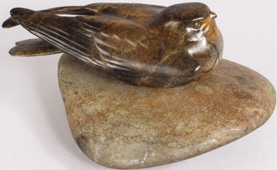
Day Roost , 3/6, bronze, stone, 5 x 9.5 x 8 inches

More than once I have accidentally startled a nighthawk roosting on the ground in open country. I rarely spot them beforehand as their subtle colors and patterns of plumage blend perfectly with the ground cover they have chosen to rest upon.