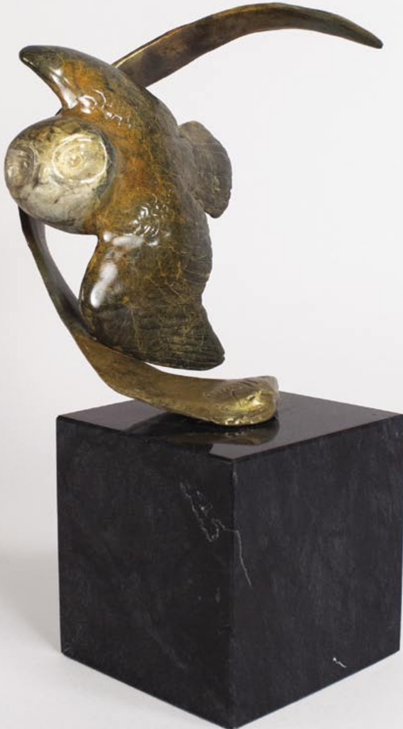
On The Hunt , 1/1, bronze, 11 x 6 x 7 inches

Some owls are out in daylight to hunt, not unlike hawks do. A pygmy owl, no bigger than a clenched fist will fly headlong through a willow thicket to pursue a small bird or mammal. The moment, augmented by the curved embrace of the bronze, portrays the bird's determined flight, as it threads its way through or around an obstacle.