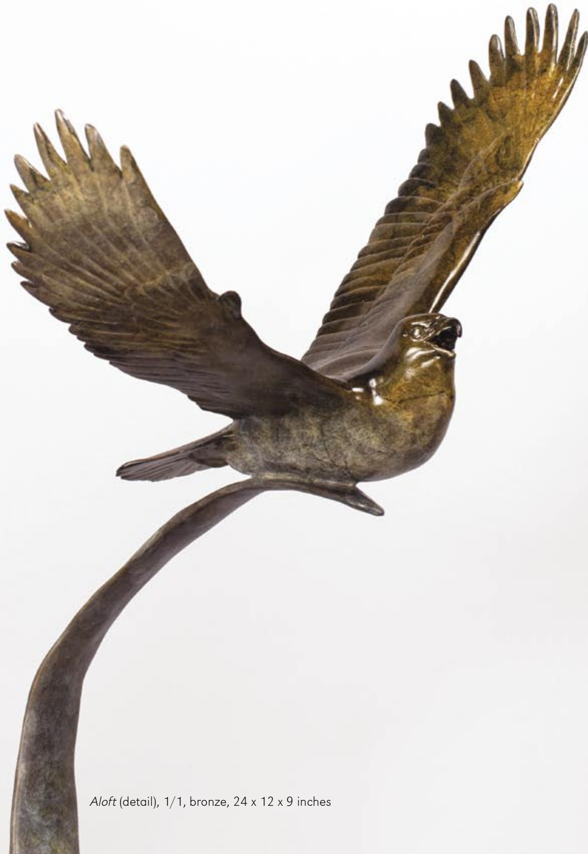
Aloft (detail), 1/1, bronze, 24 x 12 x 9 inches

Whether in migration or on site for its spring and summer residency, hawks will soar for a variety of reasons. Their courtship rituals may include time in the sky wherein the male will demonstrate his fitness to the female. Certainly a hawk will ascend skyward where it can scout for prey below or patrol its territorial borders. I wonder too if there may be an element of delight the bird feels being aloft against the clouds.