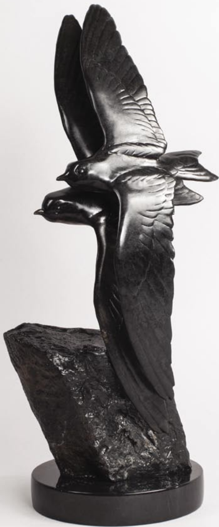
Synchrony , 1/1, bronze, 17 x 7 x 6 inches