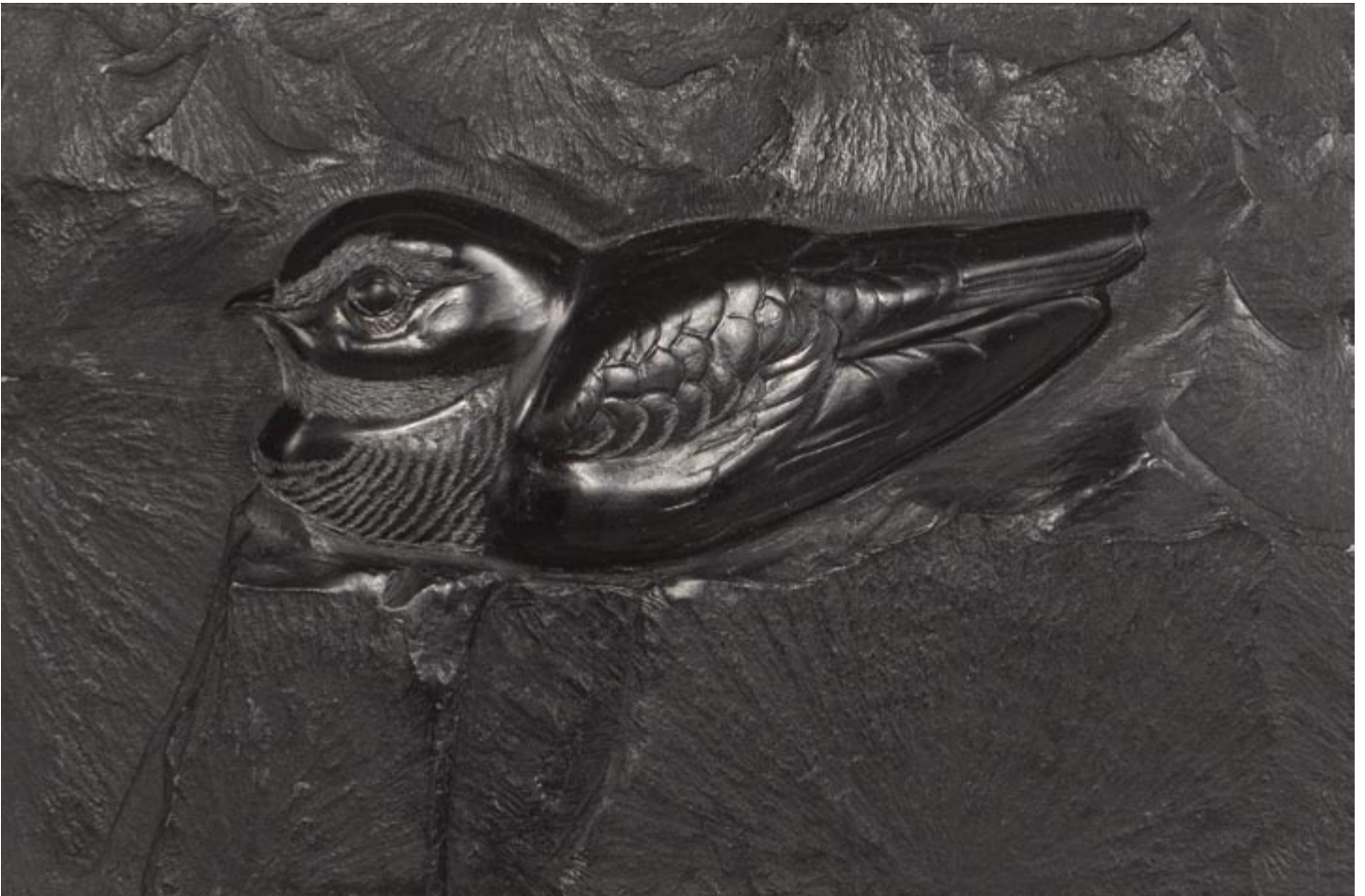
On The Ledge , slate, 6 x 9.5 x 1 inches

The nighthawk's smaller relative, the poorwill, is also skyborne and foraging in the evenings. For a day roost and seclusion the fox sparrow sized poorwill finds a narrow cliff ledge, settles in and becomes nearly invisible.