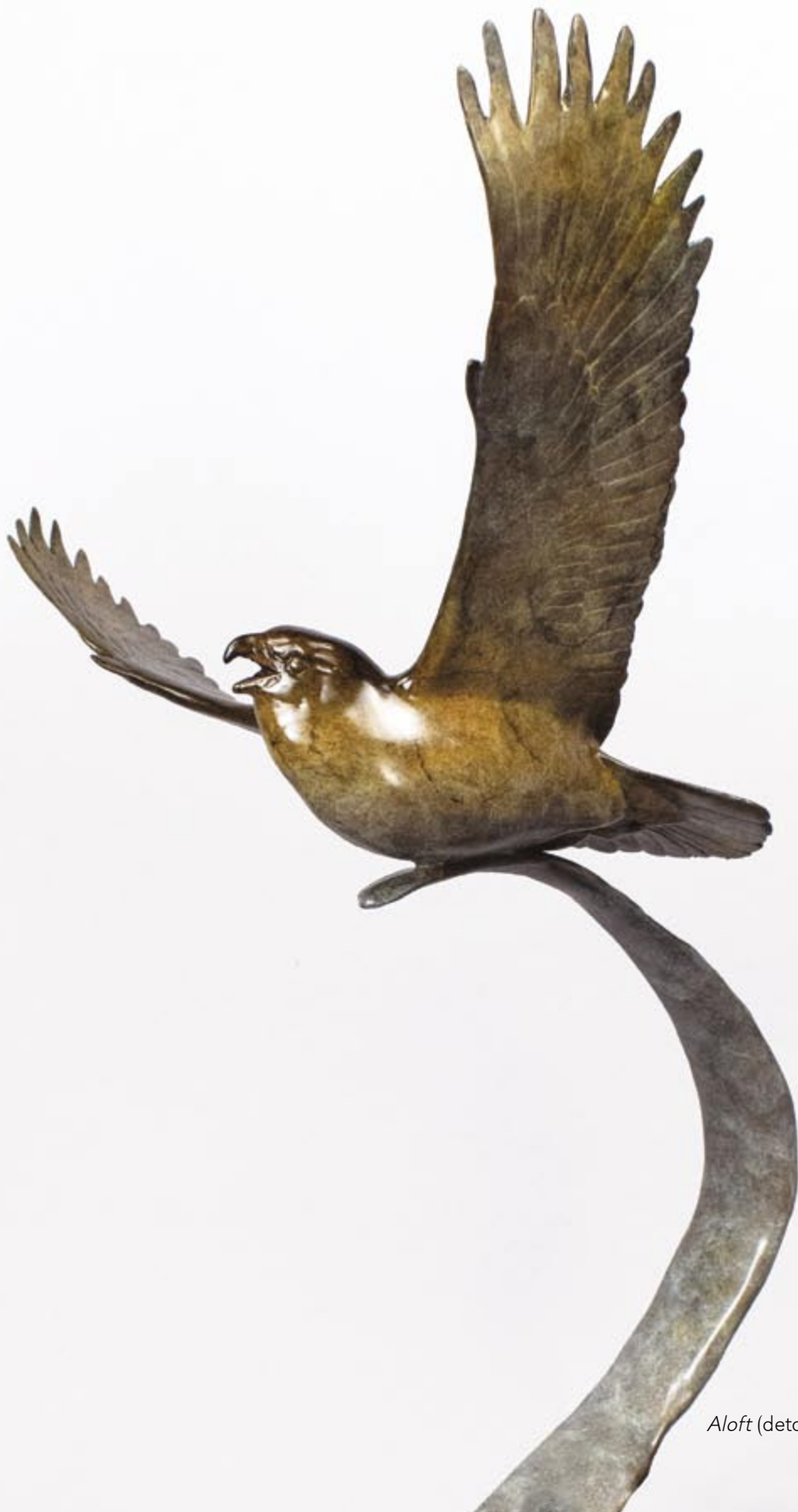
Aloft (detail), 1/1, bronze, 24 x 12 x 9 inches