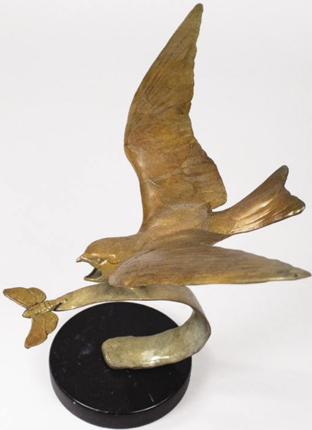
Skycutter , 1/1, bronze, 16 x 20 x 10.5 inches

Nighthawks herald in a summer's evening with their raspy calls heard overhead long before we see them. Aloft, they ride the warming air in dashing, zig-zagging flights catching insects.