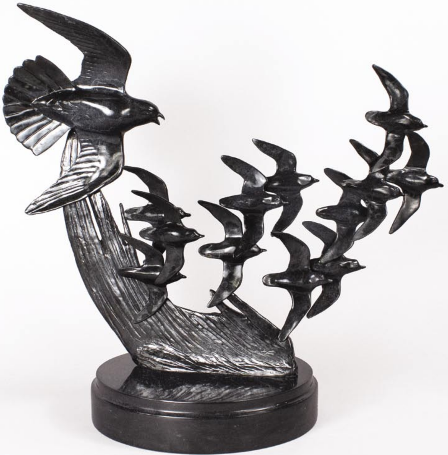
In Pursuit , 2/2, bronze, 17 x 19 x 10 inches

An artist friend visited me one fall so we might work together in the field, seeking to gather details, for a show of finished works we would do the following year. Out on the mud flats of the Skagit and Samish, we were well rewarded with an abundance of migratory birds. A high point occurred when we followed a pair of peregrine falcons in their prolonged chase of a flock of plovers. Before us was the challenge of catching the intensity of those chases.