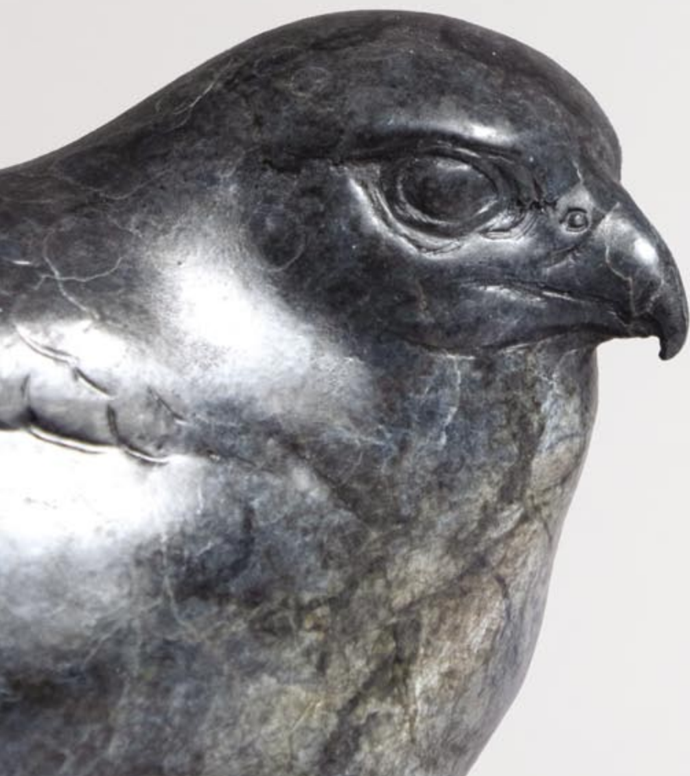
Indomitable (detail), 1/1, bronze, 8.5 x 11 x 6 inches