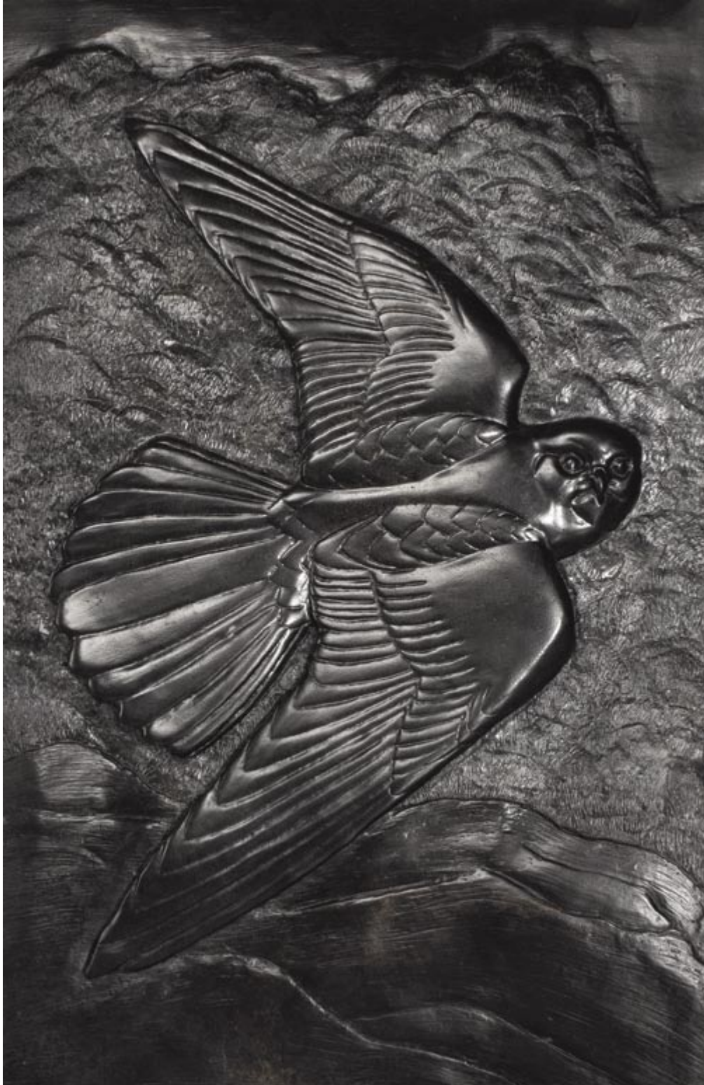
Against The Clouds , 1/1, bronze, 16.25 x 10.75 inches

It seemed fitting to put this indomitable falcon into the sky where she longed to be. An original slate carving was the medium to do this moment initially and this single casting of that piece in bronze allowed further refinement of that design.