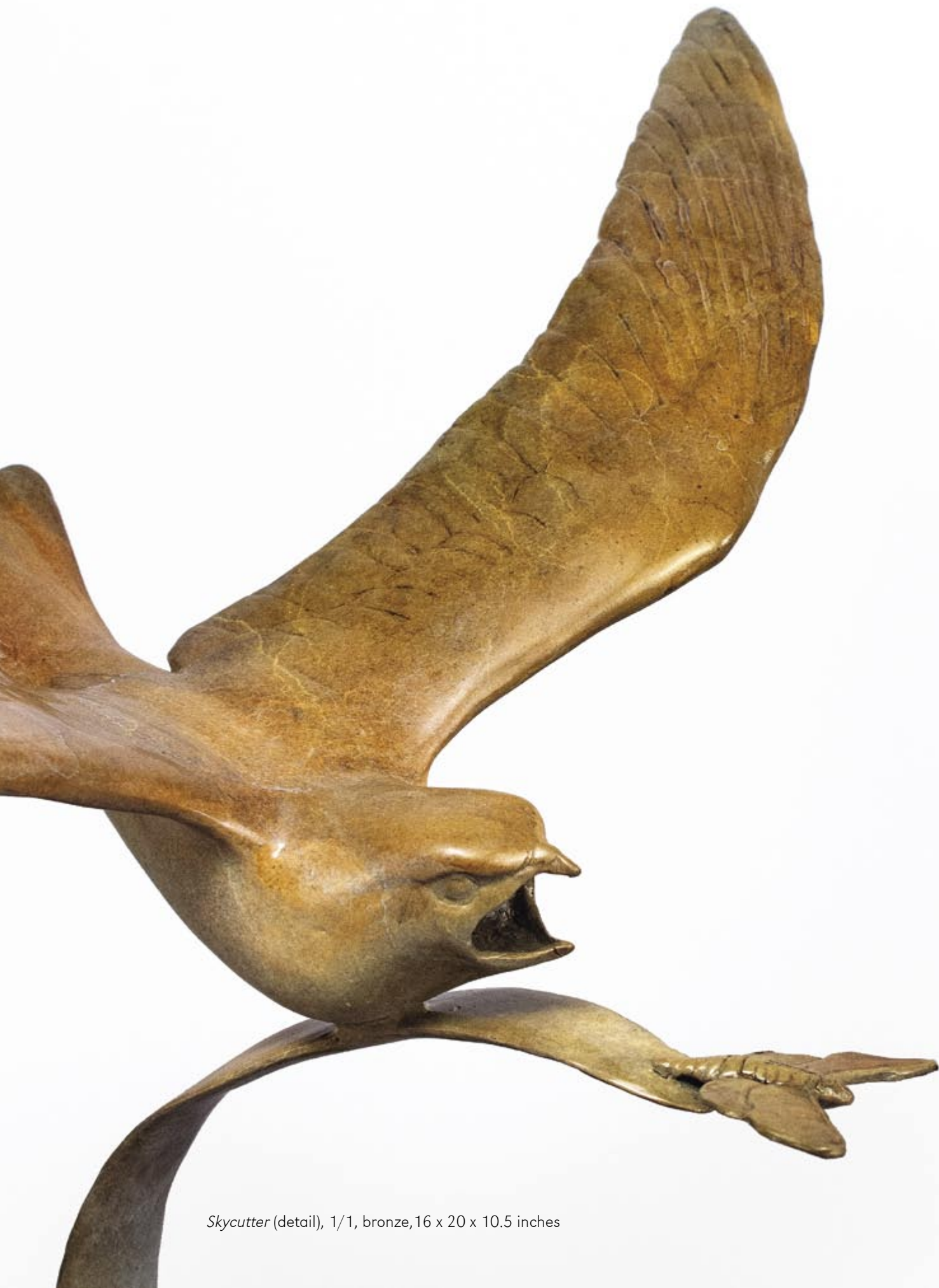
Skycutter (detail), 1/1, bronze, 16 x 20 x 10.5 inches