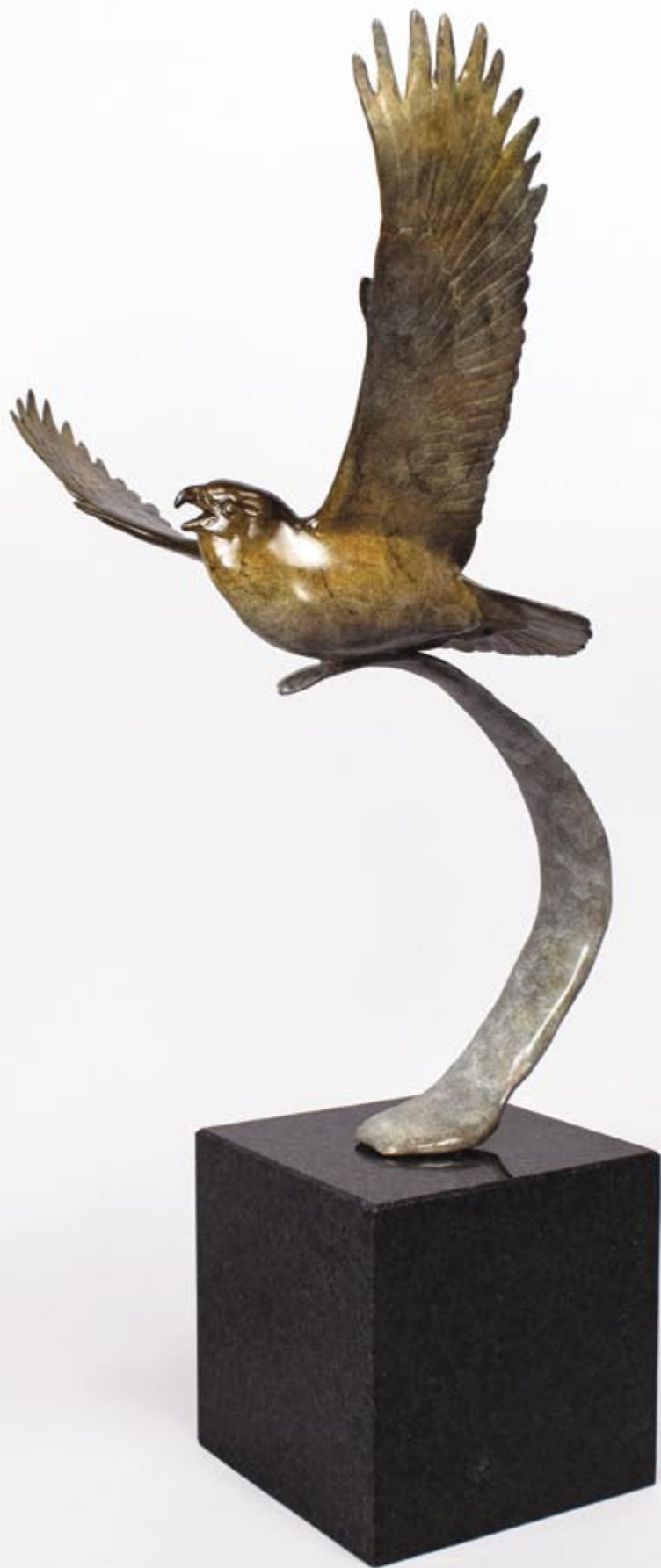
Aloft, 1/1, bronze, 24 x 12 x 9 inches