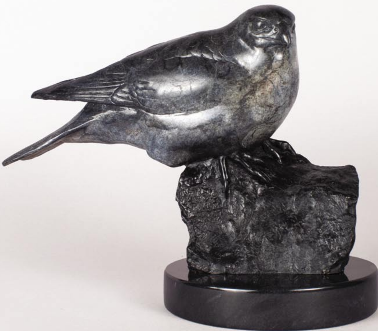
Indomitable , 1/1, bronze, 8.5 x 11 x 6 inches

Half a century ago, a badly wounded falcon came into my care and remained there to the end of her life. Her wound from a gunshot was irreparable and from her first moments with me I sensed defiance – humankind was responsible for her pain and anyone would become a focus of her wrath. There were times, however, when she would relax as I sat nearby to sketch her. When I would hold up a portrait I had done, I flattered myself thinking she took an interest in it. She seemed at ease and comfortable. When I initially sculpted this work in clay I remember vividly looking into the face of the model and there was that same expression the falcon would occasionally share. A rare moment of rapport with this indomitable spirit.