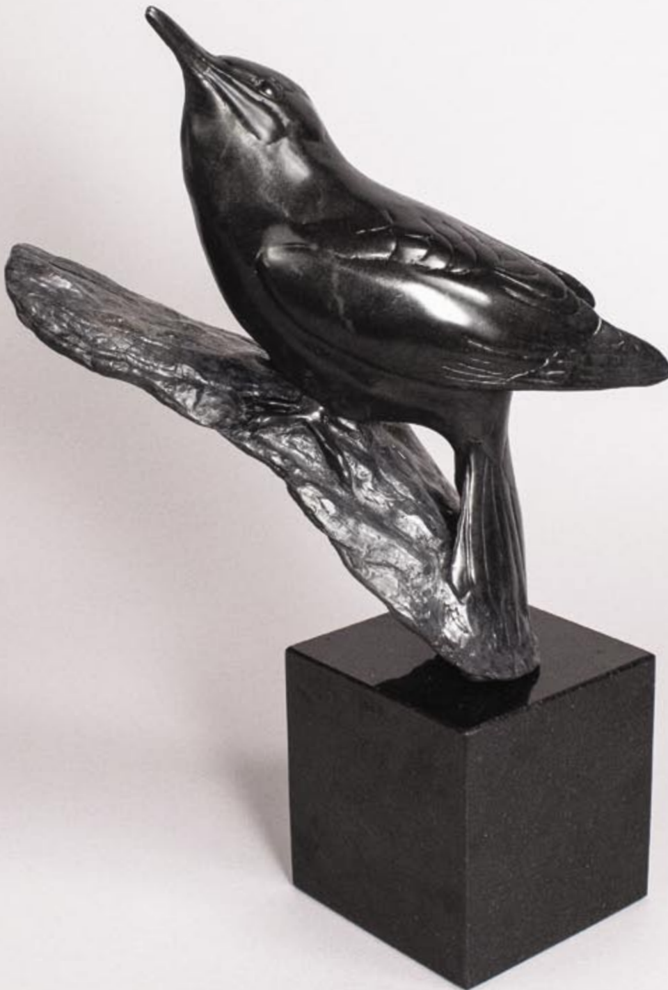
Cavity Sculptor, 3/6, bronze, 13.75 x 7 x 7.5 inches

A coiled spring in feathers, the flicker is both elegant and powerful. I watch them hitching up the flanks of forest giants in dashes, pause a moment to listen for some revealing sound beneath the bark, then pound, chip and chisel in search of a meal. They are master carvers possessing an intuitive precision when they fashion their nesting cavities. In following years, these same hollows provide safe retreats for a myriad of other forest species including small owls, flying squirrels, tree voles and honey bees. Flickers are a keystone species as their presence assures the likelihood that an ecosystem will maintain a diversity of life within it, so critical to the welfare of our environments.