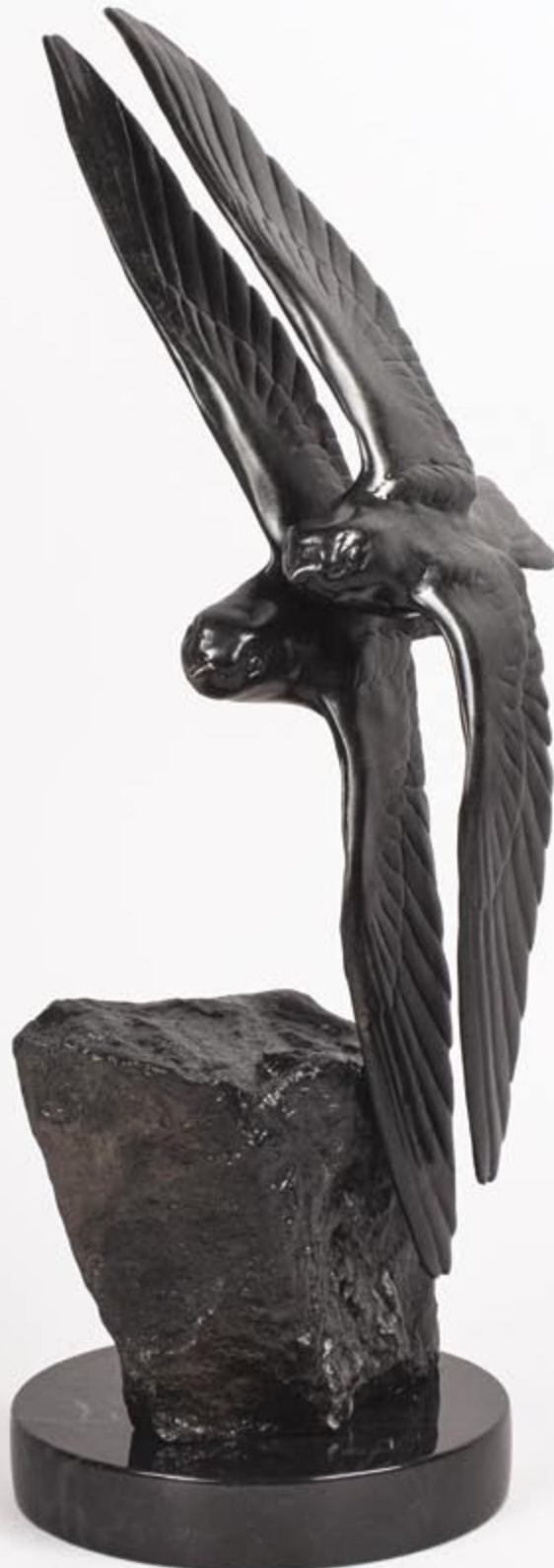
Synchrony , 1/1, bronze, 17 x 7 x 6 inches

One summer when looking across the bluffs and cliffs bordering Icicle Creek in the Cascades I followed a foraging flight of black swifts. They kept a close formation and at intervals appeared to be touching as they skimmed the tops of stone columns.