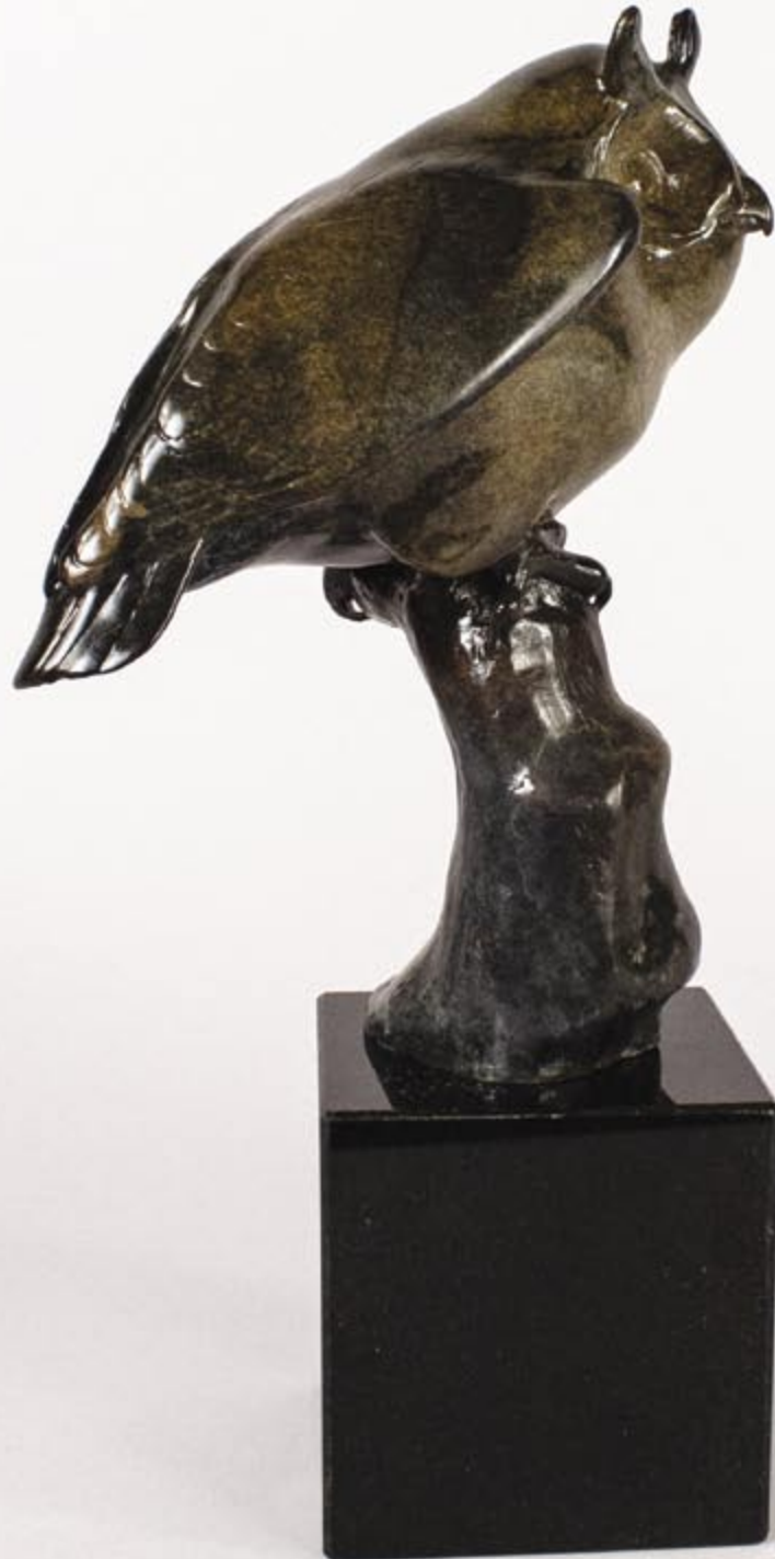
Emergence , 1/1, bronze, 13.5 x 6 x 5 inches

By circumstance and good fortune I have spent a lot of time with screech owls, particularly at times when they first emerge from their nesting and roost sites. Sometimes they pause at the edge of the nest entry, but often fly out to a favorite perch and wait a few minutes, appearing to get their bearings, before launching into an evening's activities. It suggests to me they are not unlike myself awaking to a new day, I will pause to consider where I am heading and what I am about to do. I begin the day with a preliminary plan rather than a random act. Perhaps the owl does this as well, choosing a favorite path along the creek's side where experience has told it that crawfish are likely to be feeding in the shallows at dusk.