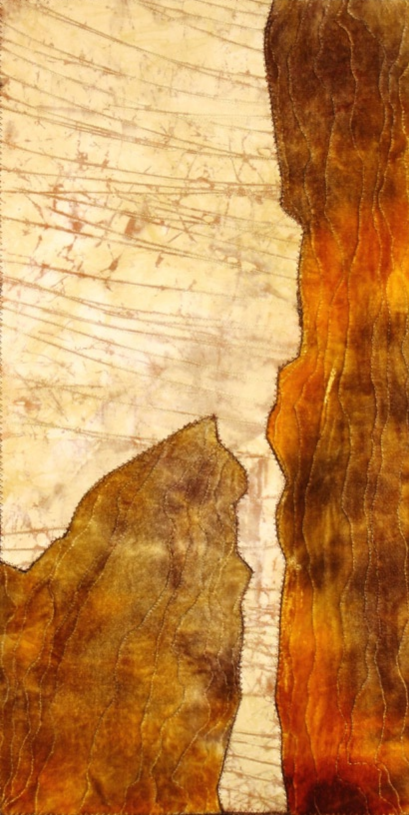
Glyph 2013 silk/rayon velvet, silk, chenille yarn 24 x 12 in.