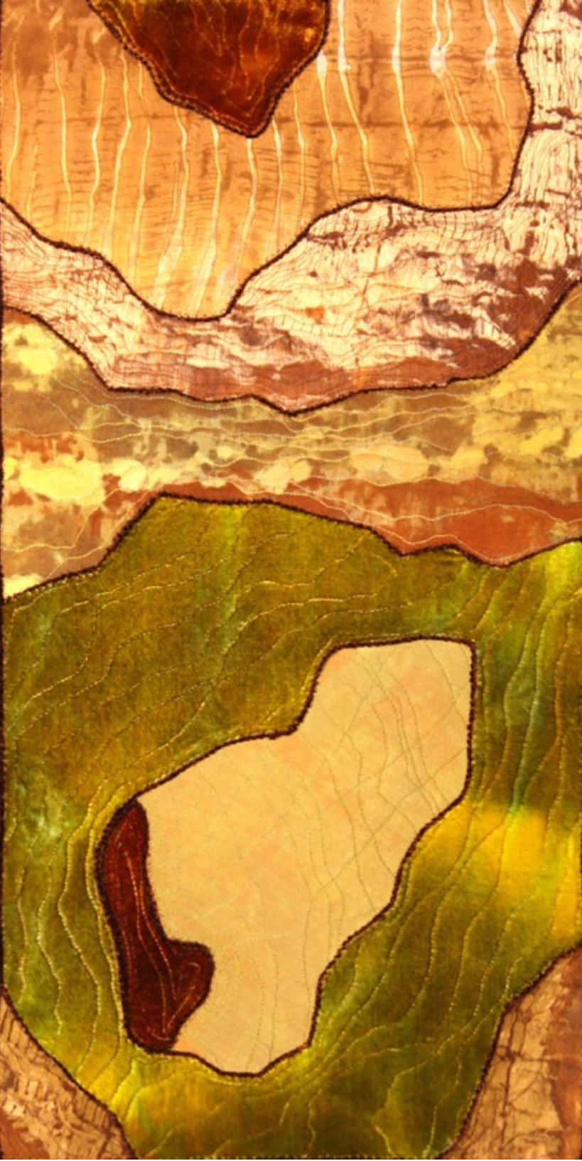
Cipher 2013 linen/silk double- weave, rayon/silk velvet, silk chiffon, silk crepe, 24 x 12 in.