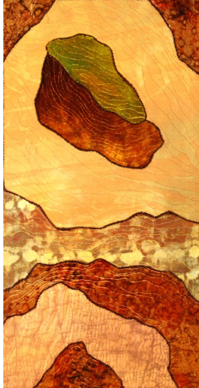
Cypher 2013 linen/silk double- weave, rayon/silk velvet, silk chiffon, silk crepe, chenille 24 x 12 in.