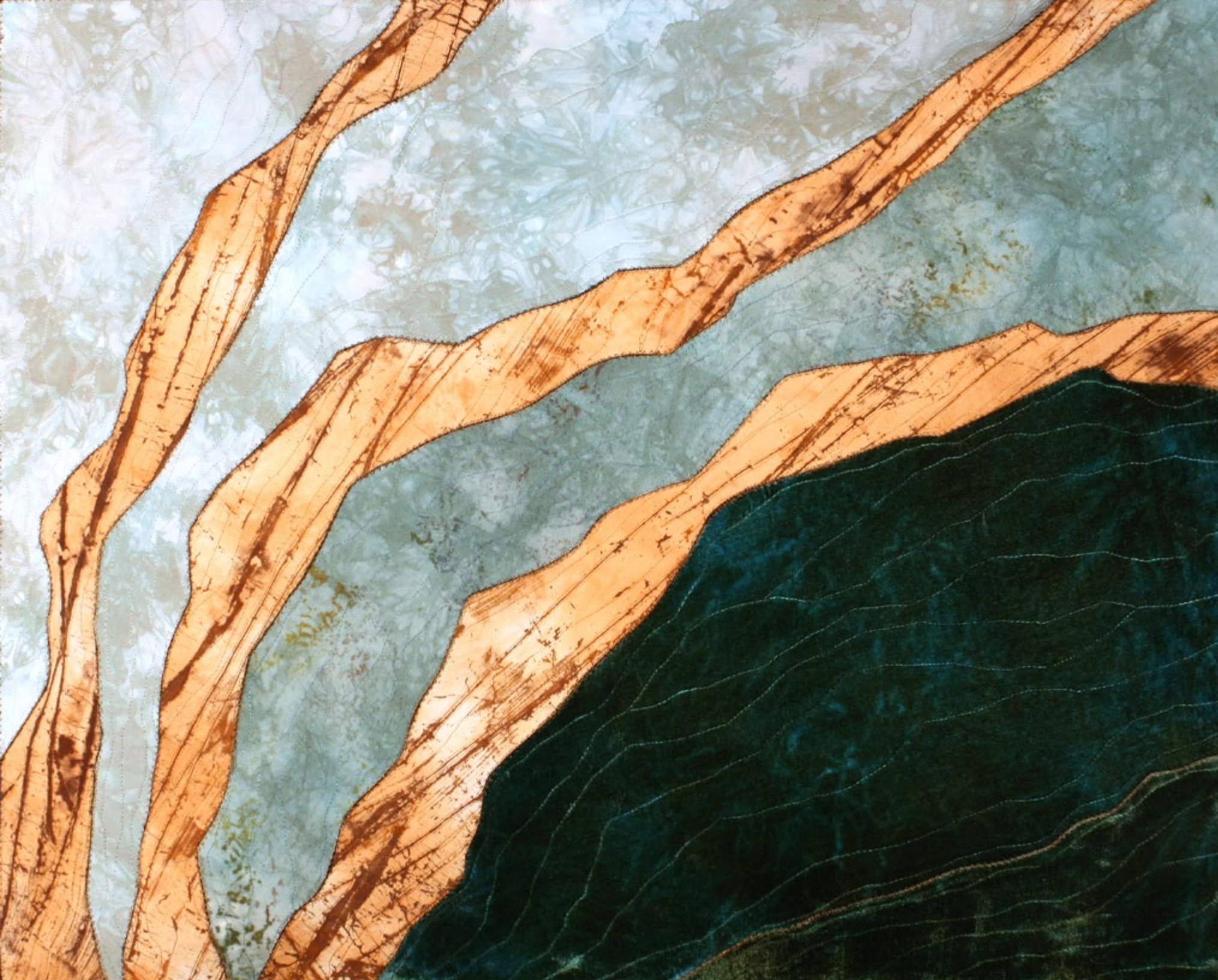
Copse 2013 silks, cotton, rayon/silk velvet, wool yarn, 24 x 30 in.