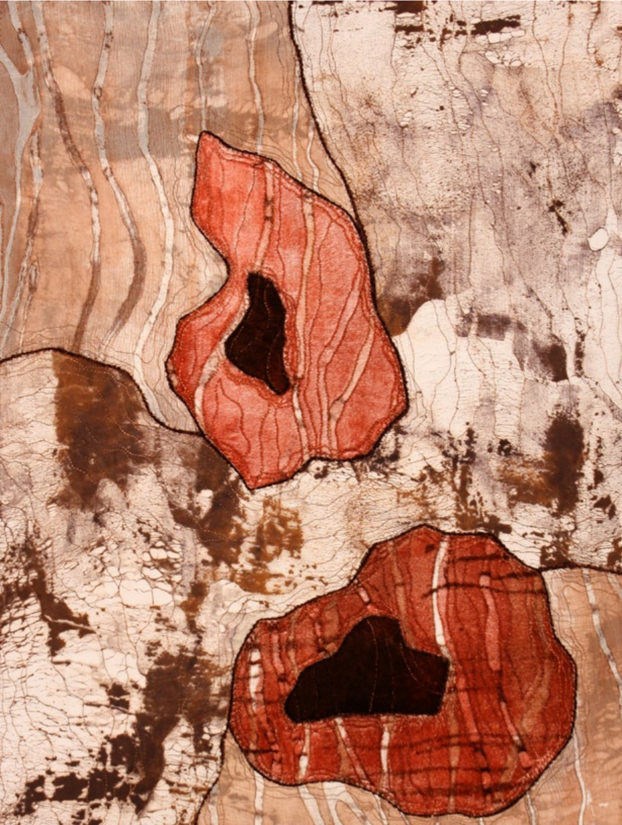
This Page: Echo , 2013, silk, rayon, silk/rayon velvet, chenille yarn, 24 x 18 in. Next Page: Cambium , 2013, rayon, raw silk, linen/silk double weave, chenille yarn, 24 x 38 in.