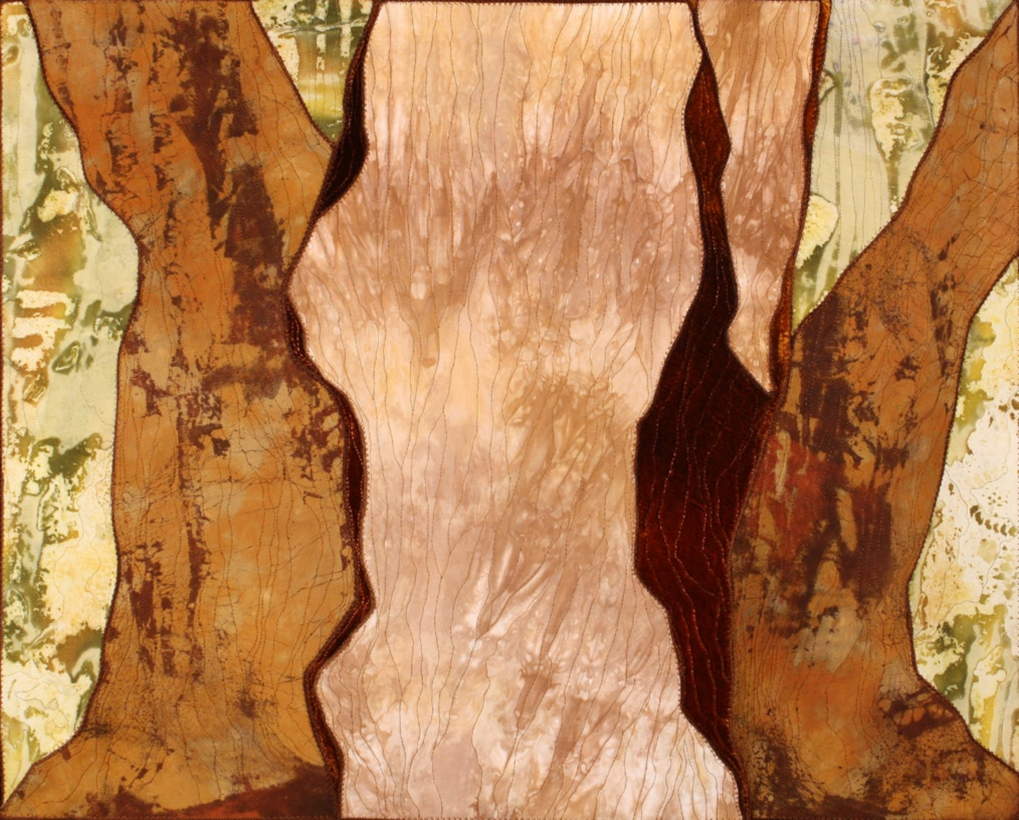
Heartwood 2013 cottons, rayon, rayon/ silk velvet, wool yarn 24 x 30 in.