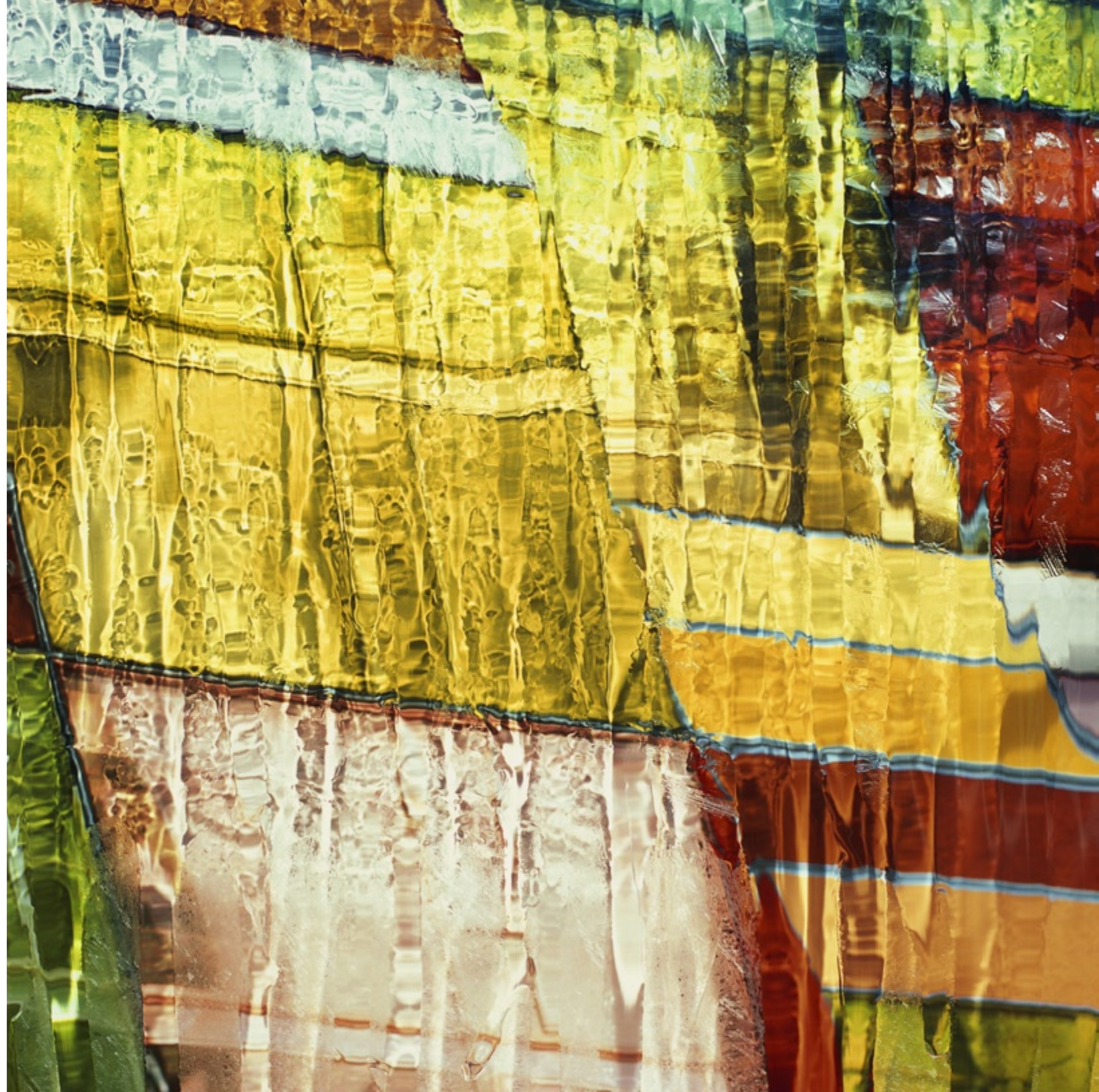
NYC 8 2013 photo C print 40 x 40 in.