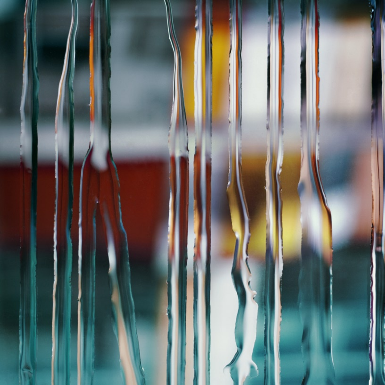
NYC 6 2012 photo C print 30 x 30 in.