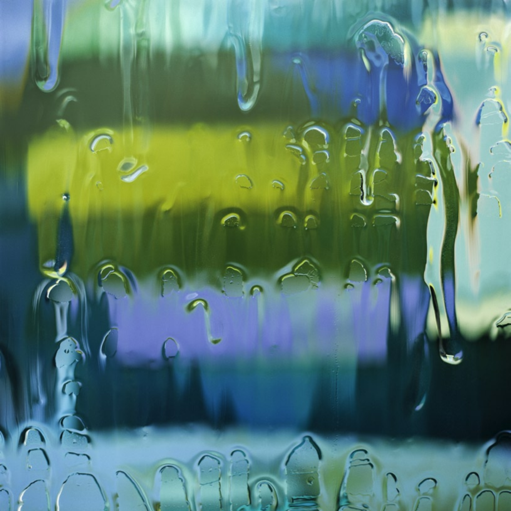
BEE 1 2010 photo C print 30 x 30 in.