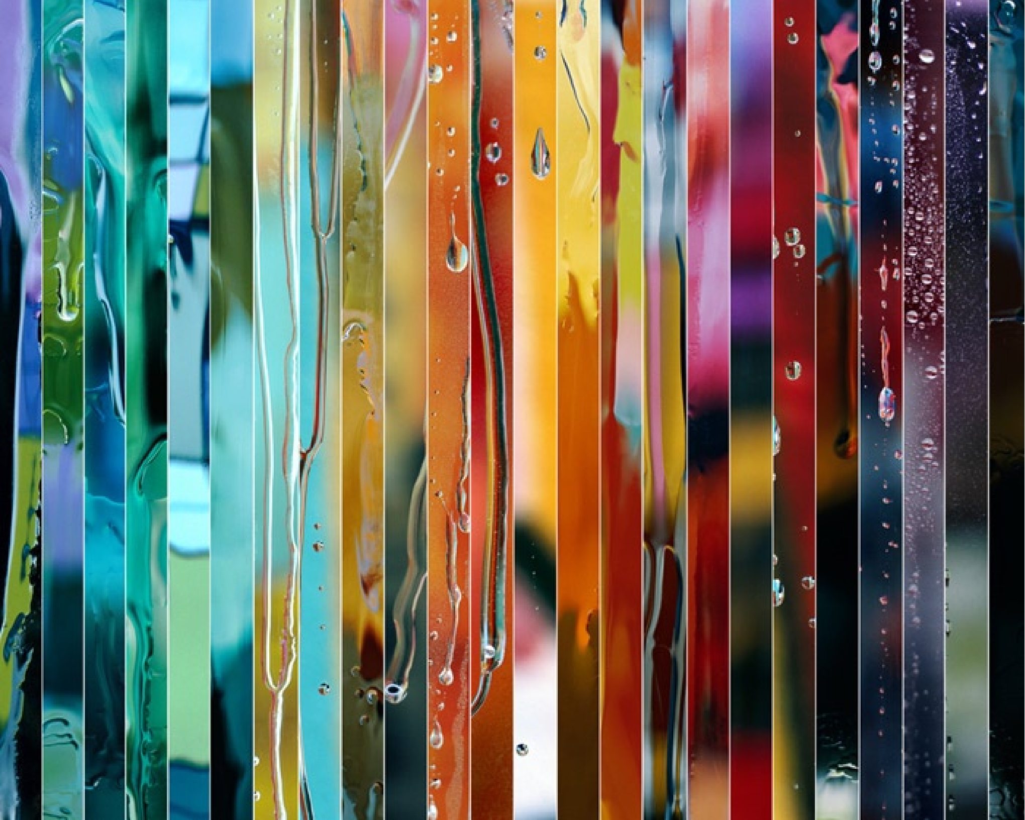
Periodic 1 2012 photo C print 40 x 50 in.