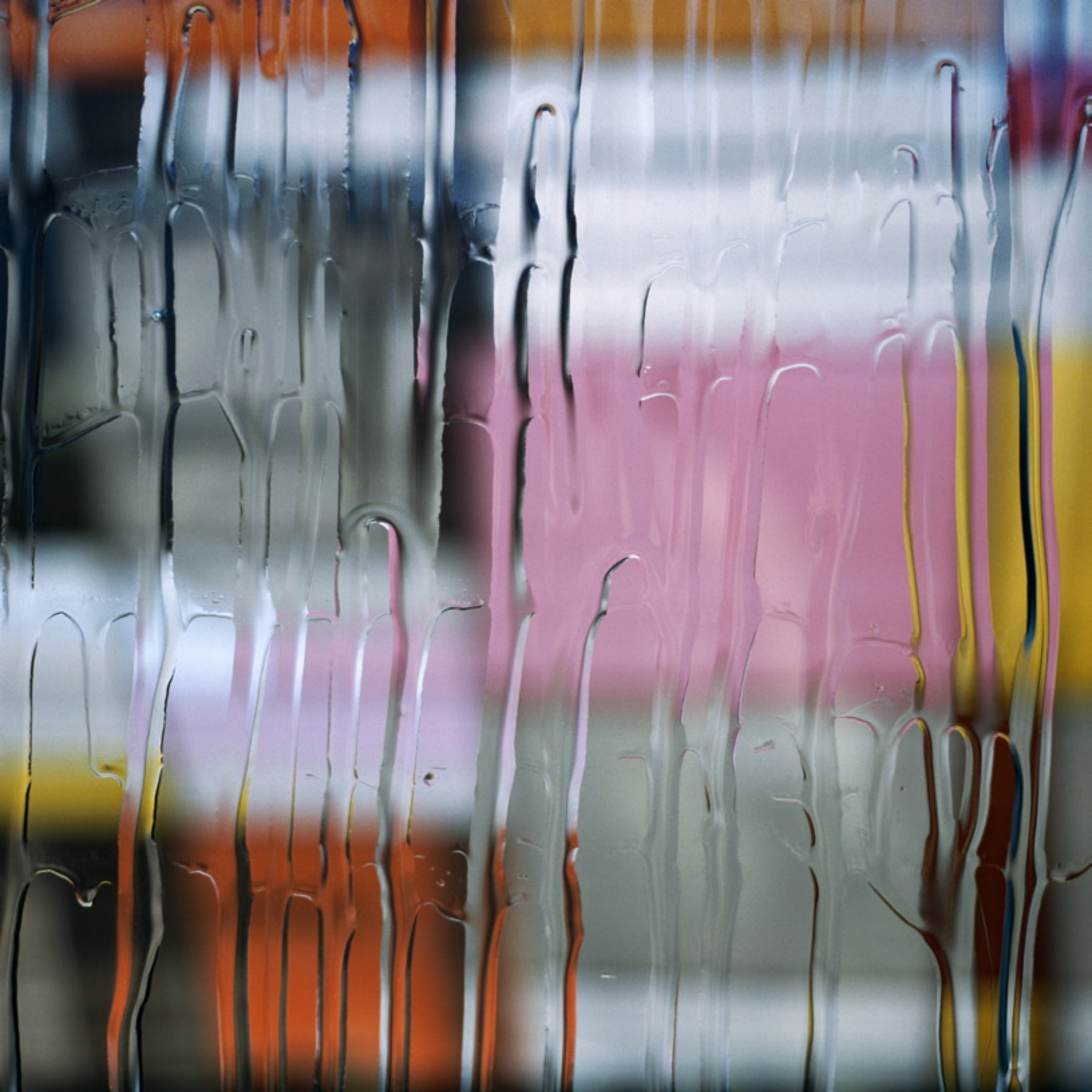
NYC 4 2010 photo C print 30 x 30 in.