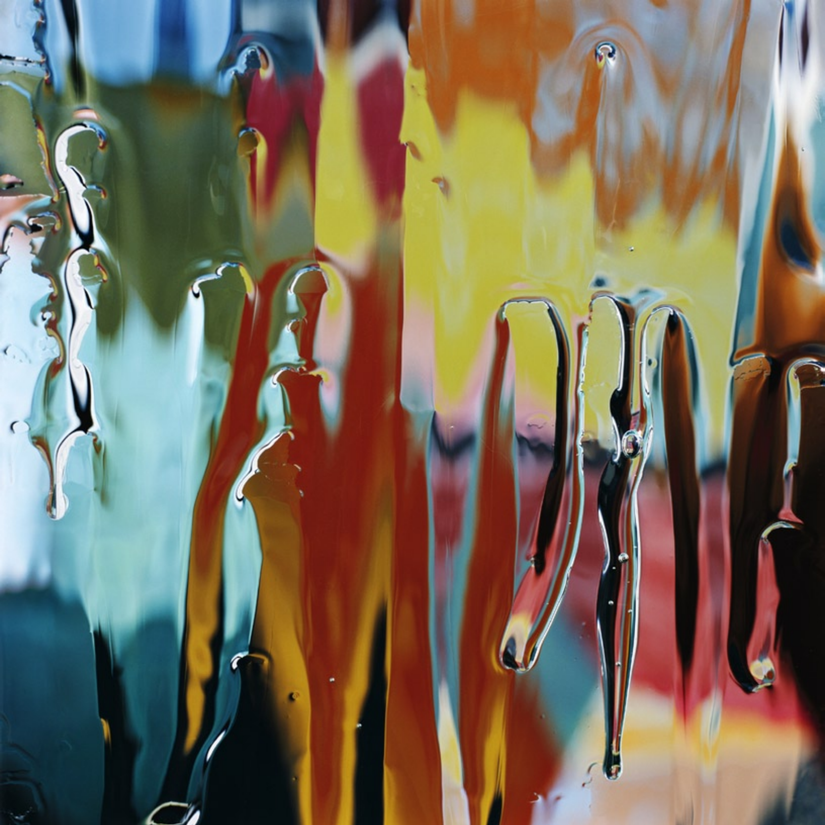
EOM 2 2010 photo C print 30 x 30 in.