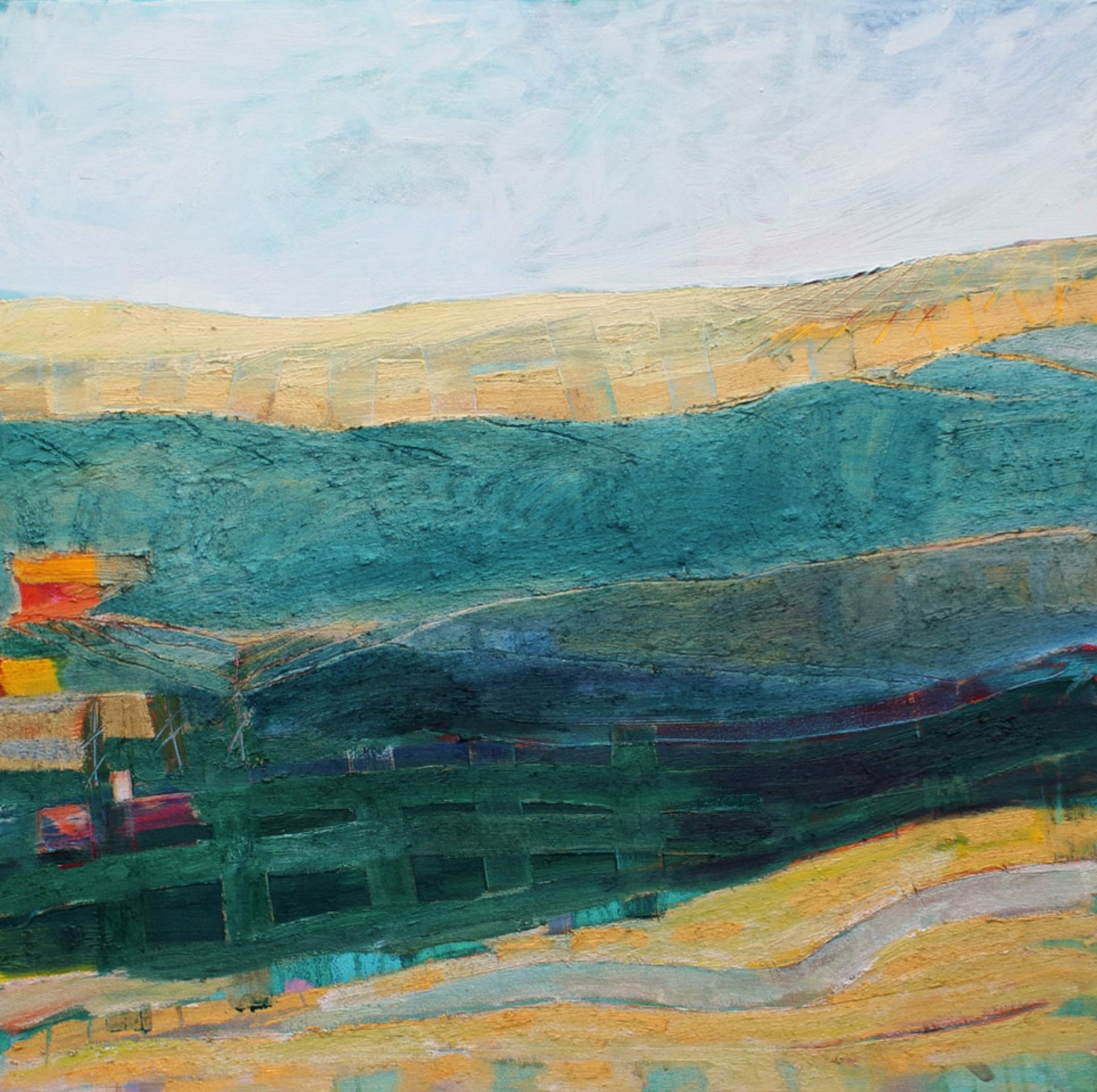
Wandering oil on canvas 30 x 30 inches