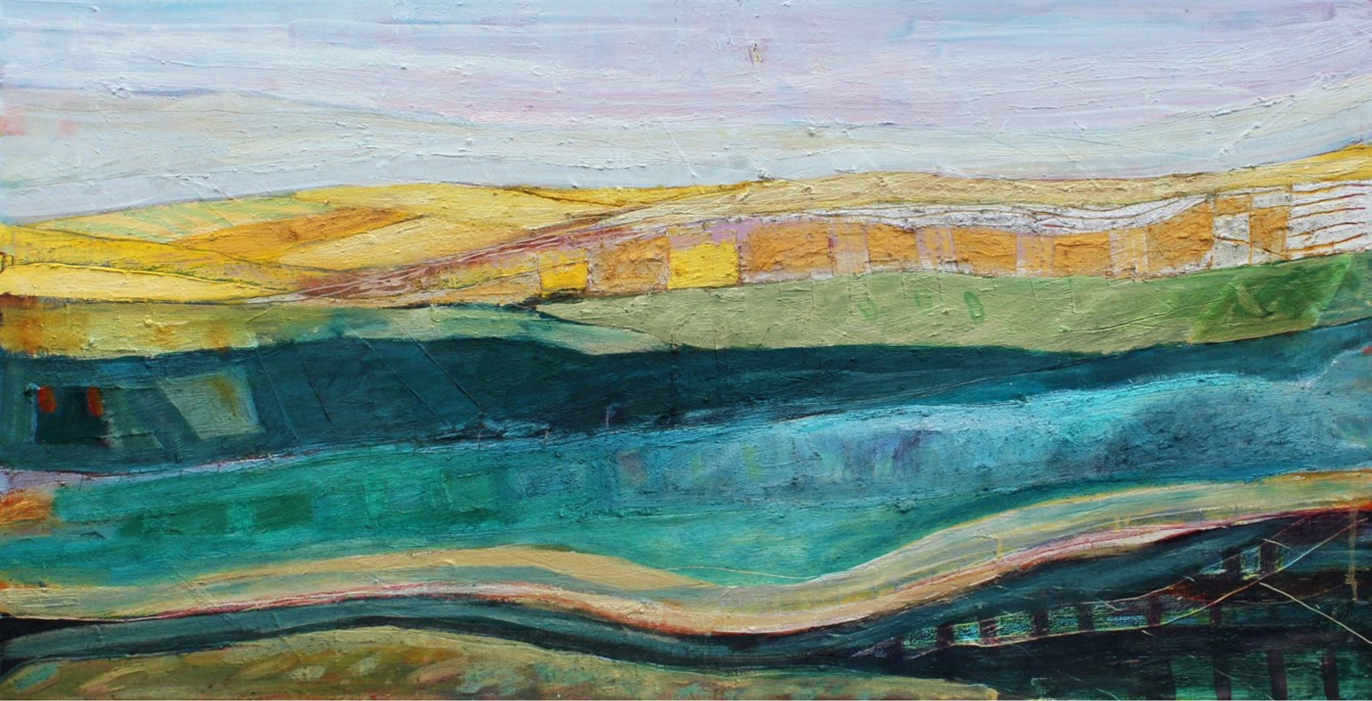
Painted Hills oil on canvas 24 x 48 inches