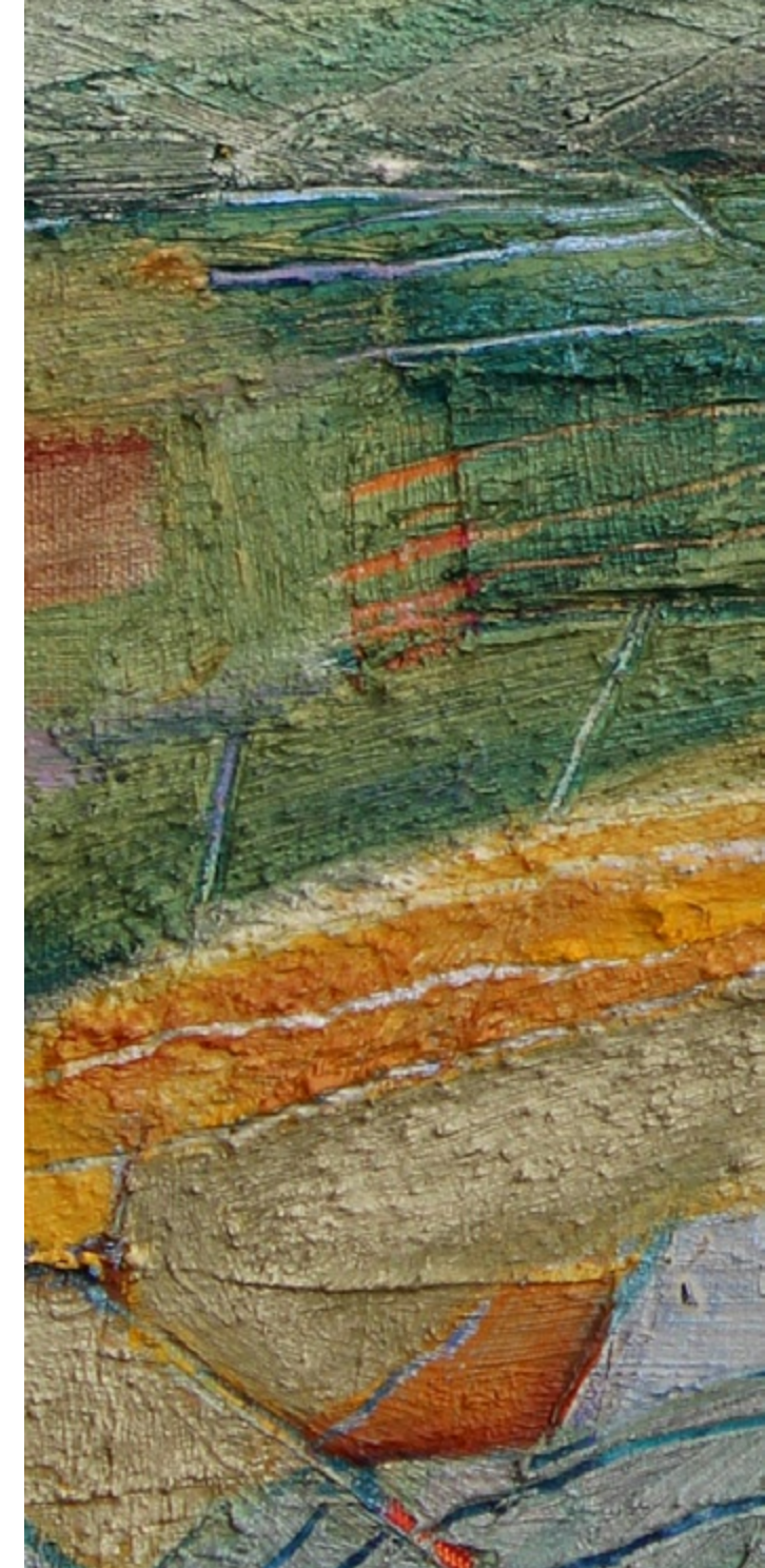
Detail of Yakama