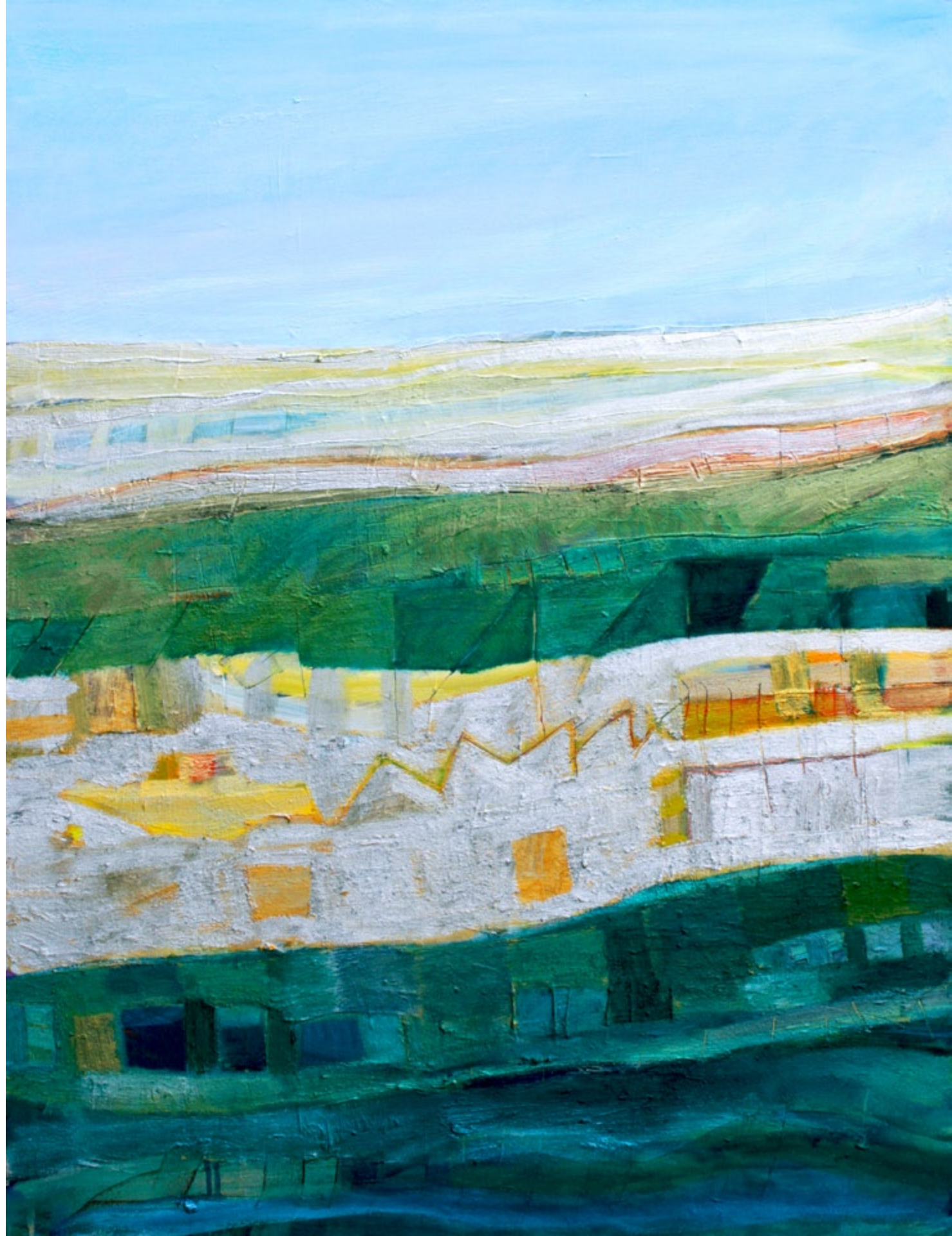
Glacial Drift oil on canvas 40 x 30 inches