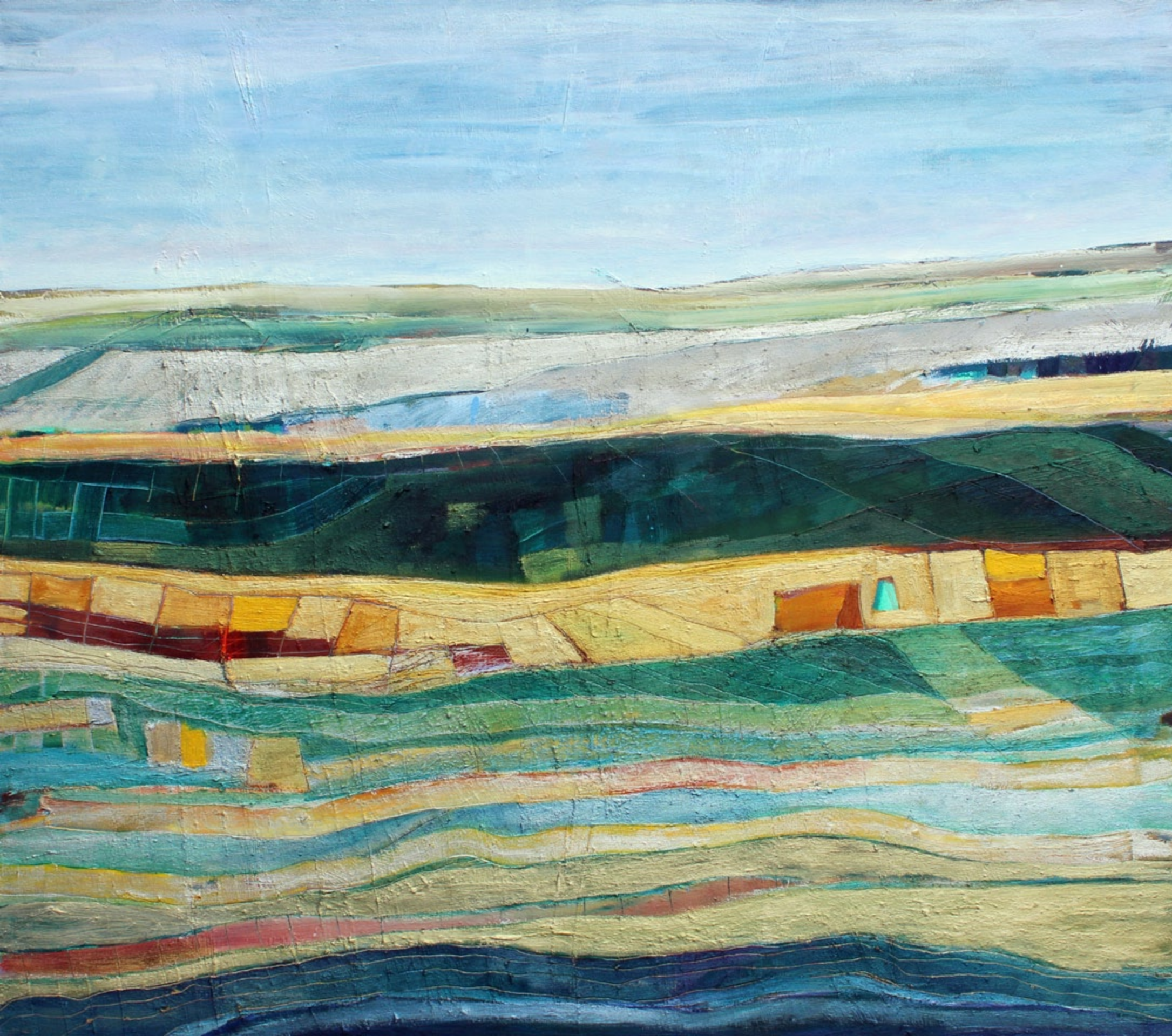
Icefield Parkway oil on canvas 44 x 50 inches