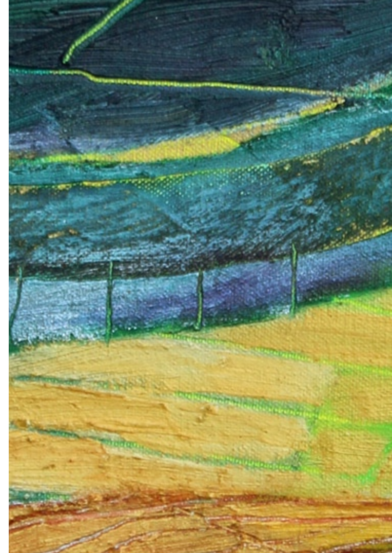
Detail of Convergence