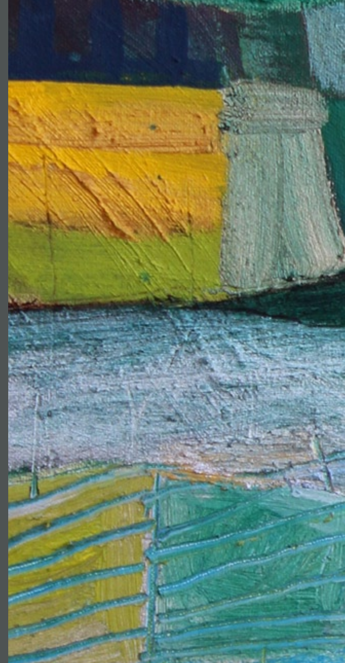
Detail of Swinomish Channel