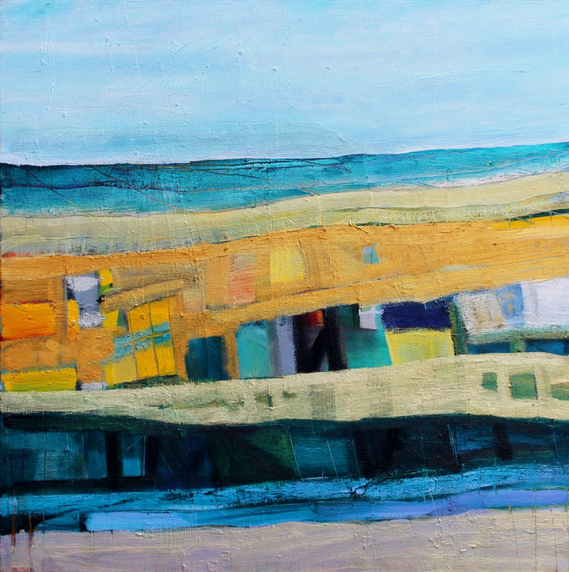
Island Life oil on canvas 30 x 30 inches