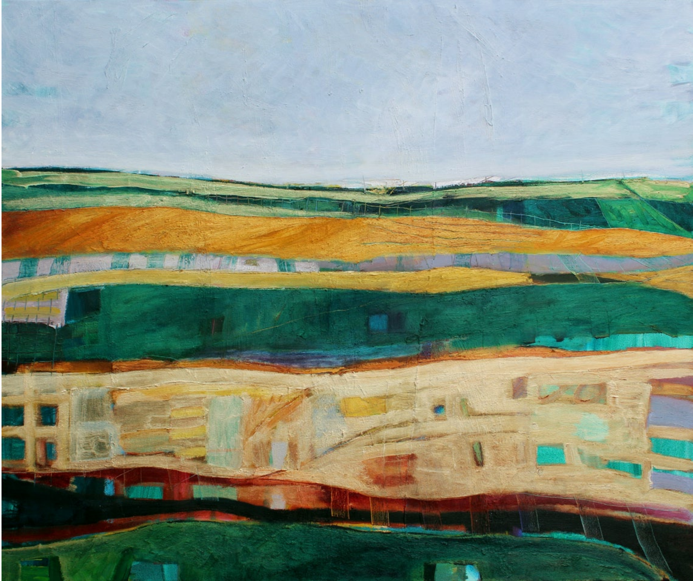
Understory oil on canvas 42 x 50 inches