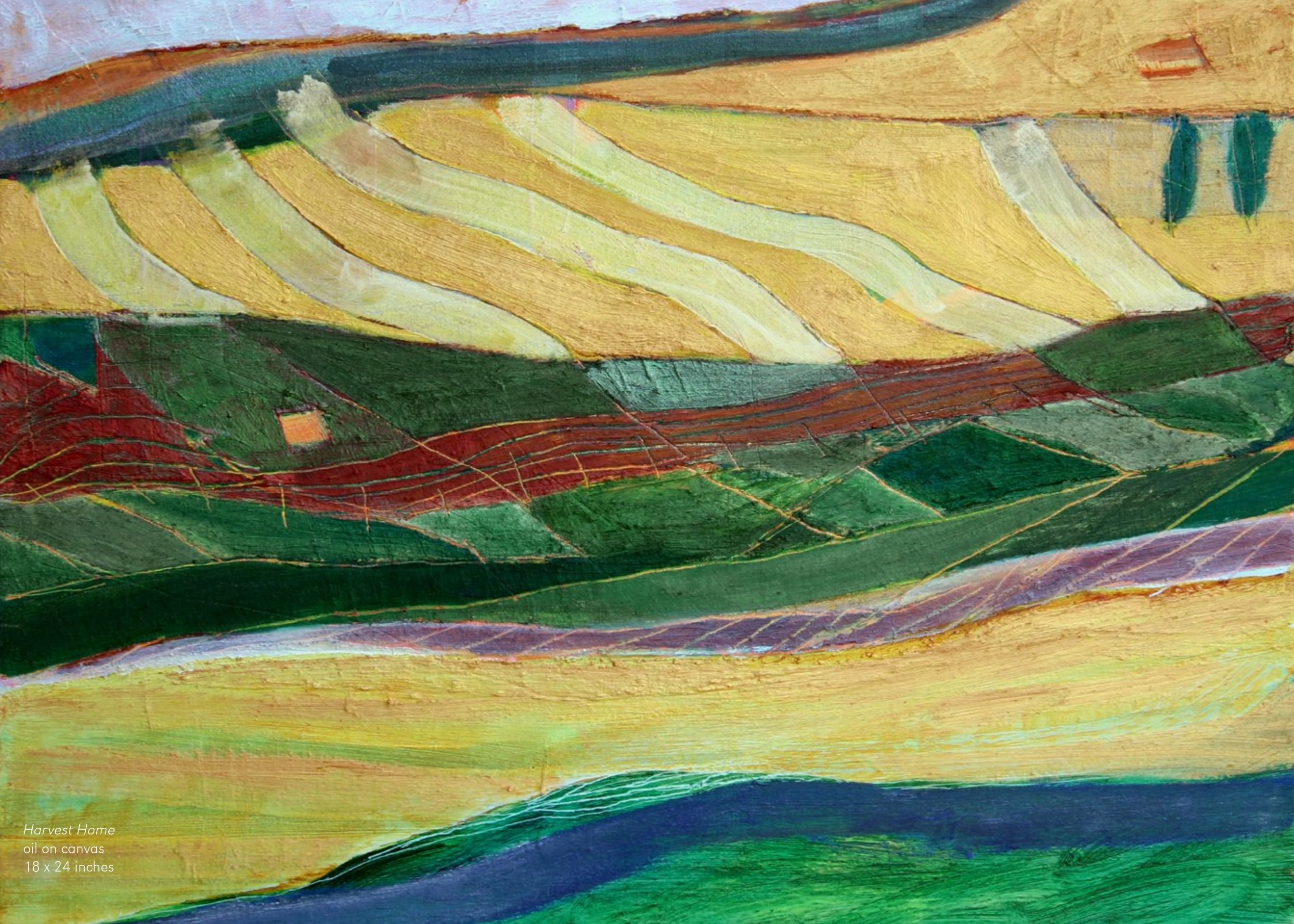
Harvest Home oil on canvas 18 x 24 inches