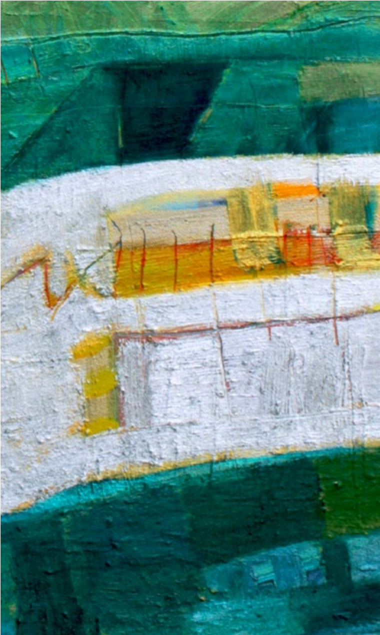
Detail of Glacial Drift