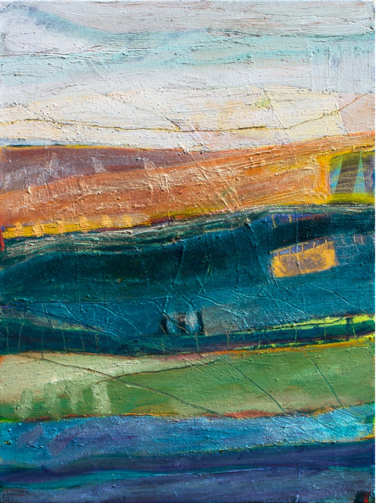
Crater Lake oil on canvas 24 x 18 inches