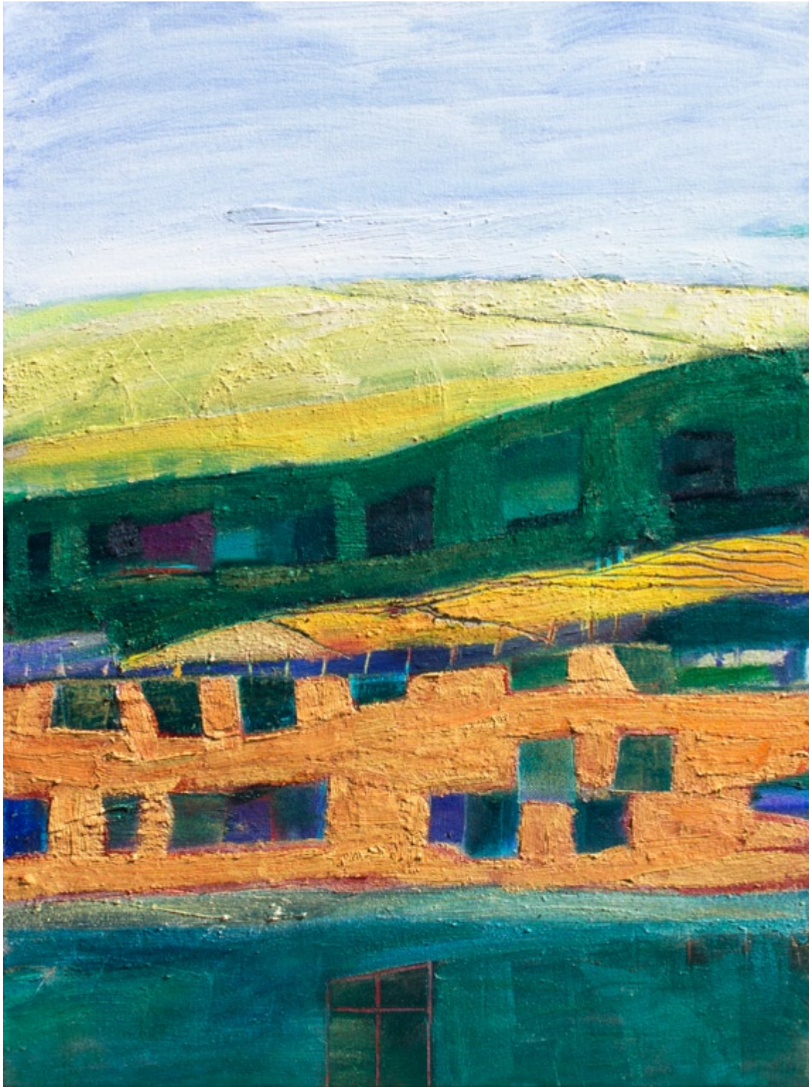
Warm Sands oil on canvas 24 x 18 inches