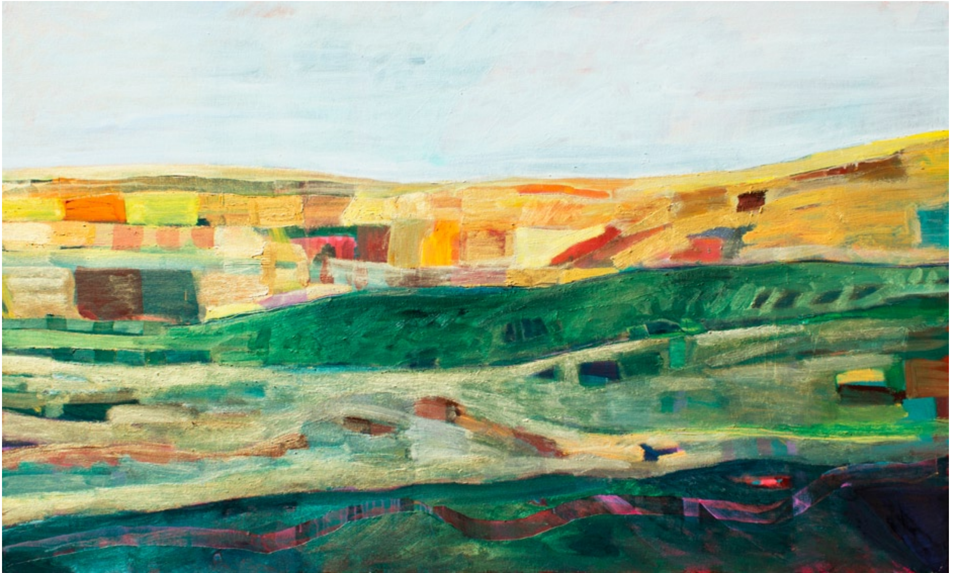
Understory , oil on canvas, 36 x 60 inches