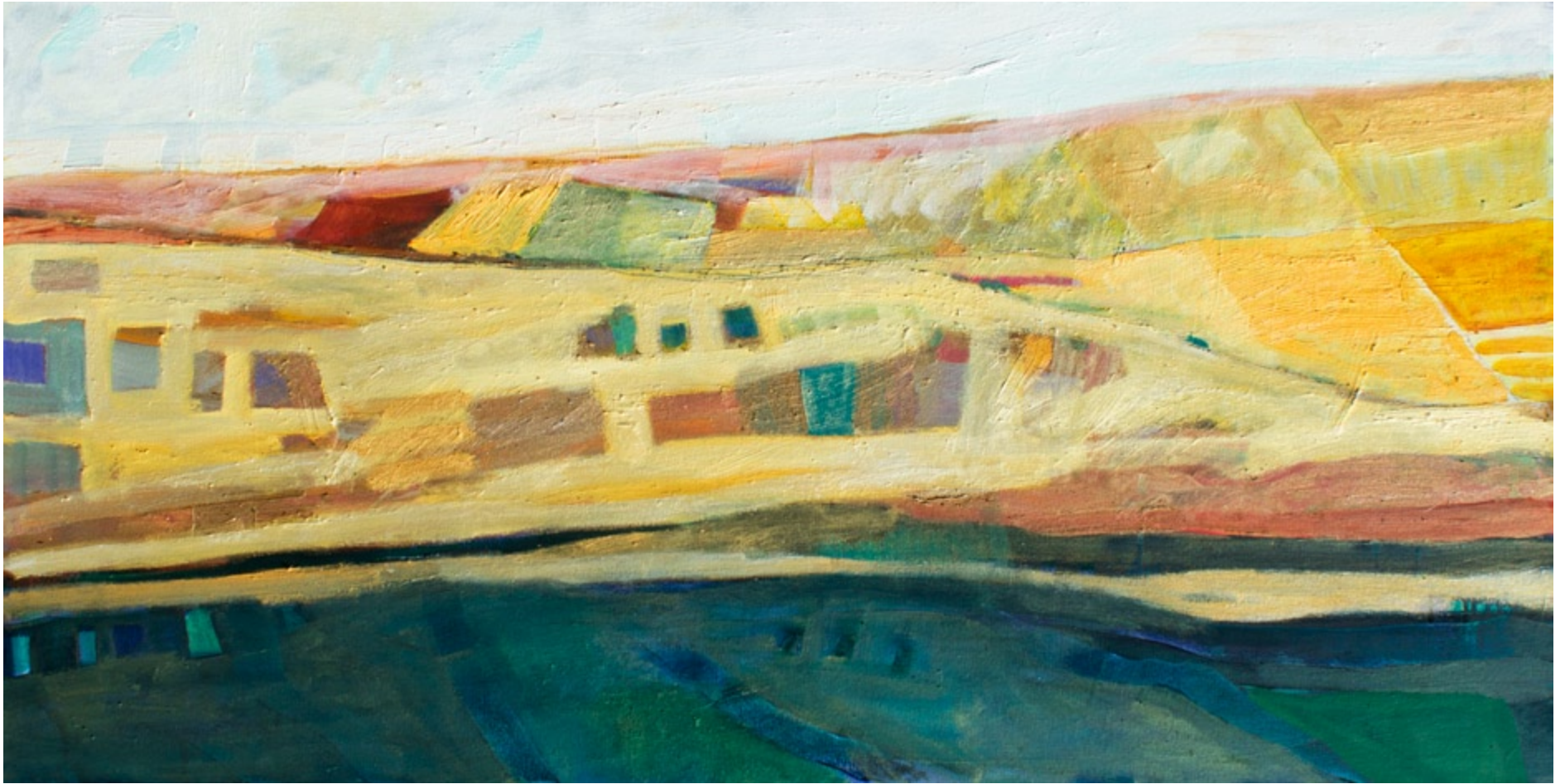
Birdseye Landing , oil on canvas, 24 x 48 inches