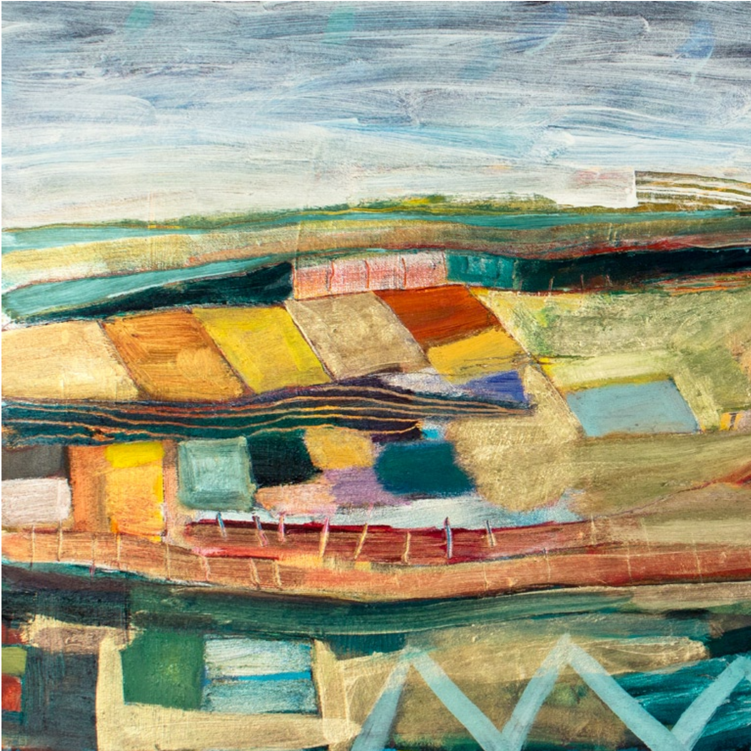
Neighbors (detail) oil on canvas 24 x 48 inches