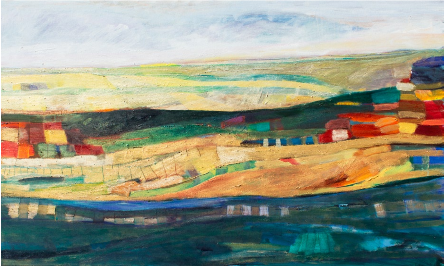
Where I Want To Be , oil on canvas, 36 x 60 inches