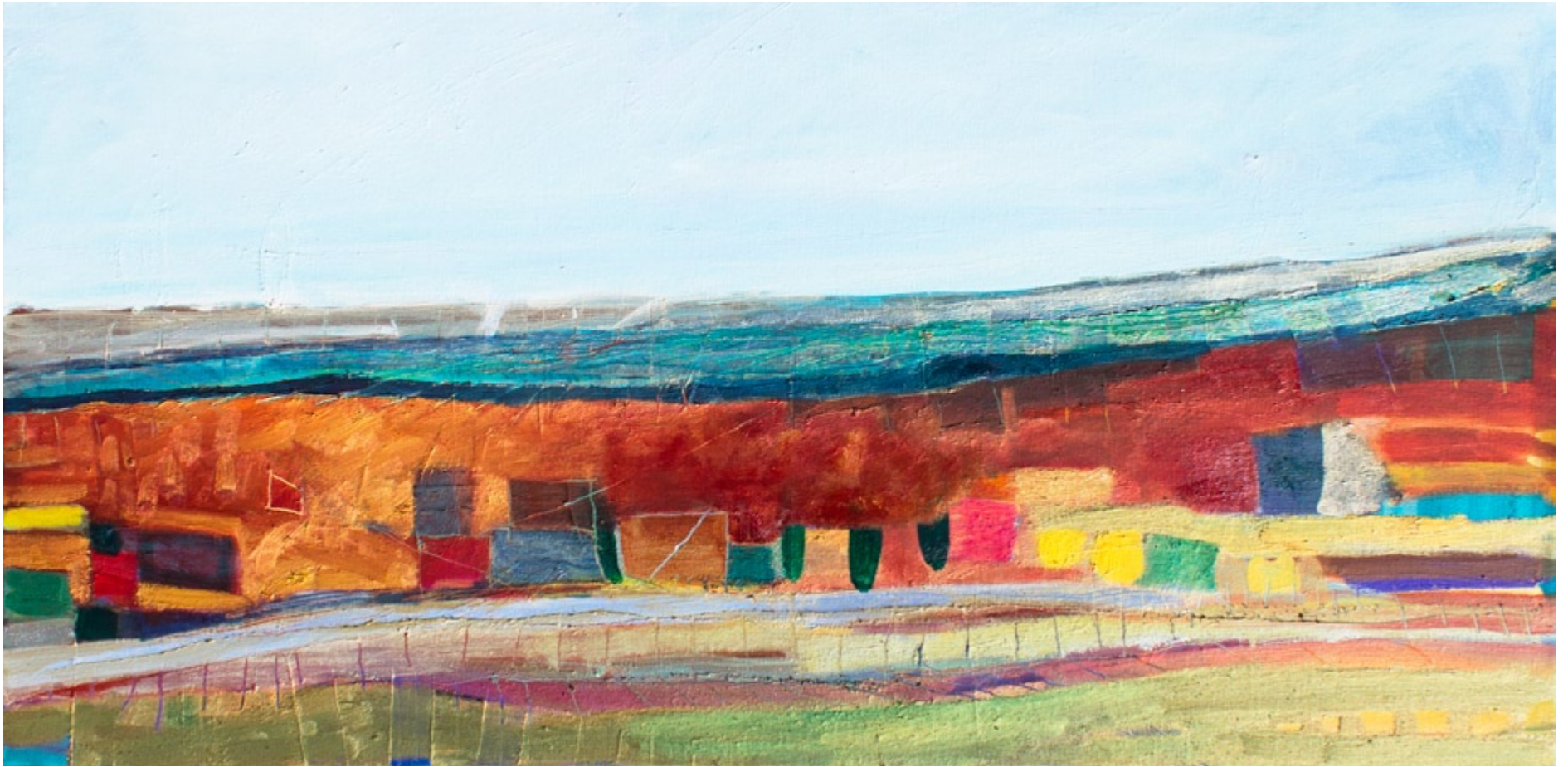
Red Bluff , oil on canvas, 24 x 48 inches