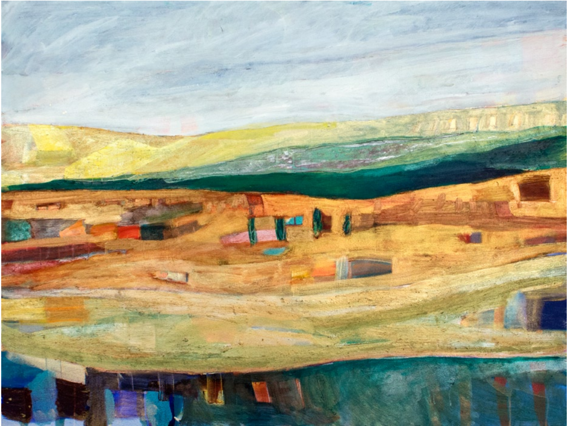
Cover: Red Windows , oil on canvas, 36 x 36 inches This page: Artifacts , oil on canvas, 36 x 48 inches