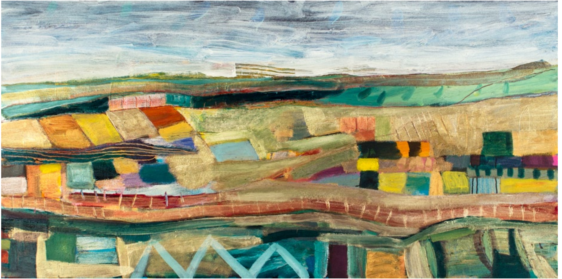
Neighbors , oil on canvas, 24 x 48 inches