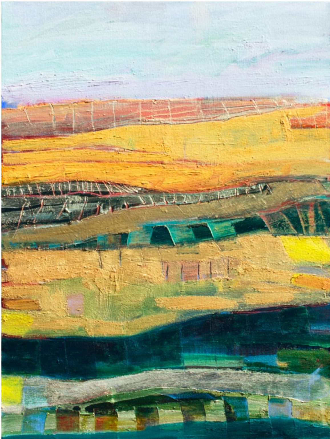
What Comes Through oil on canvas 24 x 18 inches