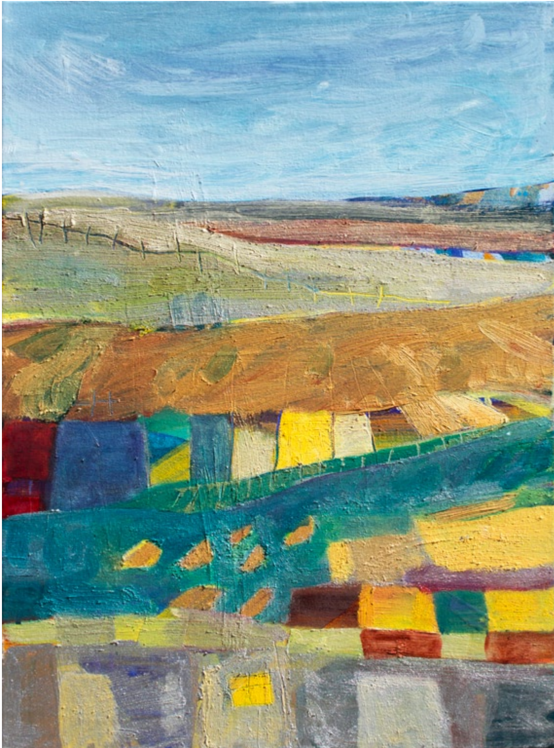
Lowlands oil on canvas 24 x 18 inches