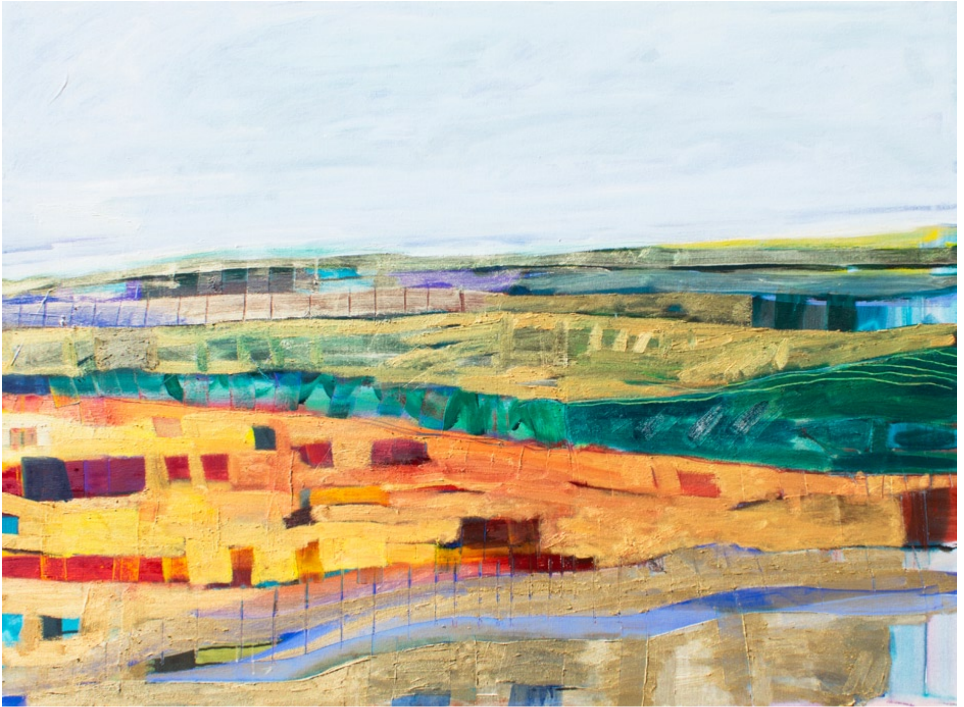
Layered Lands , oil on canvas, 36 x 48 inches