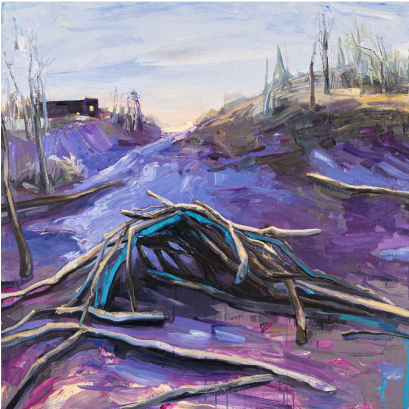
Previous page: It was Written in the Sky , mixed media on canvas, 48 x 40 inches Above: Stardust State , mixed media on canvas, 48 x 48 inches