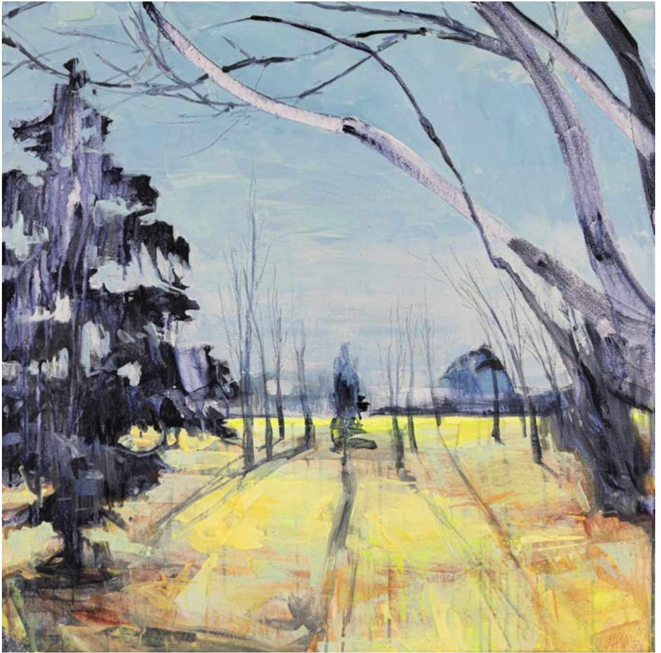
Previous page: Forgotten the Stillness , mixed media on canvas, 48 x 36 inches Above: Breathing Space , mixed media on canvas, 36 x 36 inches