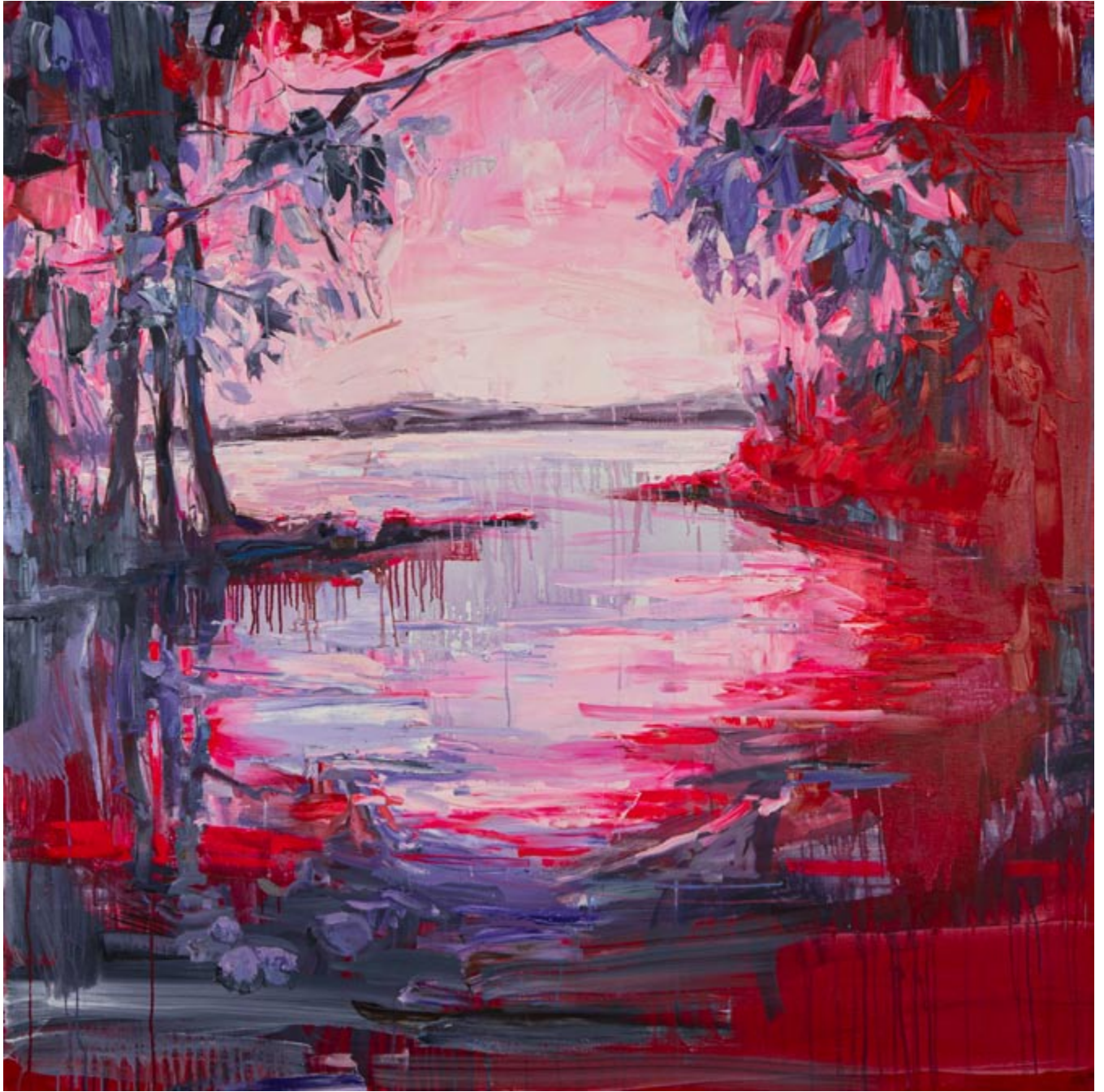
A Linear History , mixed media on canvas, 60 x 60 inches