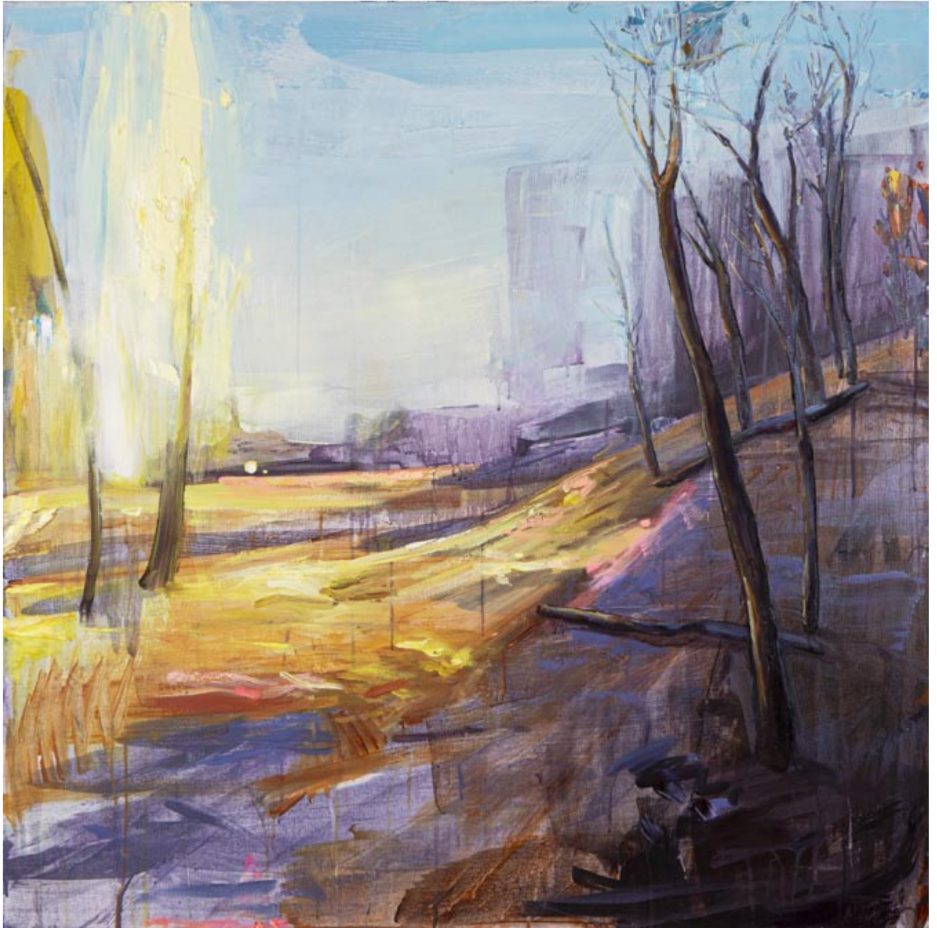
Momentary Legacy , mixed media on canvas, 40 x 40 inches