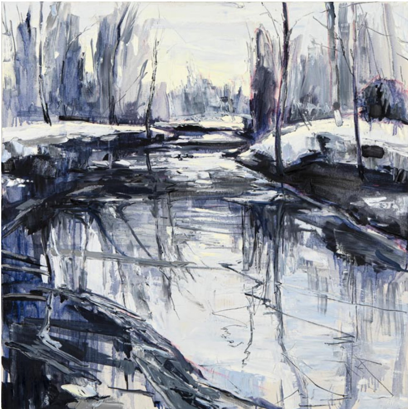
In Your Time , mixed media on canvas, 40 x 40 inches