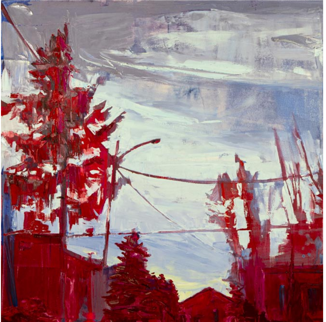
The Grace of Your Eyes , mixed media on canvas, 40 x 40 inches