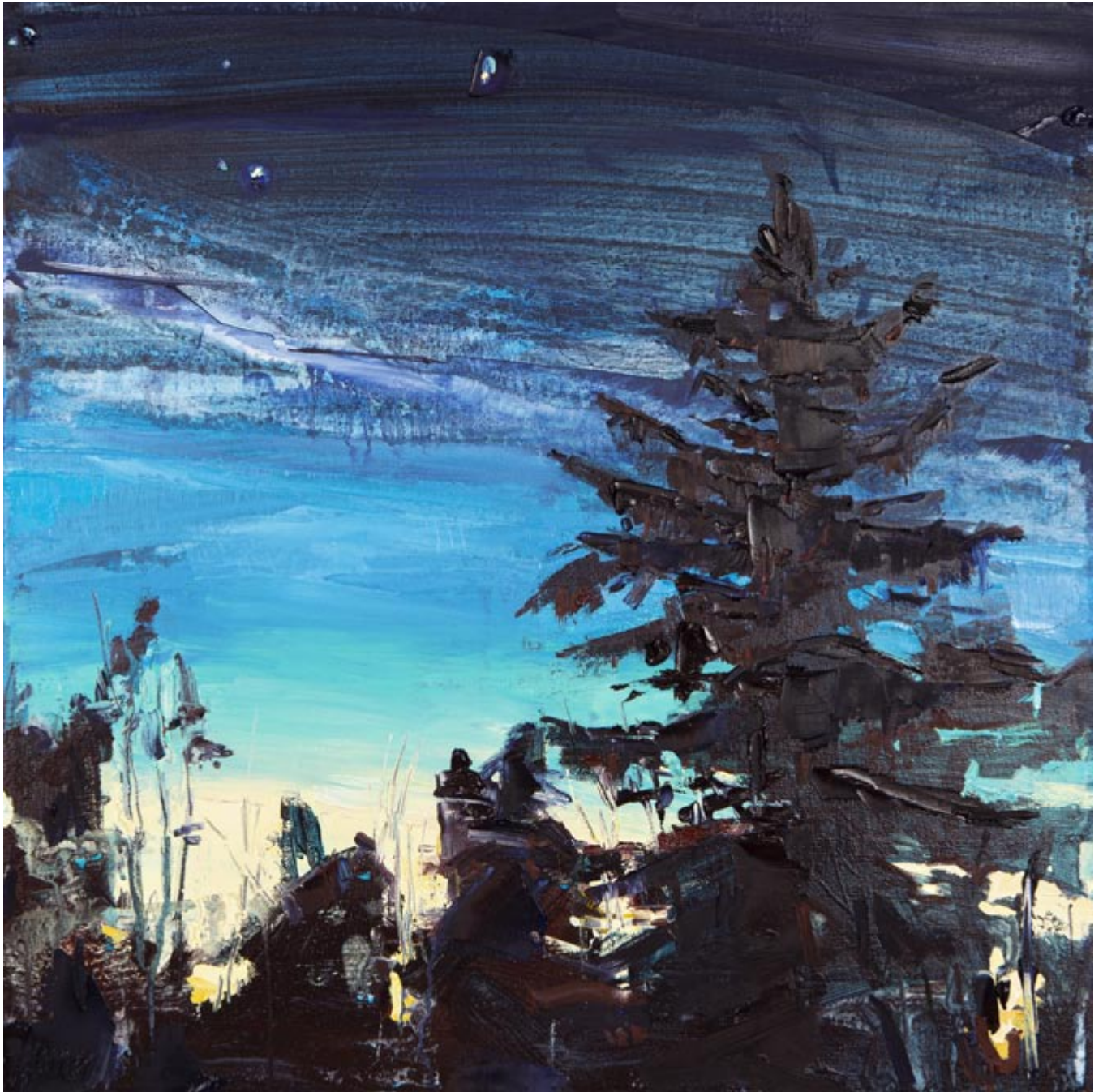
Orchestra , mixed media on canvas, 24 x 24 inches