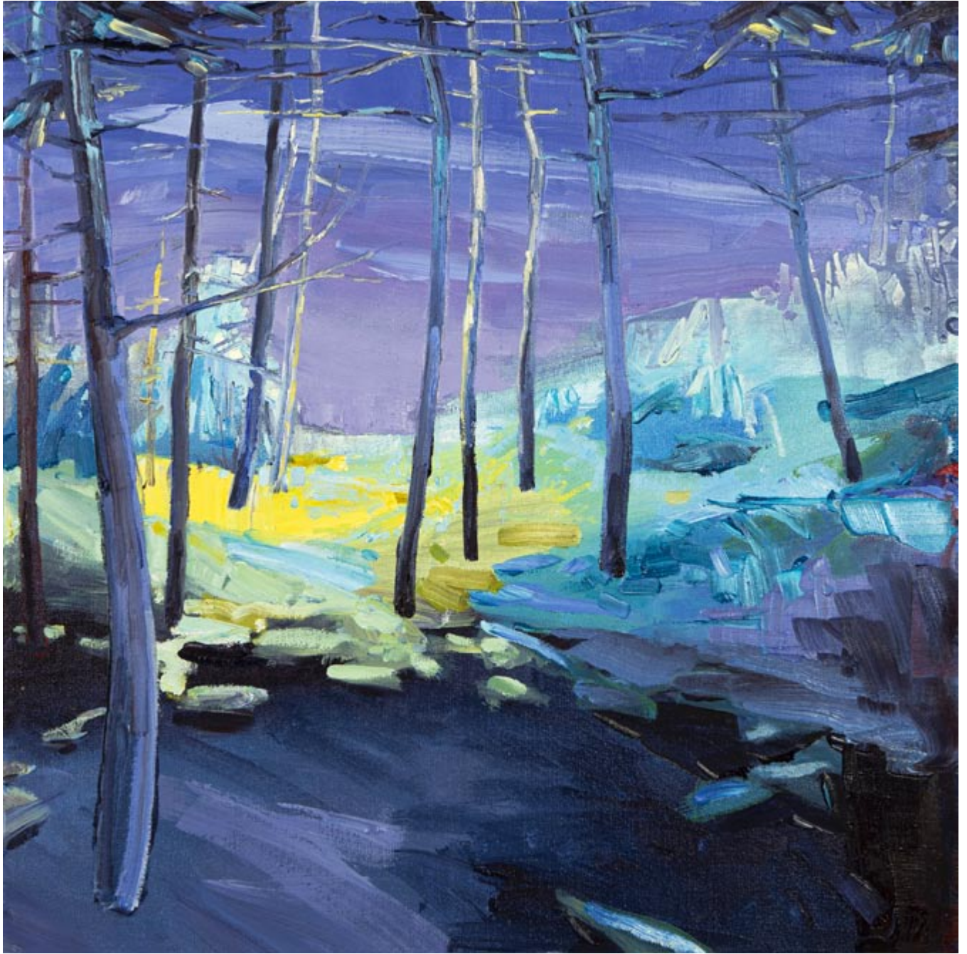
Stage for Flight , mixed media on canvas, 24 x 24 inches