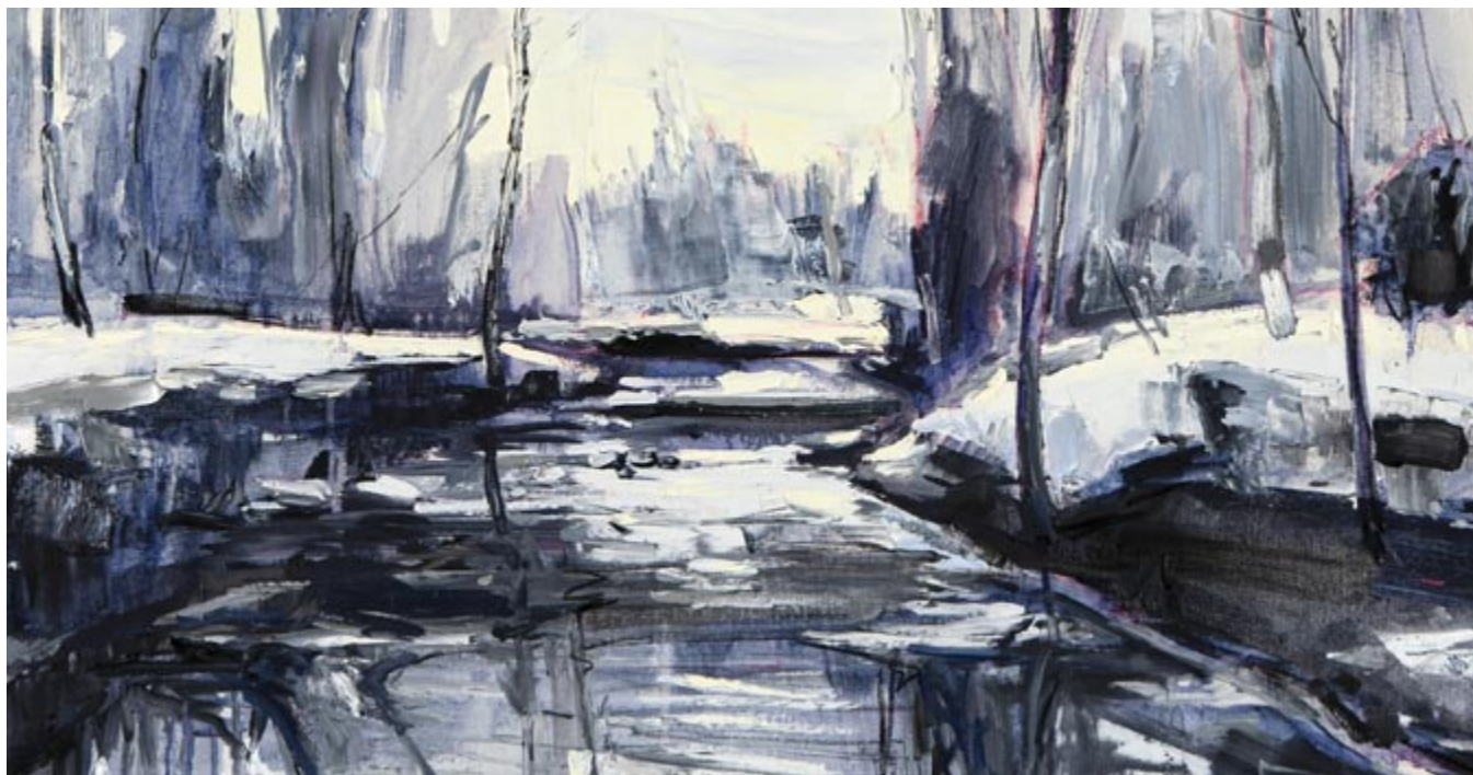
In Your Time (detail), mixed media on canvas, 40 x 40 inches

The paintings are almost all based on the environment in my small radius around my home, a result of Covid. That experience is another aspect of us taking a step back from how we have been living. In my little radius we have seen a remarkable resurgence of animals coming out from their typical protected spaces. I feel more as though we are part of the environment in a general way now, rather than this separation between nature and city.