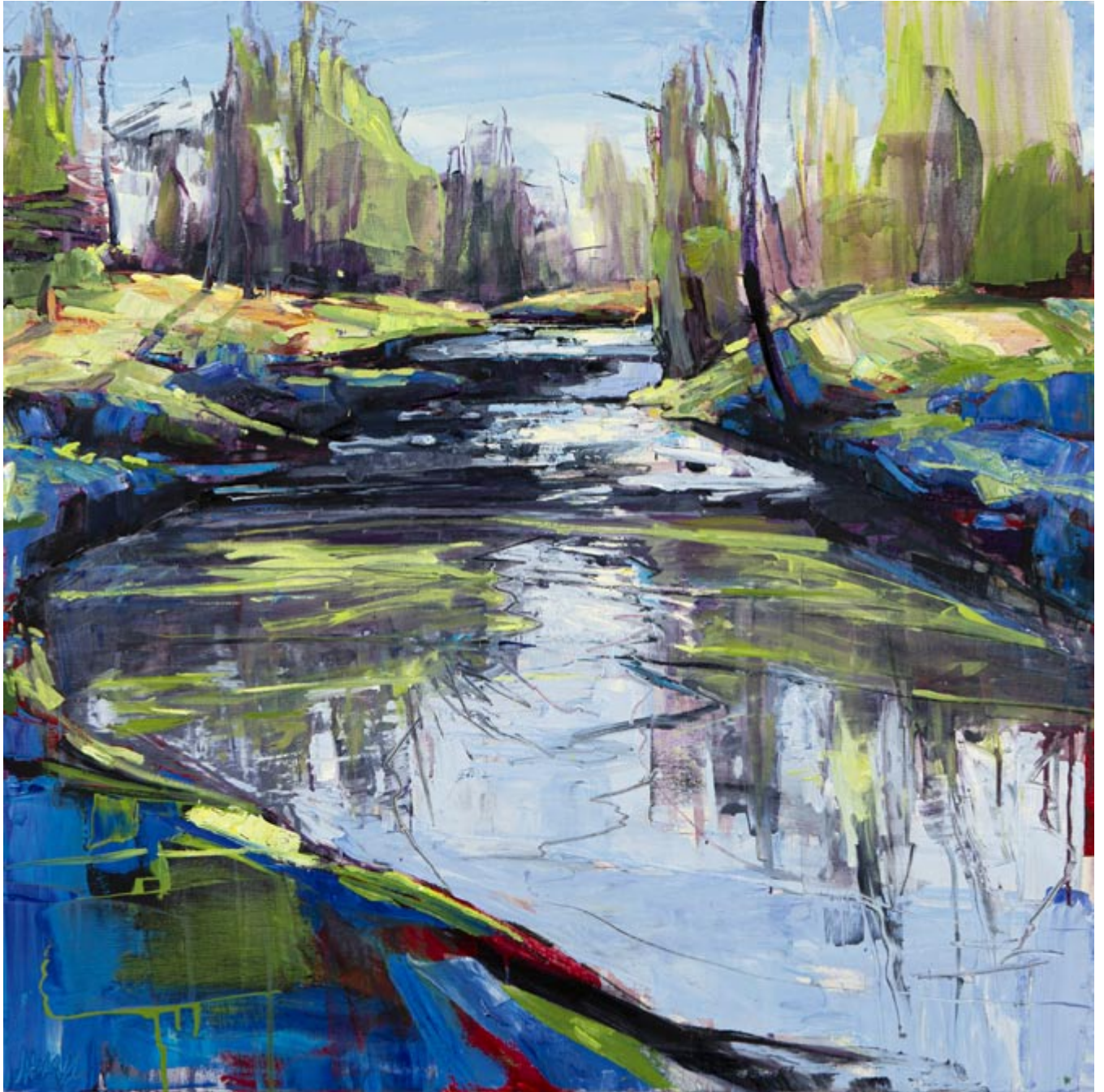
Cover image: Intrepid Visitation , mixed media on canvas, 36 x 36 inches Above: The Wild Open , mixed media on canvvas, 36 x 36 inches