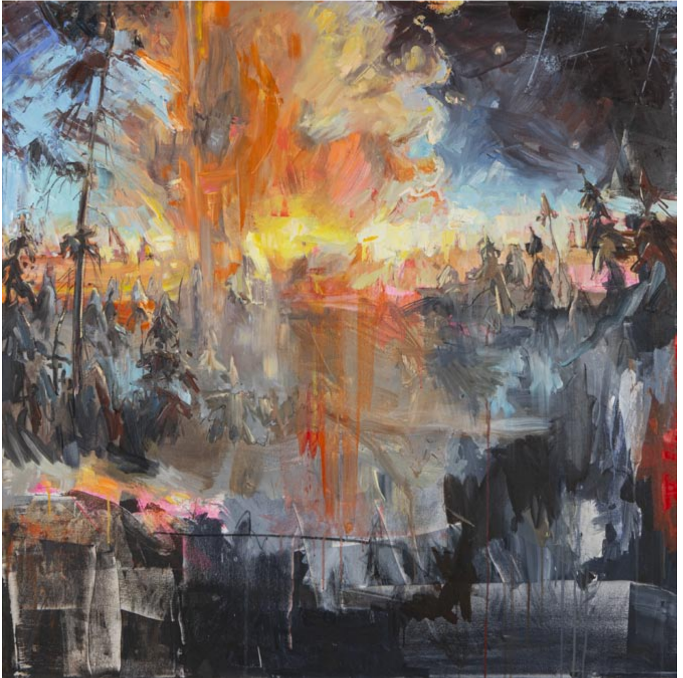
Her Grace , mixed media on canvas, 48 x 48 inches