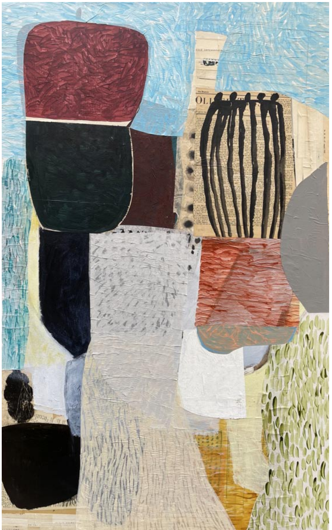
Adrift, collage and paint on canvas, 48 x 30 inches