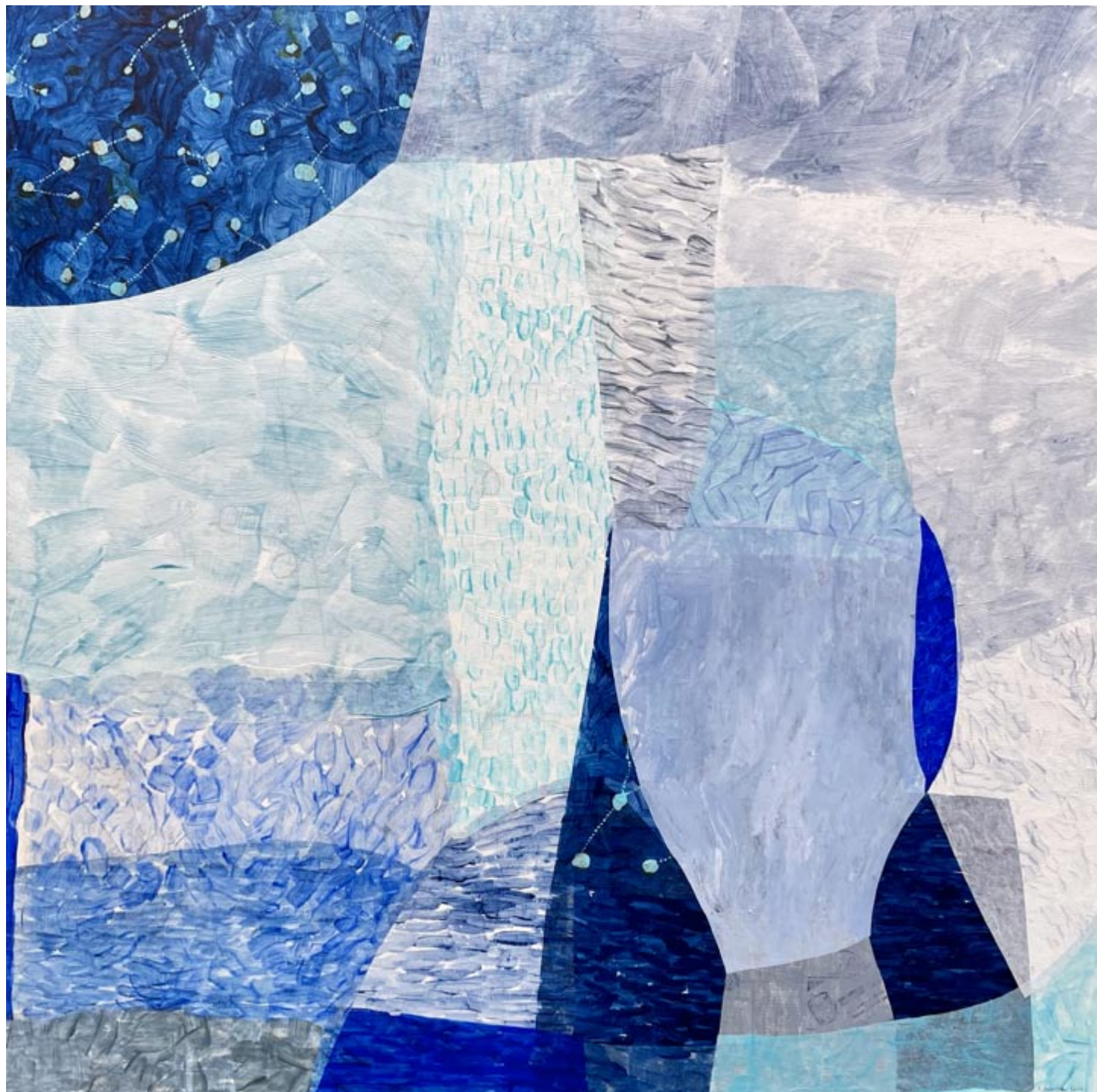
Far North , collage and paint on canvas, 48 x 48 inches