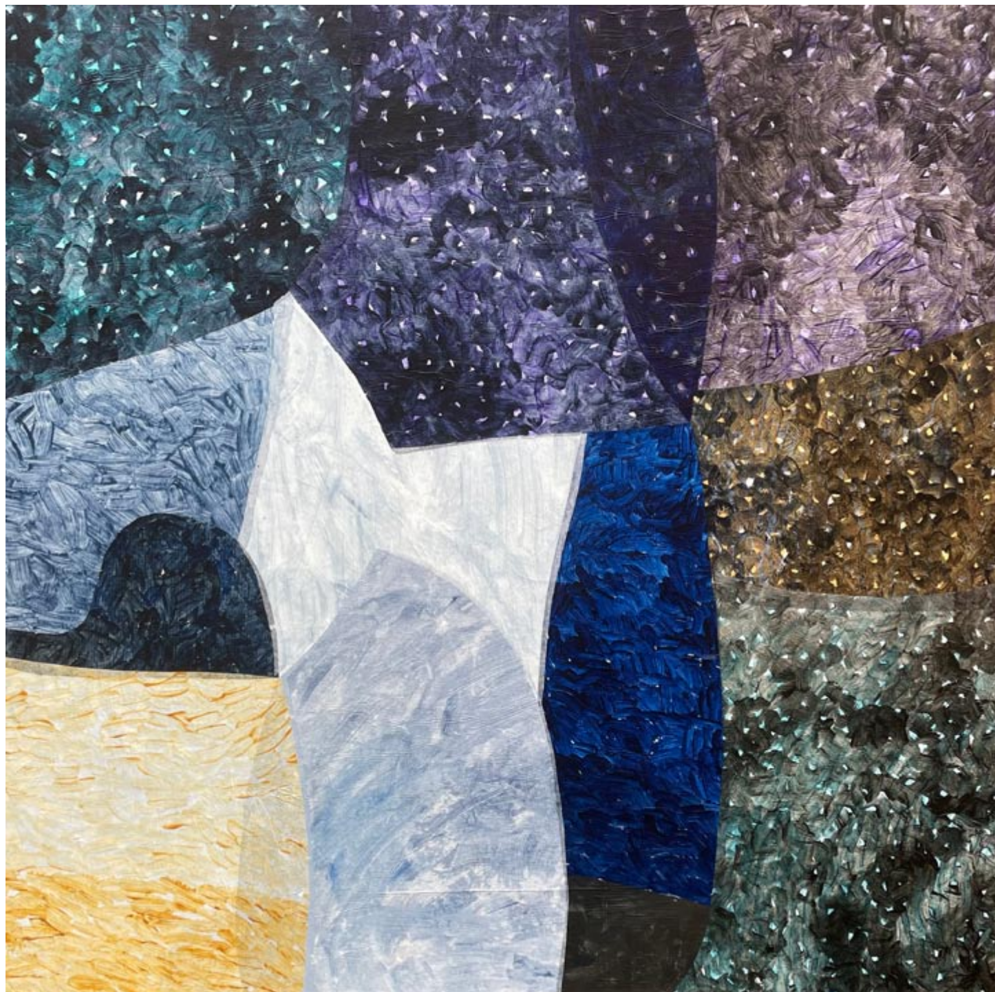
Dusk , collage and paint on canvas, 48 x 48 inches

Cover image: Dawn , collage and paint on canvas, 48 x 48 inches