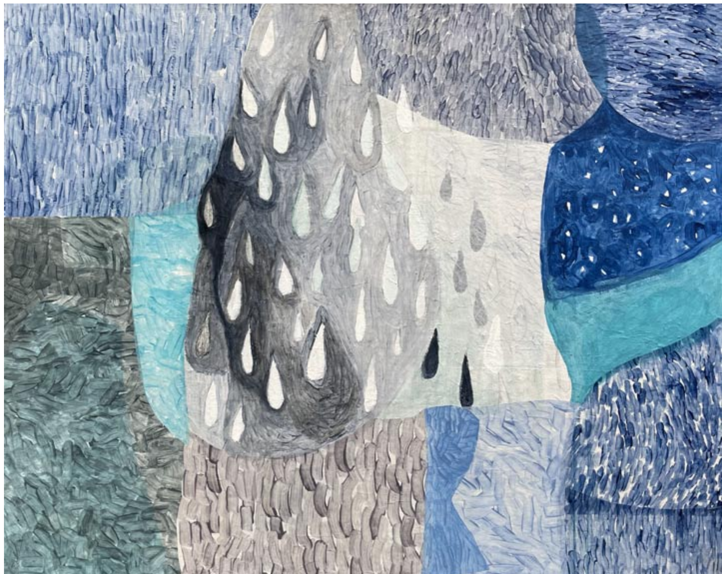
Previous page: Catching the Rain , collage and paint on canvas, 48 x 60 inches