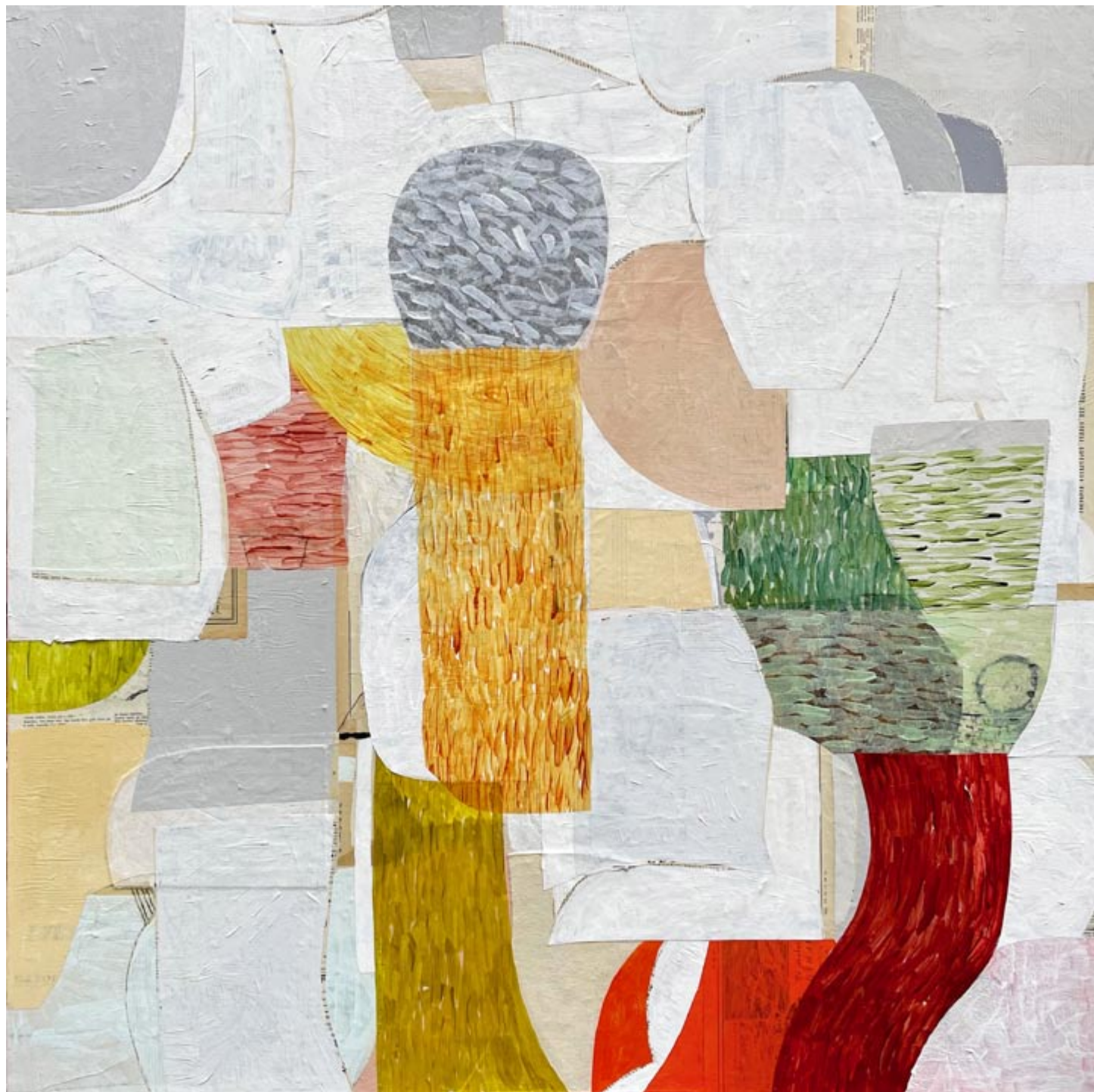
Winter River , collage and paint on canvas, 48 x 48 inches Previous page: Awaits , collage and paint on canvas, 30 x 24 inches