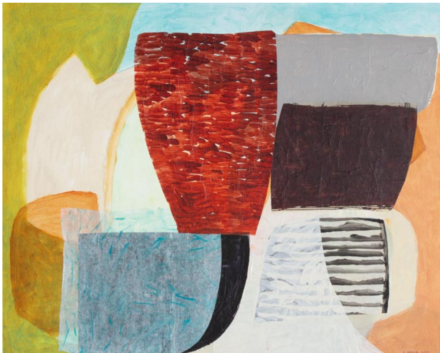
Float , collage and paint on canvas, 24 x 30 inches