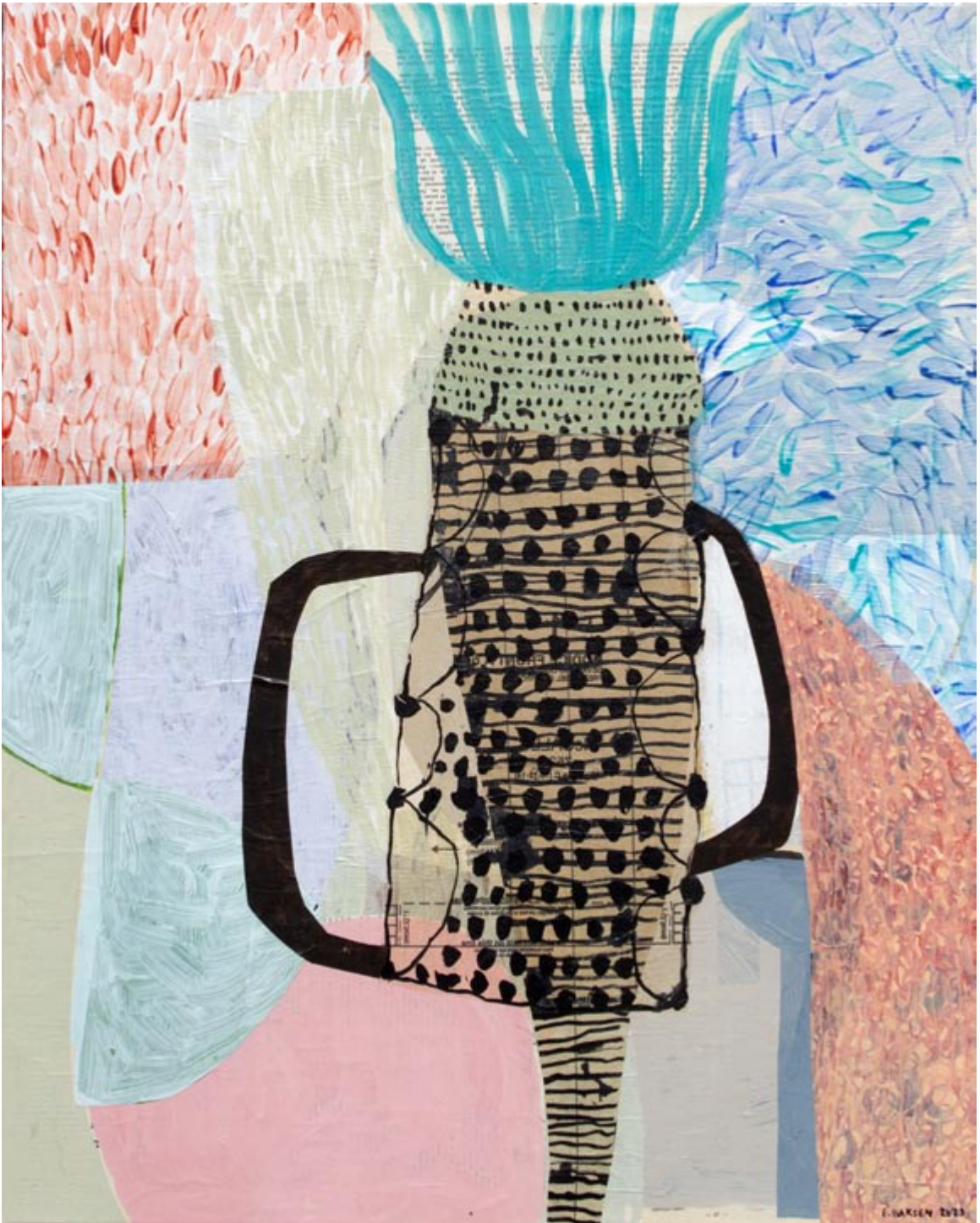
In Garden , collage and paint on canvas, 34 x 20 inches Previous page: The View , collage and paint on canvas, 48 x 36 inches