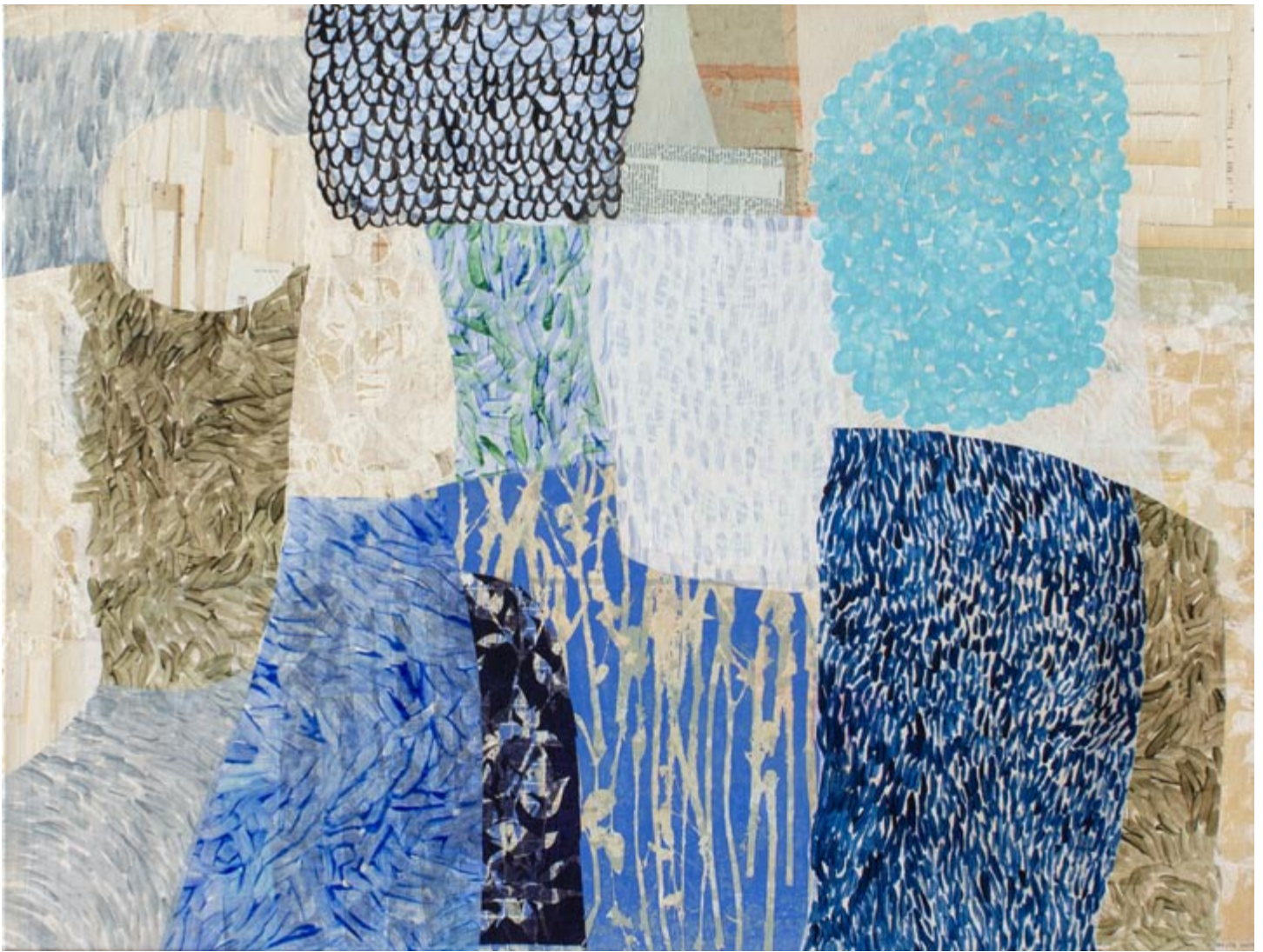
EVA ISAKSEN Far North

The title for this show refers to inspiration based on the Arctic landscape. Every year I spend time in my hometown north of the Arctic Circle in Norway, often during the winter months when the days are very short. The winter light is clear and unique, peaceful, beautiful. At night sometimes the northern lights are present. Space, colors, and shapes are based on memories from the north, but what I am always seeking are ways of abstracting my work no matter where the ideas and inspirations have their roots.