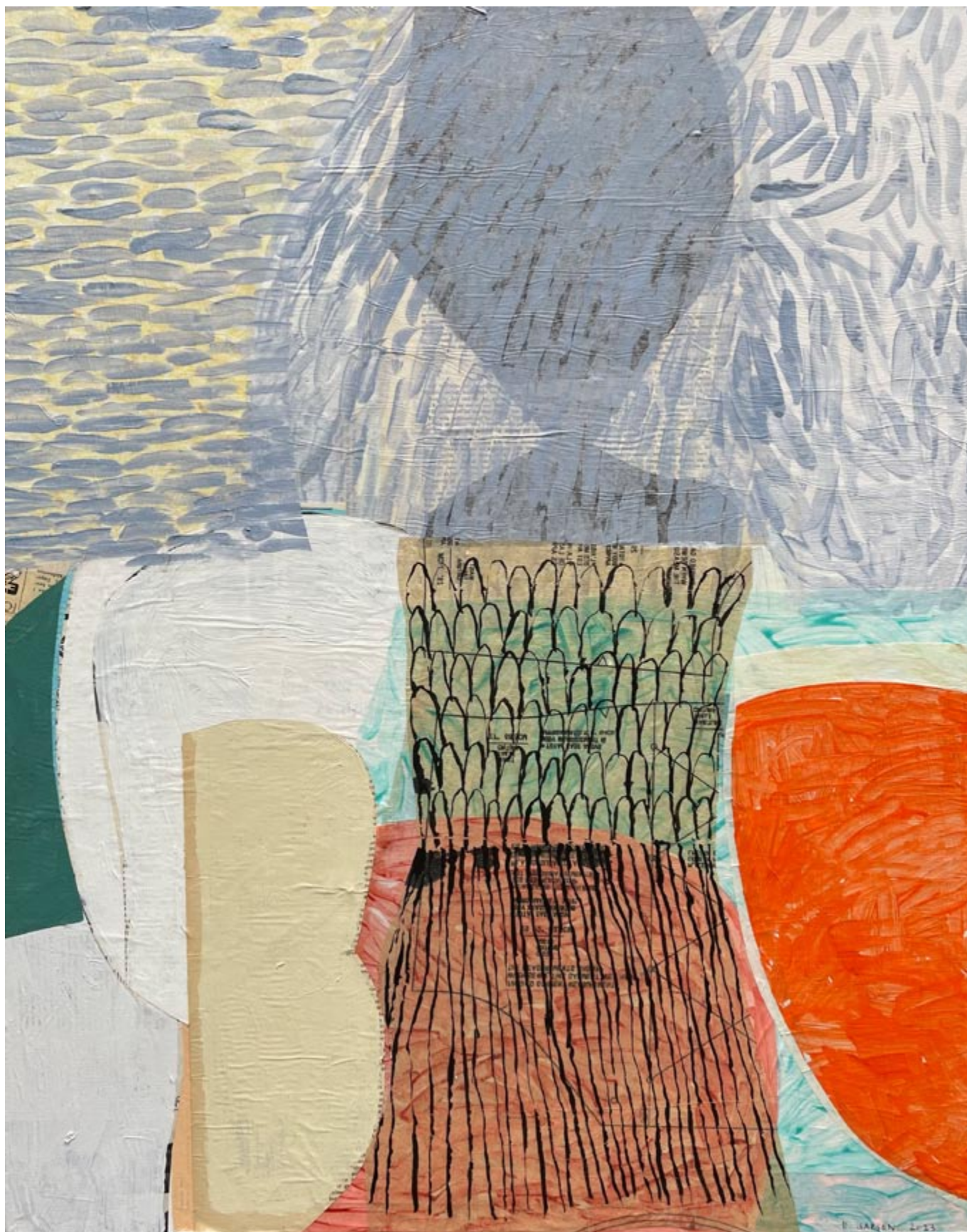
Veil , collage and paint on canvas, 30 x 24 inches

Previous page: Poise , collage and paint on canvas, 30 x 24 inches