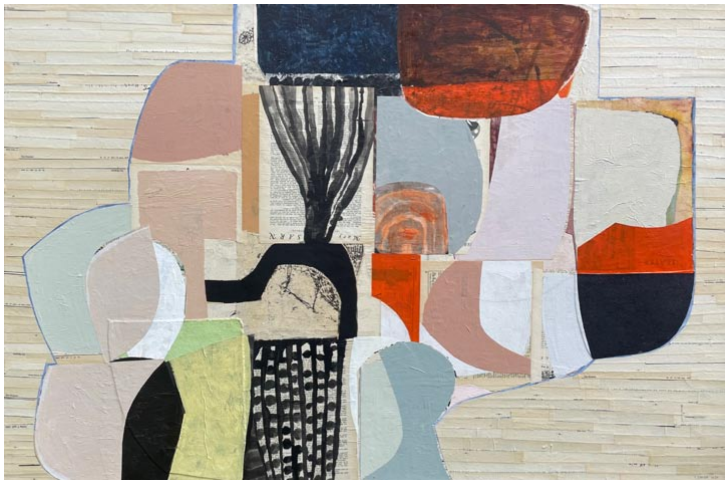
All That Remains , collage and paint on canvas, 40 x 60 inches Next page: Flame , collage and paint on canvas, 40 x 30 inches