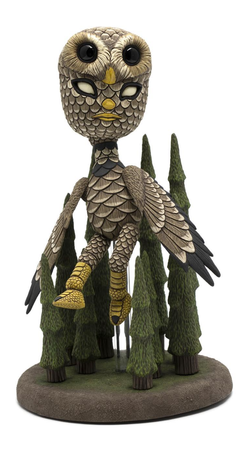
Out Of The Woods ceramic with glaze 11 x 6 x 6 inches $2200