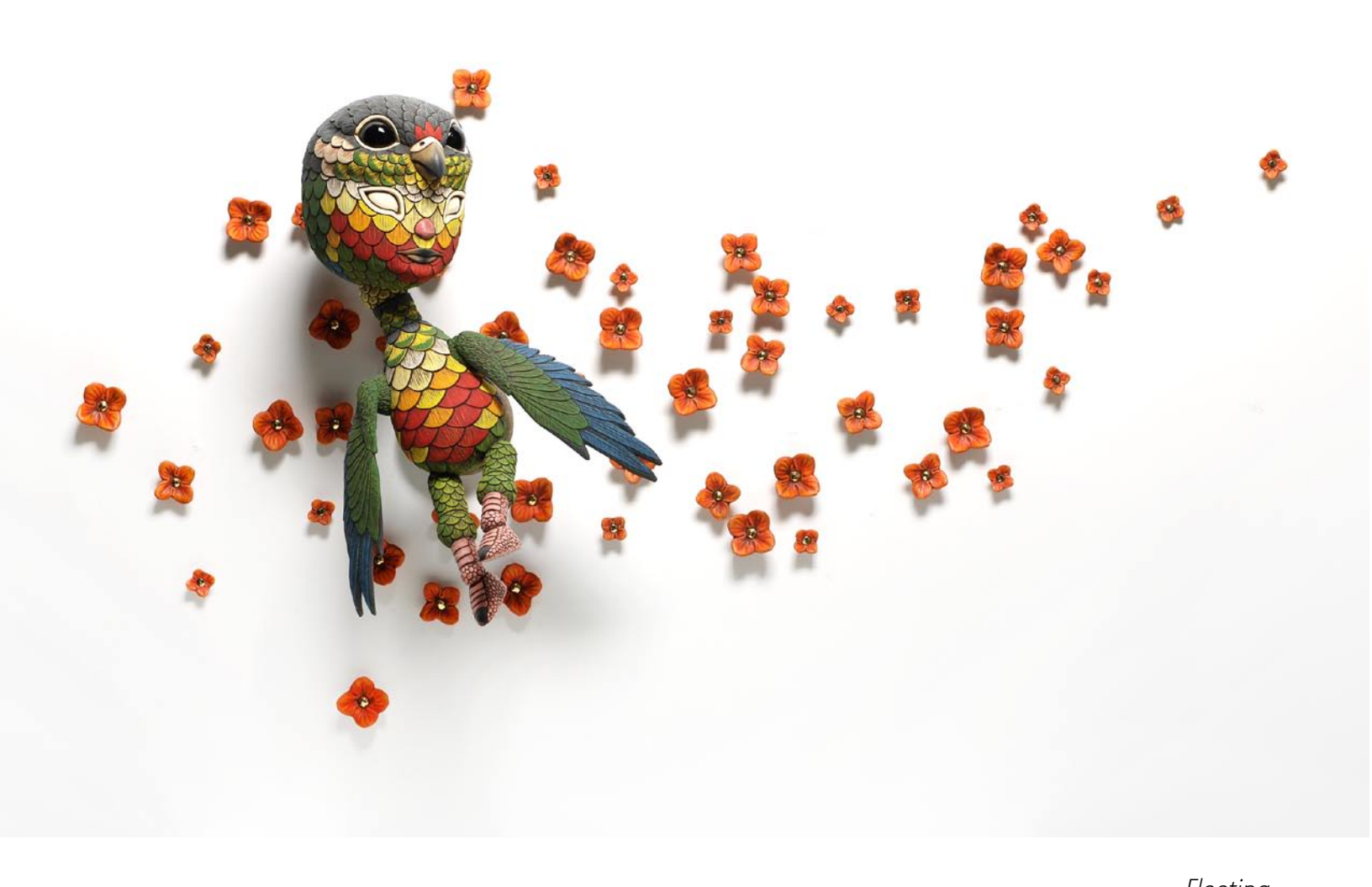
Fleeting ceramic with glaze 16 x 29 x 8 inches SOLD