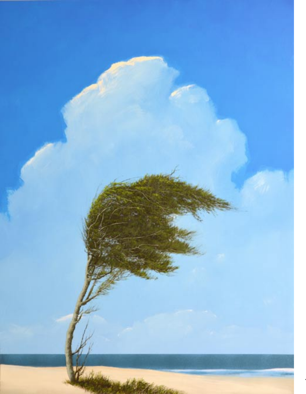
Satilla, oil and acrylic on panel, 48 x 36 inches