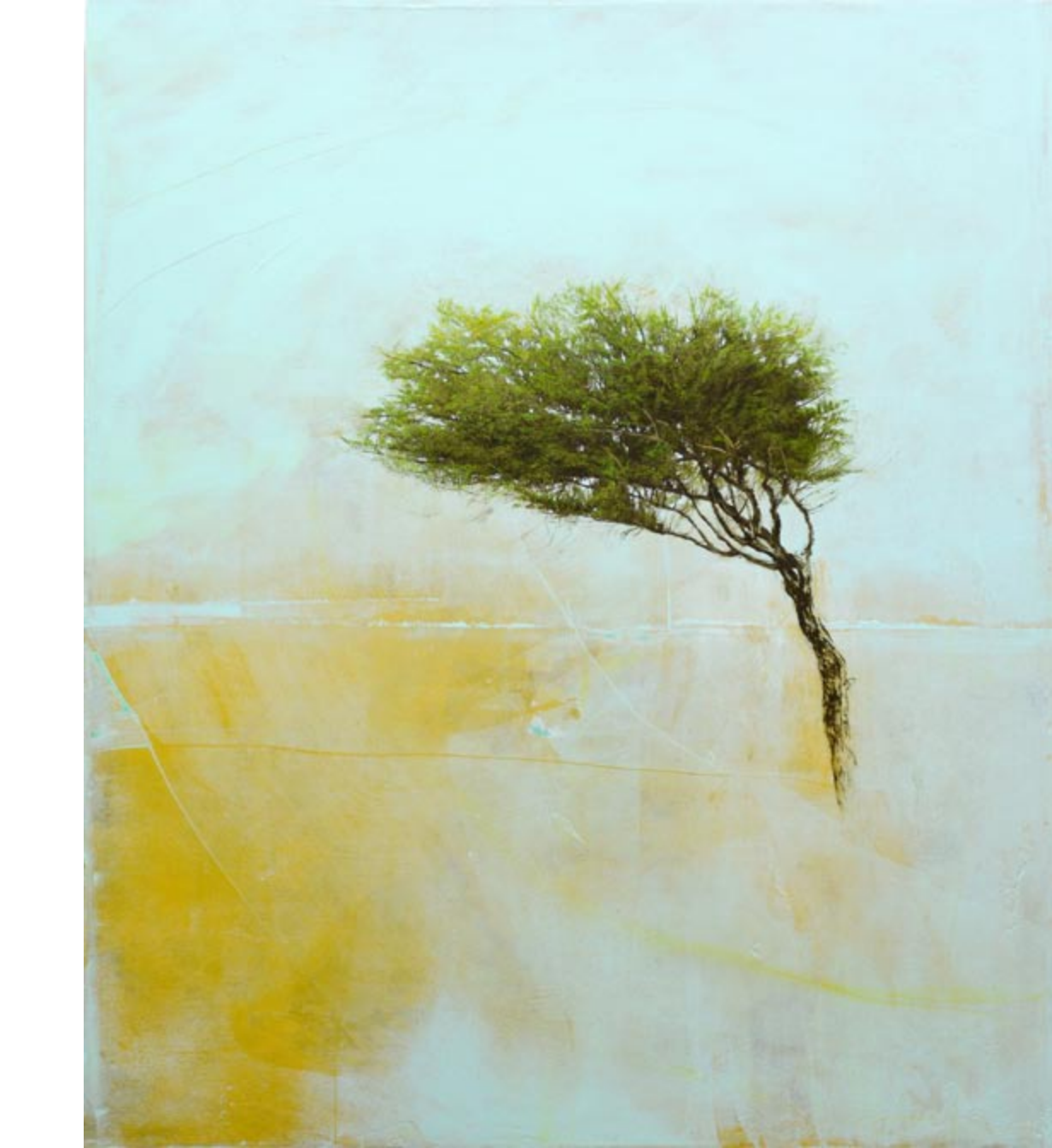
Aria Umido, oil and acrylic on panel, 48 x 40 inches