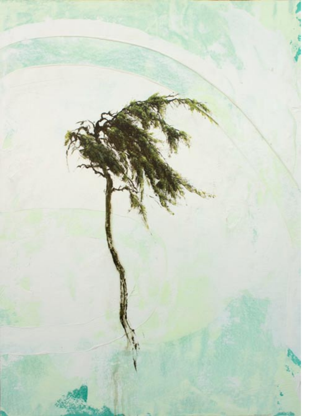
Boreal, oil and acrylic on panel, 29.5 x 21.5 inches