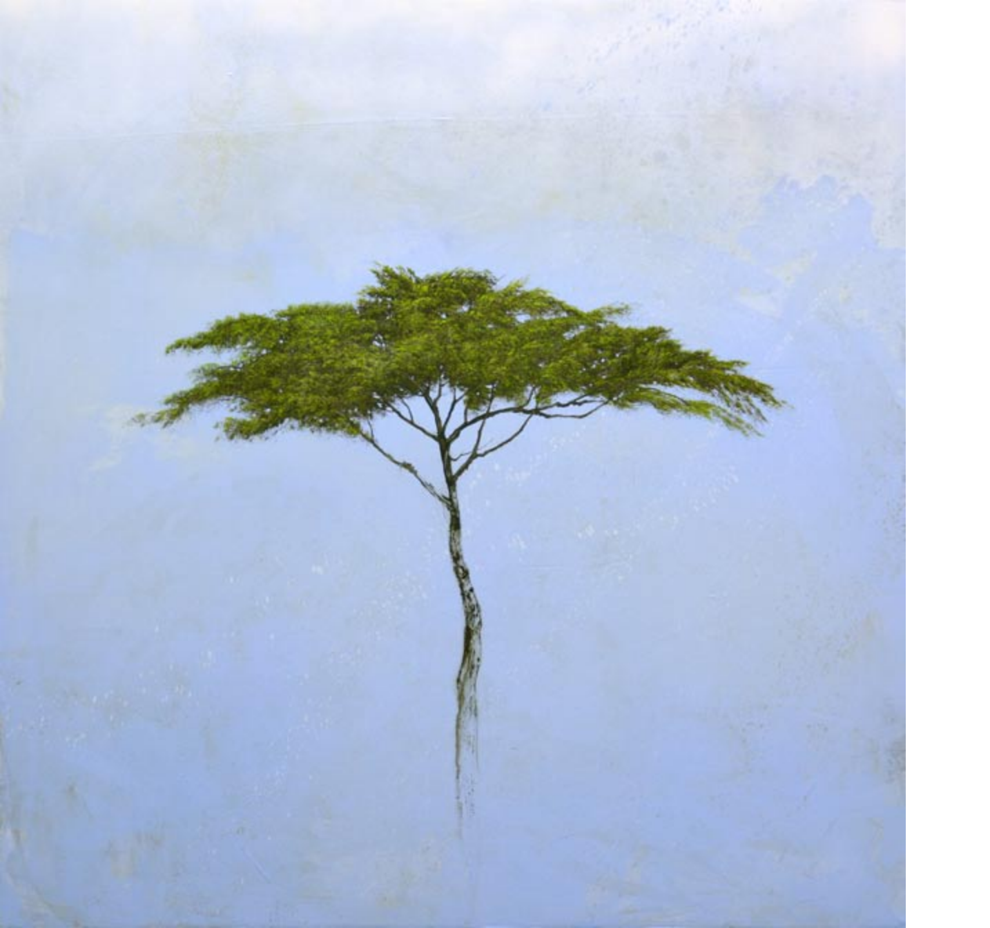
Agua, oil and acrylic on panel, 48.5 x 47.5 inches