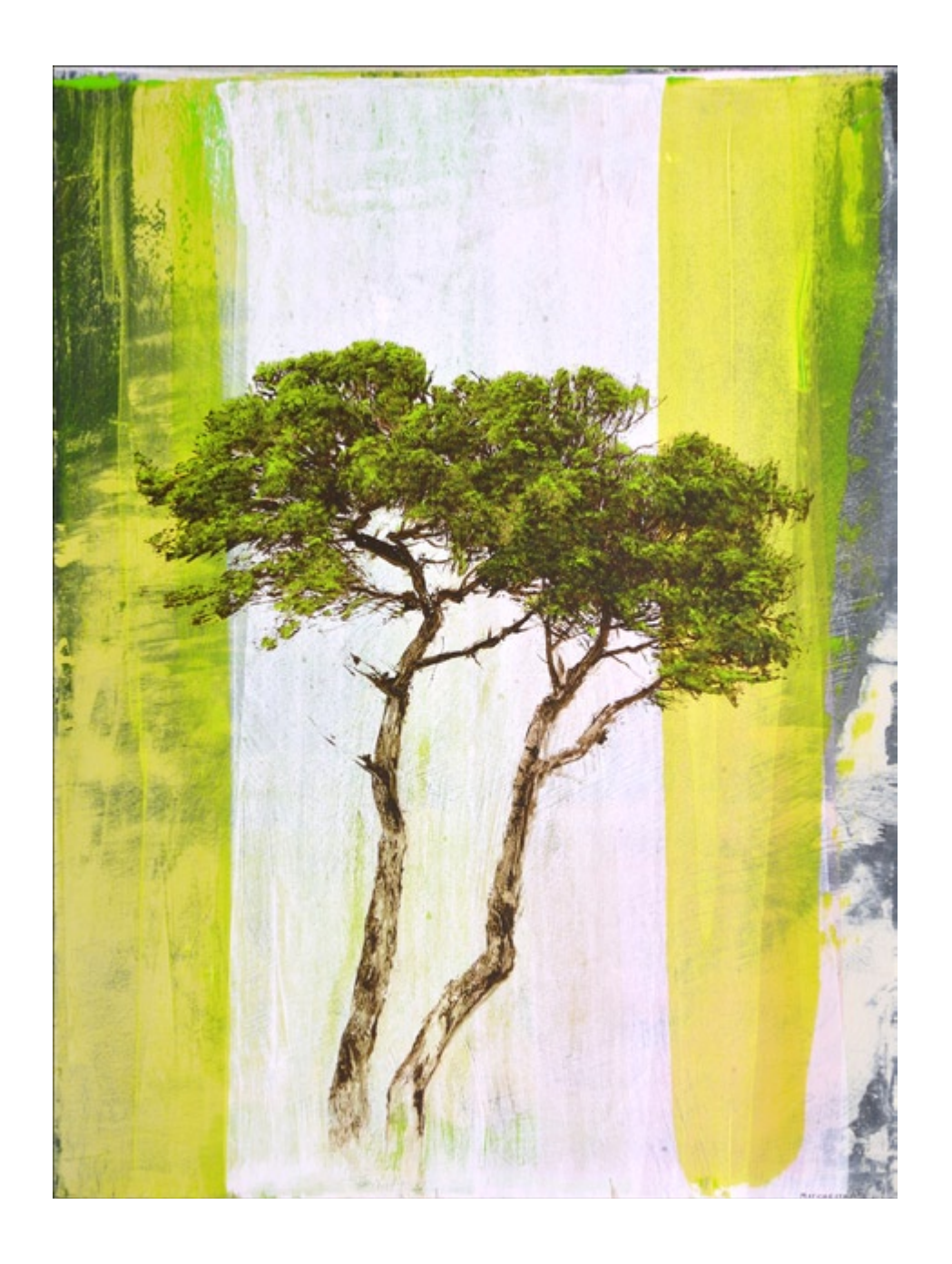
Le Couple oil and acrylic on canvas 24 x 18 inches