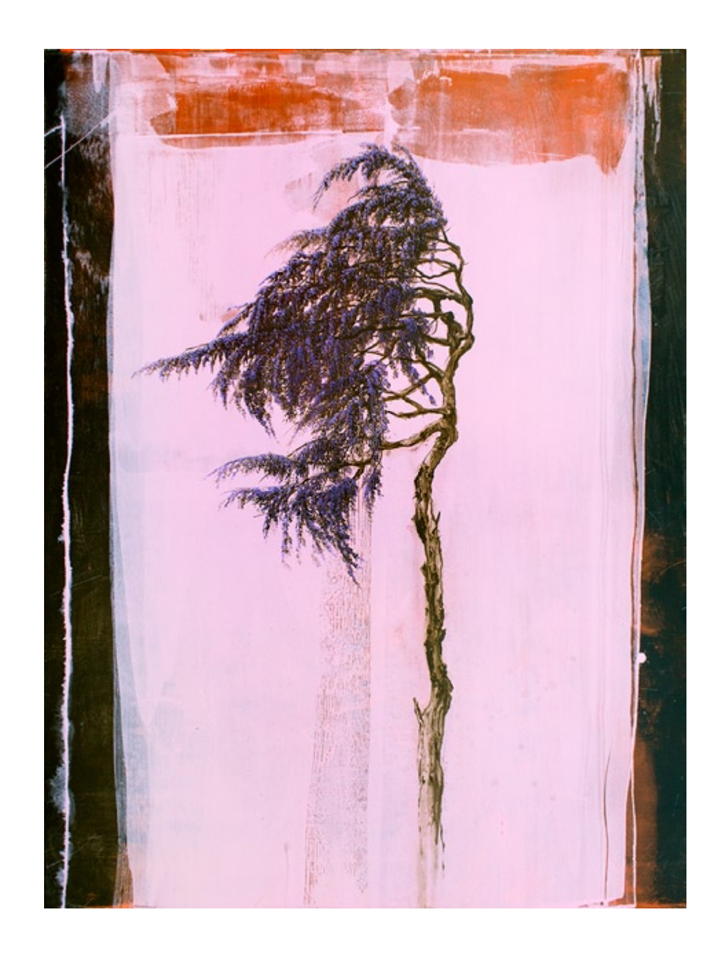
Tascat oil and acrylic on panel 48 x 36 inches