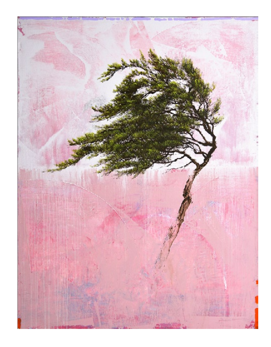
Arcs oil and acrylic on canvas 52 x 40 inches