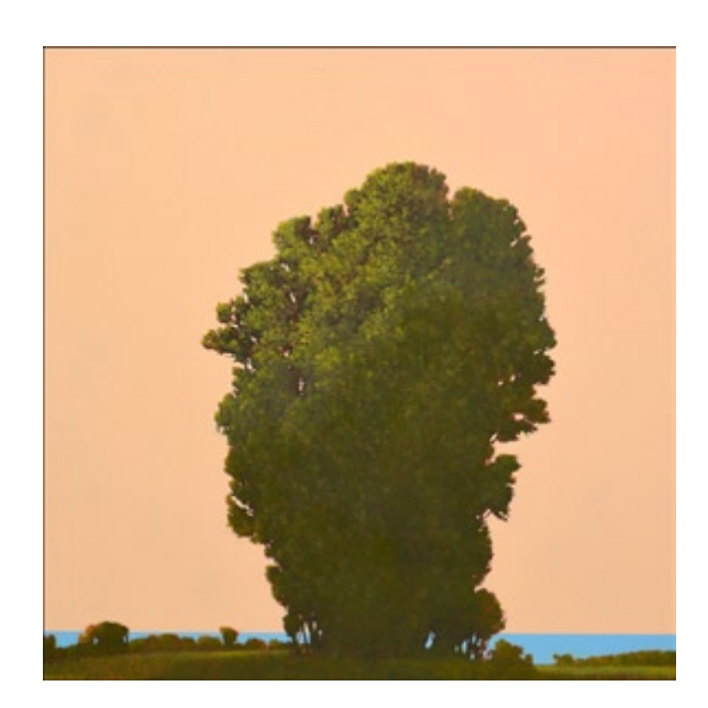
Vesperum II (left) Vesperum IV (center) Vesperum V (right) oil and crylic on canvas 24 x 24 inches each