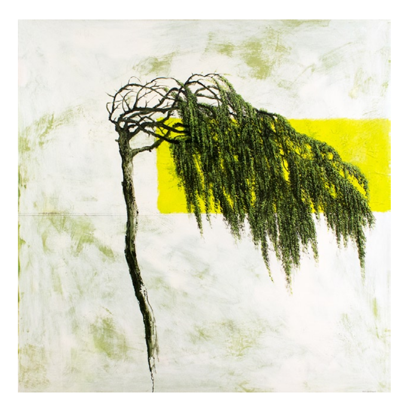
Khios oil and acrylic on panel 40 x 40 inches