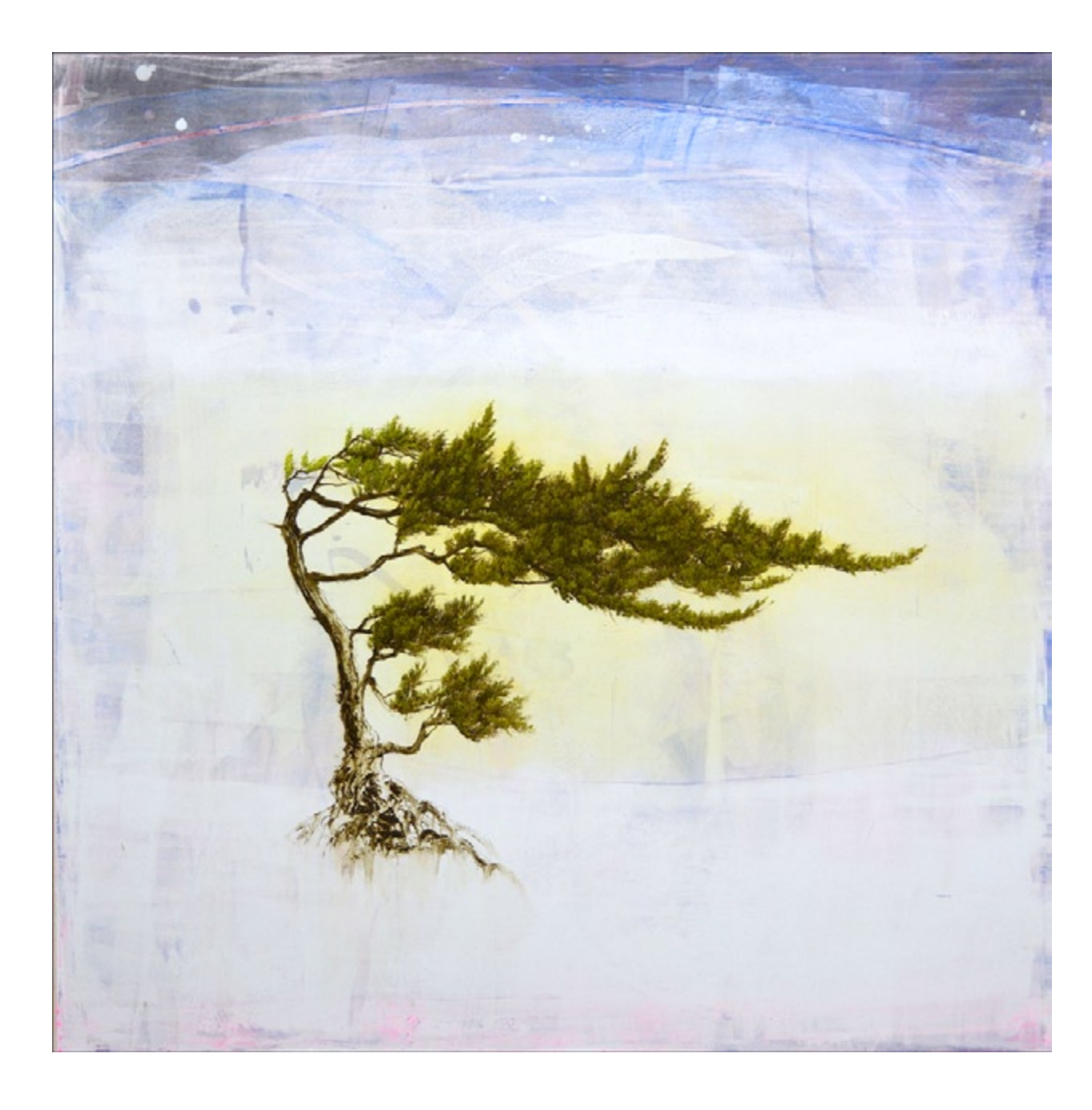
Juniperus oil and acrylic on panel 48 x 48 inches