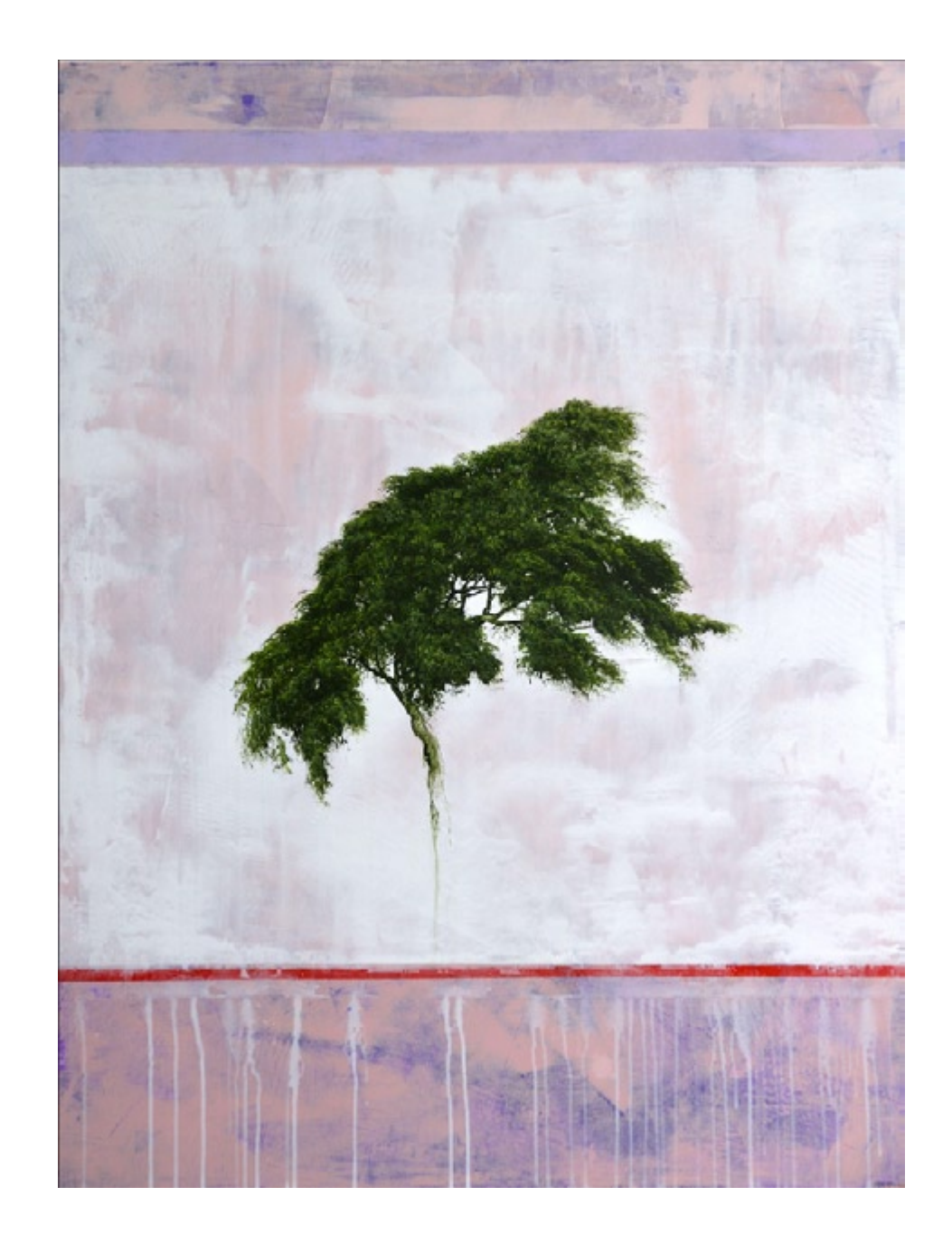
Montechiaro oil and acrylic on panel 48 x 36 inches