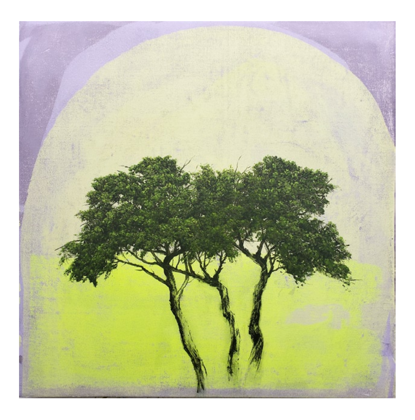
Jeju oil and acrylic on canvas 30 x 30 inches