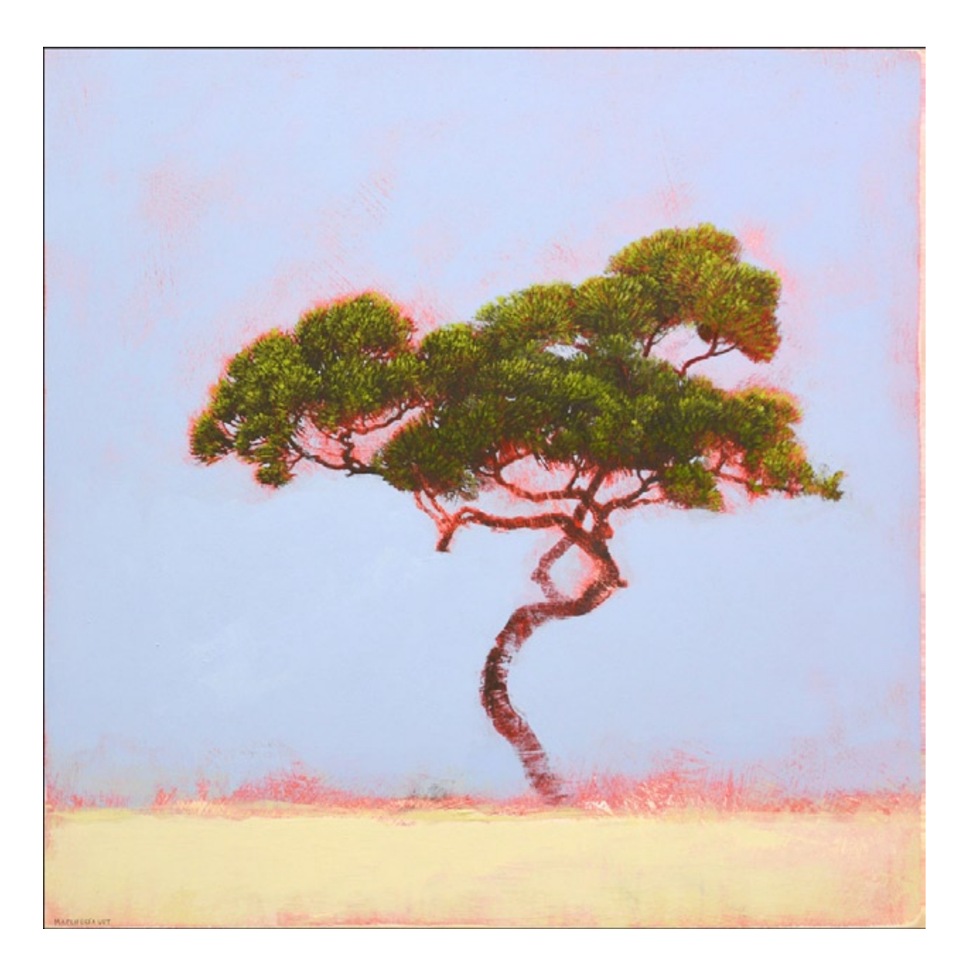
Bijou oil and acrylic on canvas 24 x 24 inches