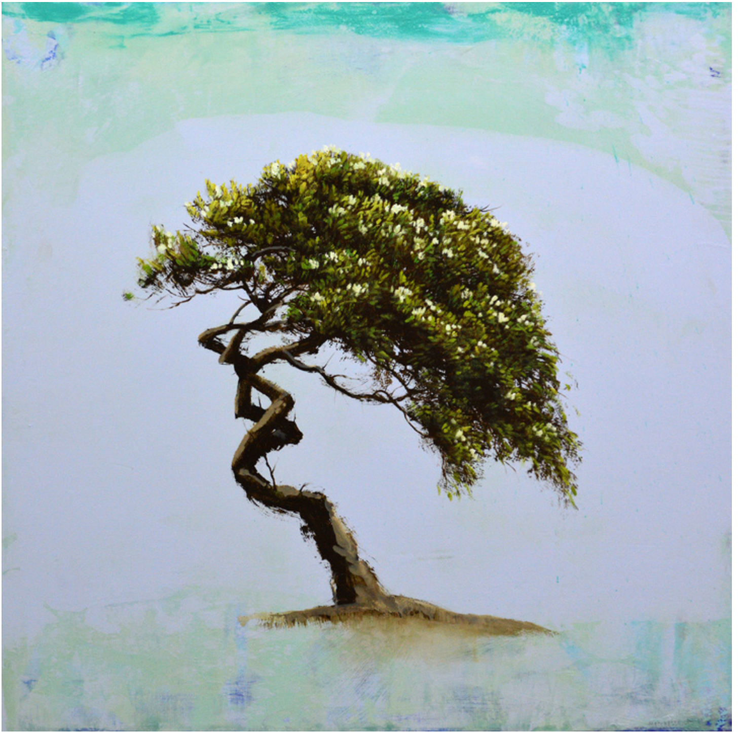
Marceil II , oil and acrylic on panel, 24 X 24 inches