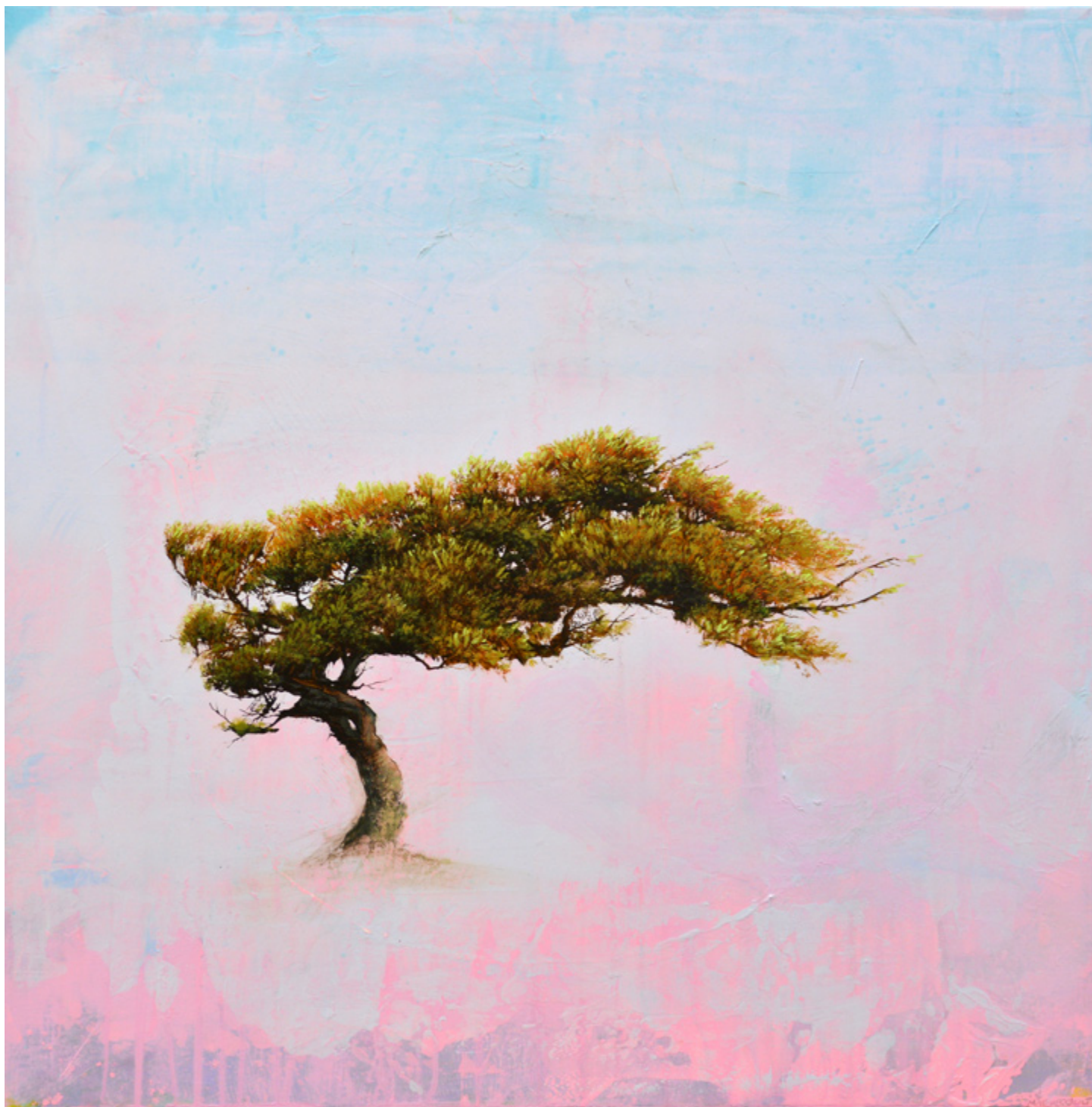
Curtava , oil and acrylic on panel, 24 X 24 inches