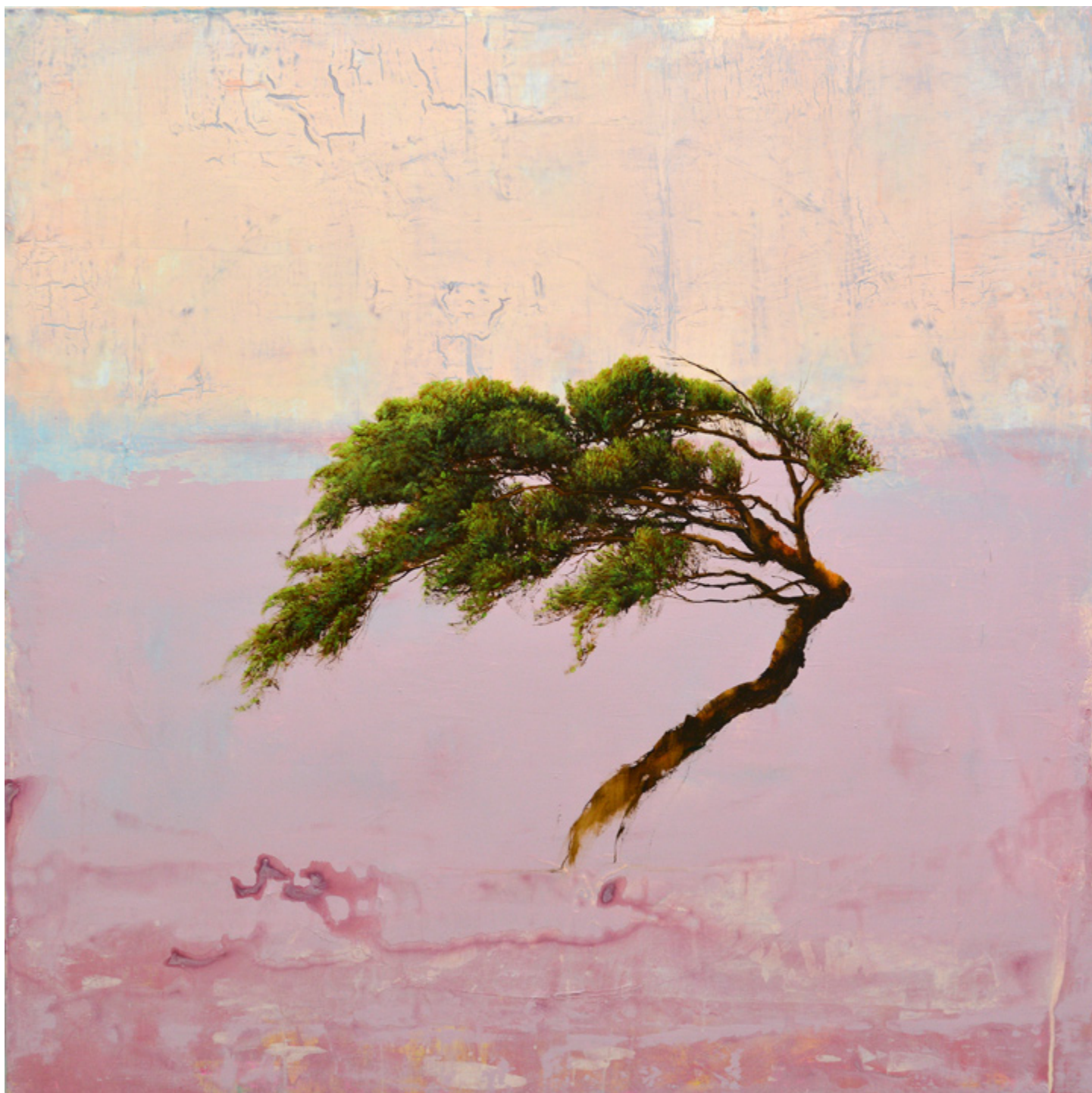
Sango , oil and acrylic on canvas, 40 X 40 inches