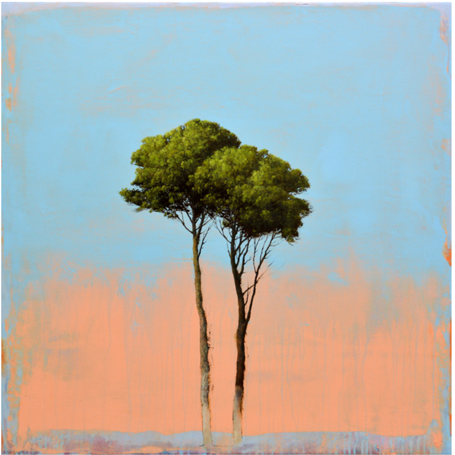
Vespero , oil and acrylic on canvas, 40 X 40 inches