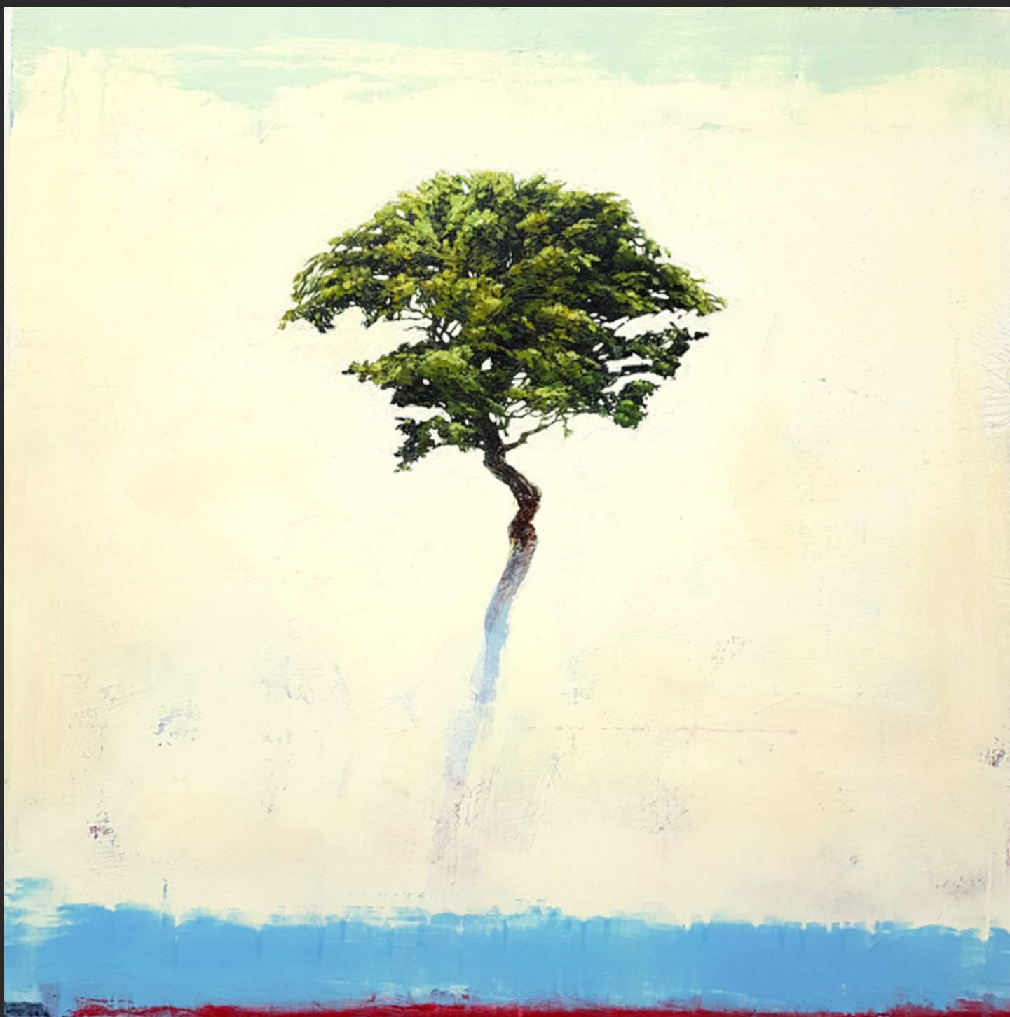
Solar , oil and acrylic on panel, 24 X 24 inches