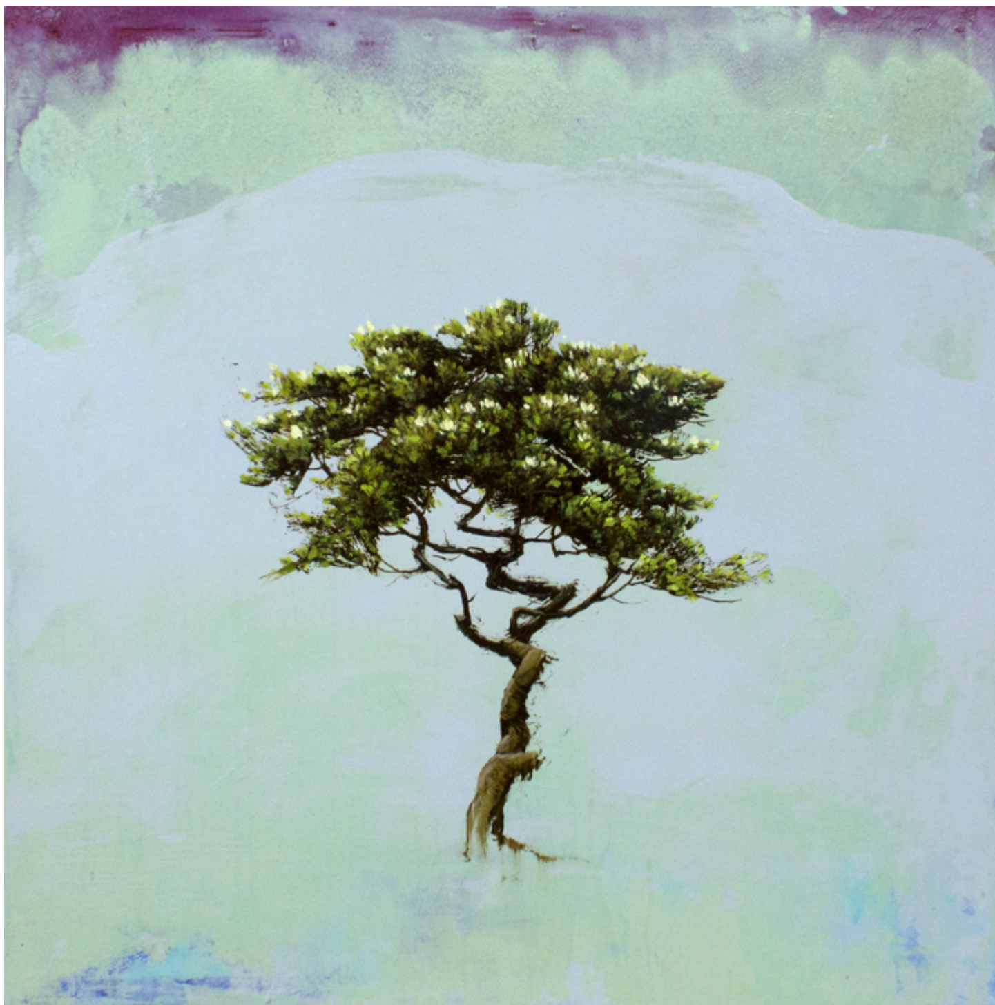
Marceil I , oil and acrylic on panel, 24 X 24 inches