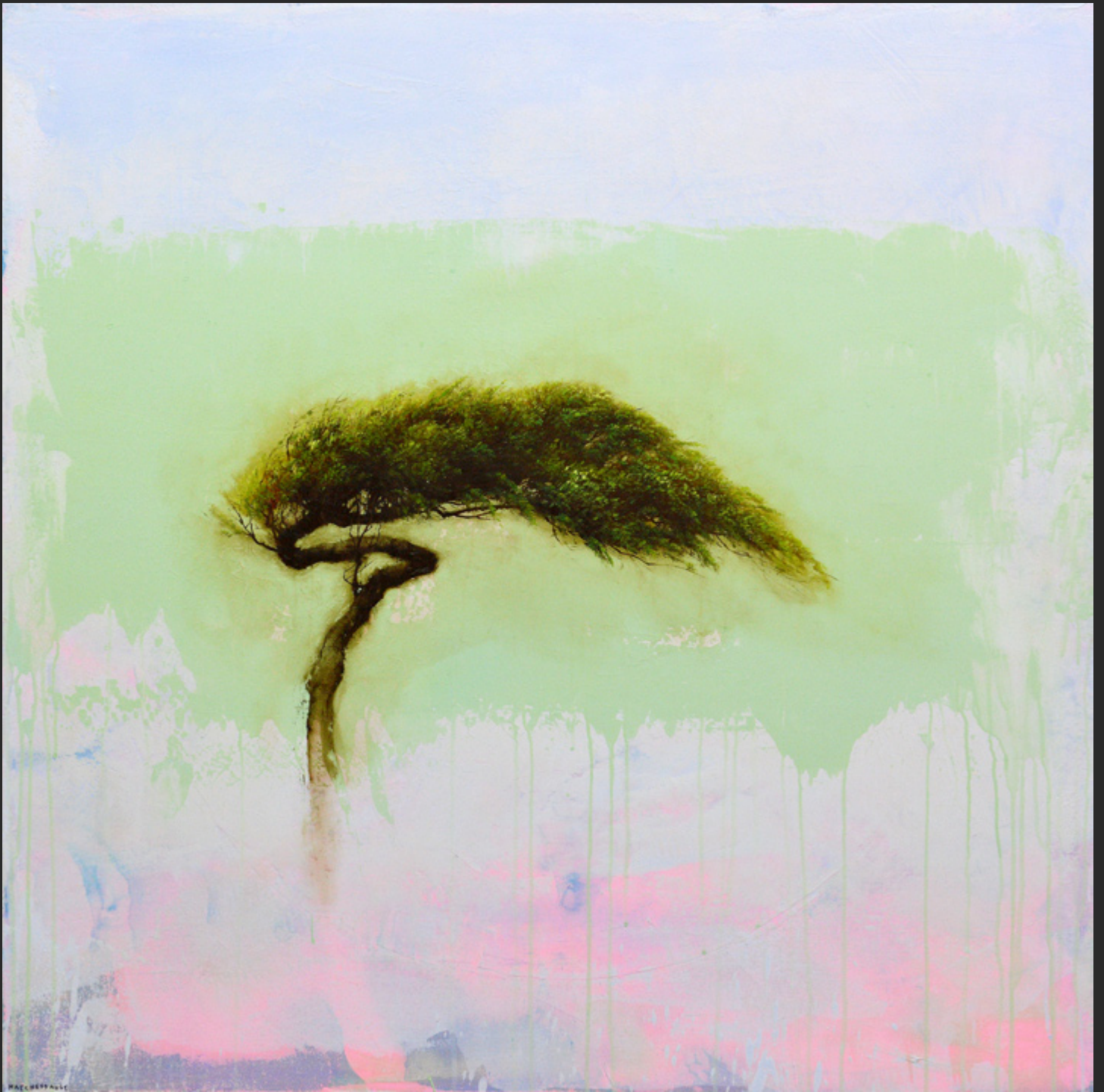
Deviation , oil and acrylic on canvas, 40 X 40 inches