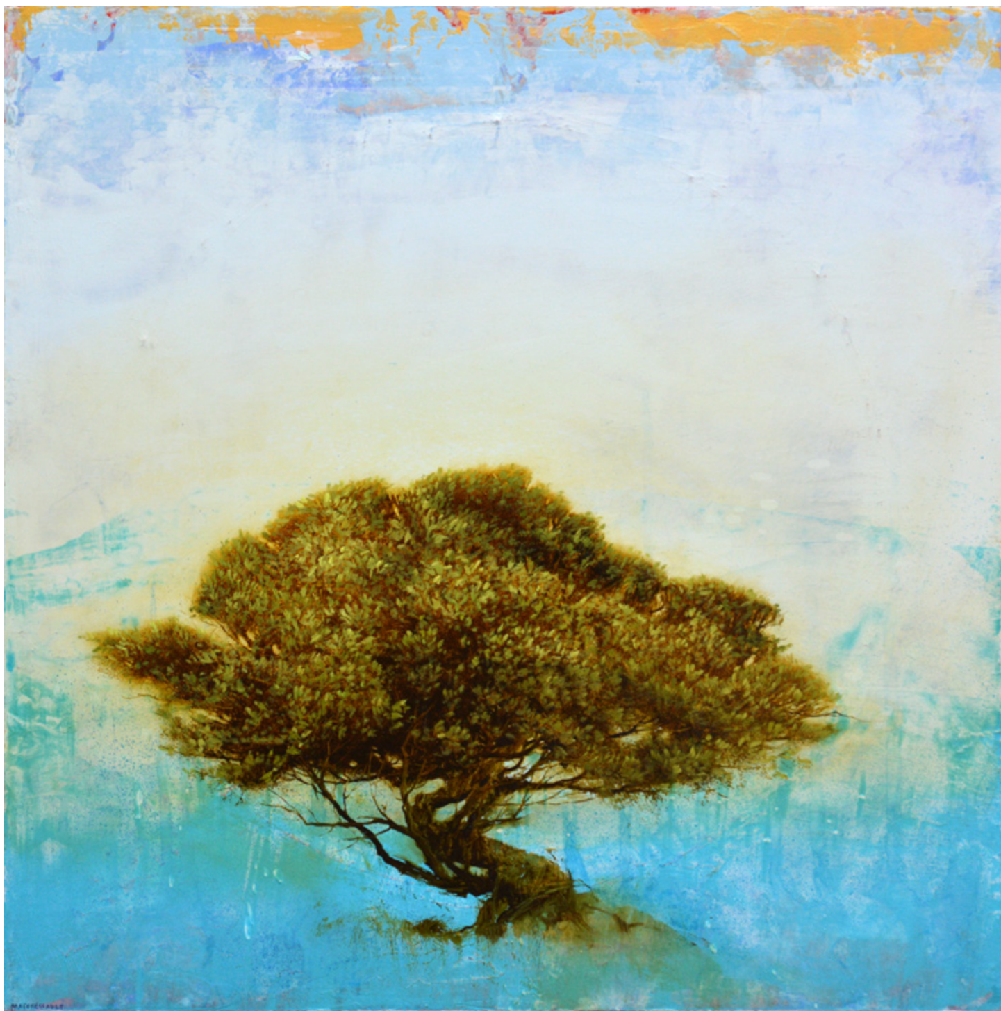
Kumu , oil and acrylic on panel, 24 x 24 inches