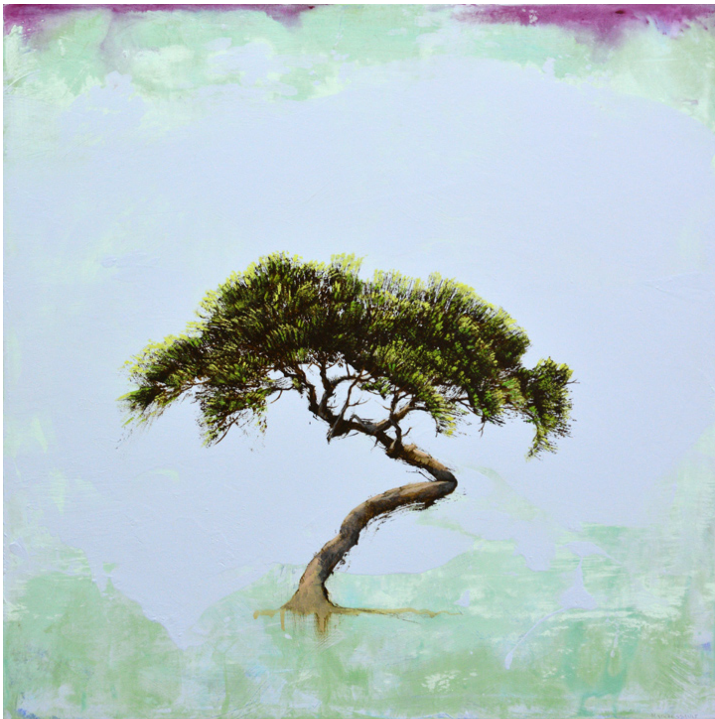
Marceil III , oil and acrylic on panel, 24 X 24 inches