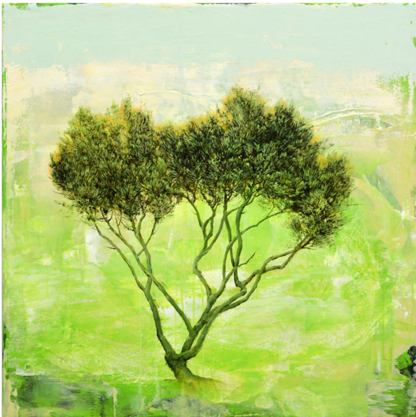
Saltito , oil and acrylic on canvas, 30 X 30 inches