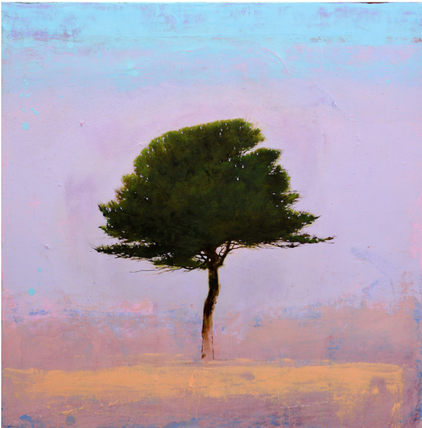
Serra , oil and acrylic on canvas, 40 X 40 inches