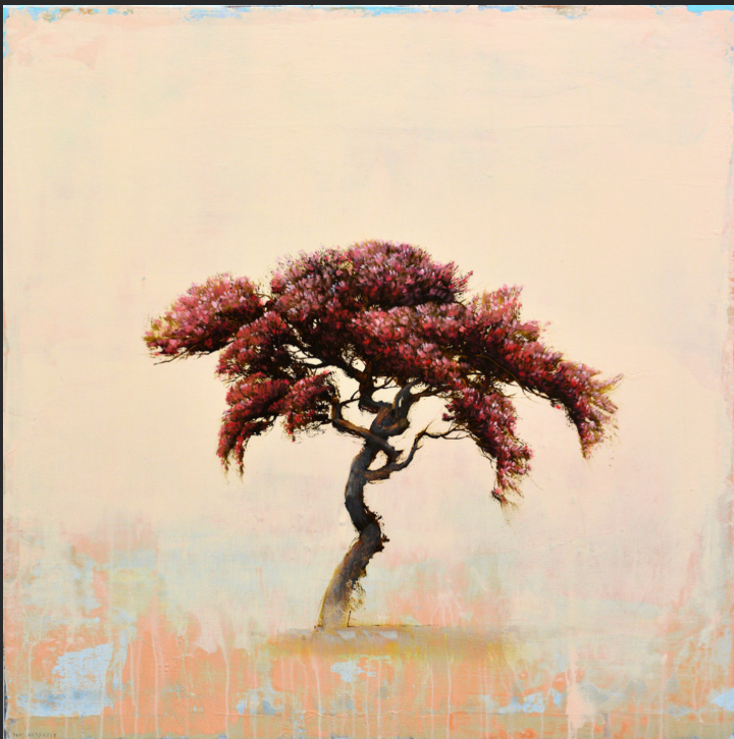
Rosas , oil and acrylic on canvas, 30 X 30 inches