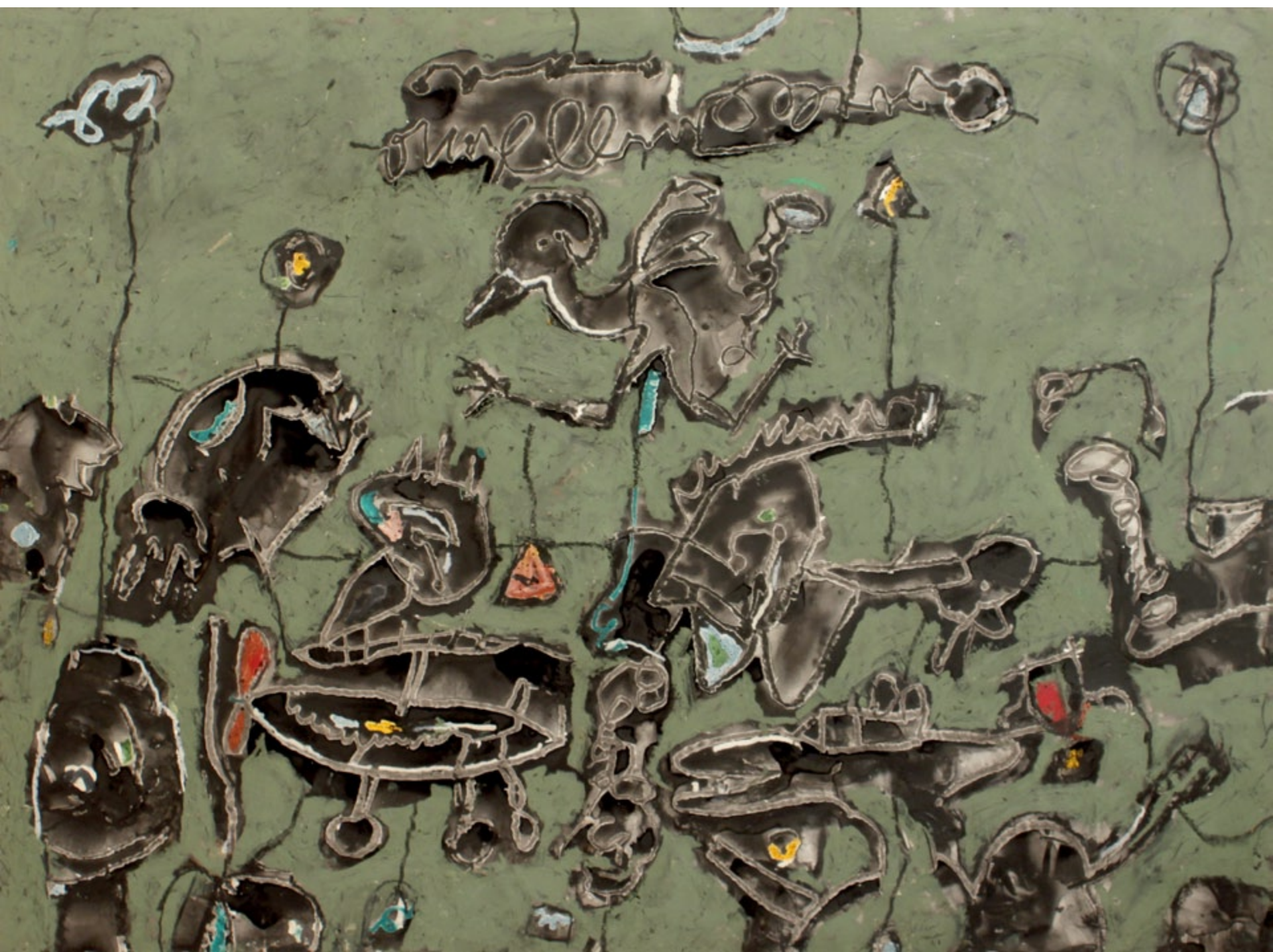
Flap Doodle , 2009, mixed media, 26 X 35 inches