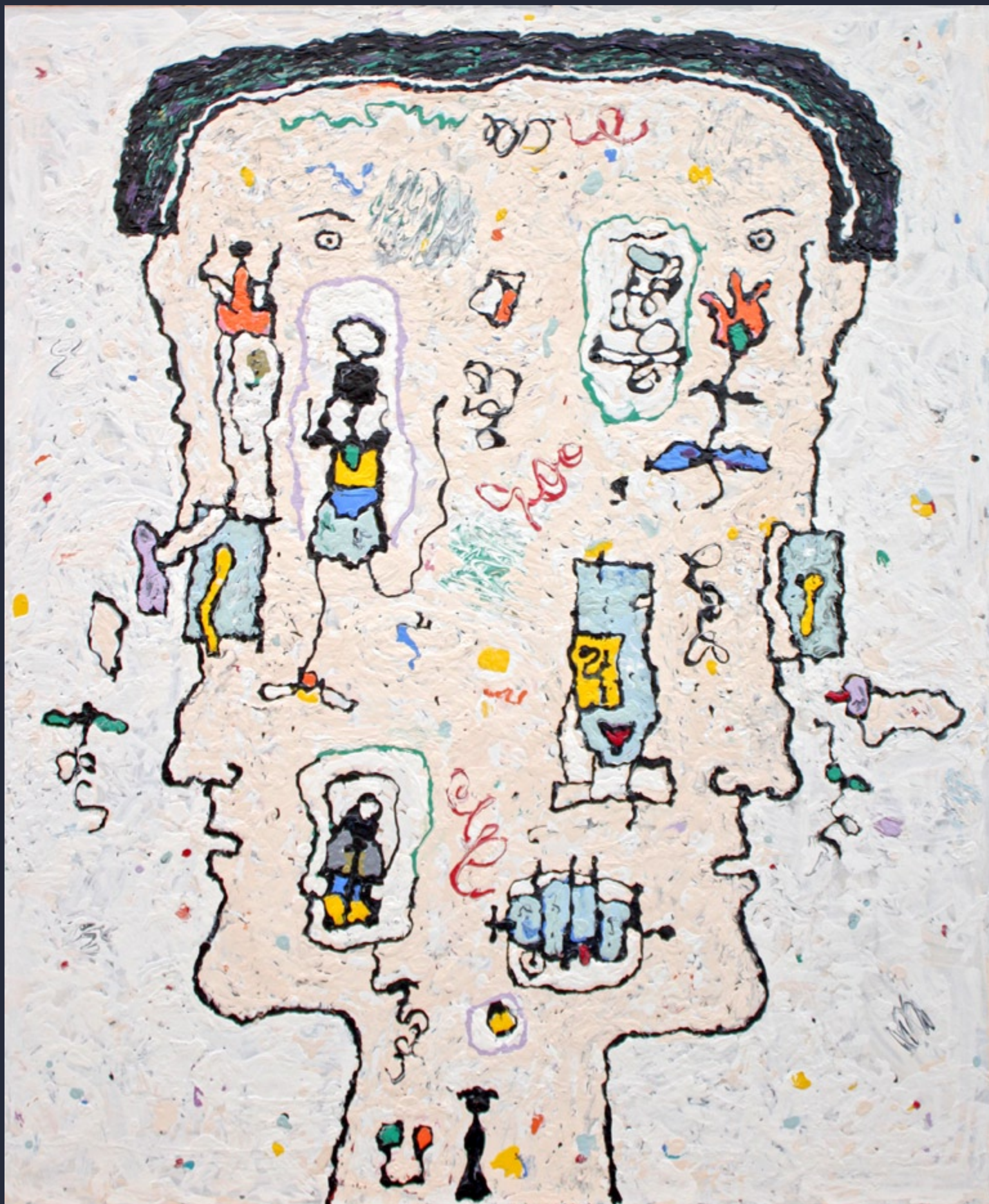
Look Both Ways Janus , 2003, acrylic on canvas, 60 X 50 inches