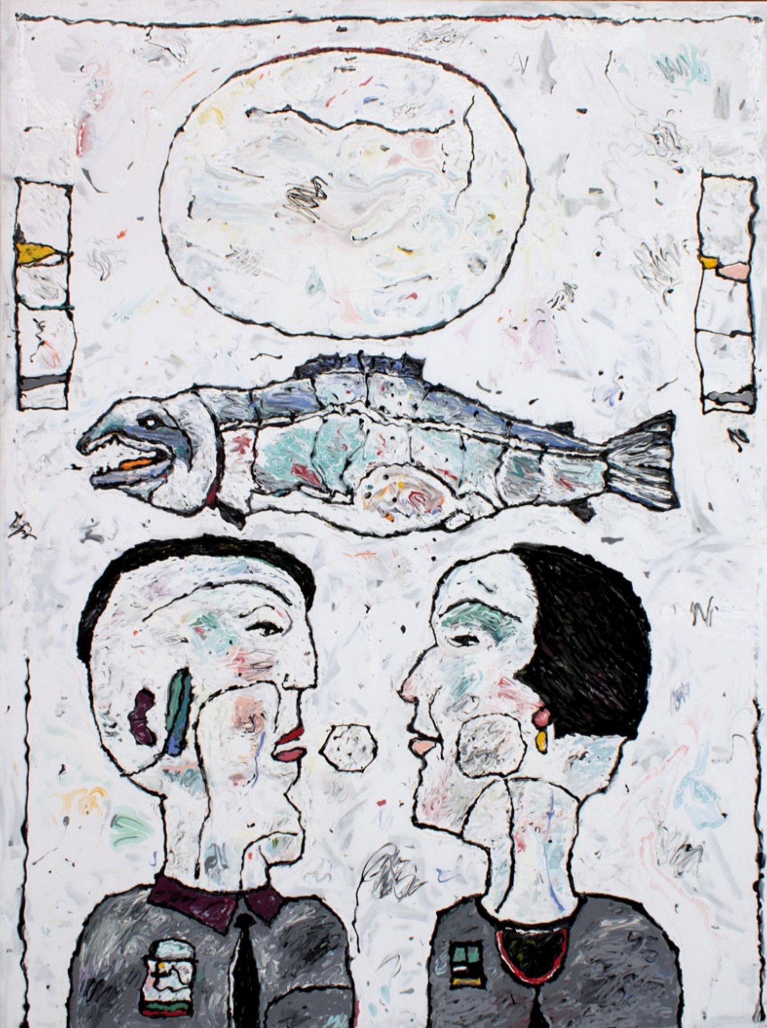
Salmon Totem, 2000, acrylic on canvas, 66 X 50 inches