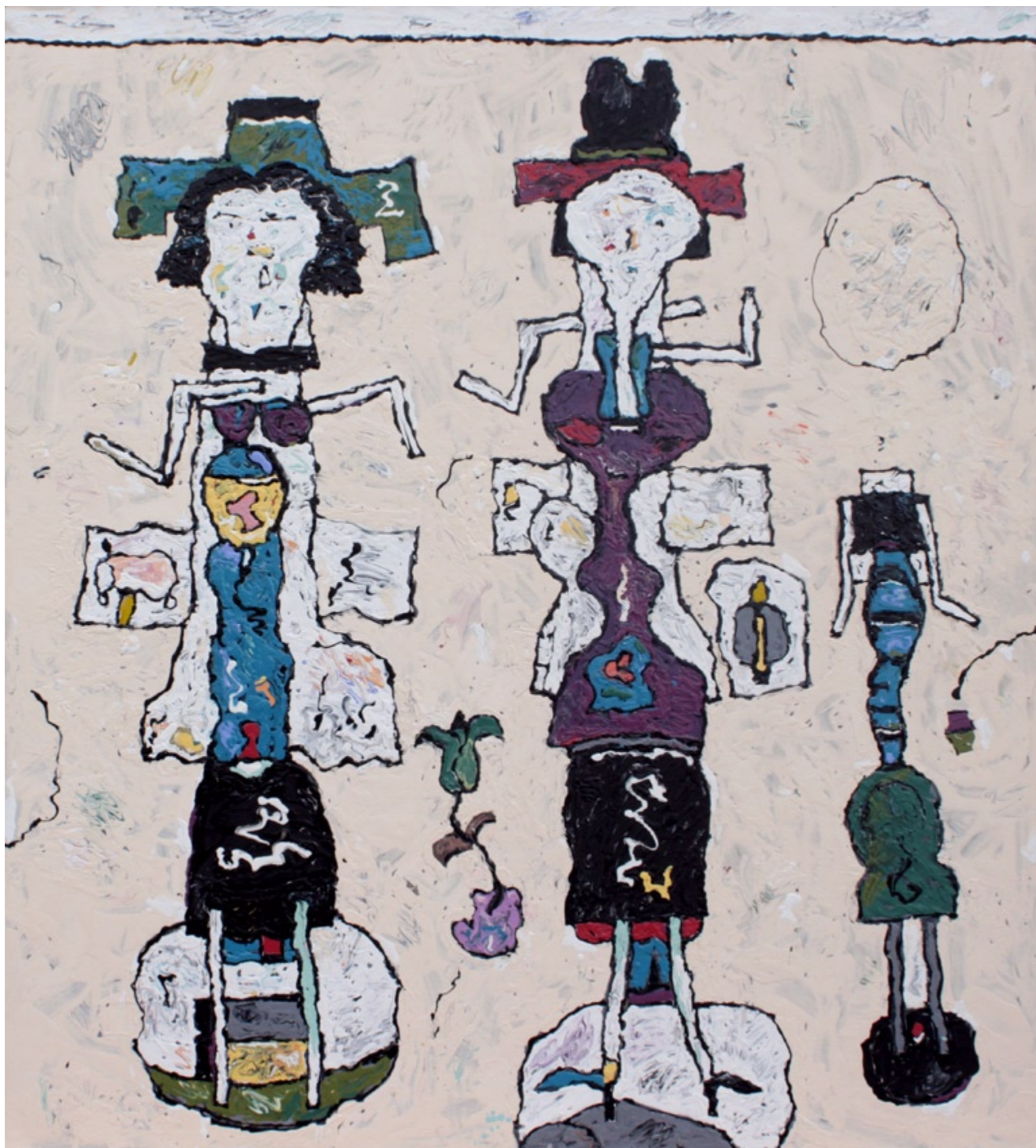
Southwest Totem , 2001, acrylic on canvas, 60 X 50 inches