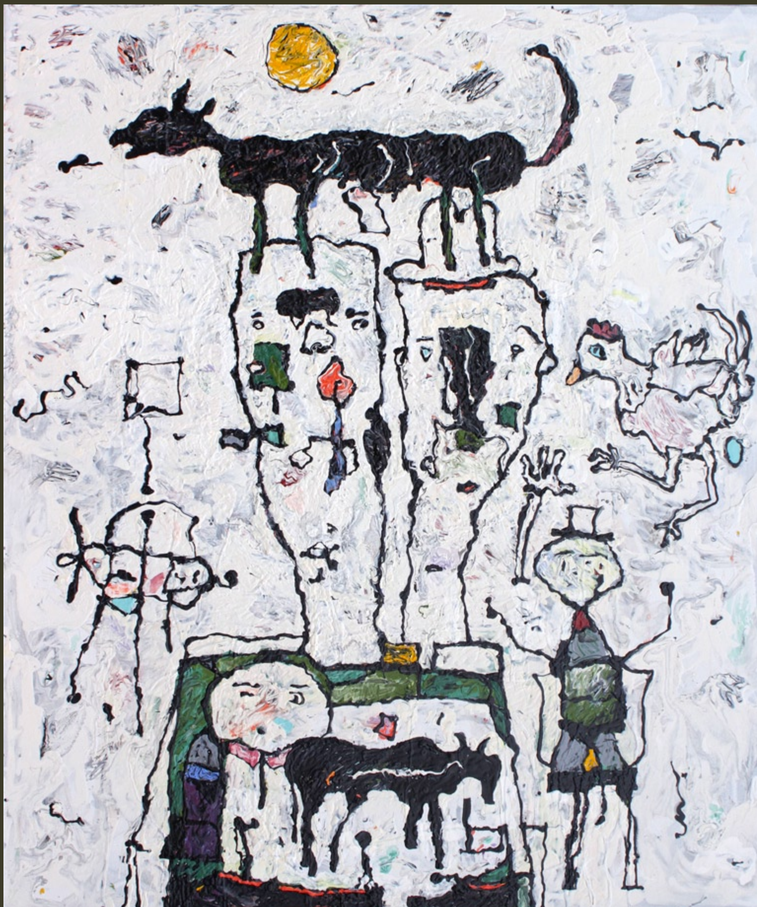
Alden Mason Age 6 River Forks Farm, 2000, acrylic on canvas, 61 X 51 inches