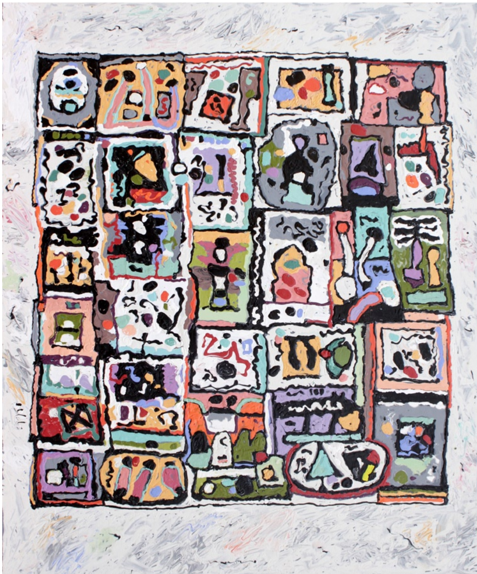
Tattle Tale , 2001, acrylic on canvas, 60 X 50 inches