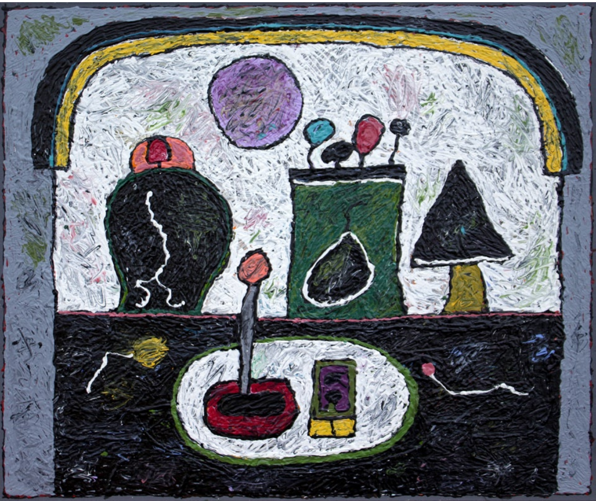
Head with Green Vase , 1995, acrylic on canvas, 36 X 43 inches