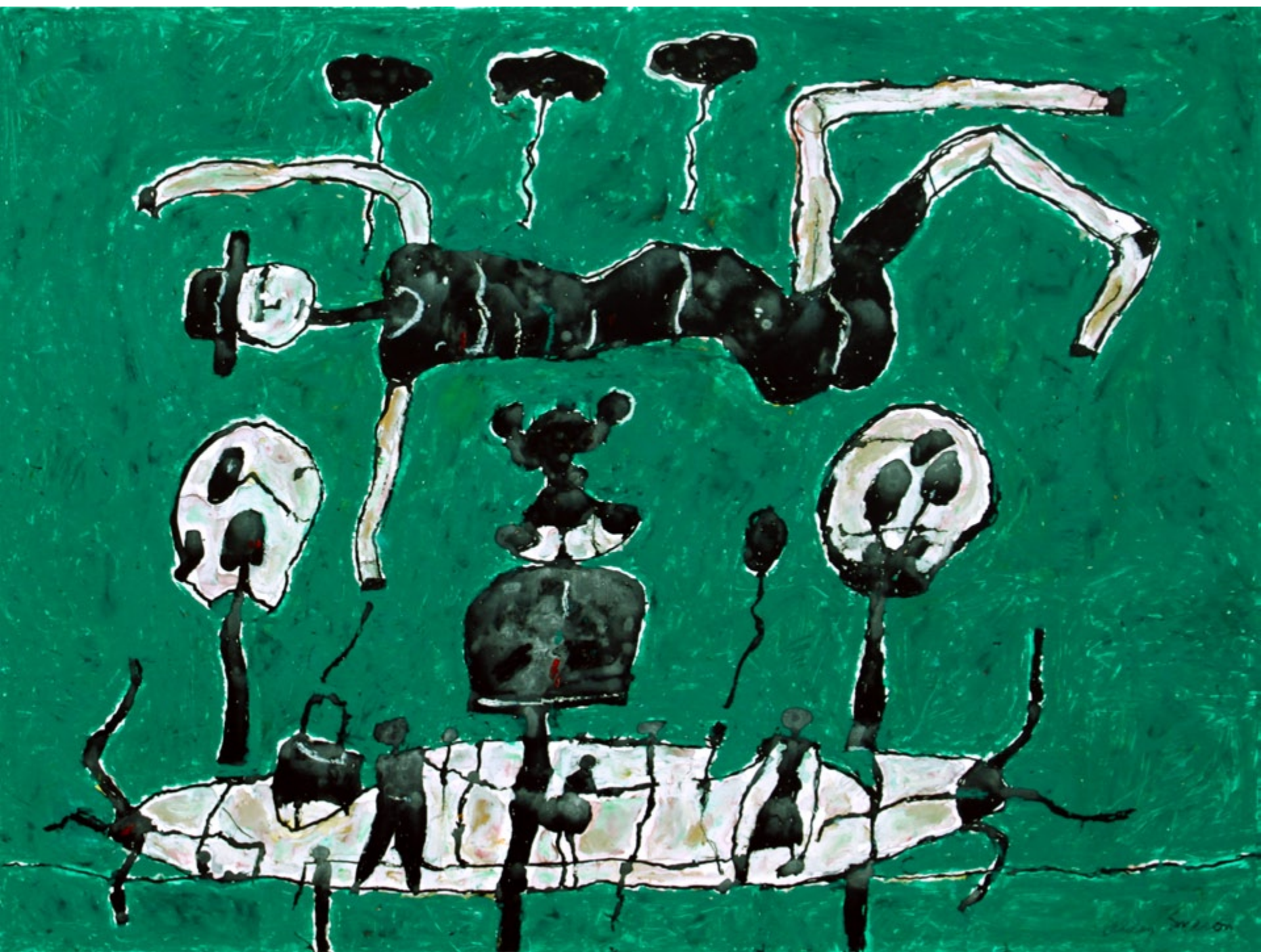
Goodtime Charlie , 2007, mixed media on paper, 26 X 35 inches