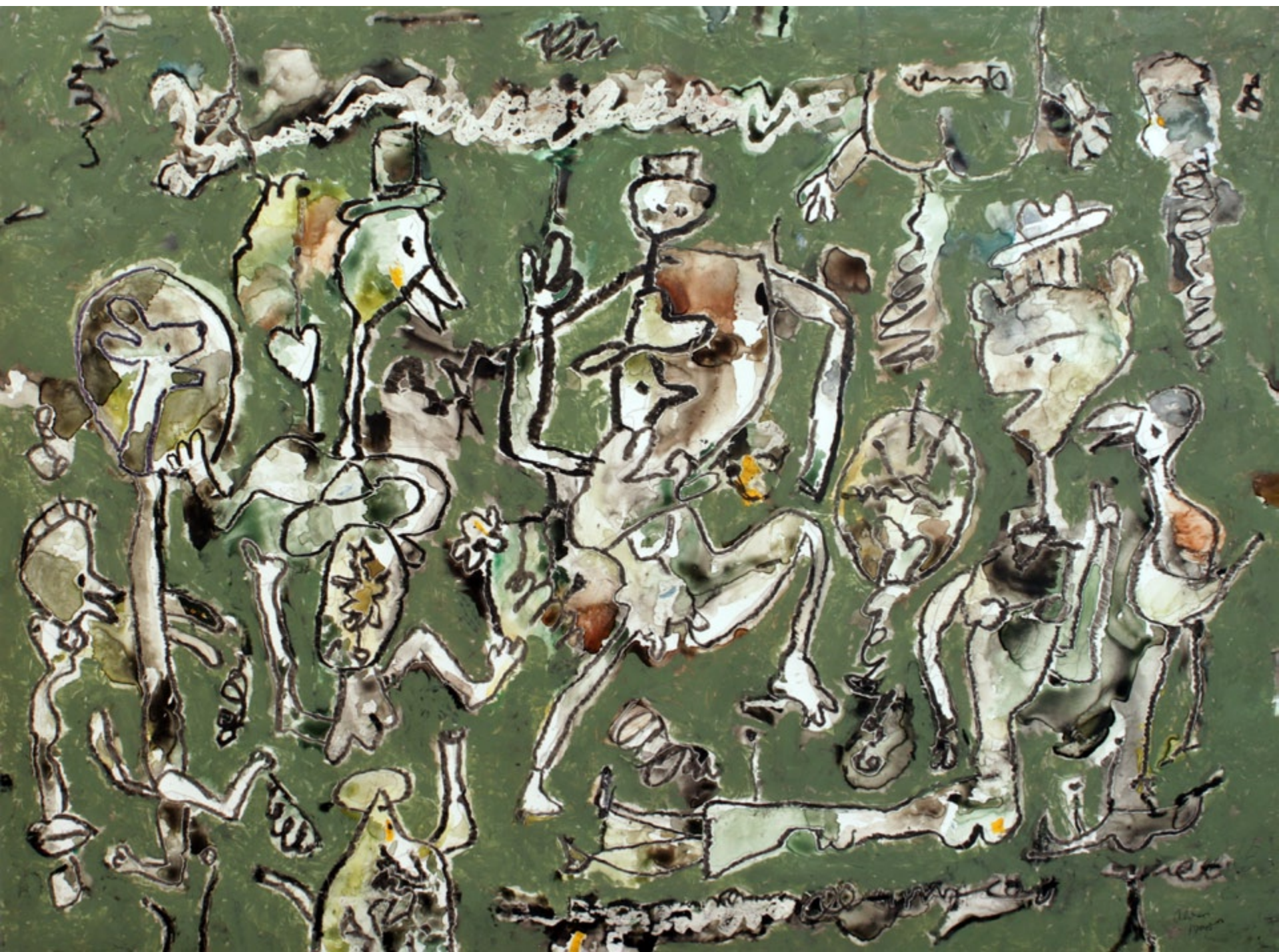
Fox Hunt , 2009, mixed media on paper, 26 X 35 inches