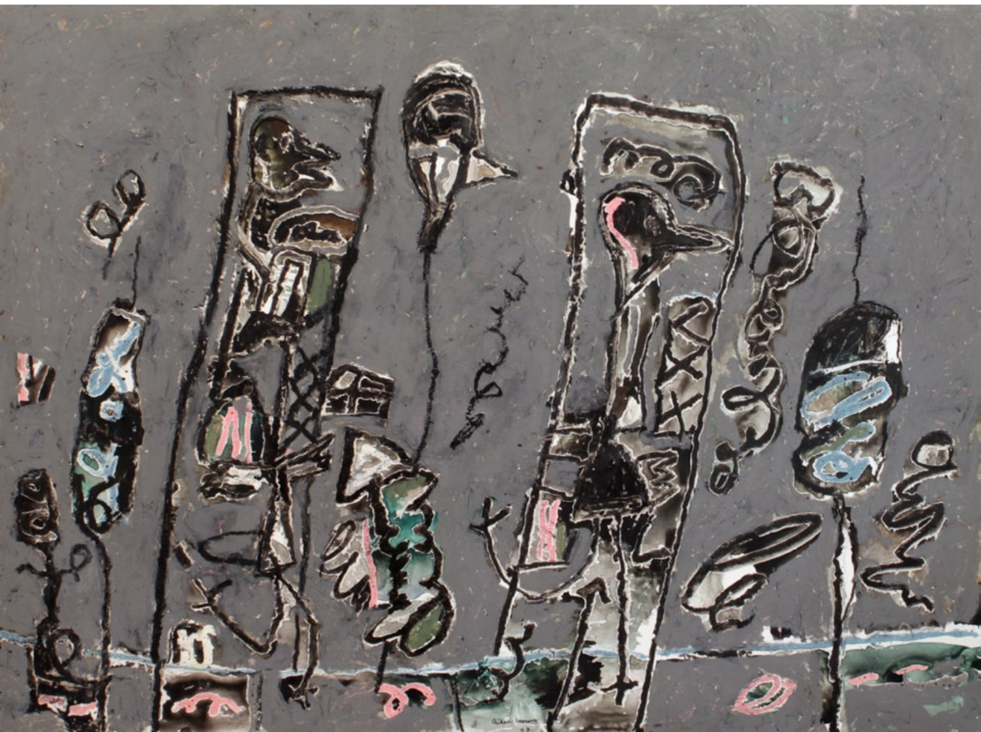
Caged Bird , 2008, mixed media on paper, 26 X 35 inches