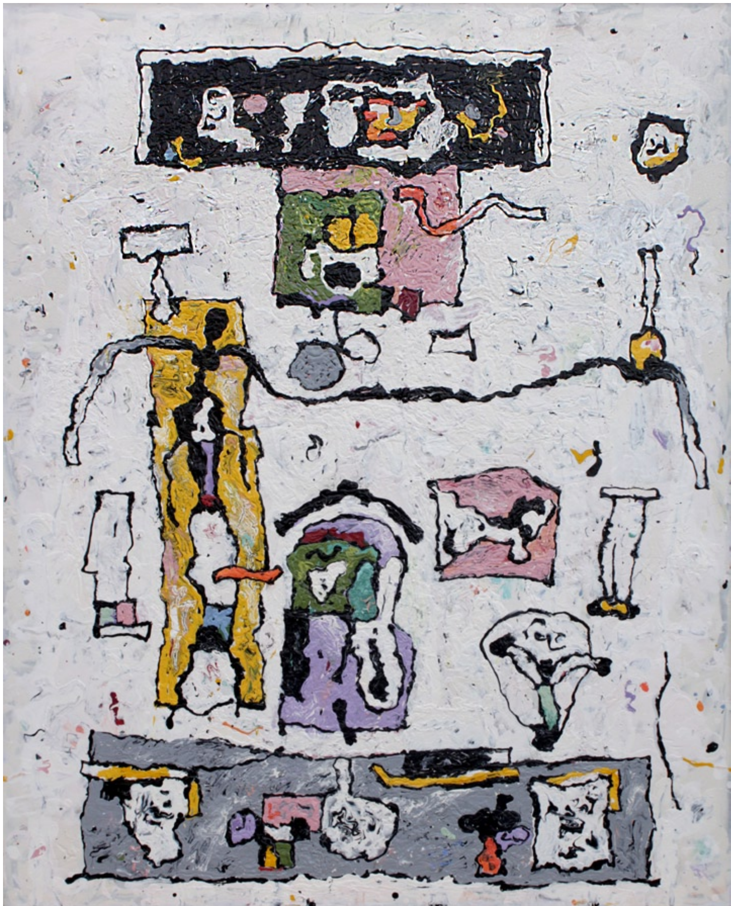
Halleluja , 2000, acrylic on canvas, 62 X 50 inches