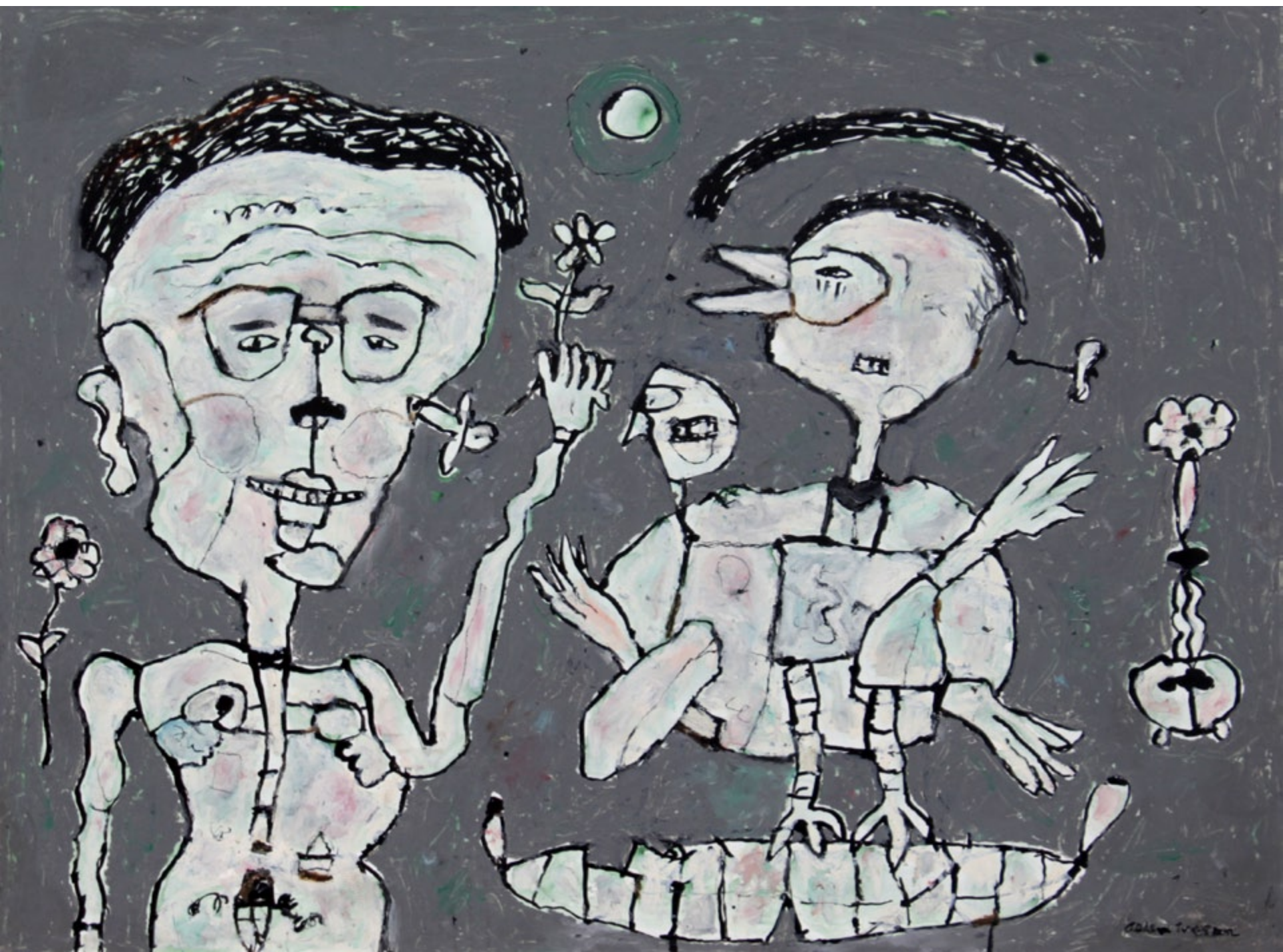
Albino Noodle , 2005, mixed media on paper, 26 X 35 inches