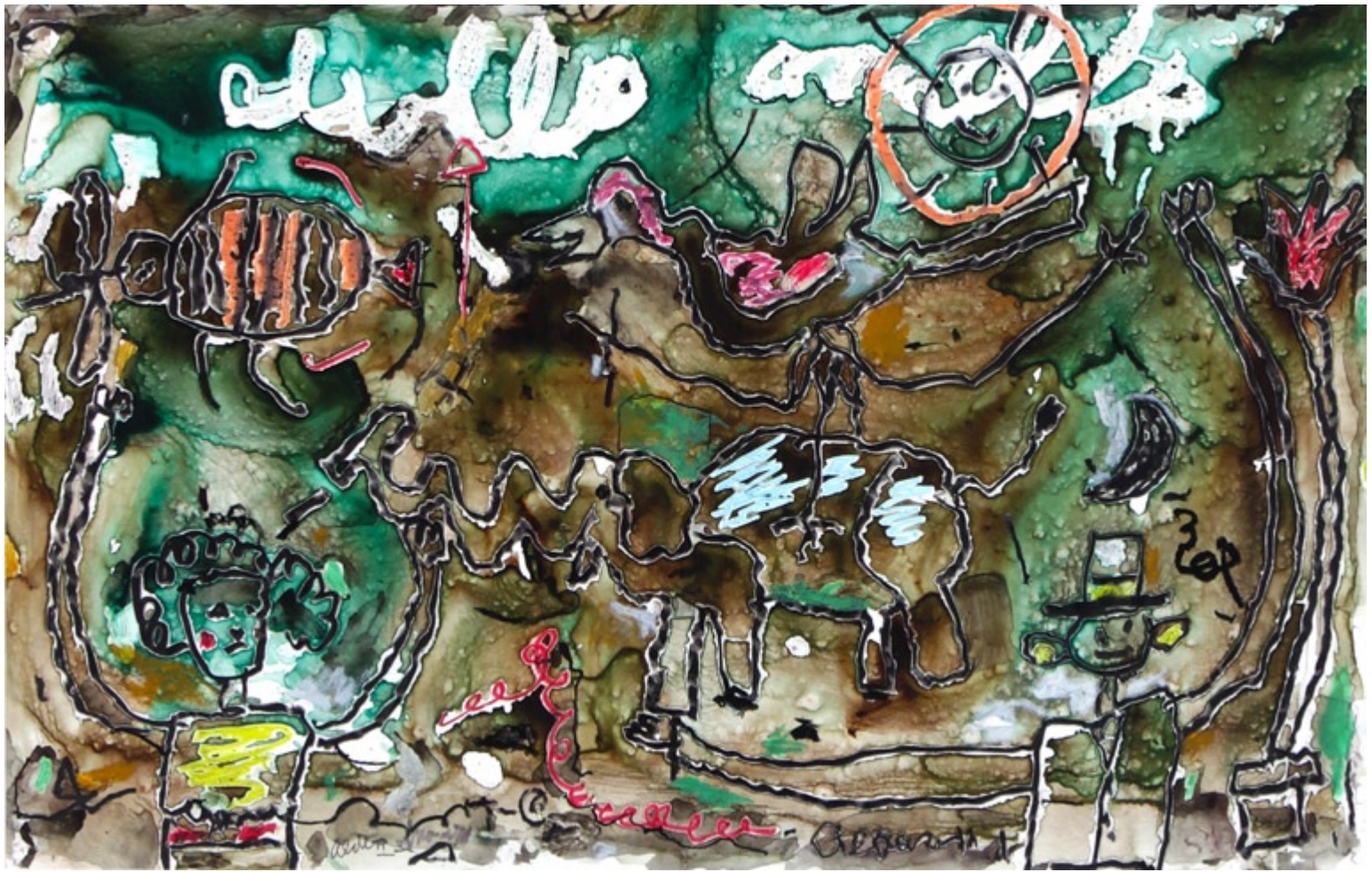
Where's Africa? , 2005, mixed media on paper, 15.5 X 24.5 inches