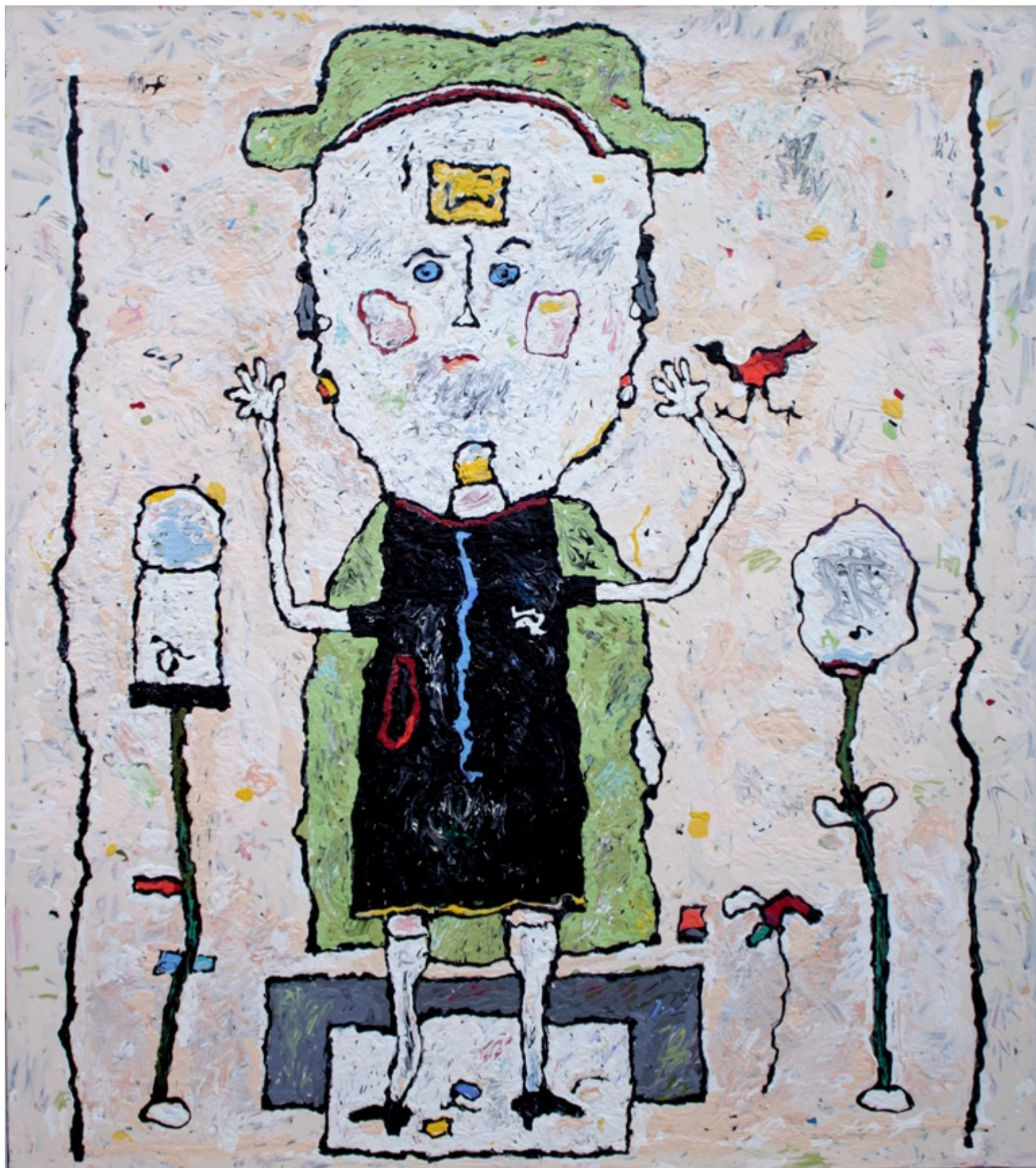
The Last Shaman , 2002, acrylic on canvas, 60 X 53 inches