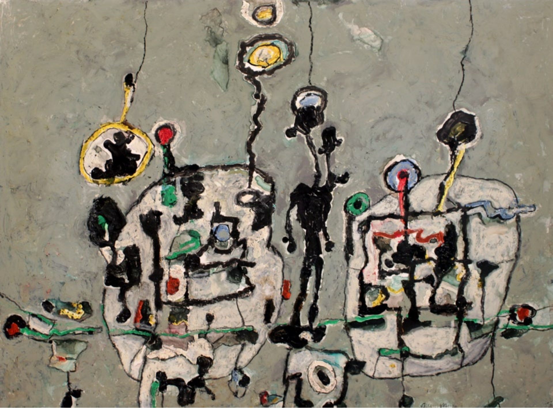
Cover: Spirit Bird Landscape , 1996, acrylic on canvas, 50 X 66 inches This page: Two Heads , mixed media on paper, 26 x 35 inches