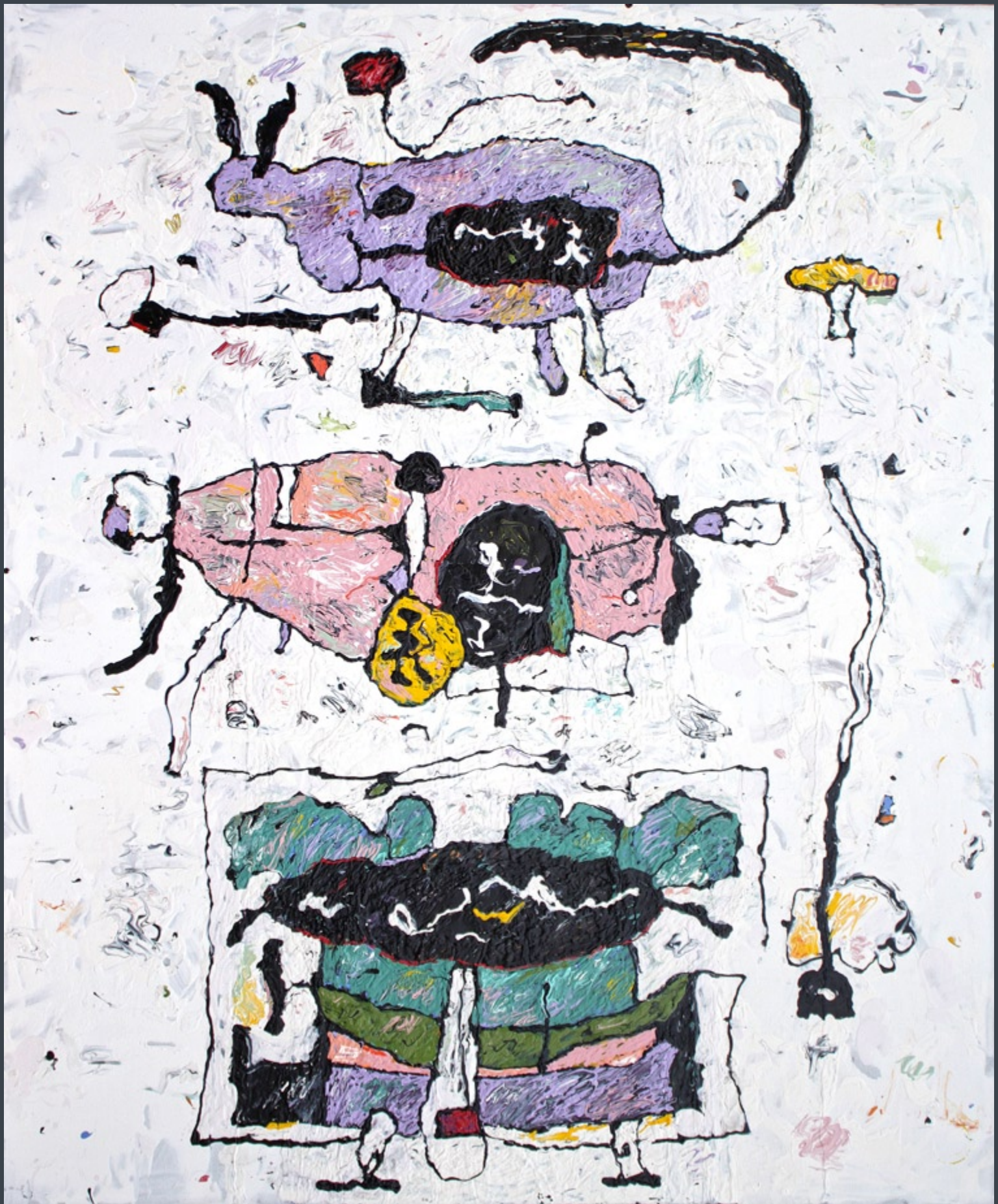
Santa Fe , 2001, acrylic on canvas, 72 X 60 inches