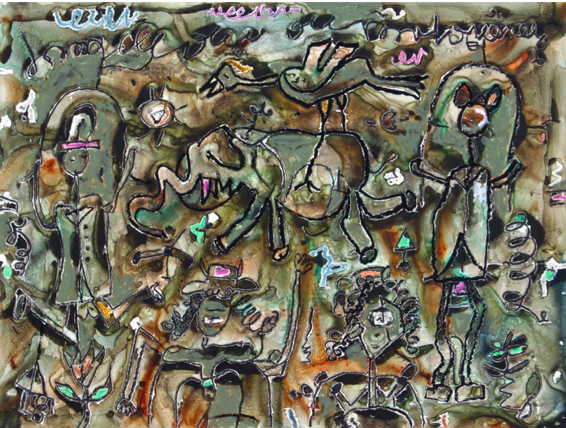
Elephant Song , 2005, mixed media on paper, 26 X 36 inches