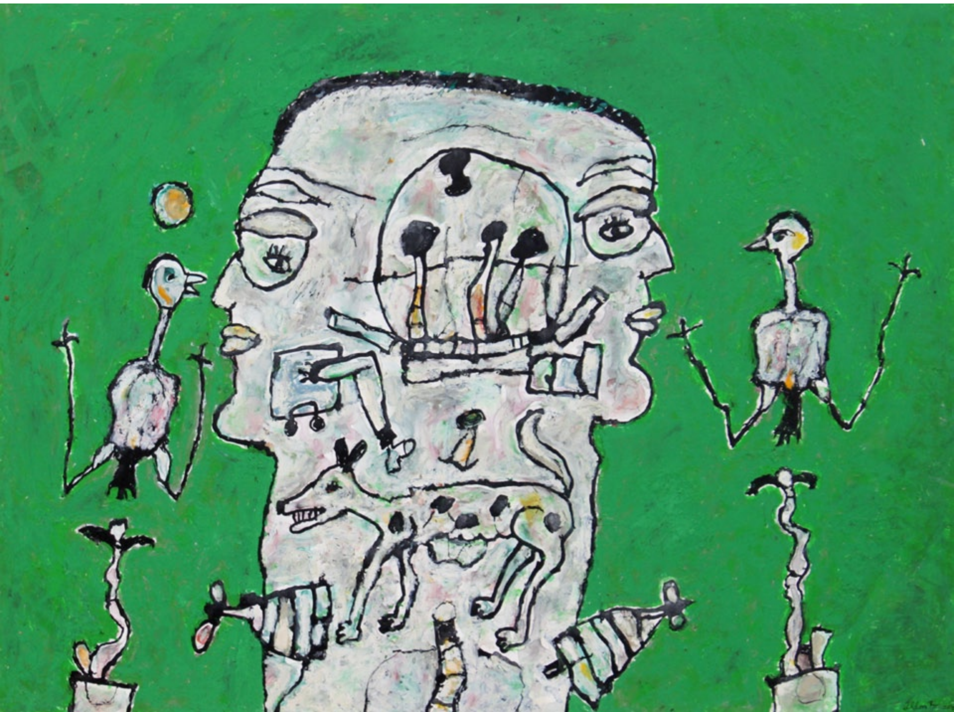
Head Dilemma , 2006, mixed media on paper, 26 X 35 inches