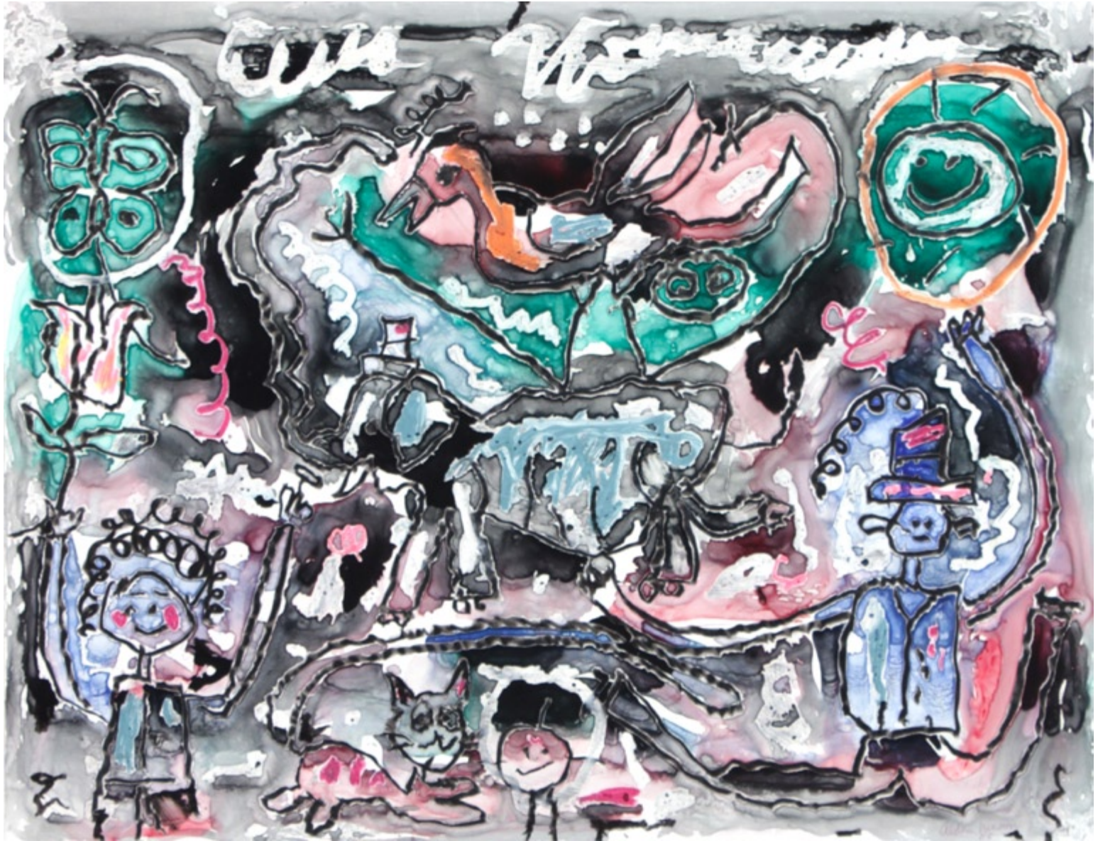
Cat Bird , 2005, mixed media on paper, 20.25 X 26 inches