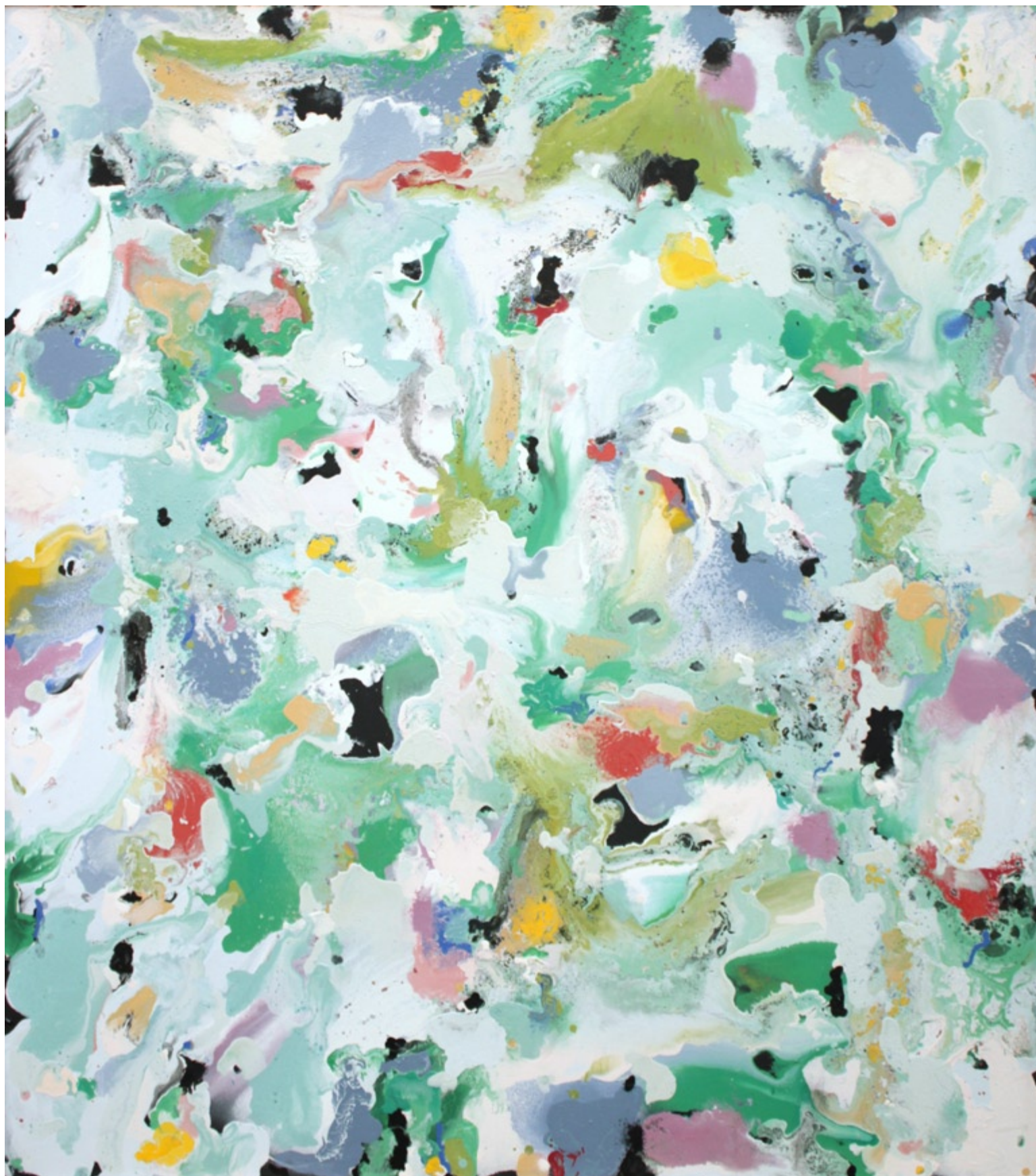
Sky Teaser , 2003, acrylic on canvas, 60 X 53 inches