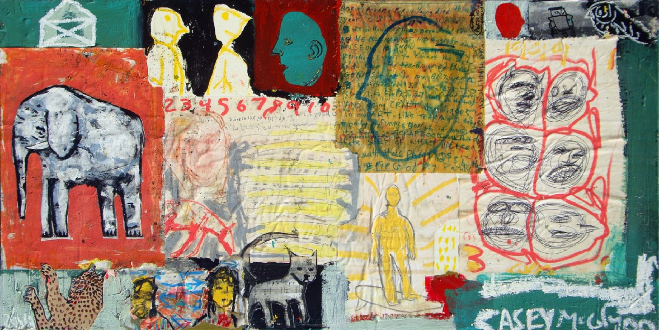
Don't Tell Me Your Life Story 2013 mixed media on canvas 24 x 48 in.