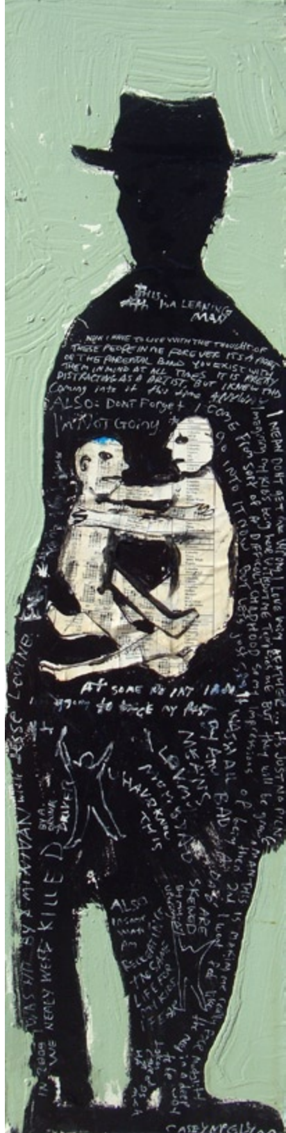
Leaning Man 2013 mixed media on canvas 48 x 12 in.