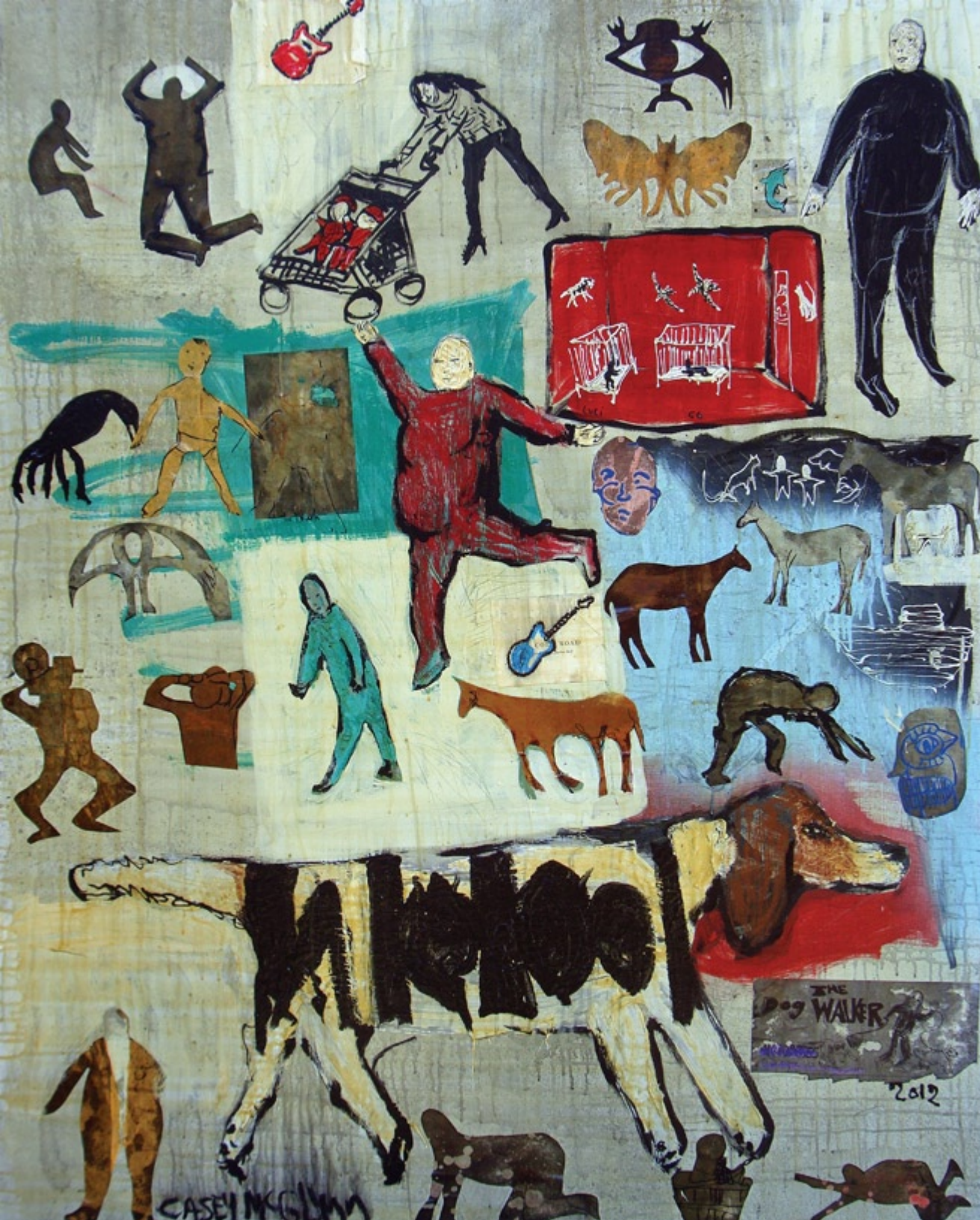
Elegy for the Dog Walker 2012 mixed media 60 x 48 in.