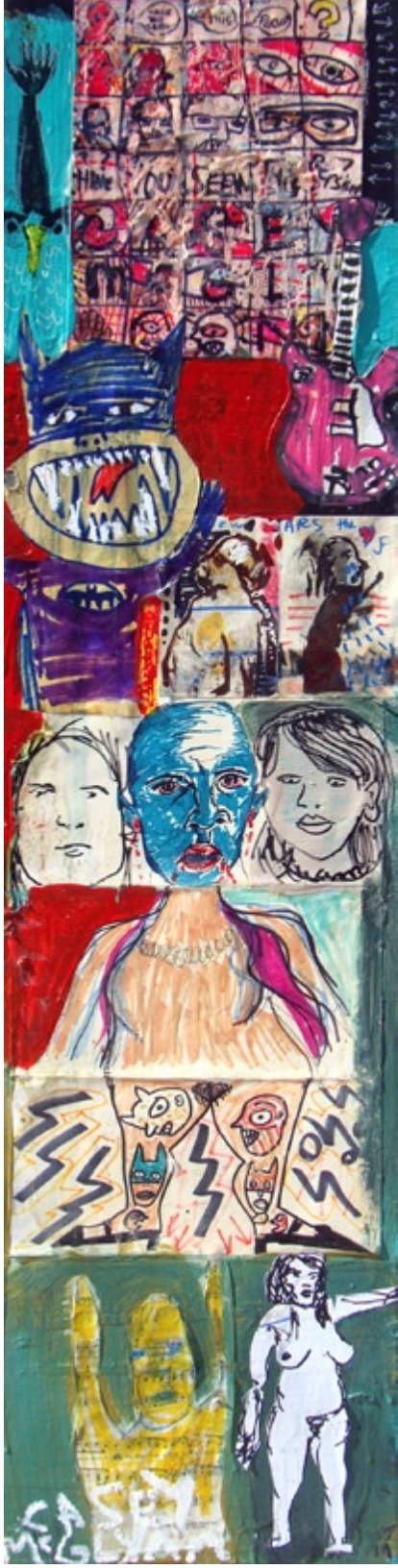
Exquisite Corpse Solitaire 2013 mixed media 48 x 12 in.