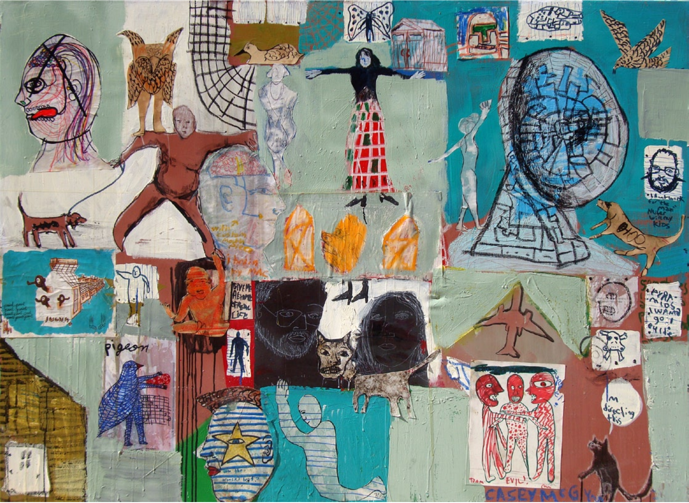
Satellite of Love 2013 mixed media on canvas 48 x 66 in.