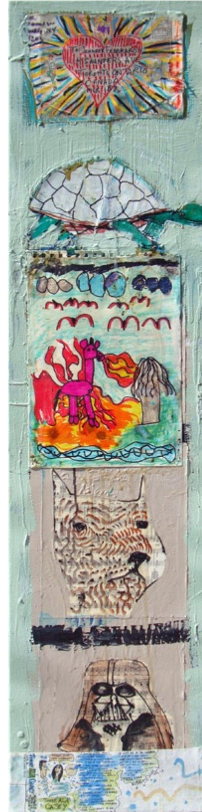
Cat & Turtle All Summer 2013 mixed media on canvas 48 x 12 in.