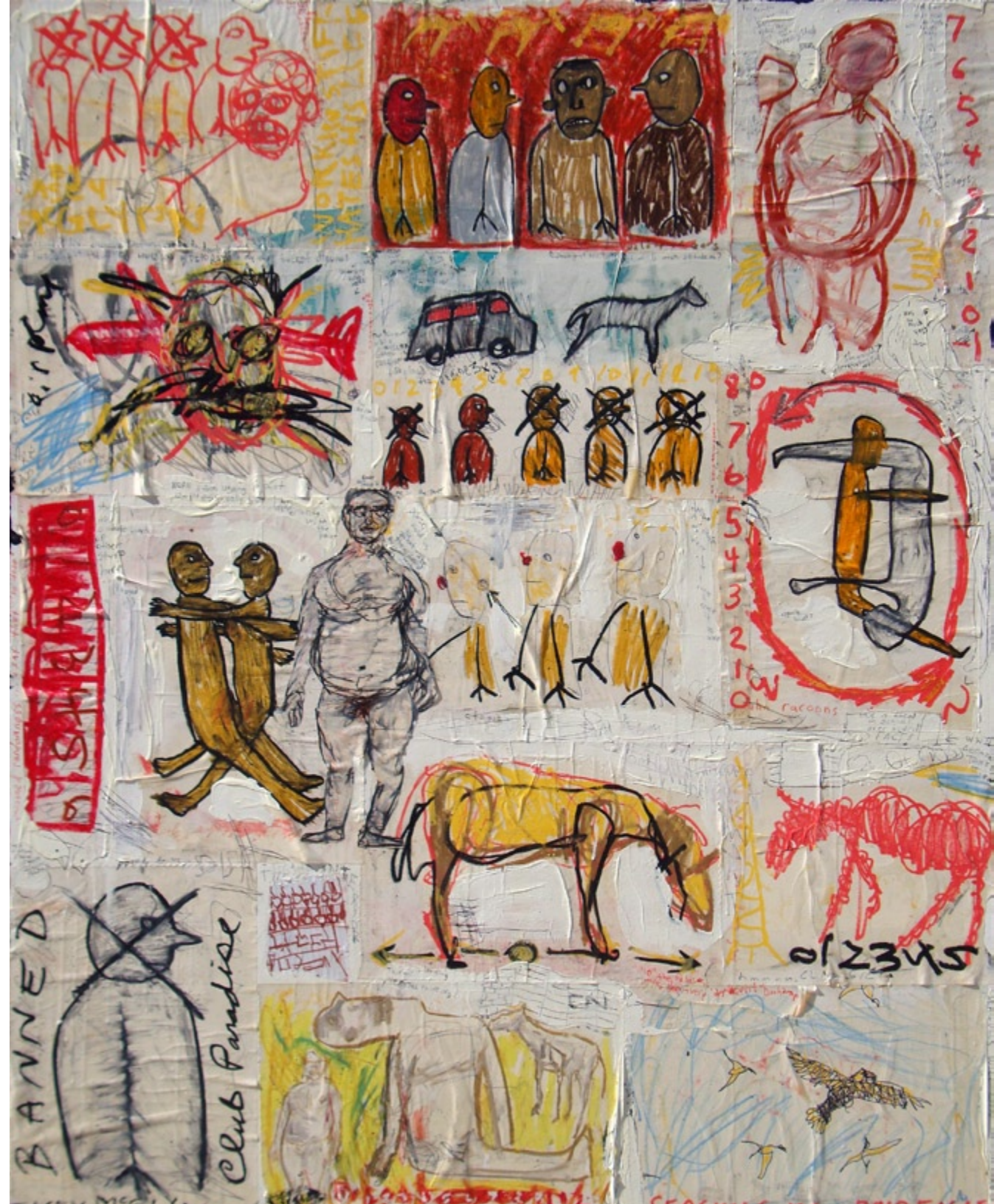
I Was So Much Younger Then 2013 mixed media on canvas 60 x 48 in.