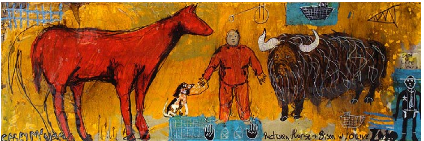
Opposite page: Friendly Dragon, 2010, mixed media on canvas, 36 x 12 in. $1000 Chatty Dragon, 2010, mixed media on canvas, 12 x 36 in. $1000 Between Horse + Bison w/ Olive, 2010, mixed media on canvas, 12 x 36 in. $1000