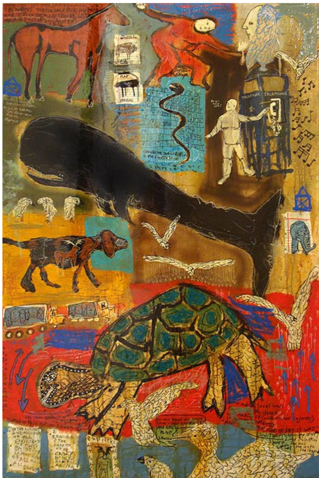
The ocean breathes the sky, the sky breathes the ocean, 2010, mixed media on canvas, 60 x 40 in. $3750 Big Sea (in the Background), 2010, mixed media on canvas & panel 84 x 48 in. $5500 "Turtle makes local news" (allergic to penicillin), 2010, mixed media on canvas, 60 x 40 in. $3750