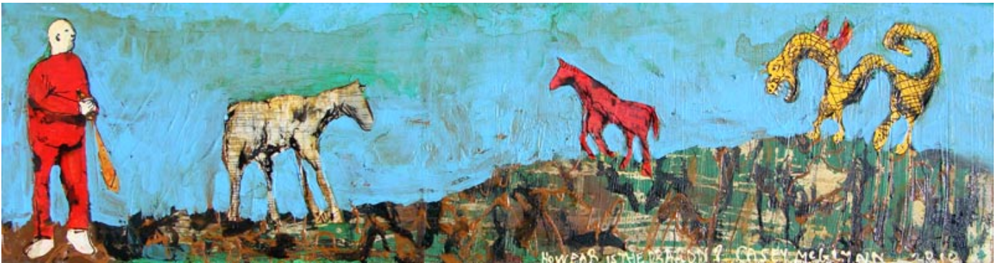
how far is the dragon, 2010, mixed media on canvas 12 x 48 in. $1250