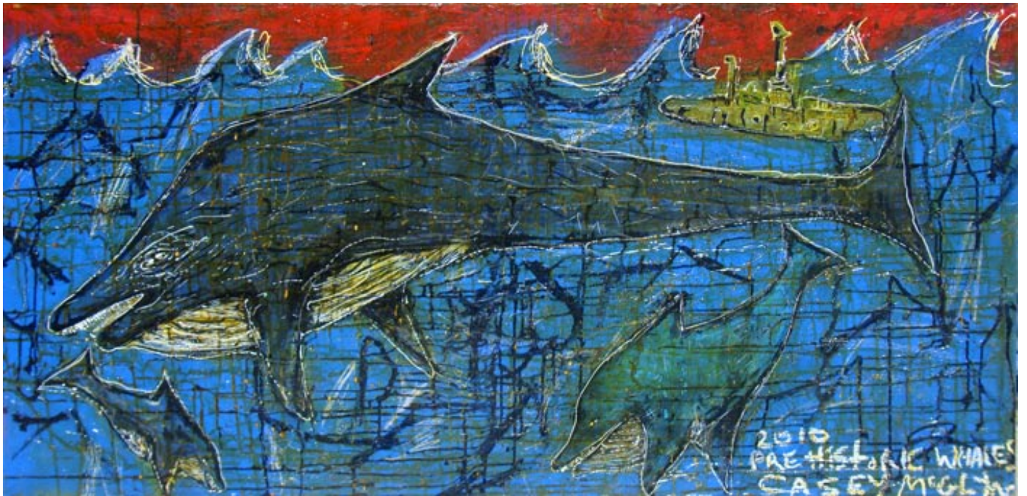
Pre Historic Whales, 2010, mixed media on canvas, 24 x 48 in. $2200