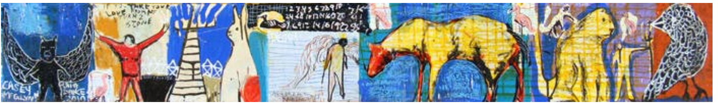
Back: can you do a real raindance?, 2010, mixed media on canvas, 8 x 60 in. $1200

220 THIRD AVENUE SOUTH, 206.622.2833, SEATTLE@FOSTERWHITE.COM EXHIBITIONS ONLINE AT WWW.FOSTERWHITE.COM