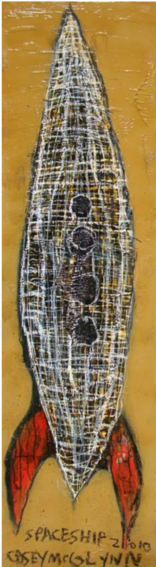
Spaceship, 2010, mixed media on canvas, 48 x 12 in. $1250