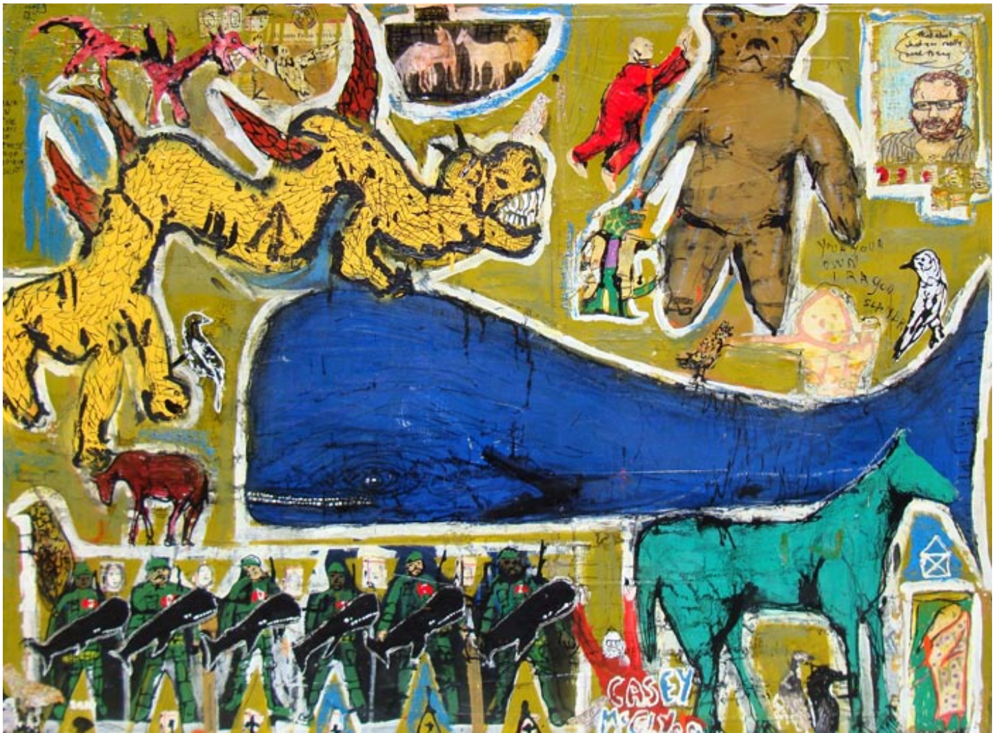
Think about what u Really need 2 say, 2010, mixed media on canvas 36 x 48 in. $2900