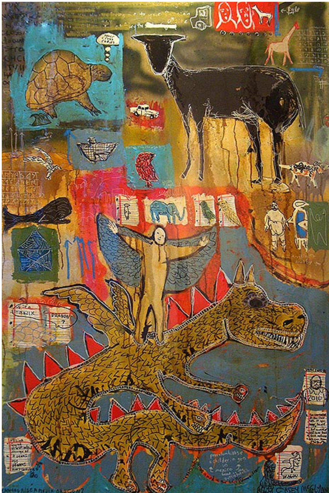
Can you ride a majik dragon?, 2010, mixed media on canvas, 60 x 40 in. $3750