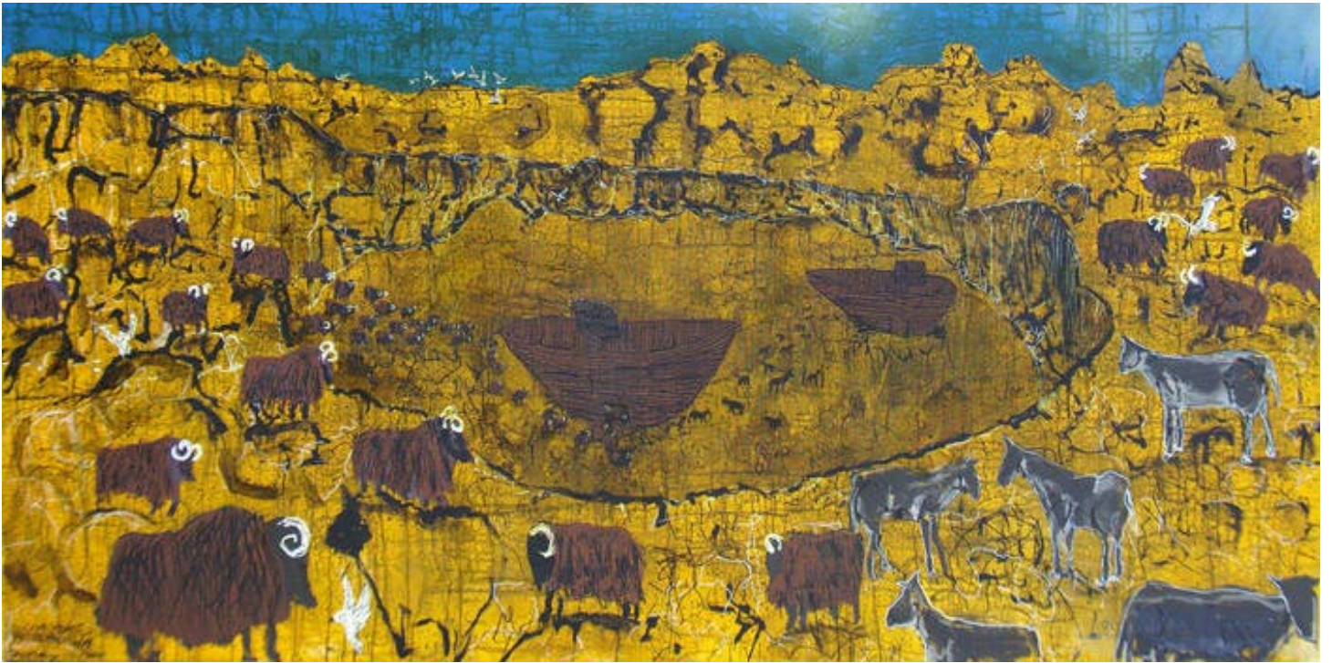
Our Home After the Flood, 2010, mixed media on canvas, 36 x 72 in. $4000