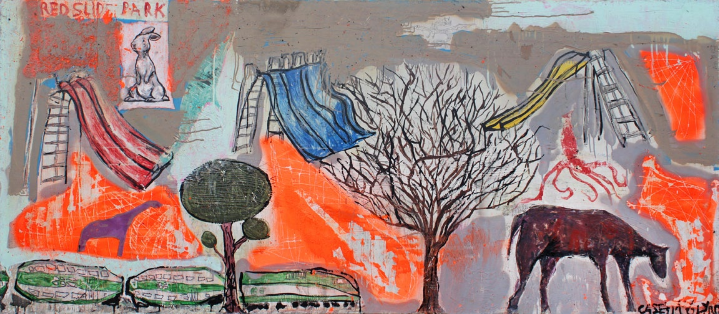
Red Slide Park , mixed media on canvas, 36 x 84 inches