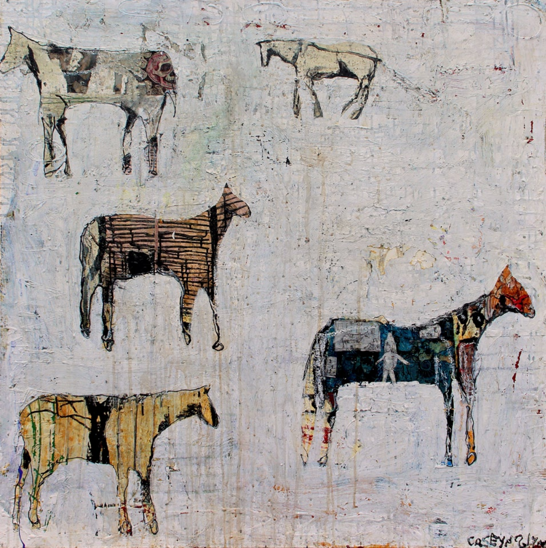
Horse on White, mixed media on canvas, 48 x 48 inches