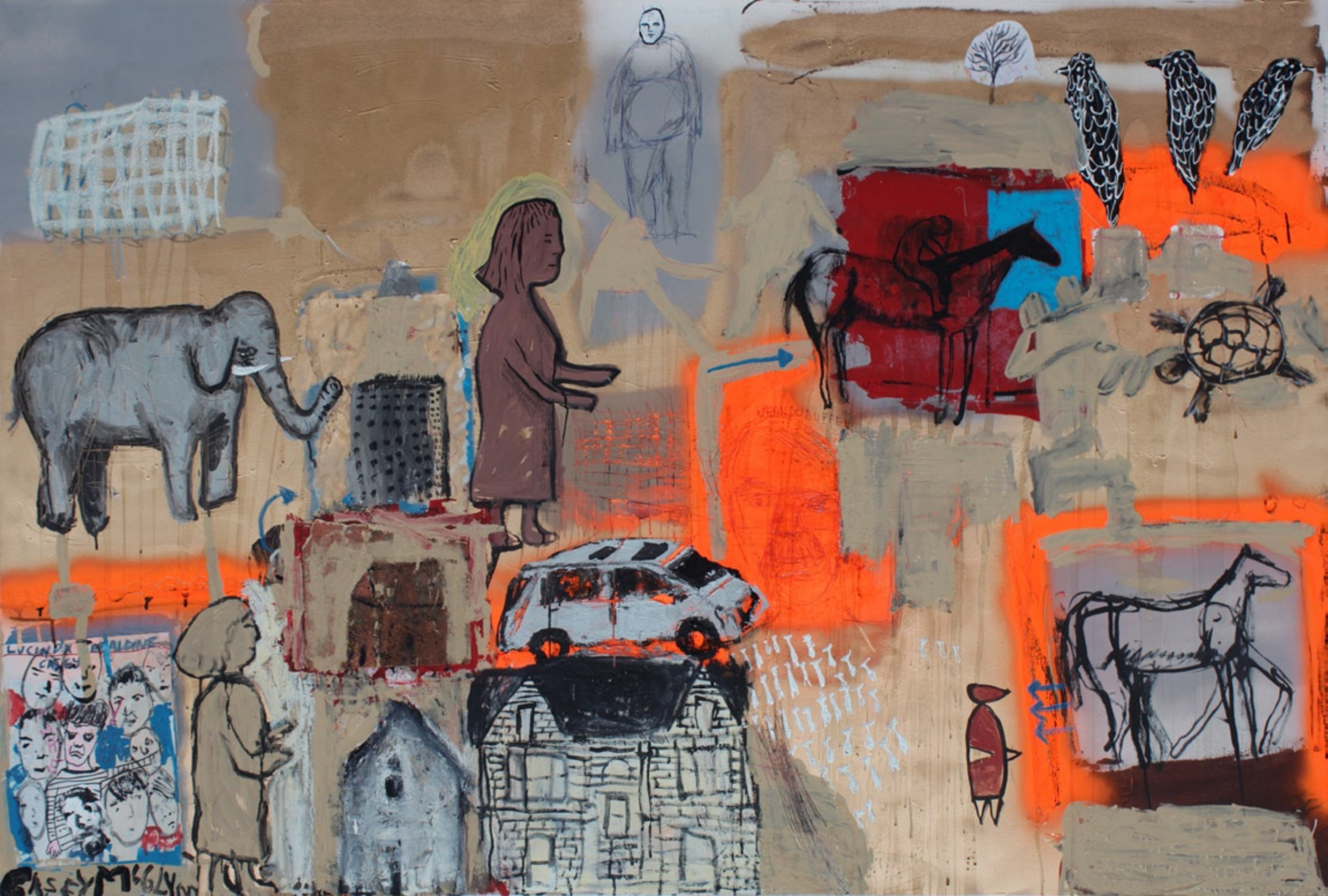
Jean Dubuffet, mixed media on canvas, 48 x 72 inches