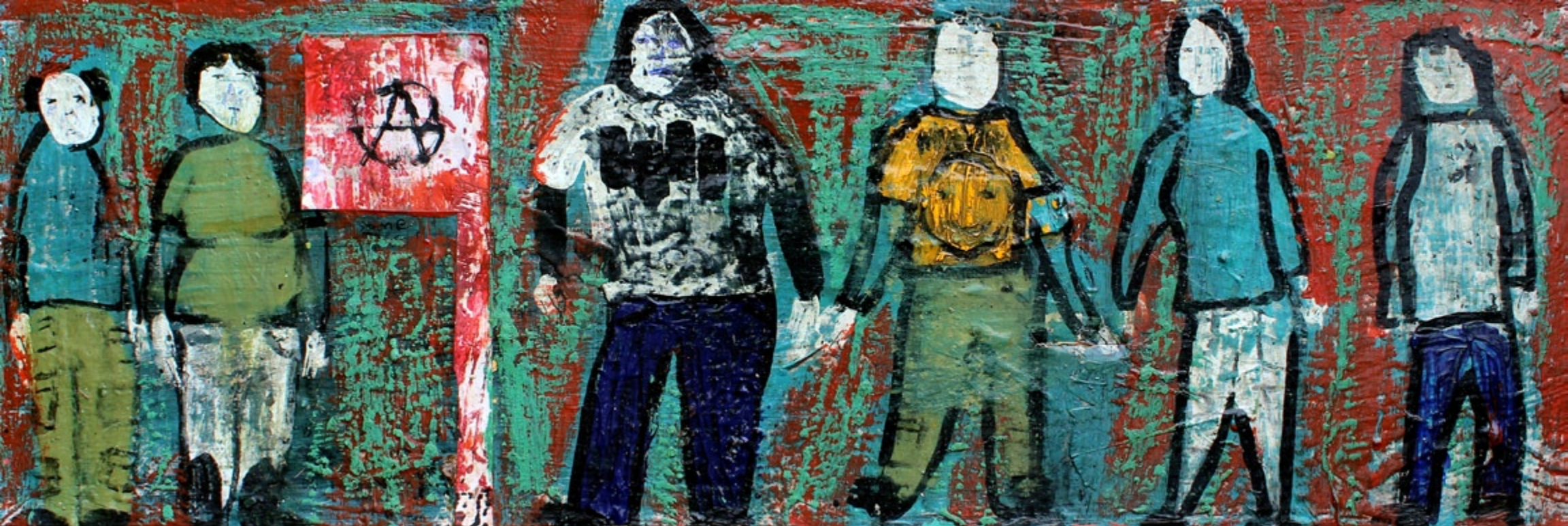
Above: Post Punks , mixed media on canvas, 12 x 36 inches Previous page: Overweight People Who Have Influenced My Life , mixed media on canvas, 60 x 72 inches