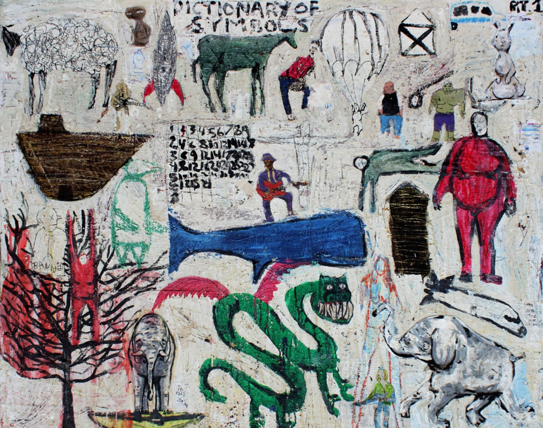
Dictionary of Animals, mixed media on canvas, 48 x 60 inches