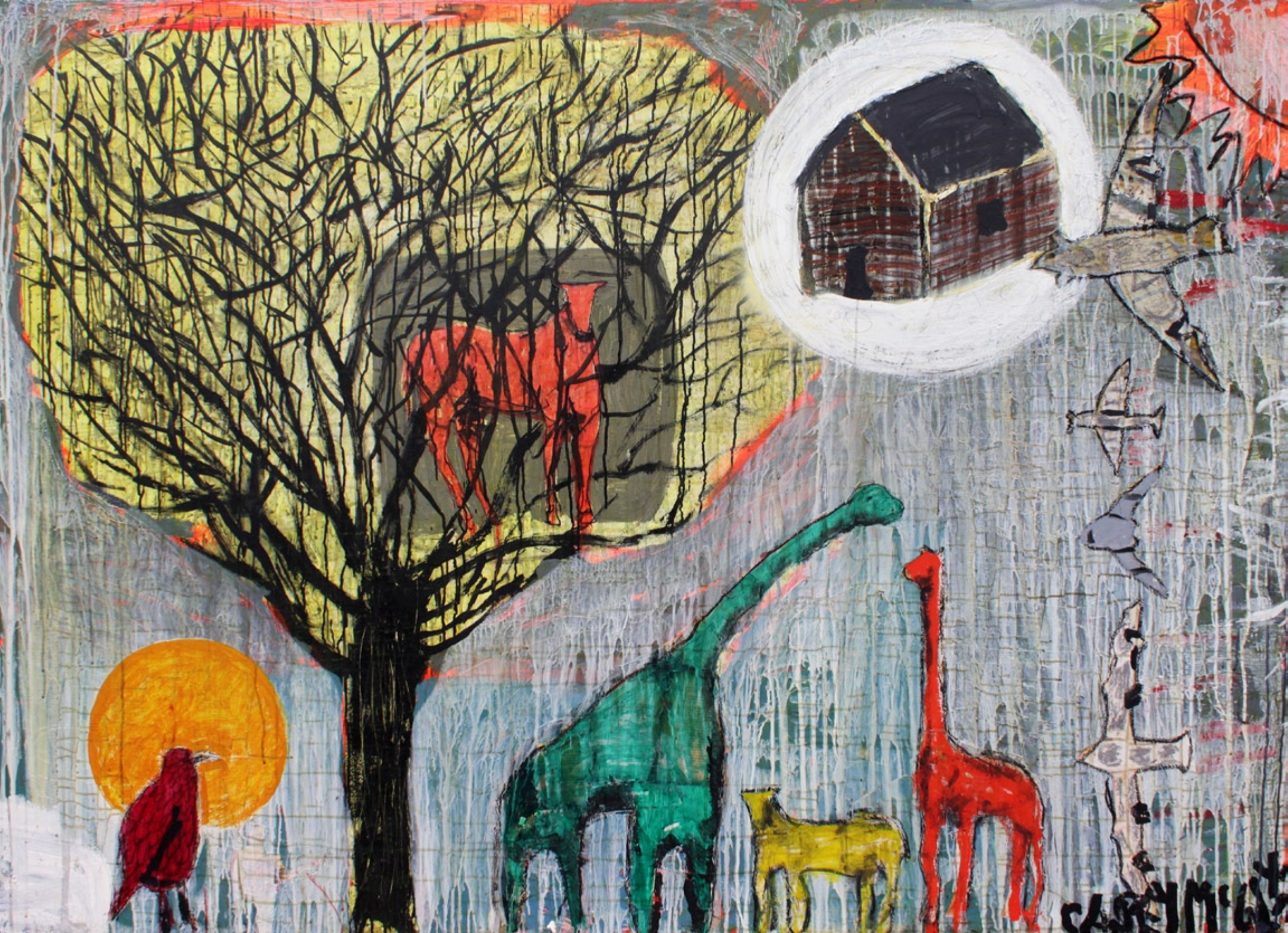
Horse In Tree, House In Sky , mixed media on canvas, 60 x 84 inches