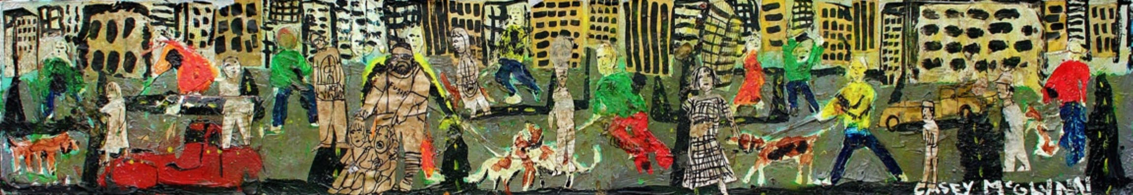
Above: Dog/Baby Walker , mixed media on canvas, 12 x 72 inches Previous page: Canada Punk History Lesson , mixed media on canvas, 60 x 72 inches