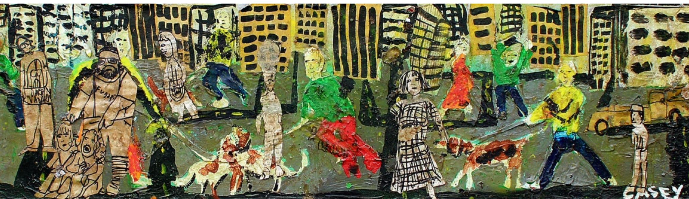
Dog/Baby Walker (detail) , mixed media on canvas, 12 x 72 inches