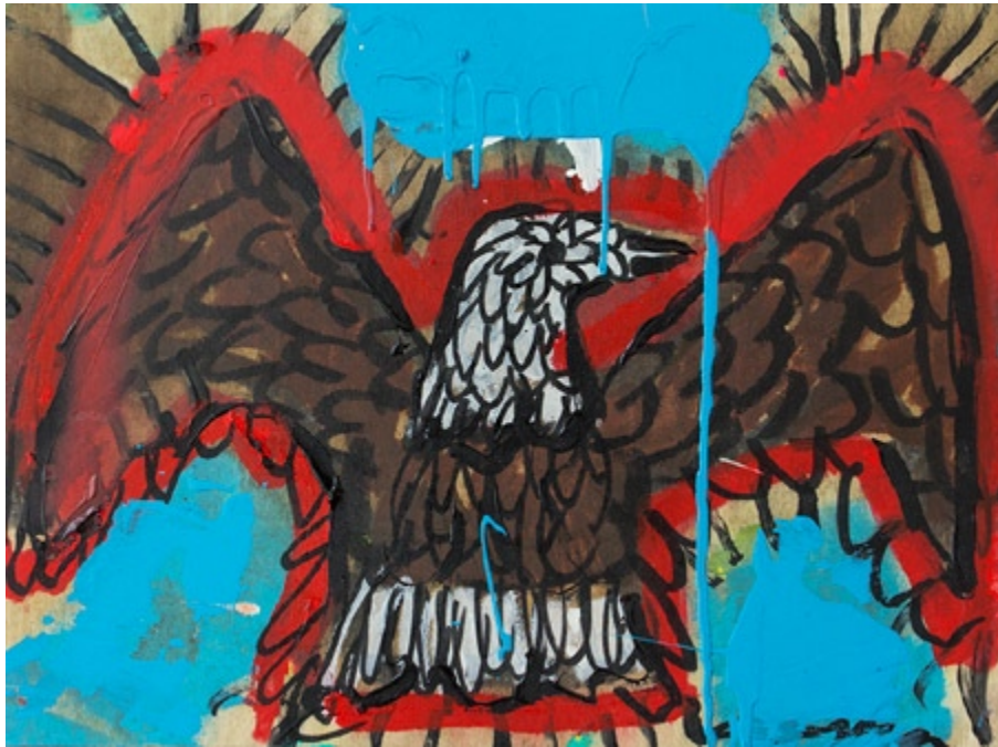
Thunderbird (left) I Will Stay Here For a While (right) mixed media on panel 12 x 16 inches $850