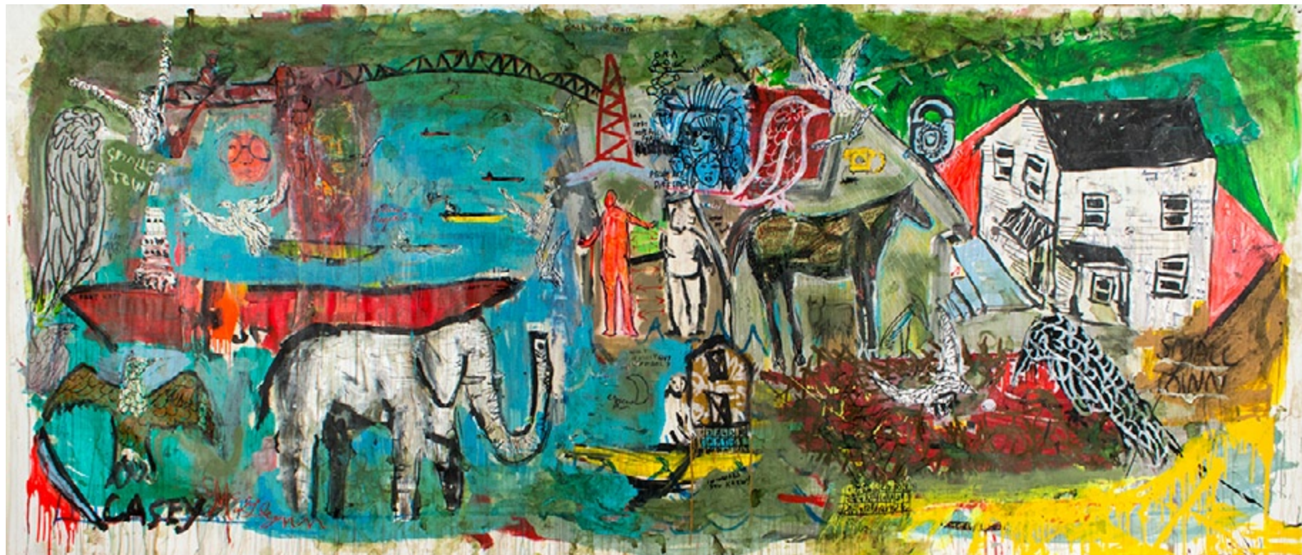
Journey from Sioux Sainte Marie to Tillsonburg 32x mixed media on canvas 69 x 168 inches $19,400