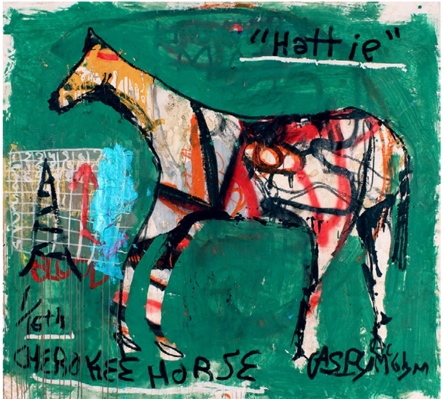
Hattie mixed media on canvas 60 x 69 inches $8,900