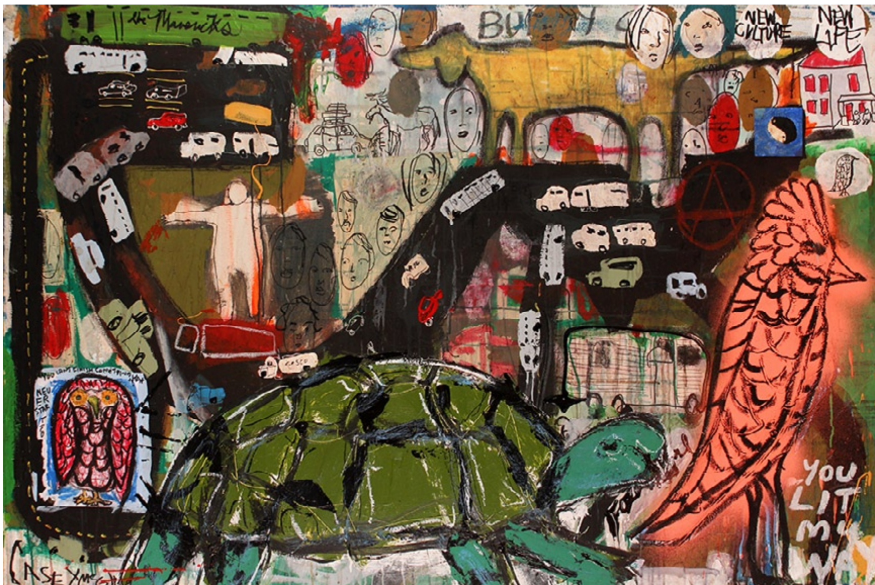
That Time I Saw You mixed media on canvas 48 x 72 inches $7,500