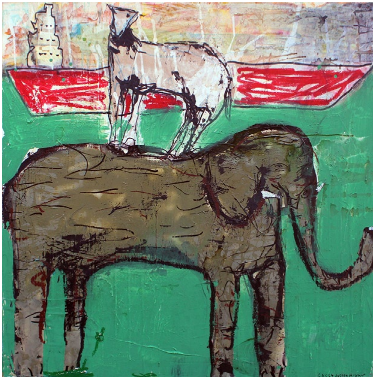
Horse Elephant Freighter mixed media on canvas 44 x 42 inches $4,500