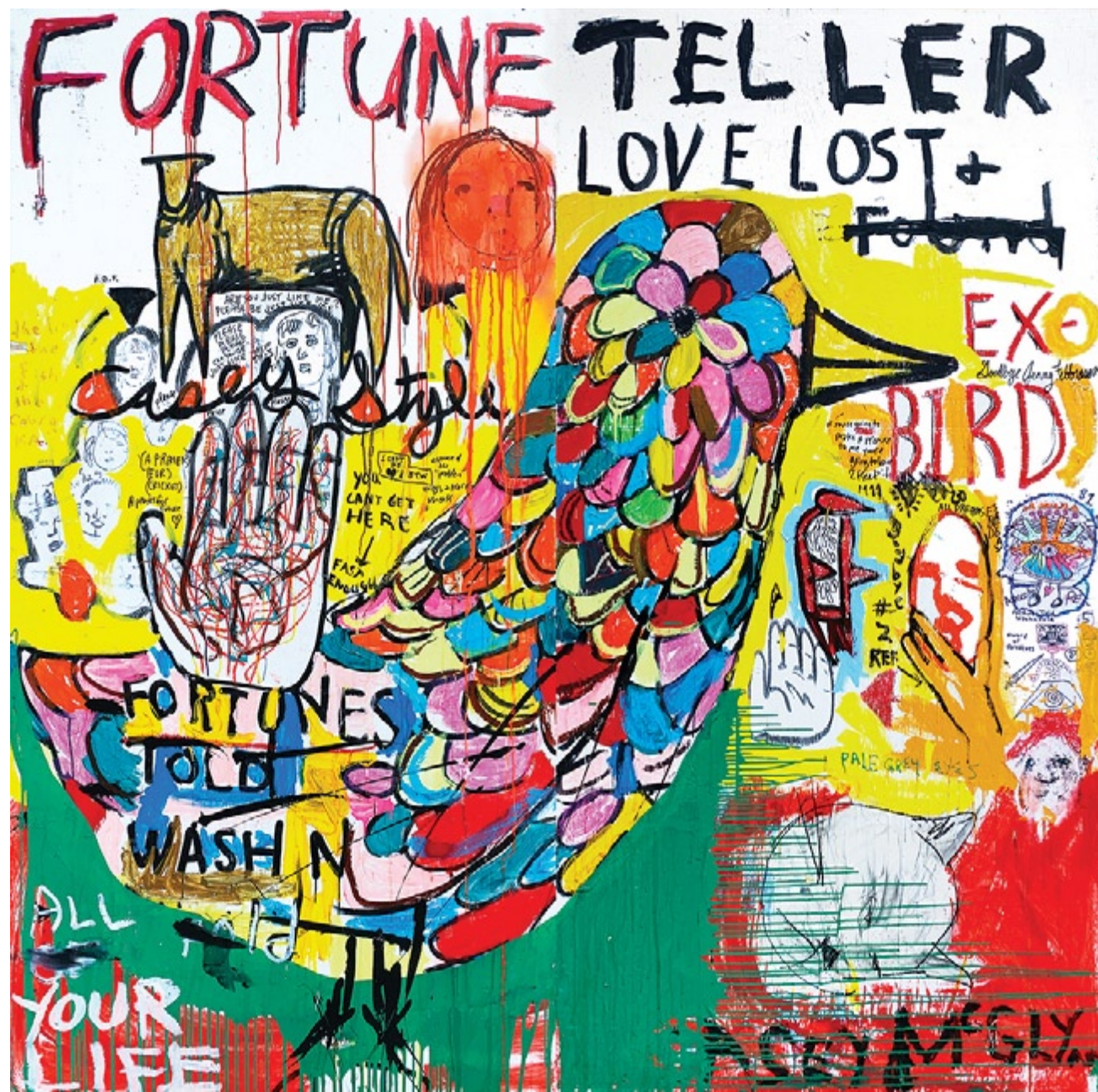
Ex Bird - diptych mixed media on panel 96 x 96 inches $15,800