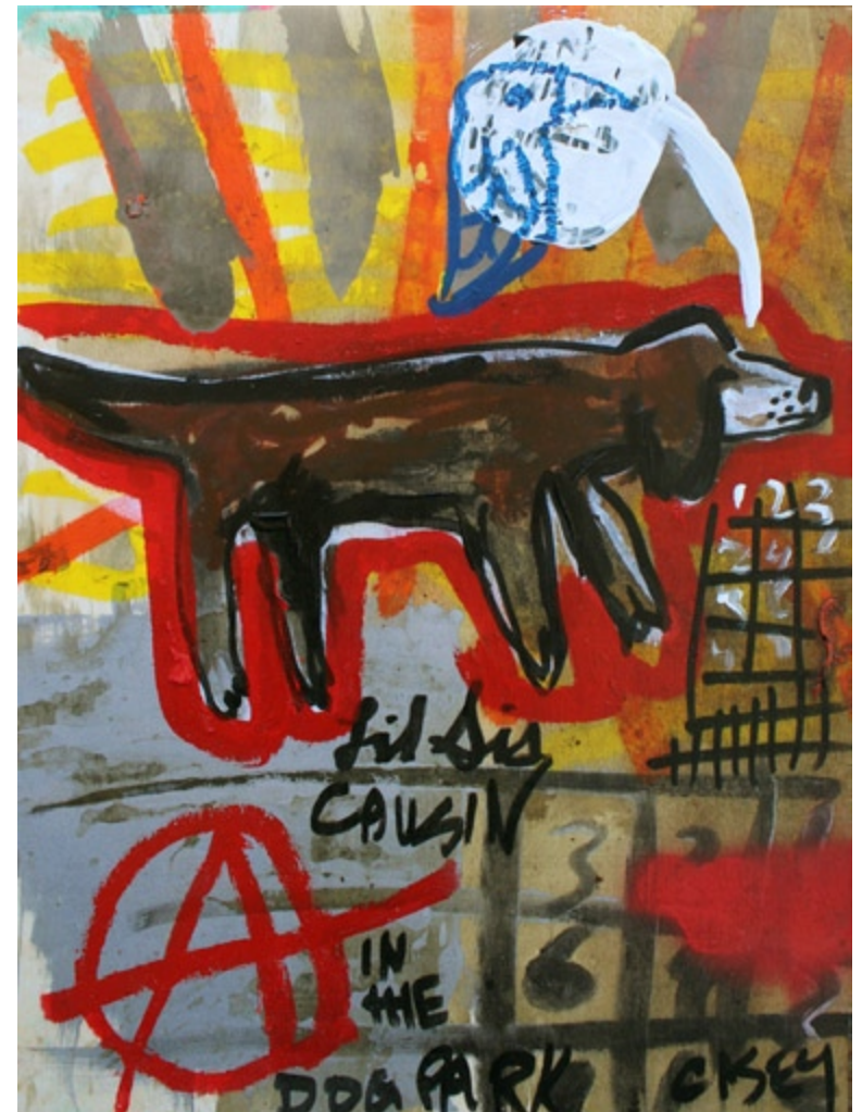
There's More Beauty In You Than Anyone (left)