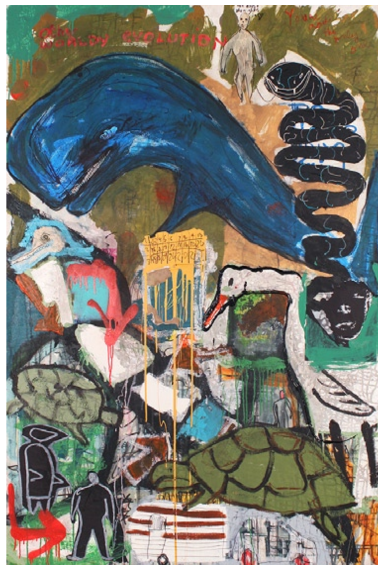
Landing in the Crow's Nest (left) Whale and Duck (right) mixed media on canvas 72 x 48 inches $7,500