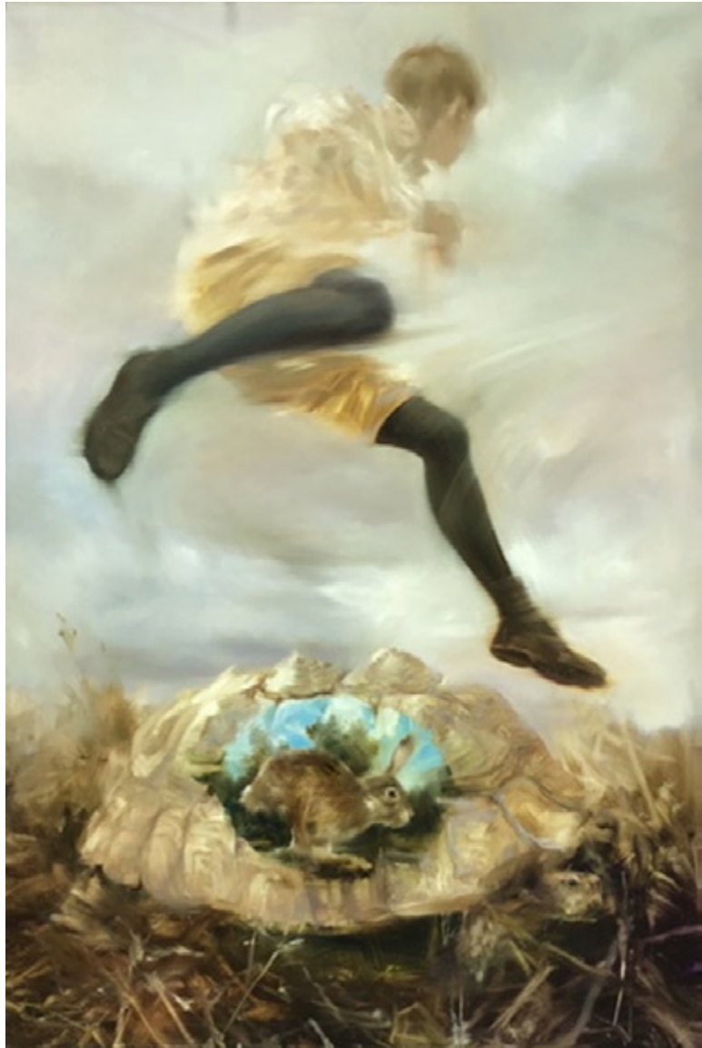
Making Belief (left) Terrapin, Rosin, Brush Fire Fable (left) oil on linen 40 x 60 inches