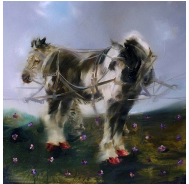
The Guests of Grove of Chestnut, Baseball, Birch Eye View (left) Farming at Night (right) oil on panel 15.5 x 15.5 inches