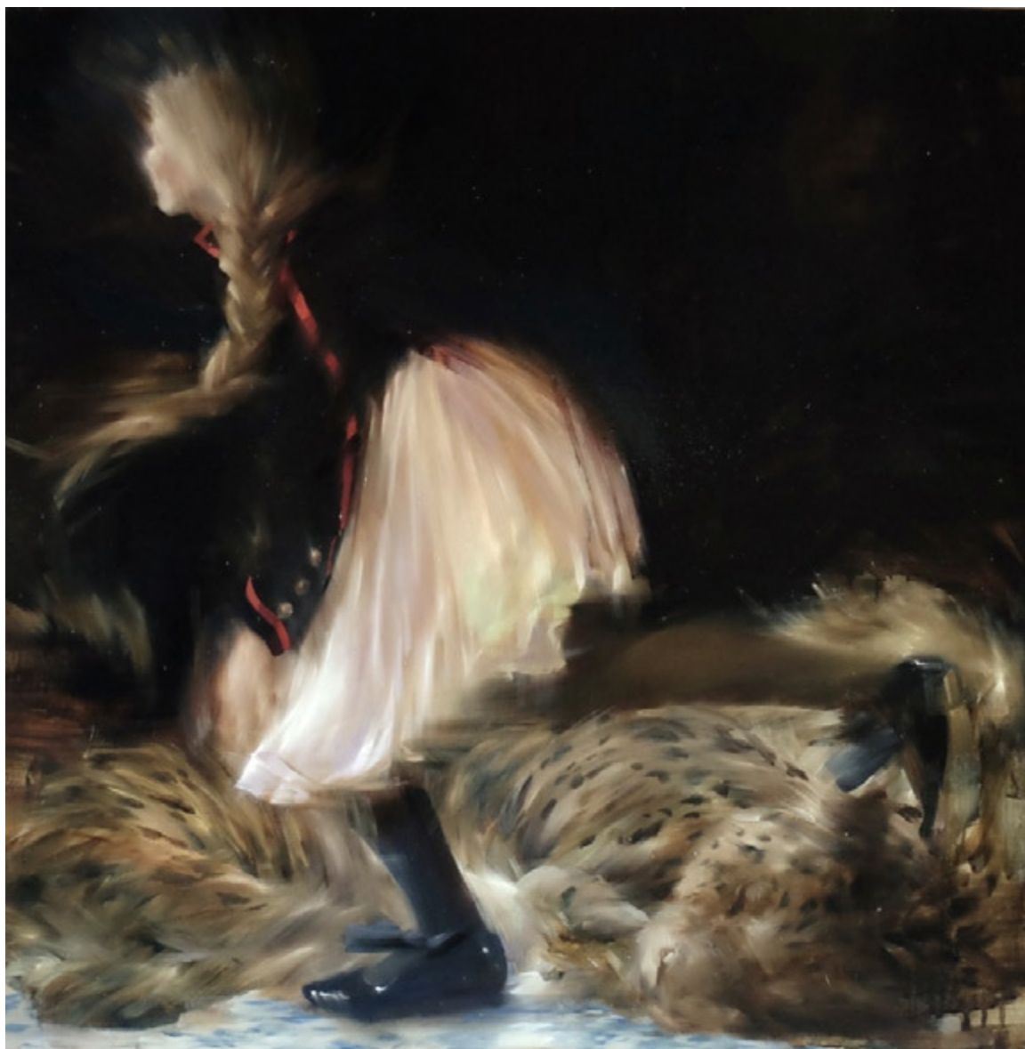
Tailor's Twine and Blue Taffeta Vine oil on linen 33 x 33 inches

SARAH McRAE MORTON | www.fosterwhite.com