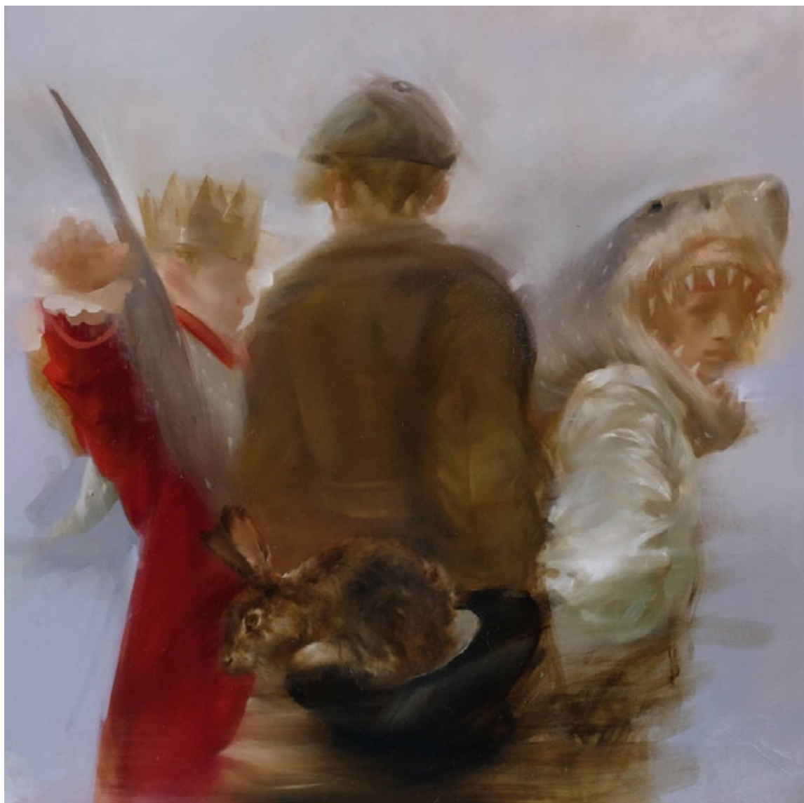
Tooth of the Goldsmith's Son, Steno oil on linen 33 x 33 inches

SARAH McRAE MORTON | www.fosterwhite.com