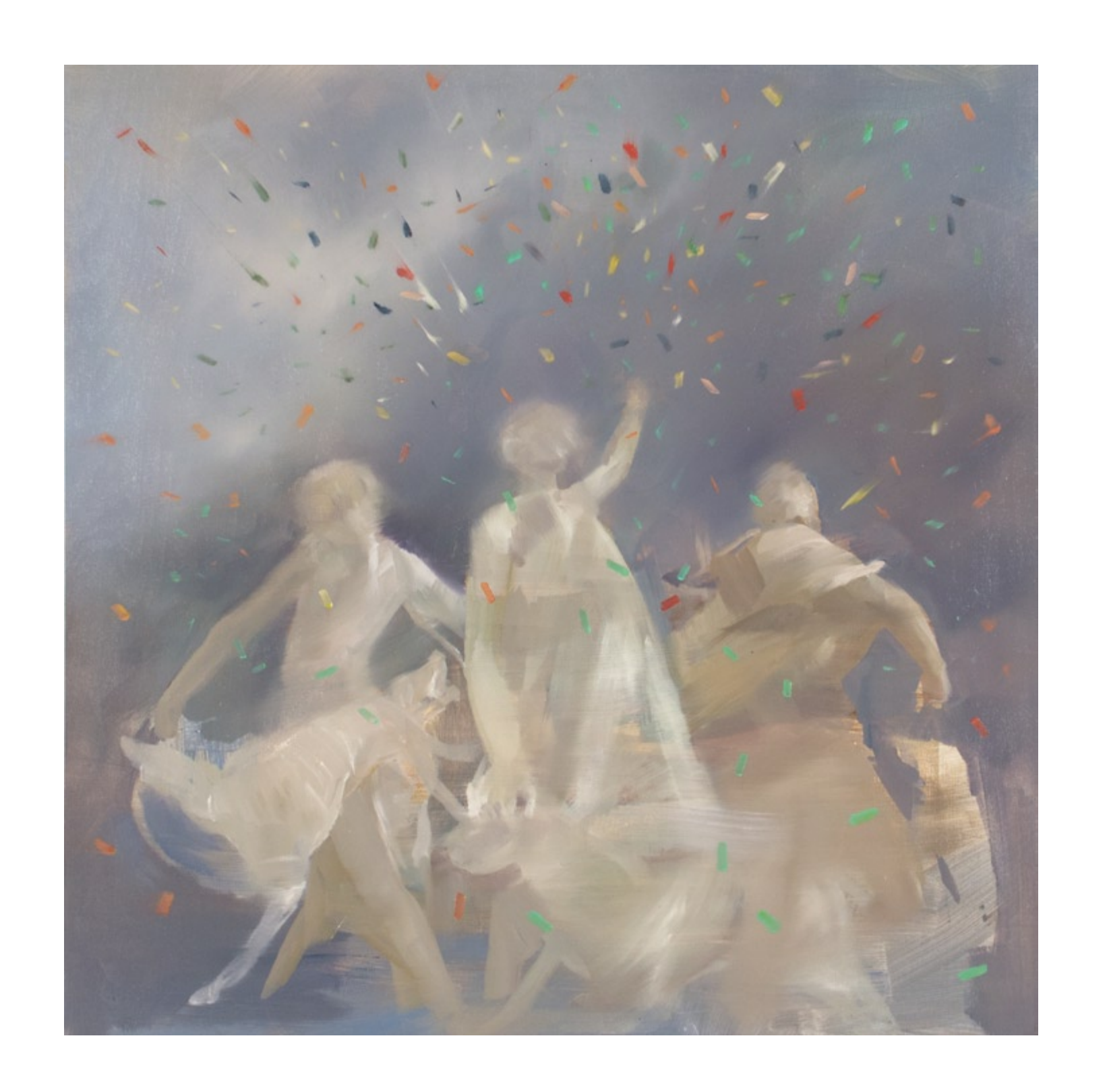
Pippa of the Hunt, oil on board, 23.5 x 23.5 inches