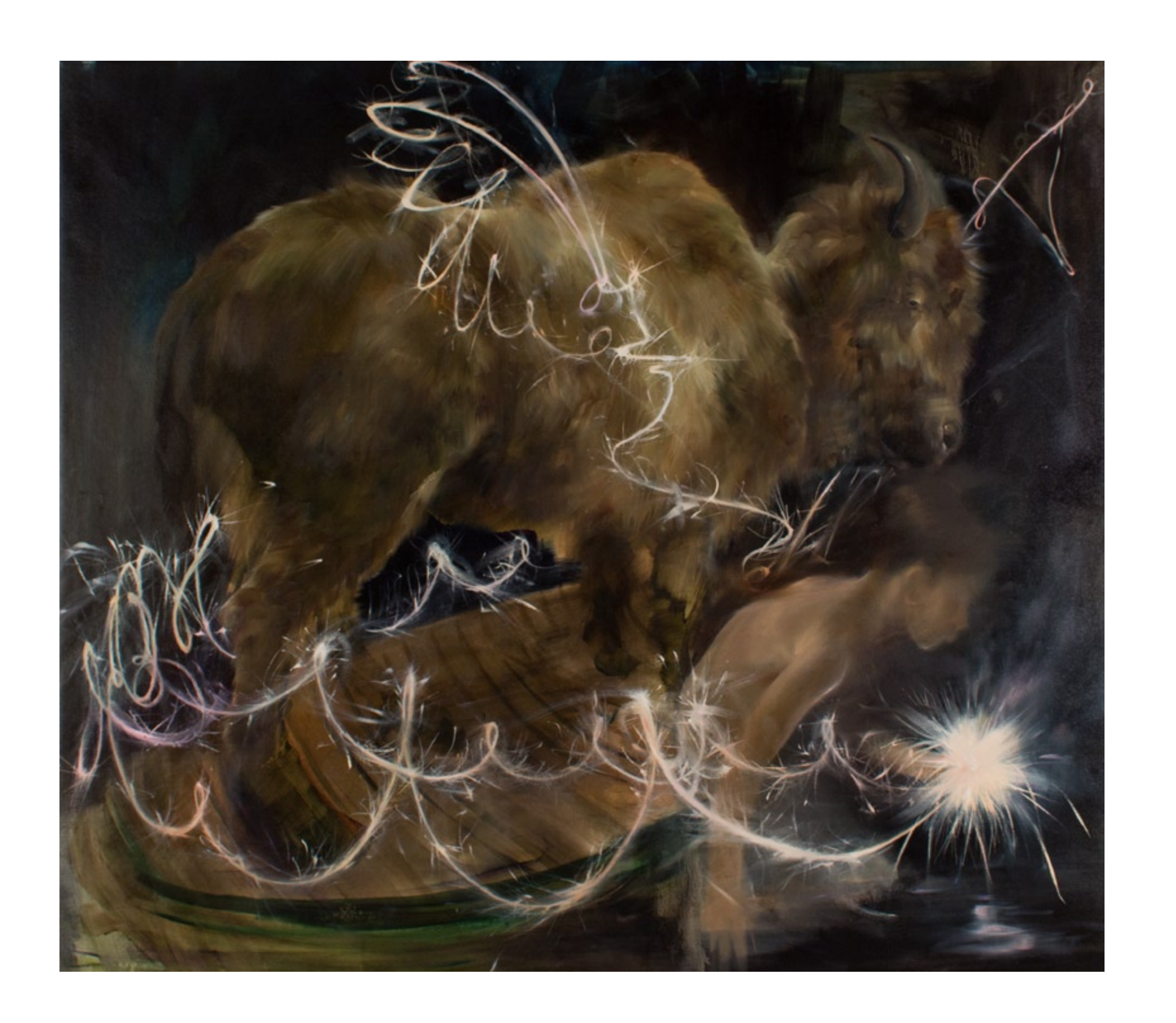
Light Fast and Sugar Footed Fledgling, oil on linen, 44 x 51 inches