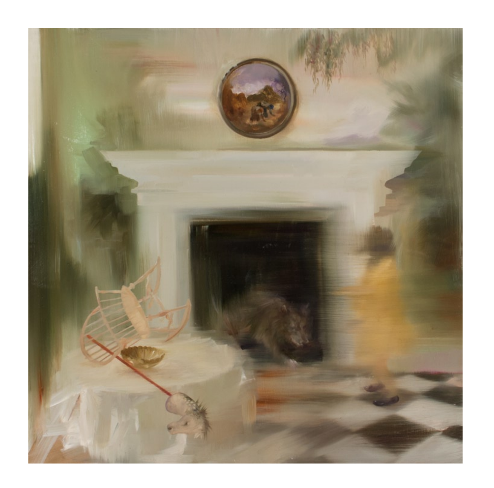
Matchbook, oil on board, 23.5 x 23.5 inches