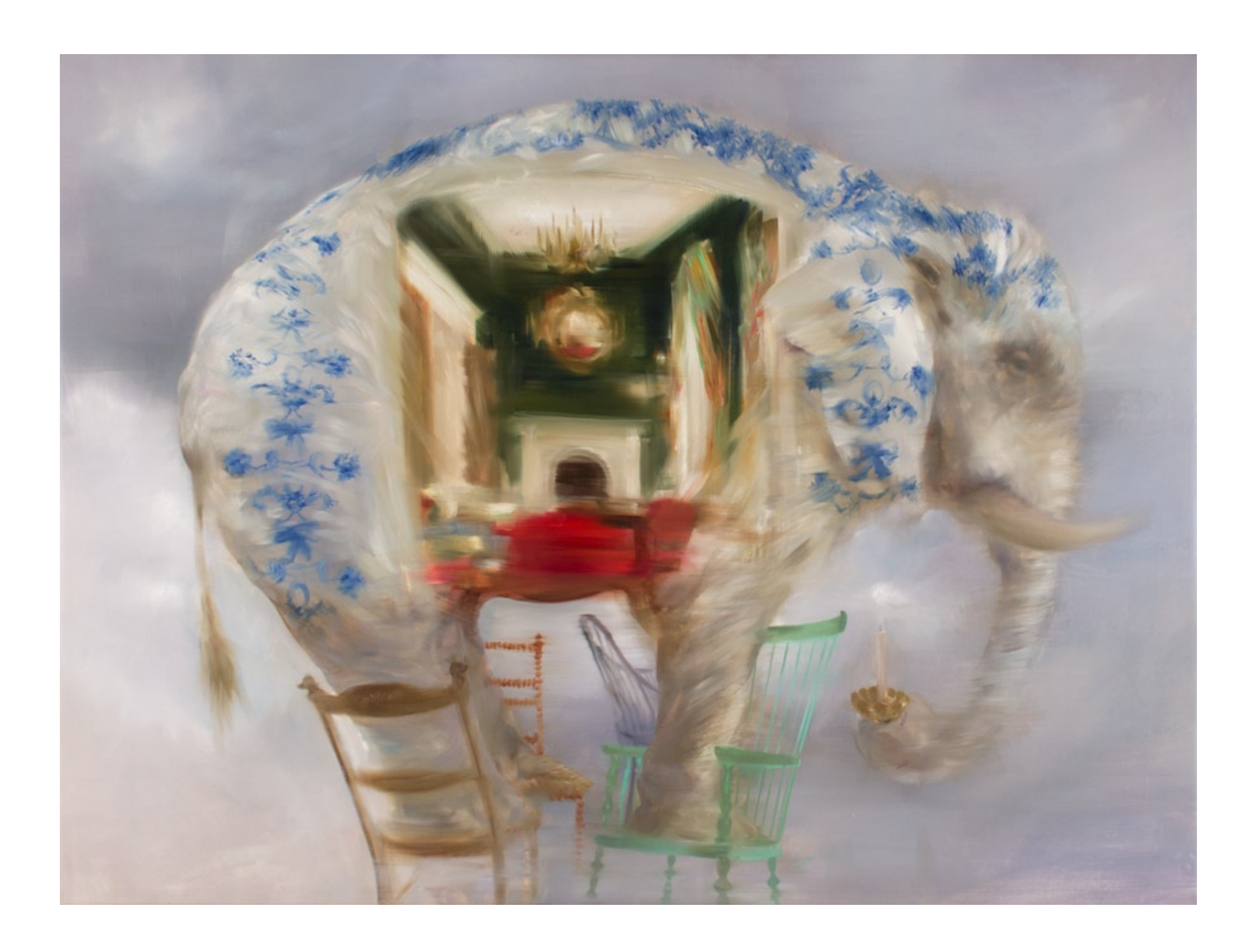
The Drawing Room in the Elephant, oil on linen, 36 x 48 inches