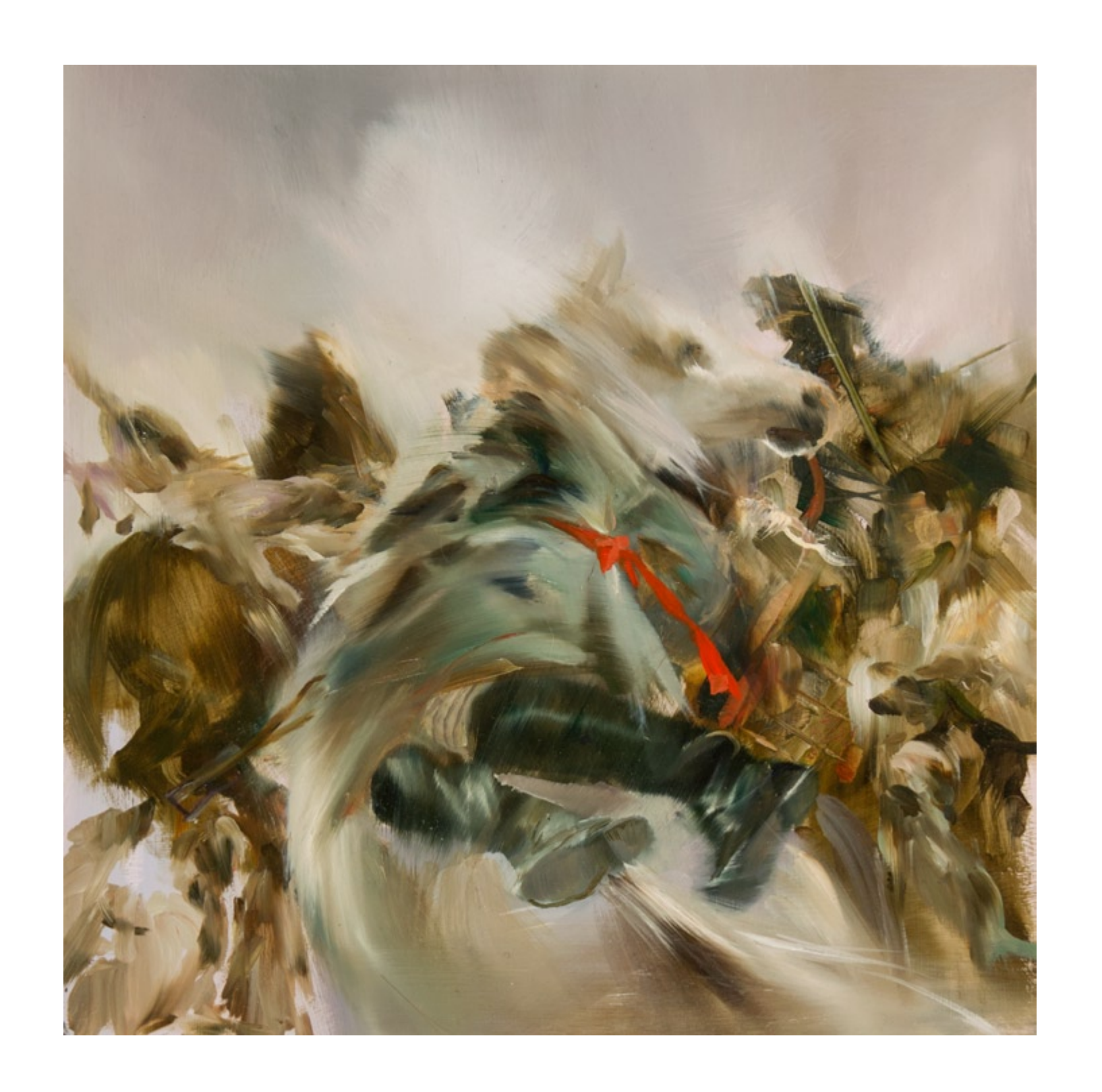
Ludington's Mare, oil on board, 16 x 16 inches