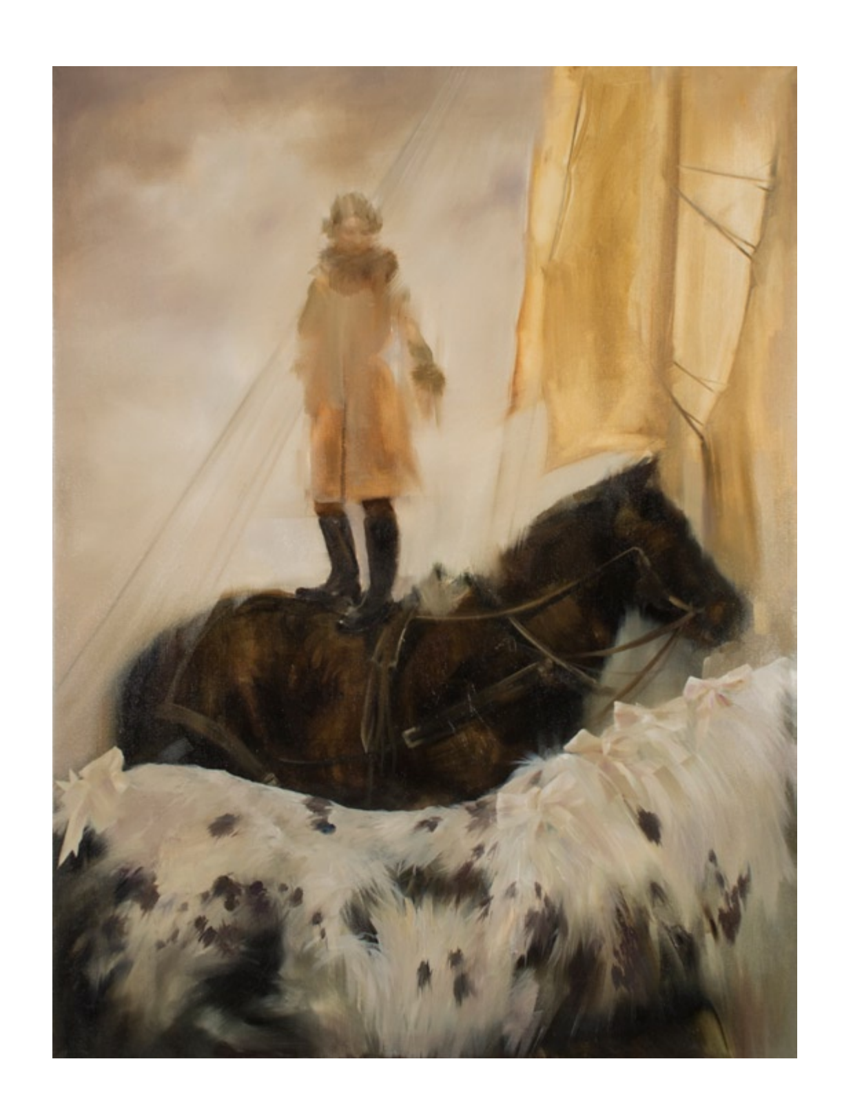
The Bows and the Mast, oil on linen, 40 x 30 inches