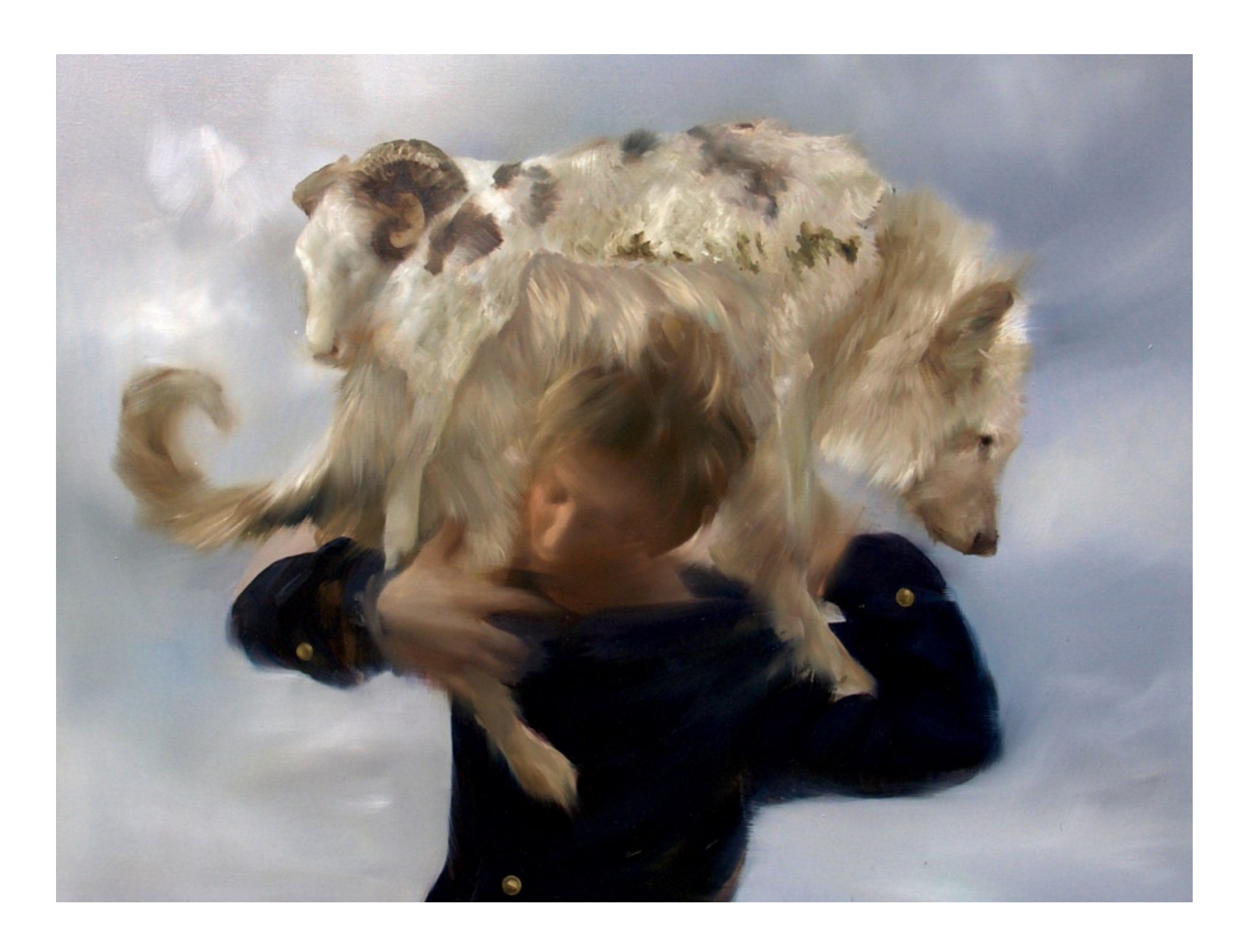
Old Fabled Wolf, oil on linen, 30 x 40 inches