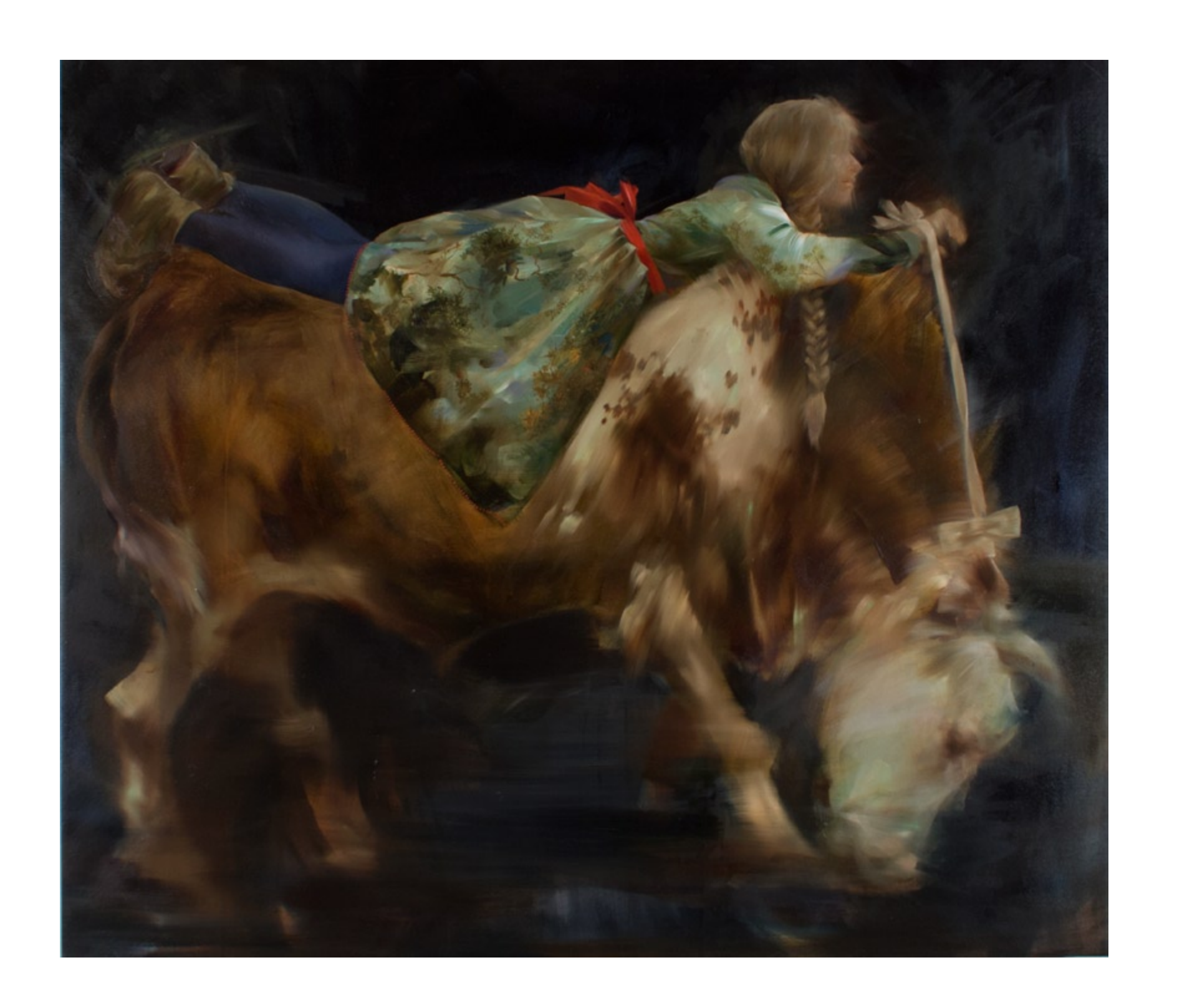
The Dress of the Natural History Myth, oil on linen, 44 x 51 inches