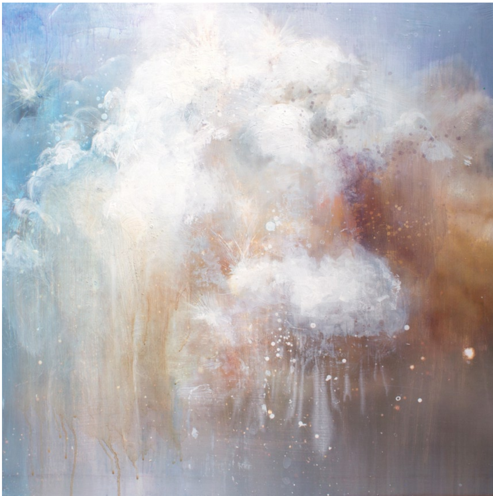
Fireworks 1 , mixed media on panel, 36 X 36 inches