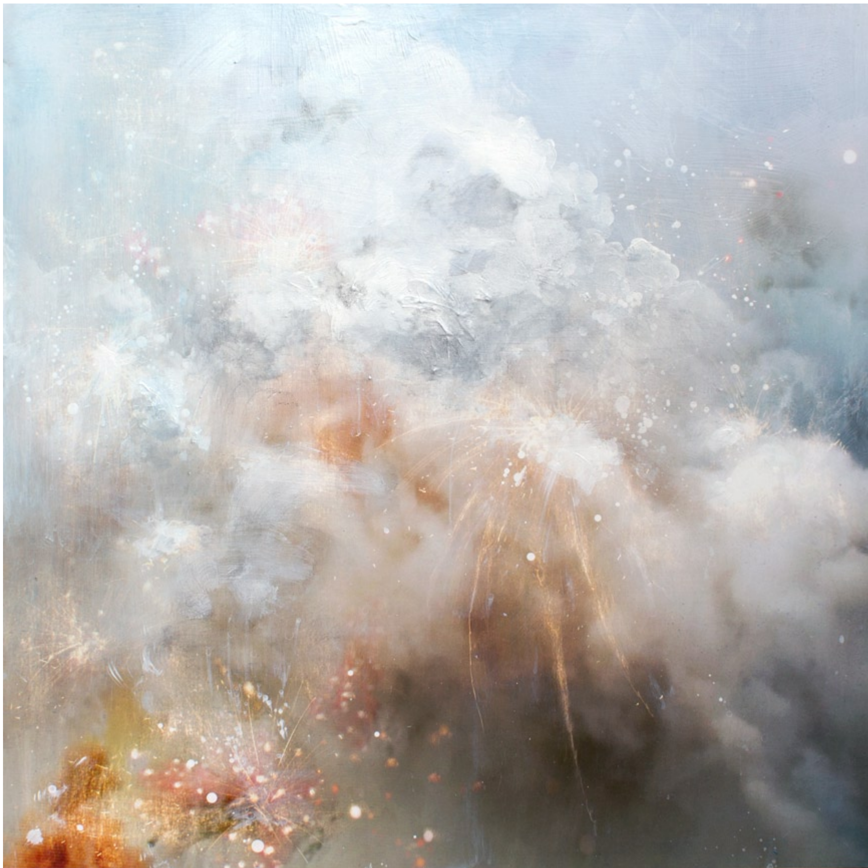
Fireworks 2 , mixed media on panel, 36 X 36 inches