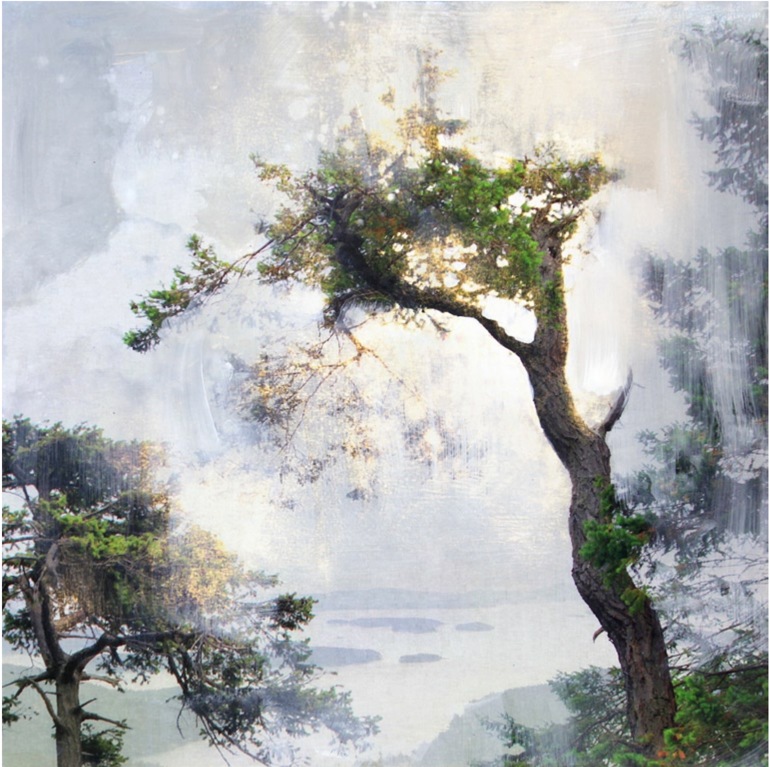
Through The Haze , mixed media on panel, 30 X 30 inches