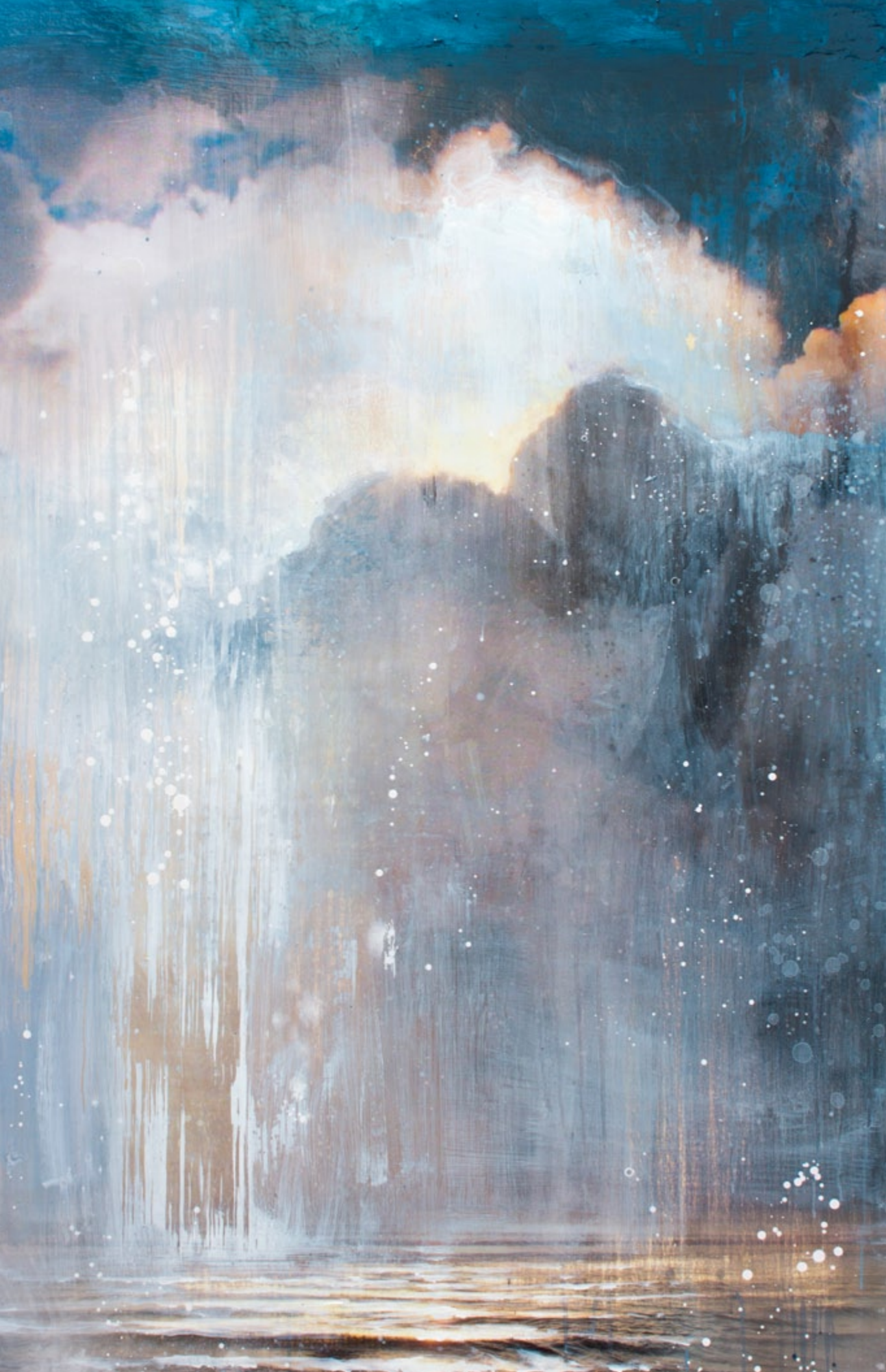
Gold Dust, mixed media on panel, 56 X 36 inches