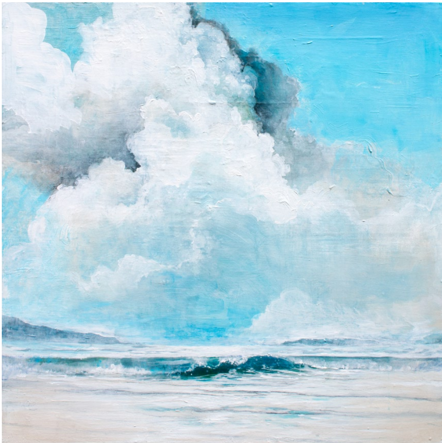
Calm Sea , mixed media on panel, 42 X 42 inches