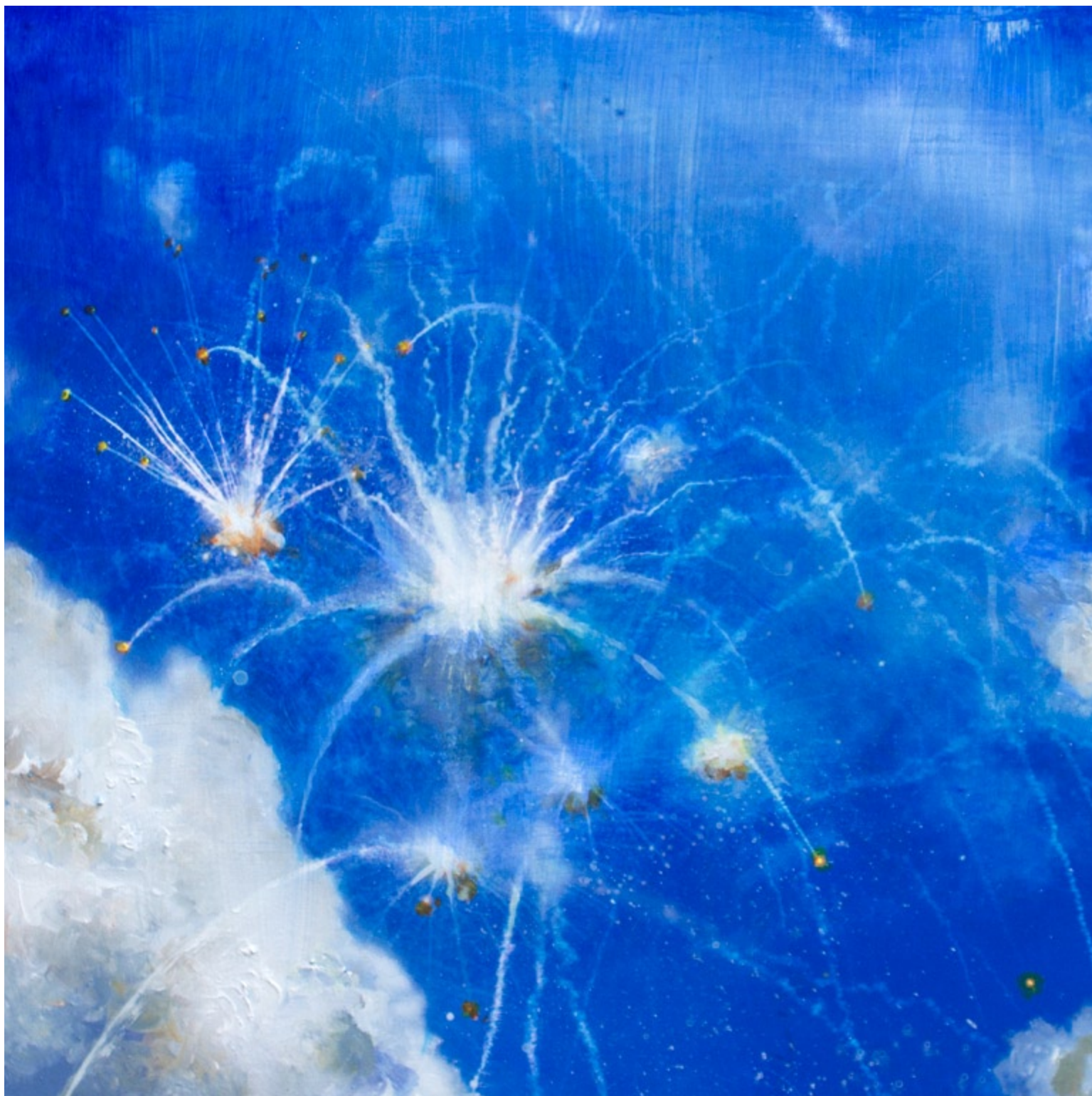
Fire In The Sky 1 , mixed media on panel, 24 X 24 inches