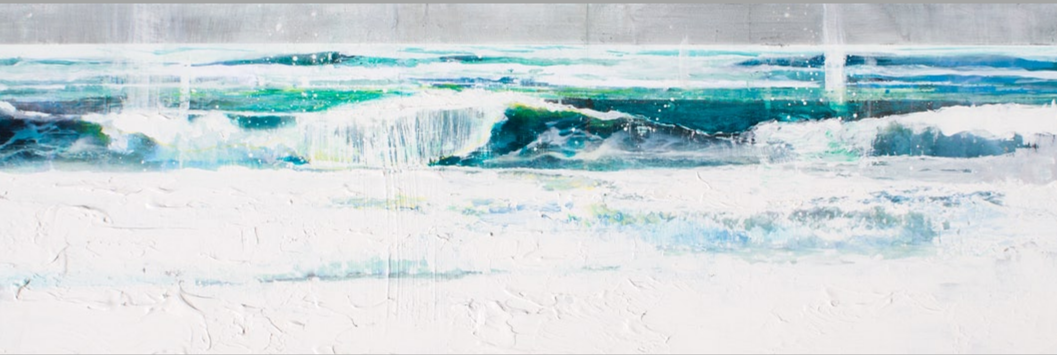
Waves Of Jade , mixed media on panel, 24 X 72 inches