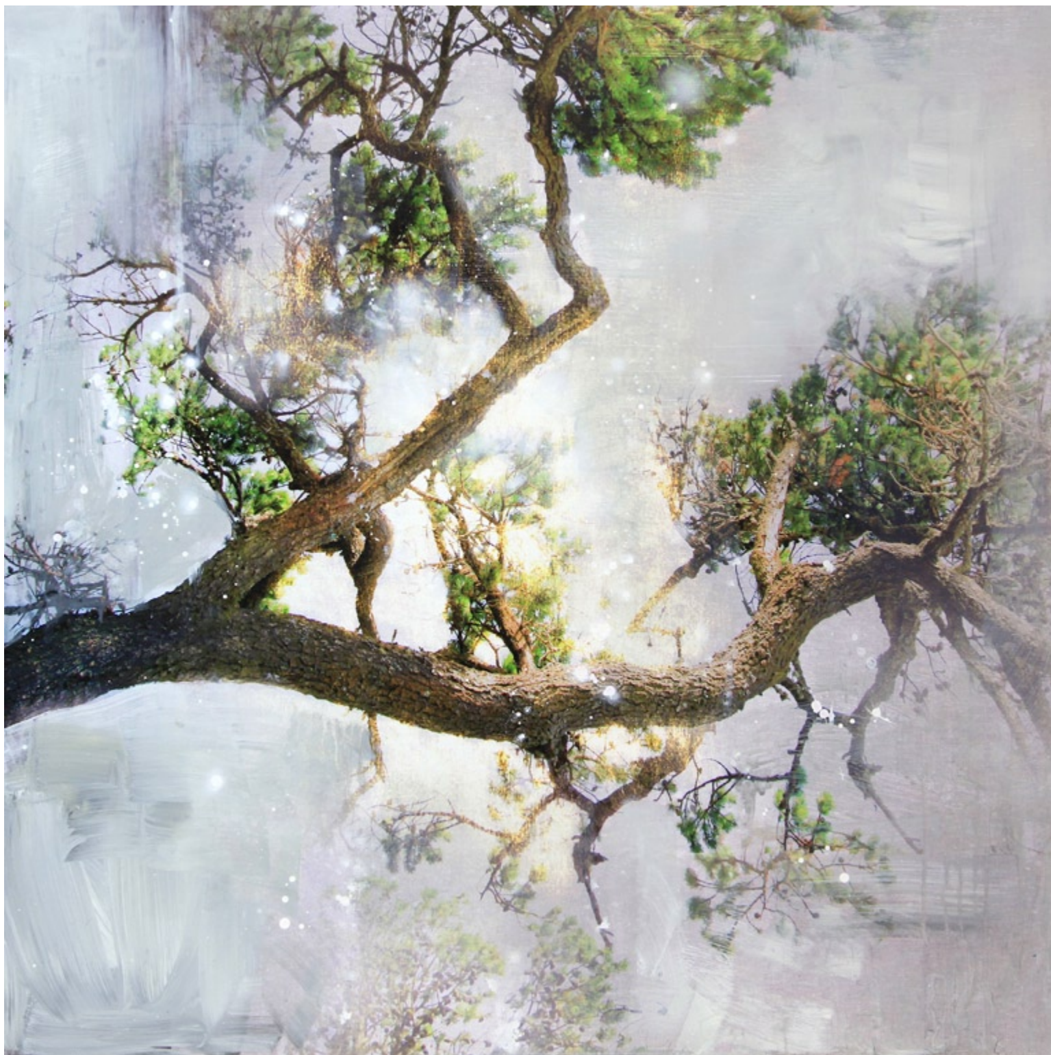
Tree In Fog 1 , mixed media on panel, 42 X 42 inches