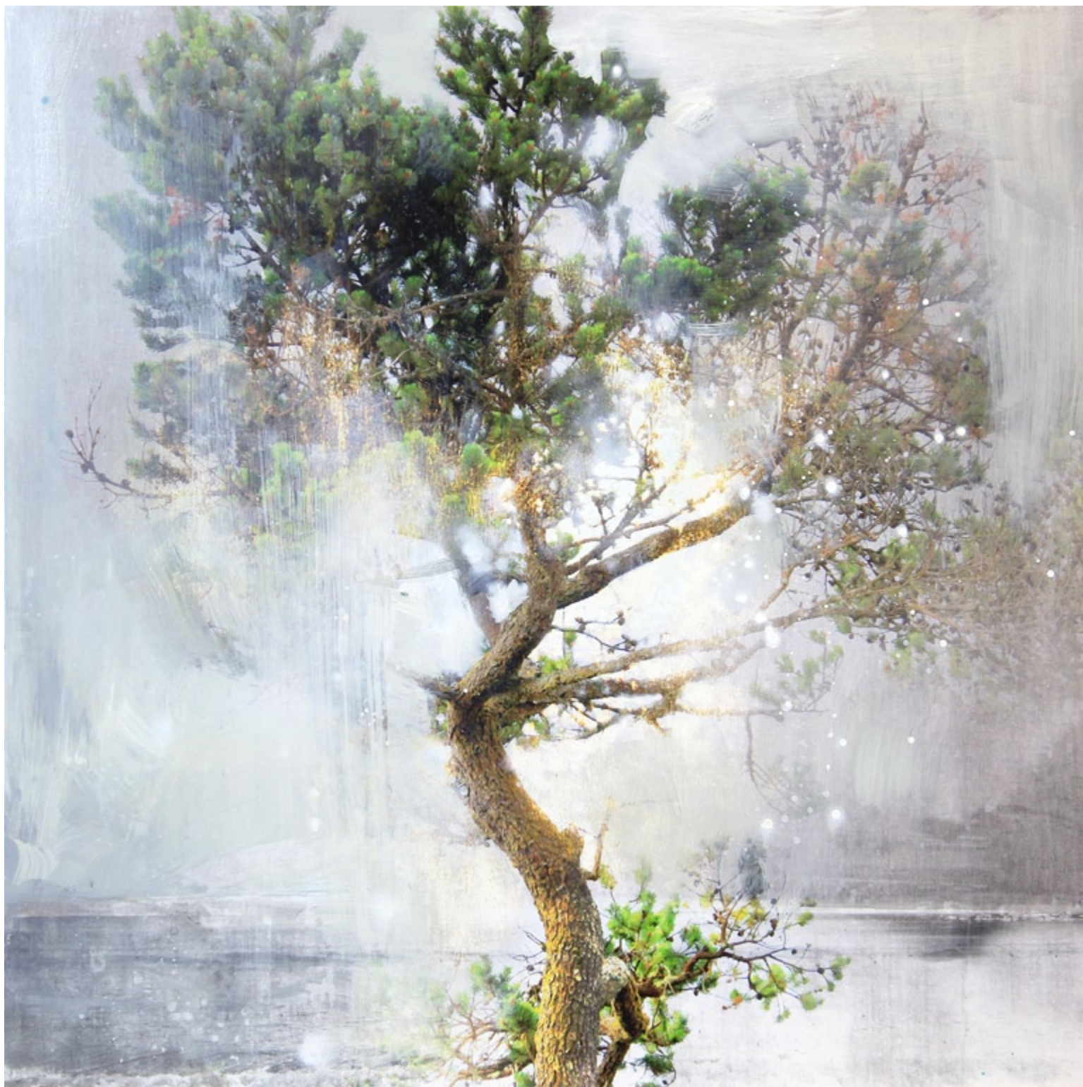
Tree In Fog 2 , mixed media on panel, 42 X 42 inches