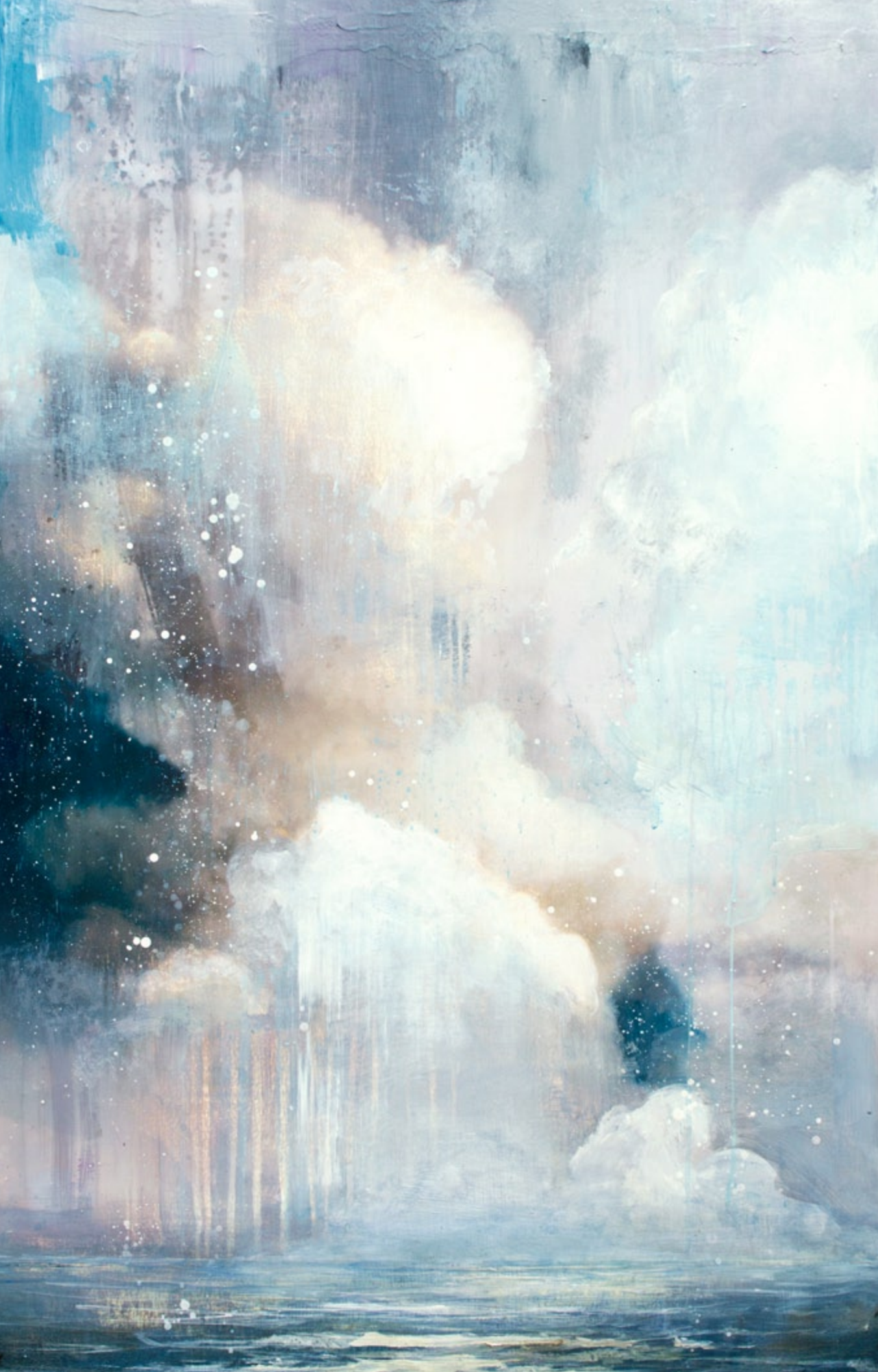
Immersion, mixed media on panel, 56 X 36 inches