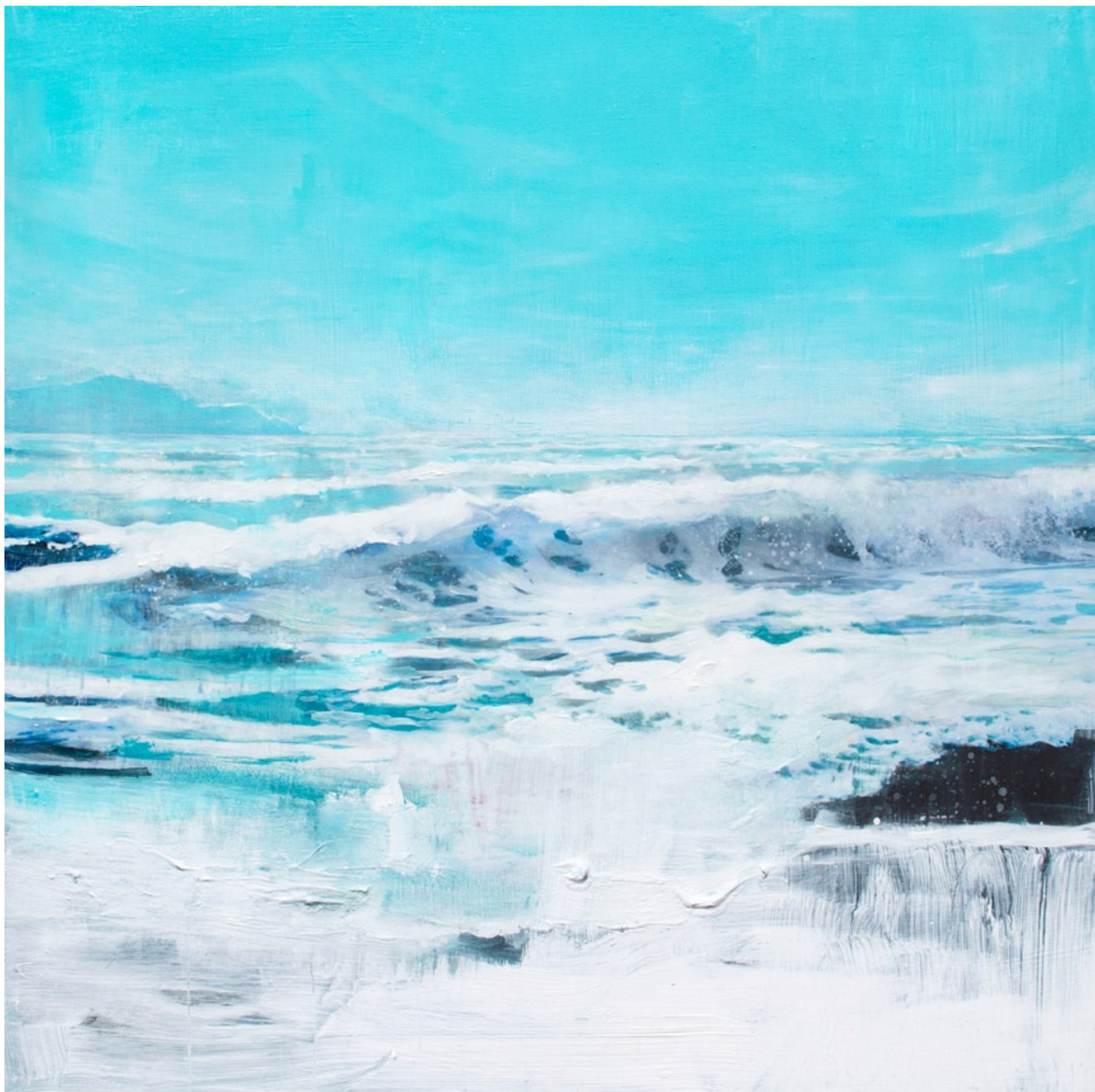
Sky In Tiepolo Blue , mixed media on panel, 48 X 48 inches