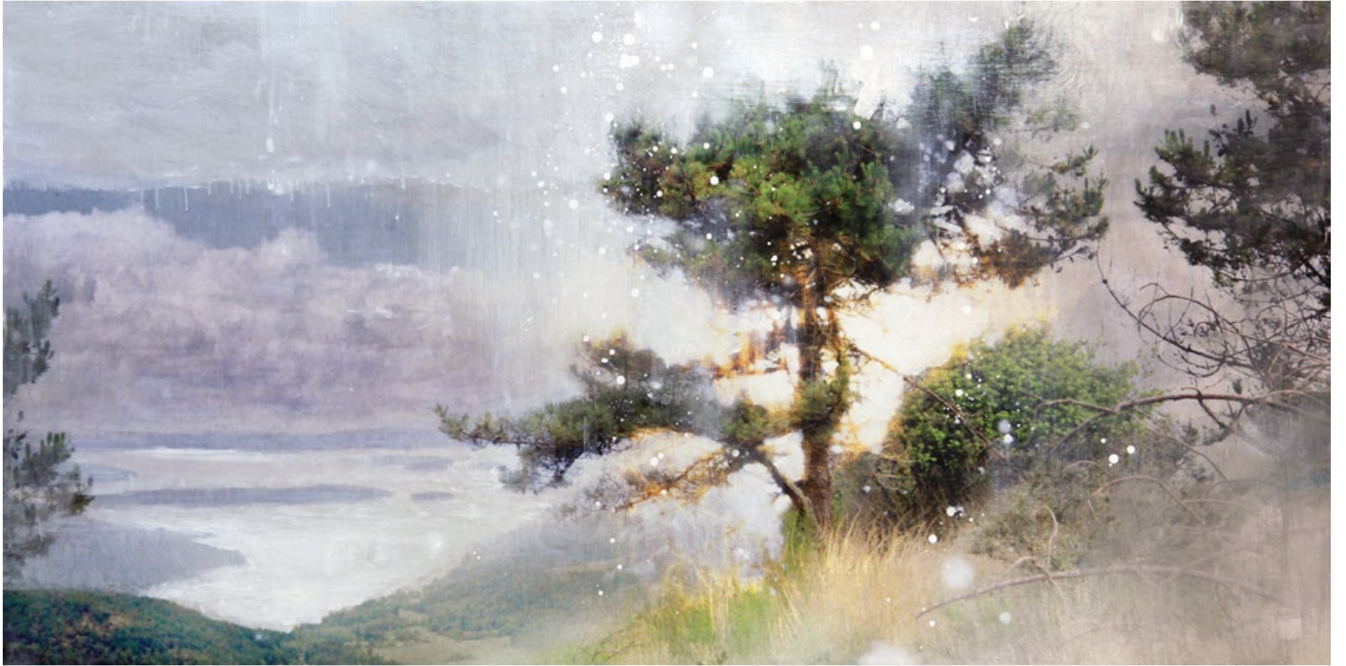
Revelations and Visions , mixed media on panel, 30 X 60 inches