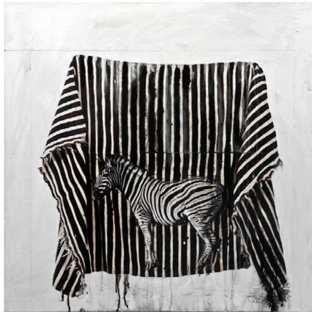
Hide , 2013, mixed media on panel, 30 x 30 inches