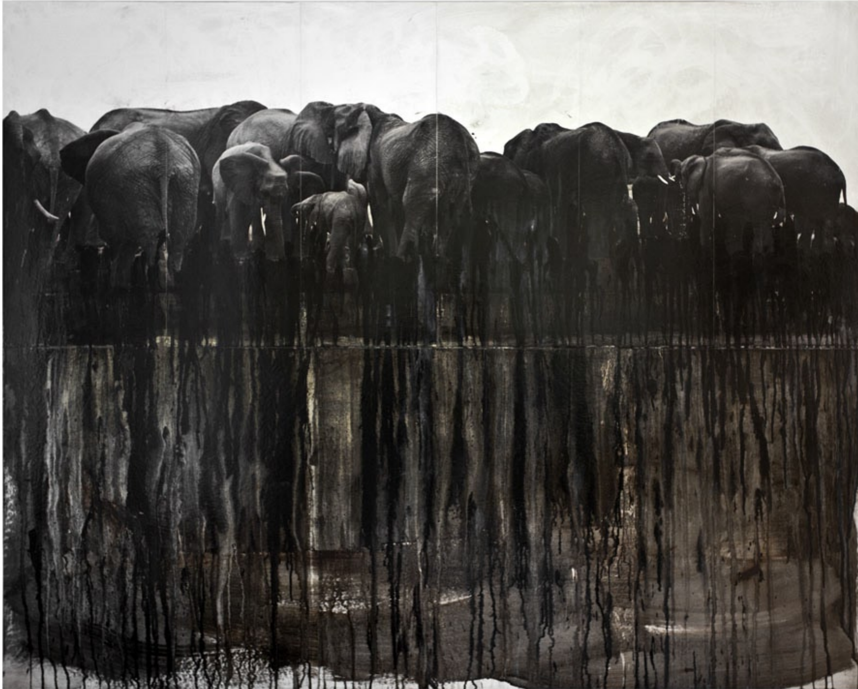
Etosha , 2013, mixed media on panel, 48 x 60 inches