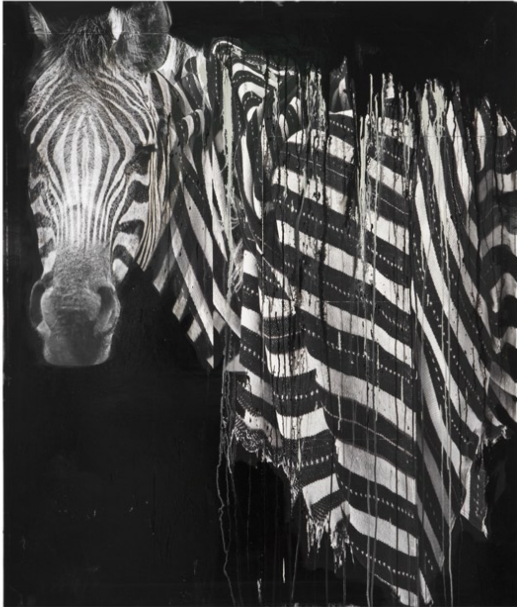
Camouflage 2 , 2013, mixed media on panel, 56.5 x 48 inches