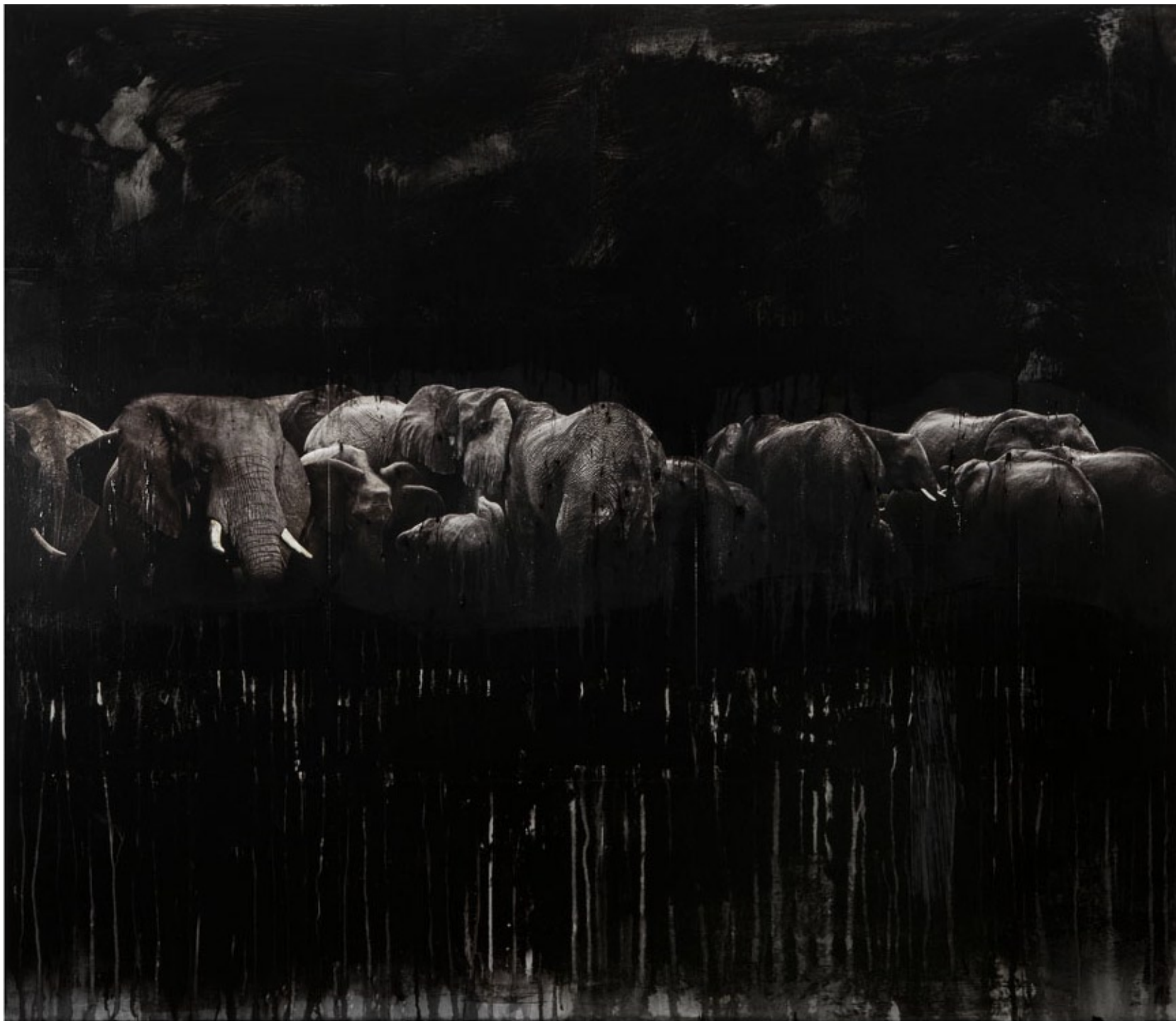
Estosha 2 2013 mixed media on panel 48 x 96 inches www.fosterwhite.com