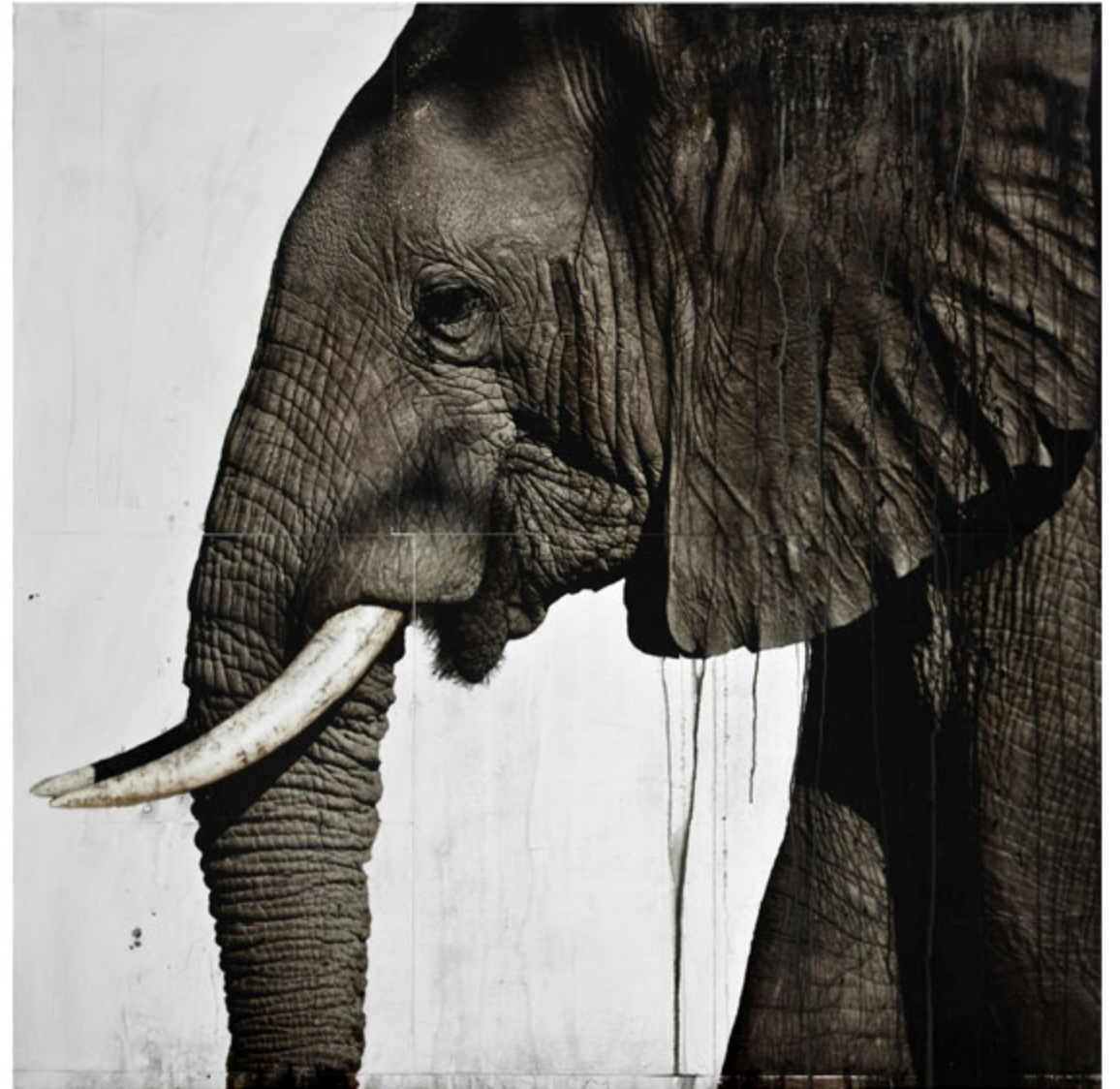
You and Me , 2013, mixed media on panel, 48 x 96 inches