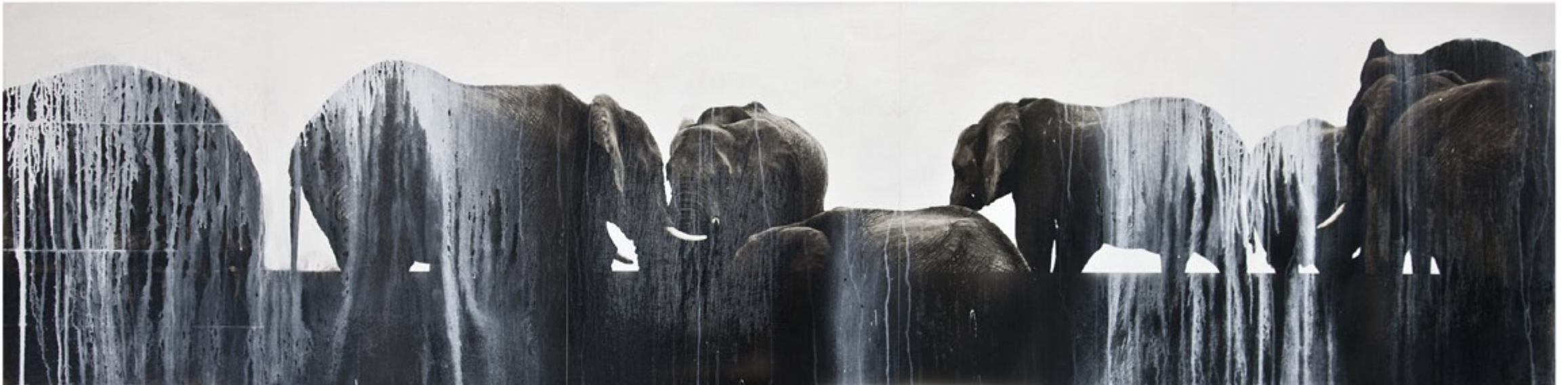
Titanium Rain , 2013, mixed media on panel, 18 x 72 inches