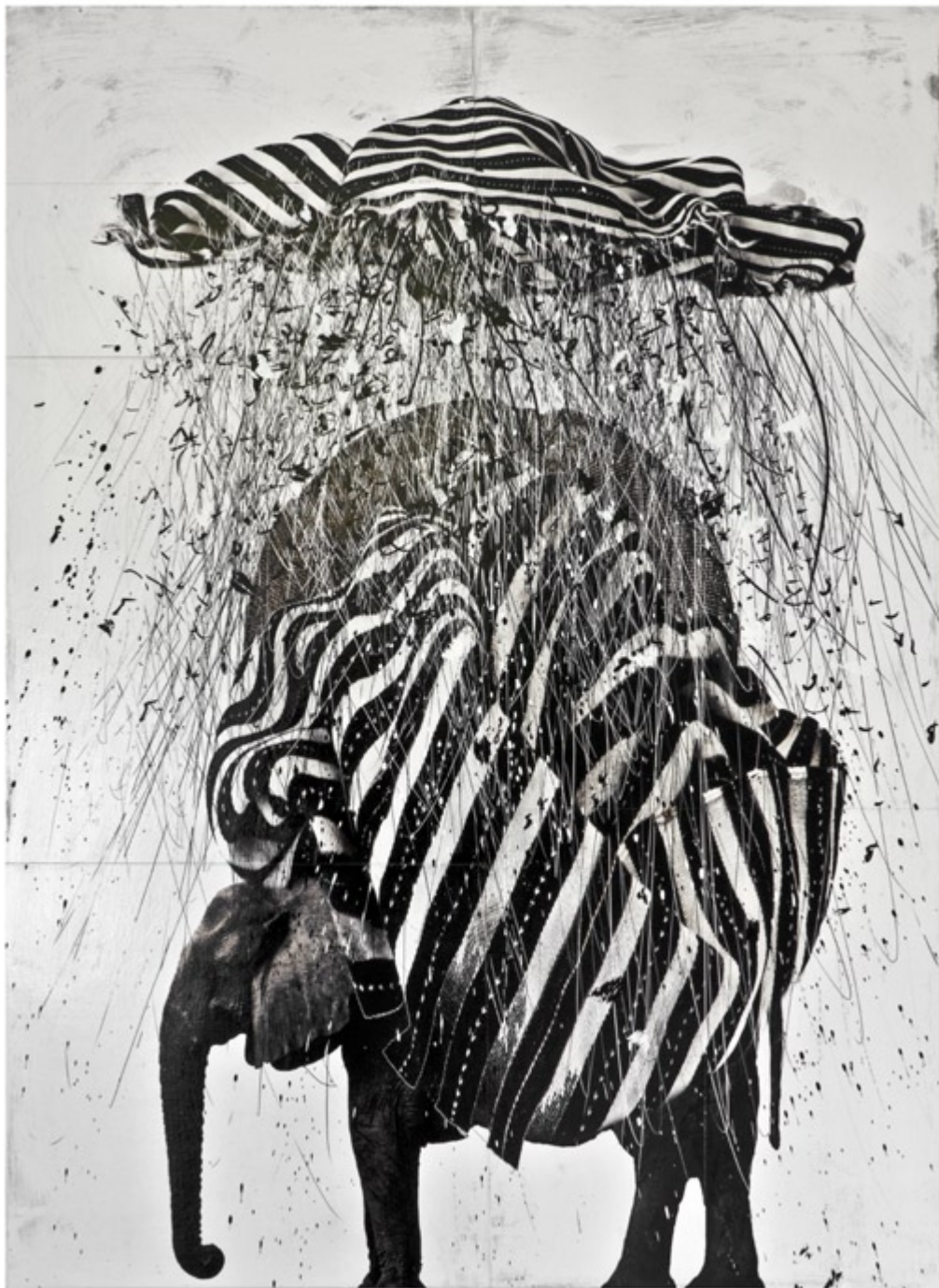
Etosha Downpour , 2013, mixed media on panel, 48 x 35.5 inches