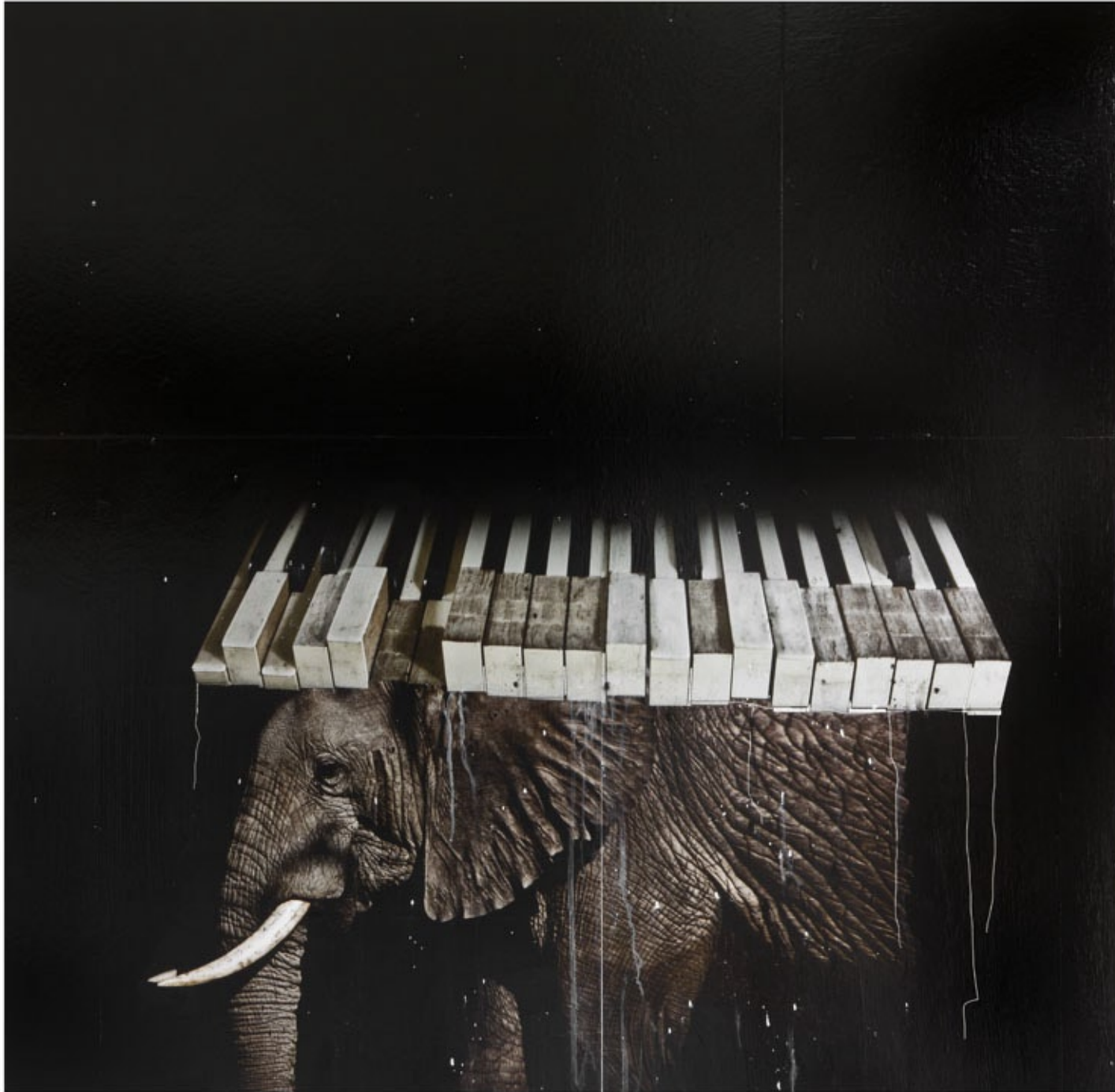
Solo for One , 2013, mixed media on panel, 40 x 40 inches