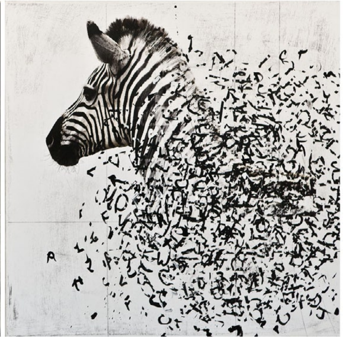
Echo , 2013, mixed media on panel, 24 x 48 inches