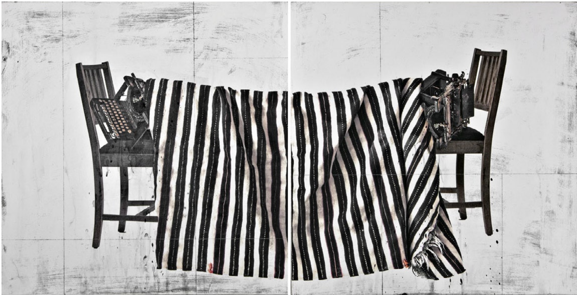
Your Turn , 2013, mixed media on panel, 24 x 48 inches