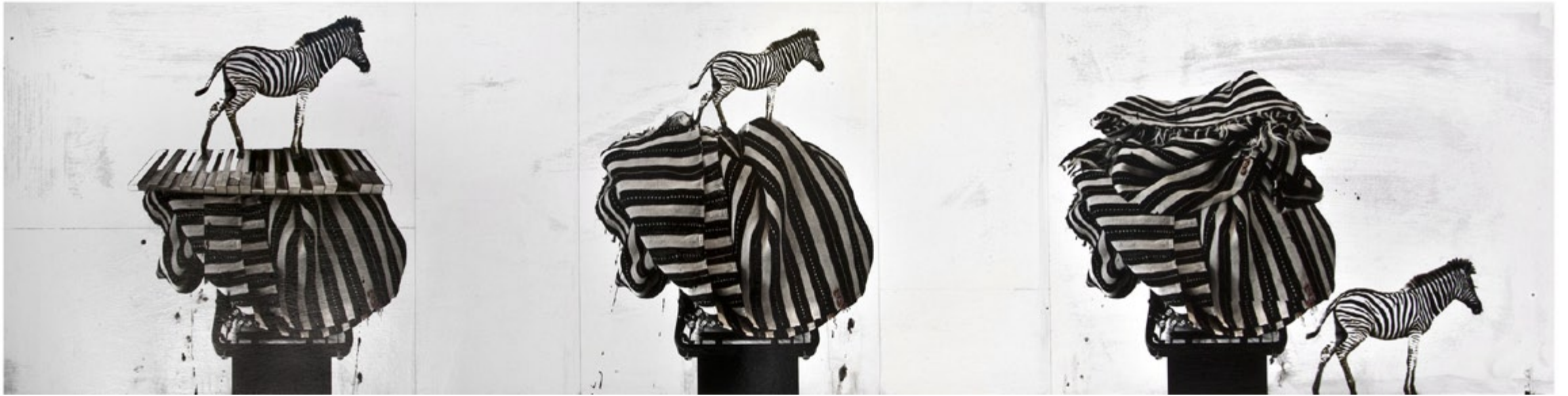
Caravan , 2013, mixed media on panel, 18 x 72 inches