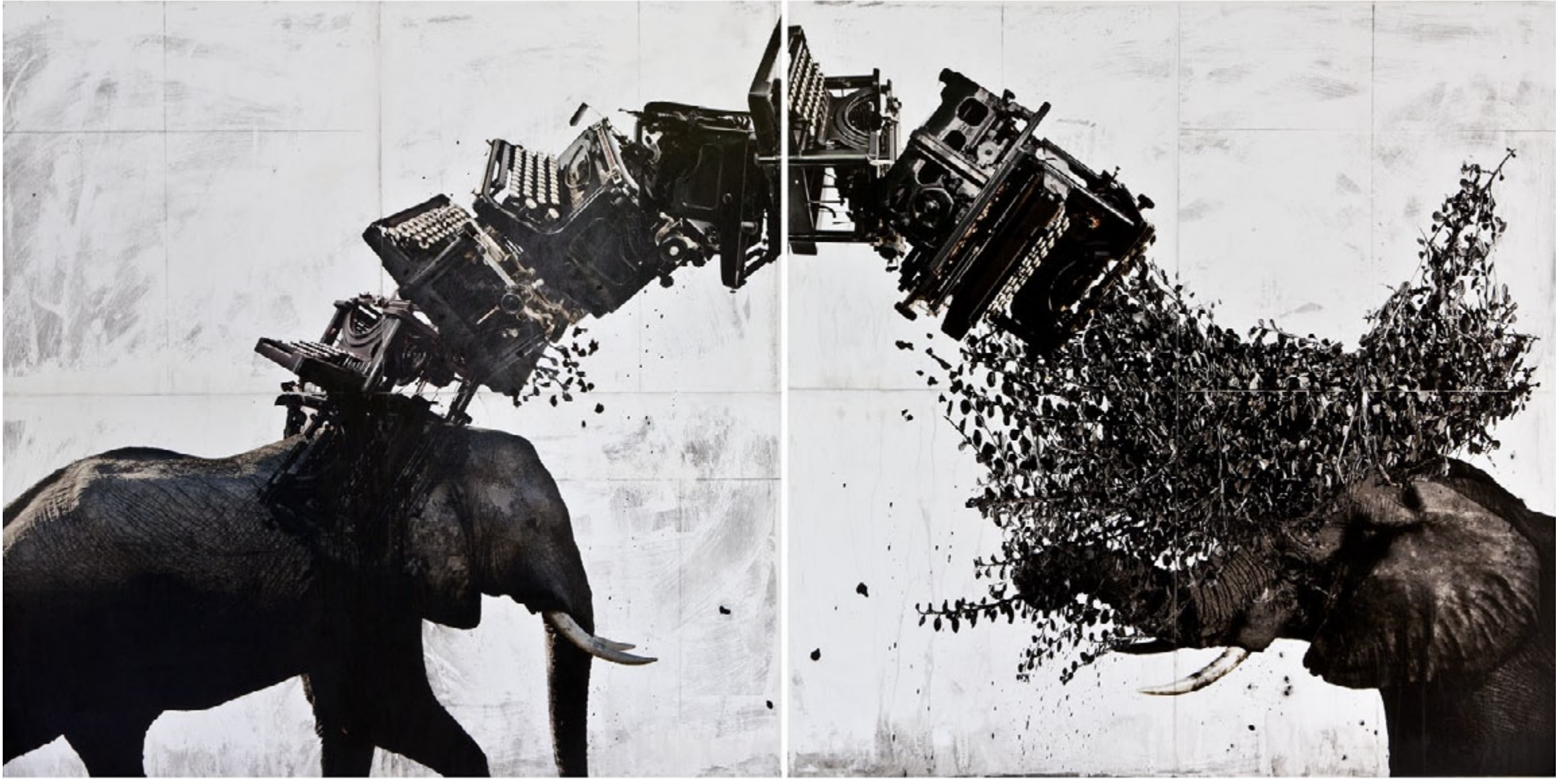
Toss , 2013, mixed media on panel, 48 x 96 inches