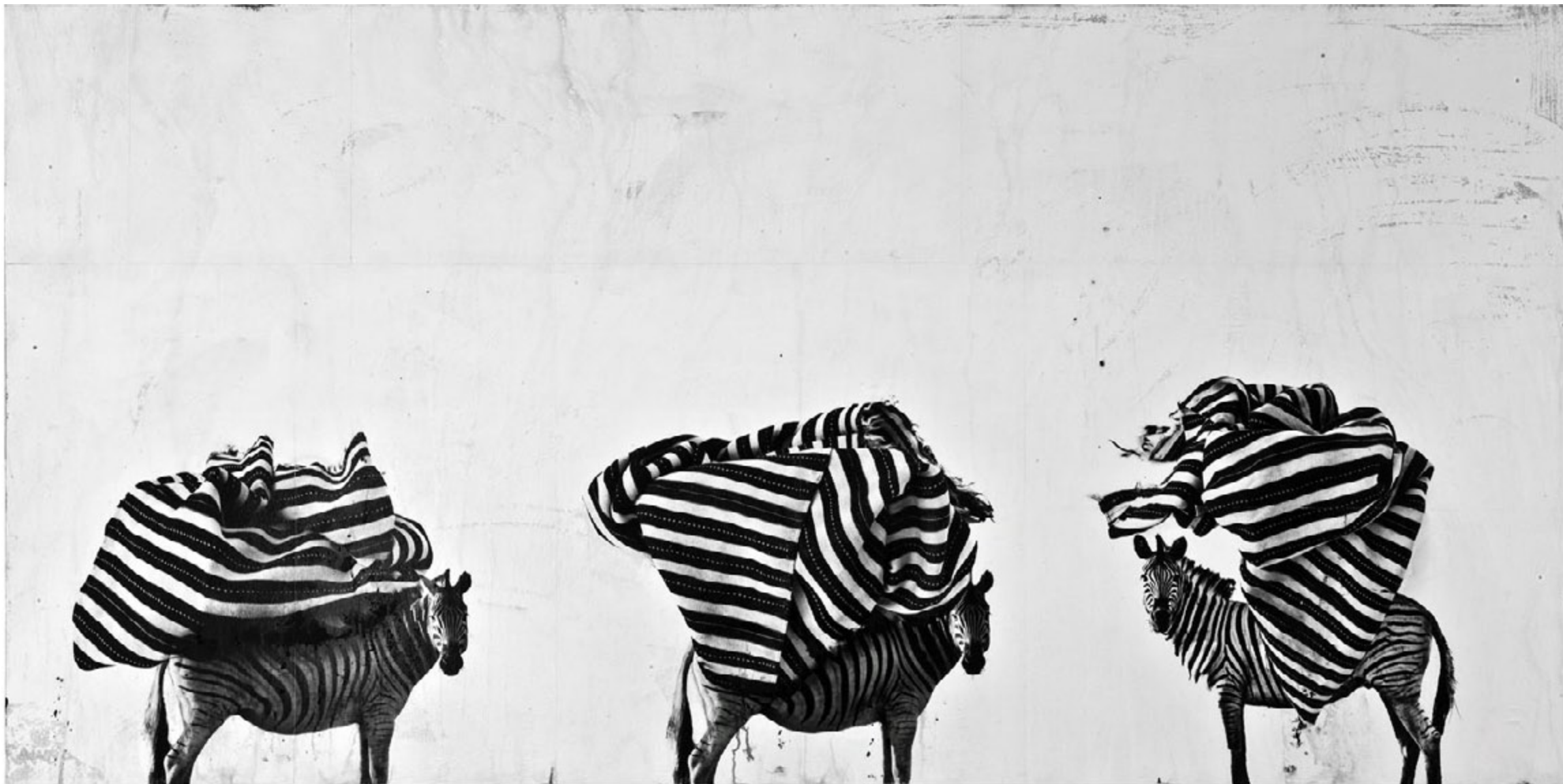
One Step Forward , 2013, mixed media on panel, 36 x 72 inches