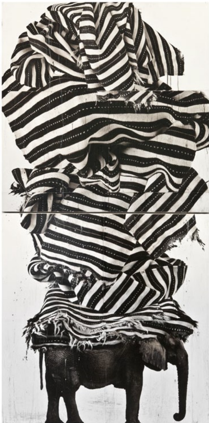
Heavy 2013 mixed media on panel 80 x 40 inches