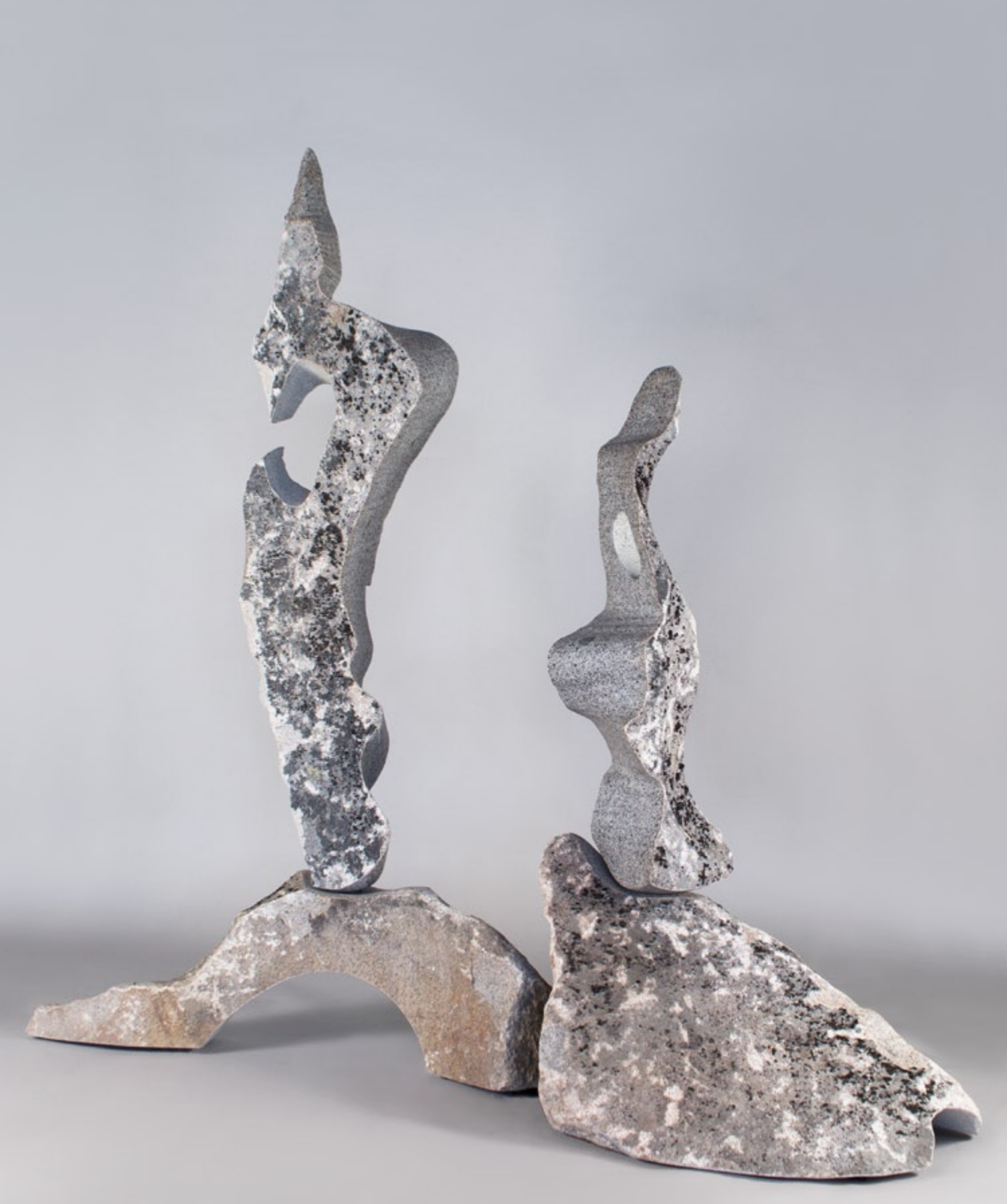
Meeting of Minds, white granite, 85 \times 86 \times 31 inches