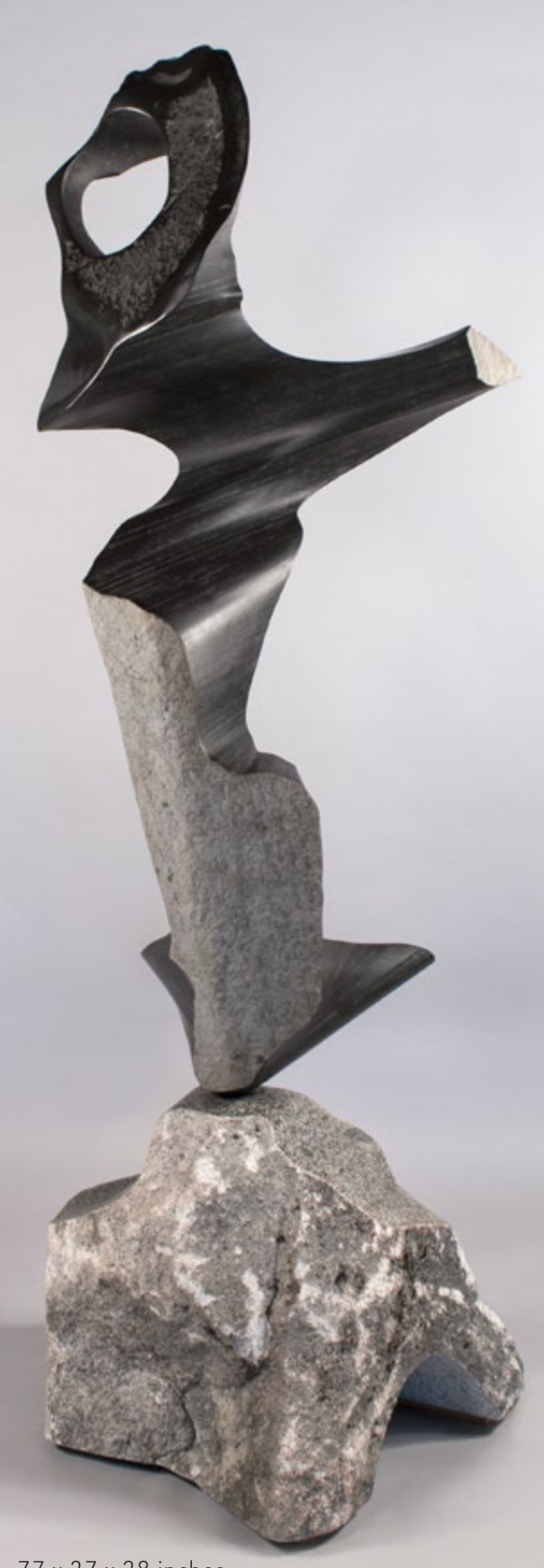
\it Man\ In\ Black , basalt on white granite, 77 x 27 x 28 inches