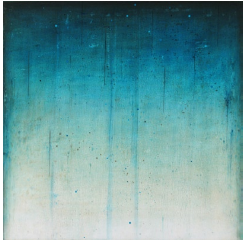
Lumen XIII (left) Lumen XIV (right) mixed media on panel 42 x 42 inches