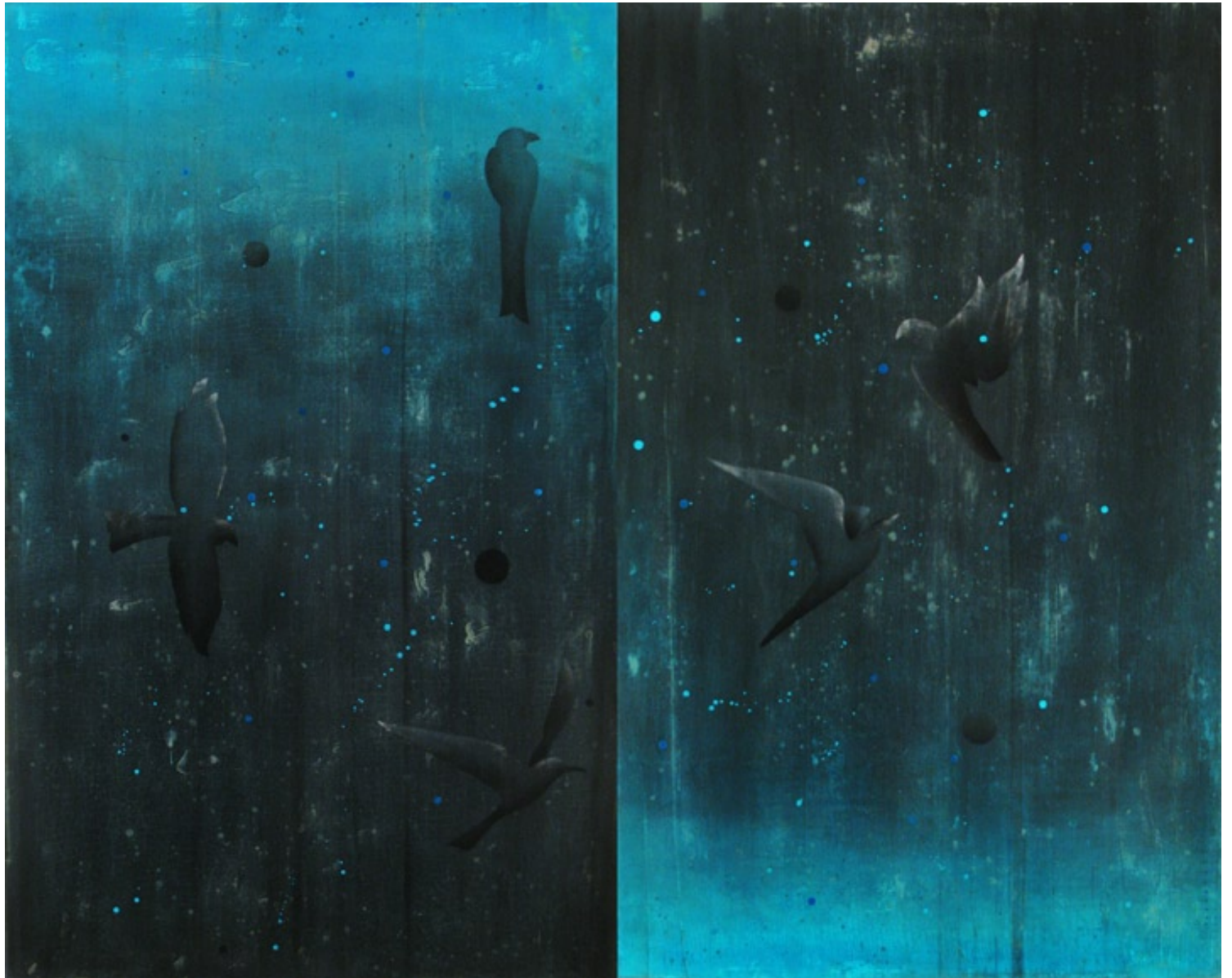
Twilight mixed media on panel 48 x 60 inches