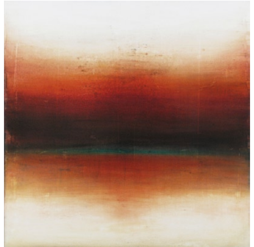
Lumen VII (left) Lumen VIII (right) mixed media on panel 42 x 42 inches