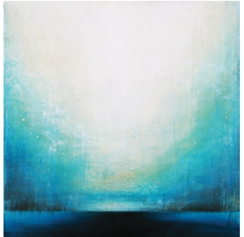
Lumen XV (left) Lumen XVI (right) mixed media on panel 42 x 42 inches