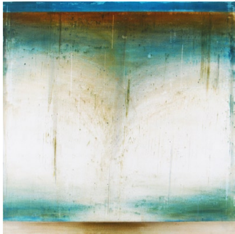
Lumen XI (left) Lumen XII (right) mixed media on panel 42 x 42 inches