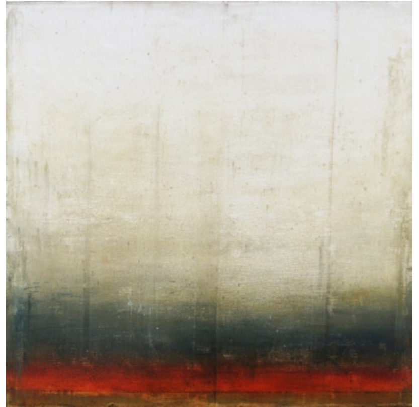
Lumen III (left) Lumen IV (right) mixed media on panel 42 x 42 inches