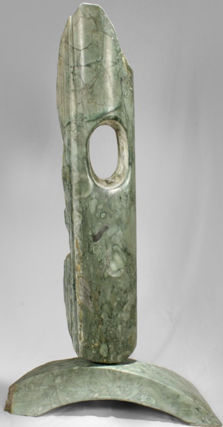
Untitled 2013 stone 56.5 x 30.5 x 14 in. www.fosterwhite.com