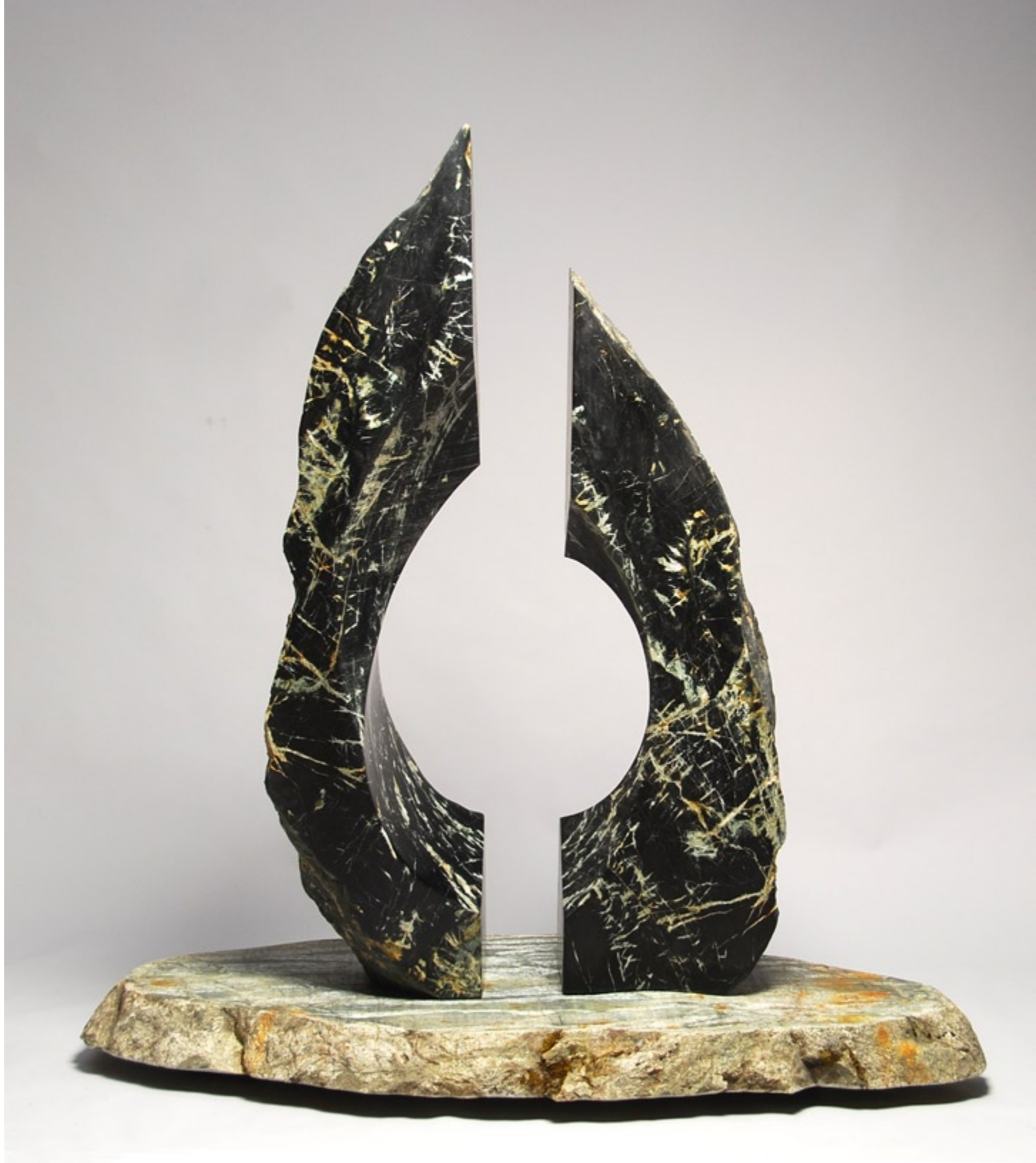
Tenuous Portal 2013 metamorphic marble 56 x 56 x 28 inches www.fosterwhite.com