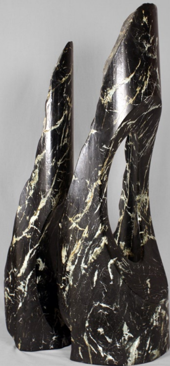
Follow The Leader 2013 metamorphic marble 41.5 x 20 x 14 in. www.fosterwhite.com