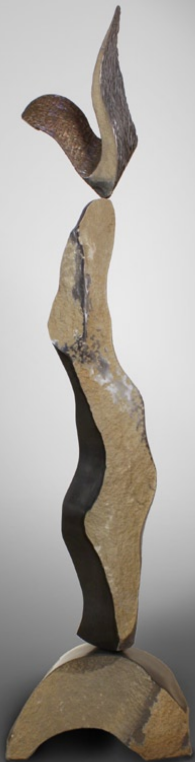
Alight 2013 basalt 82.25 x 21 x 16 in. www.fosterwhite.com