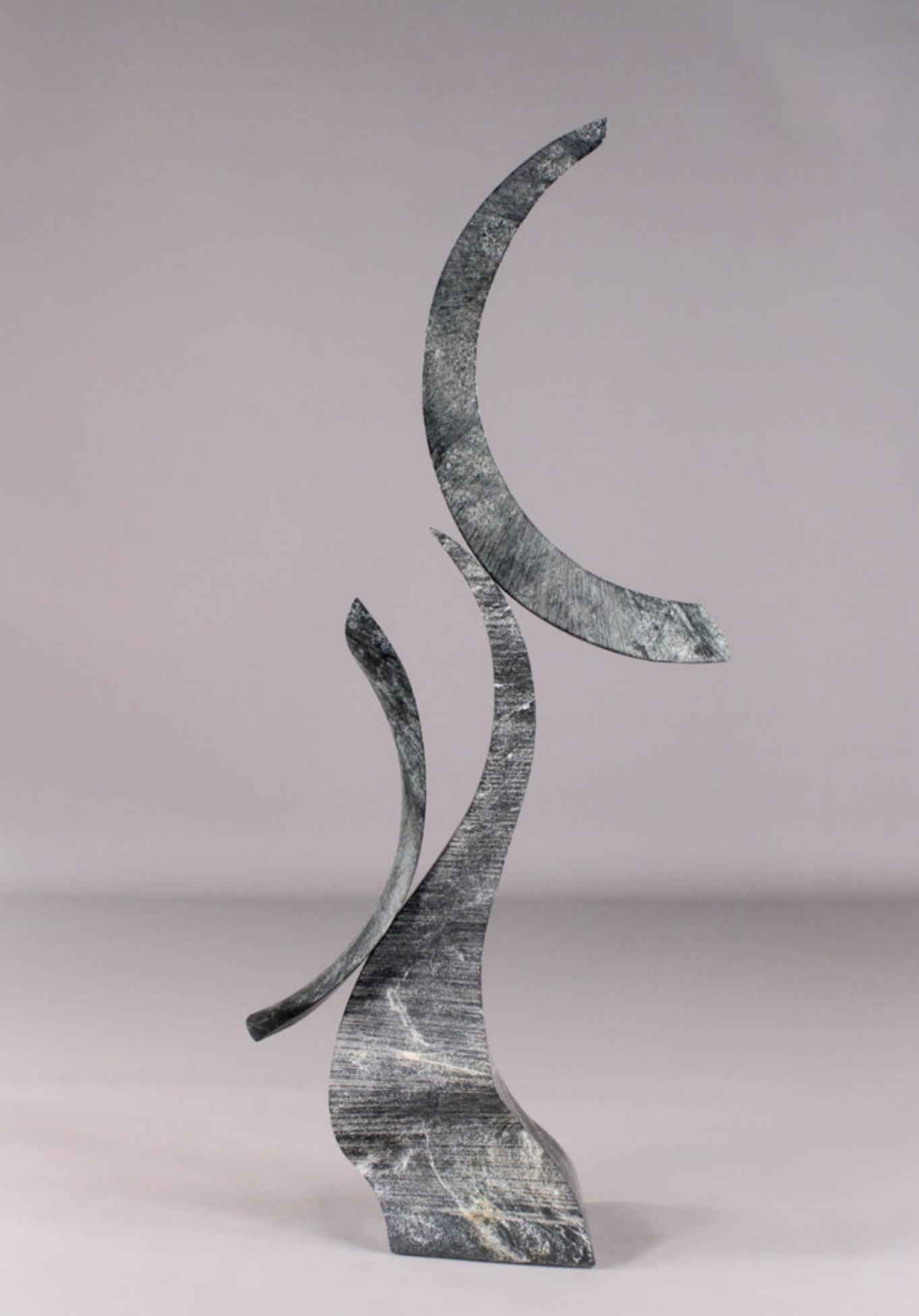
Delicate Balance, granite, 47.5 X 22 X 9 inches