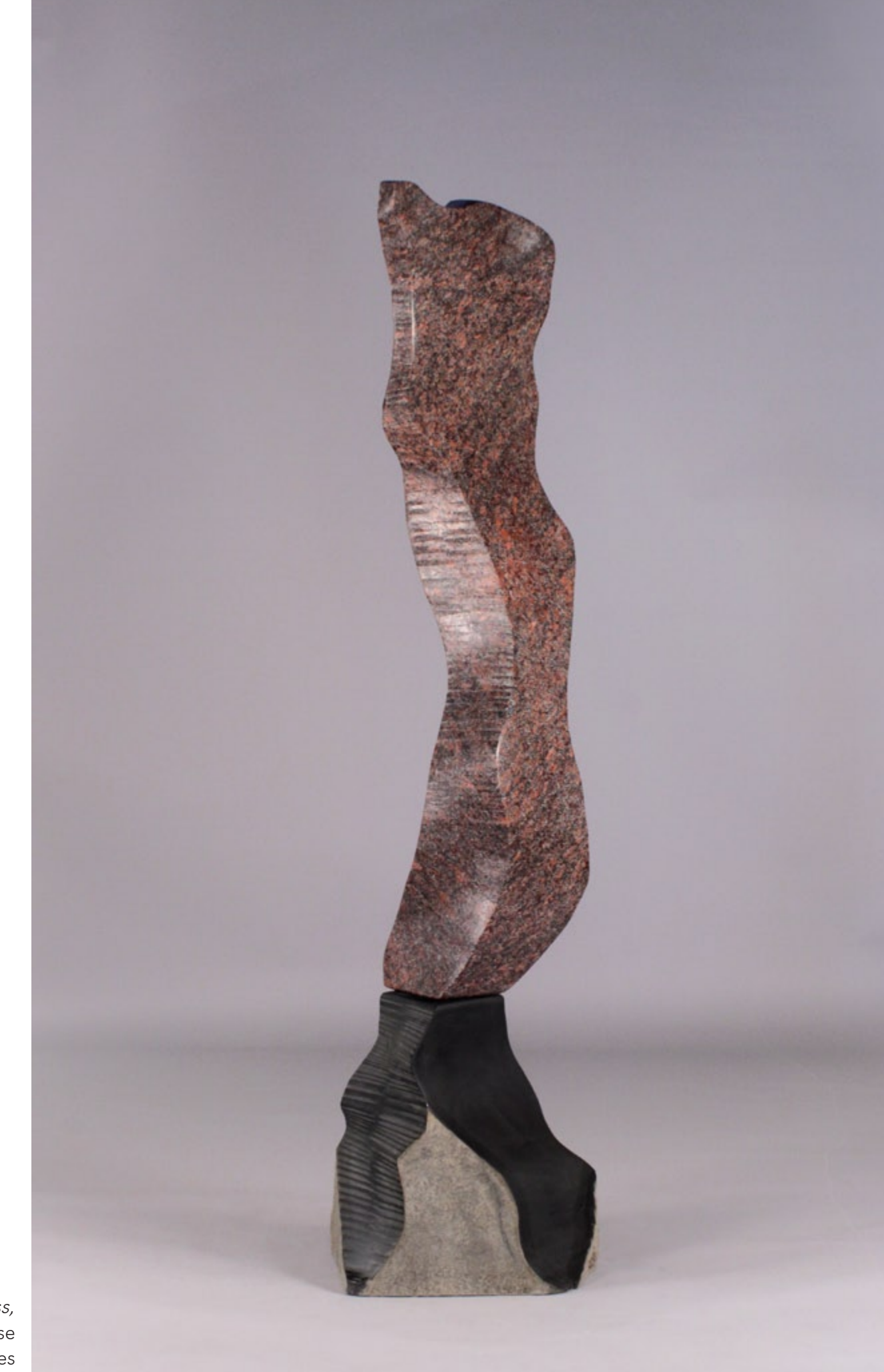
Red Dress, red granite, basalt base 69 X 16 X 17 inches