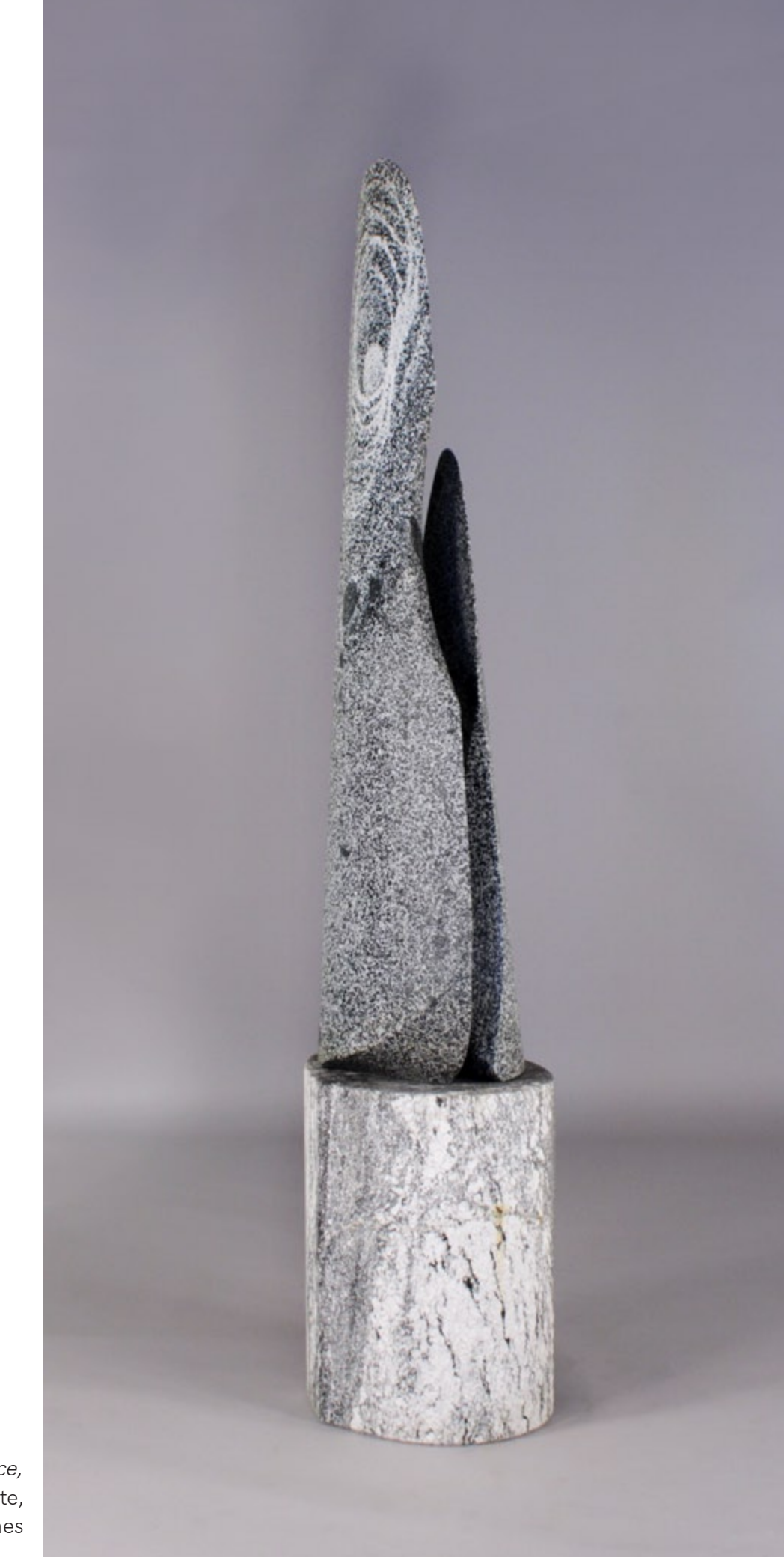
Deep Space, granite, 81 X 15 X 19 inches