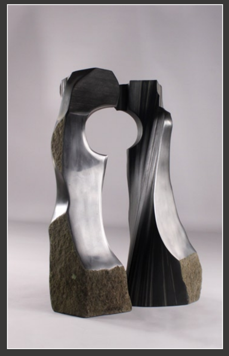
Intuitive Connection (alternate angle), basalt, 32.5 X 20 X 10 inches

2009 Puget Sound Naval Shipyard Memorial Plaza, Bremerton, WA