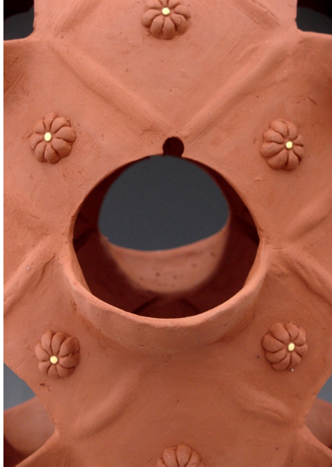
In Bloom 2012 ceramic 30 x 18 x 18 in