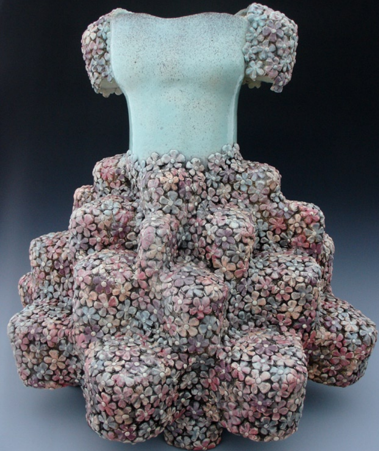
Confetti 2012 ceramic with glaze and acrylic 28 x 28 x 28 in