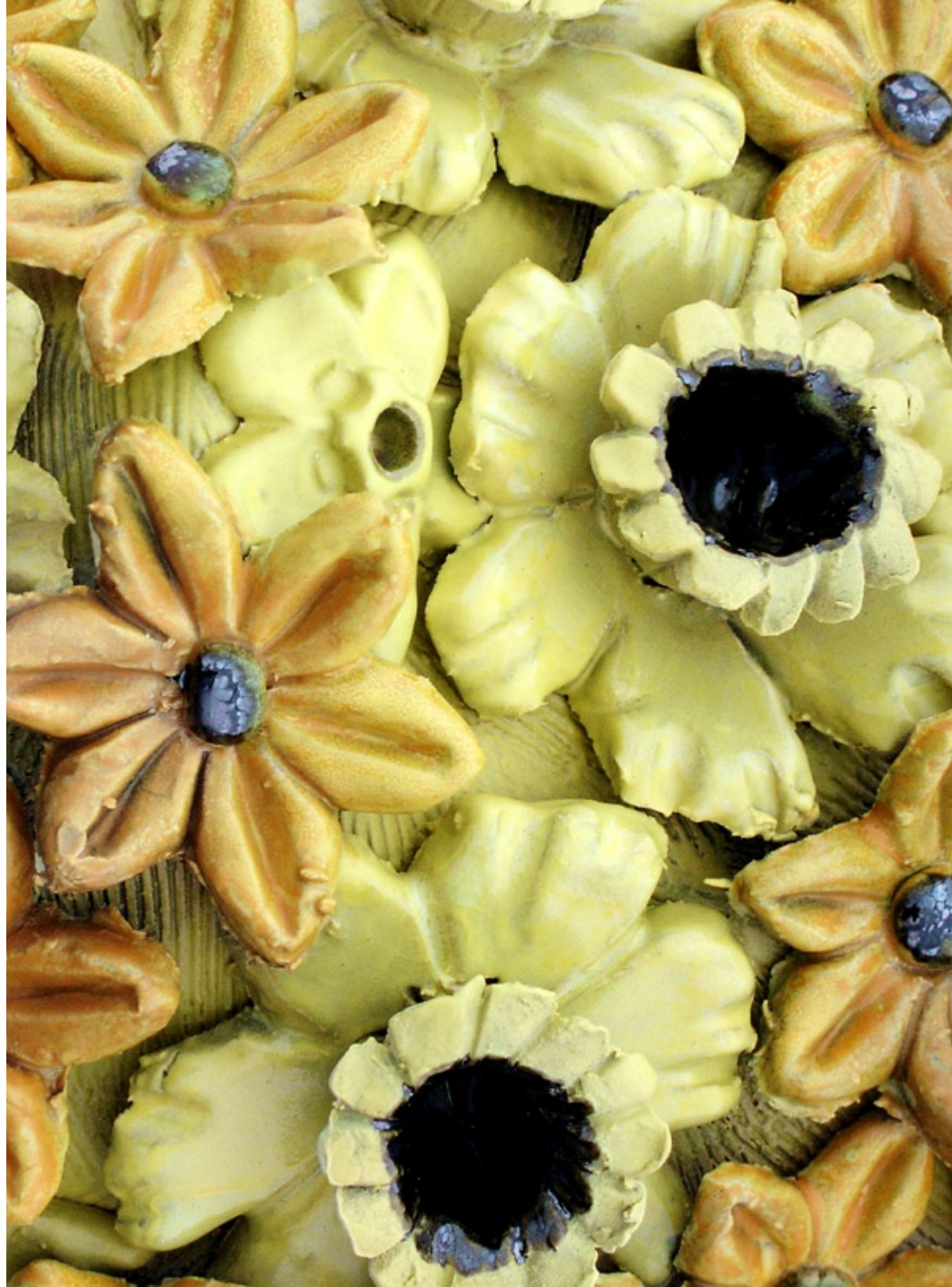
Narcissus 2012 ceramic with glaze and mirror 28 x 21 x 21 in