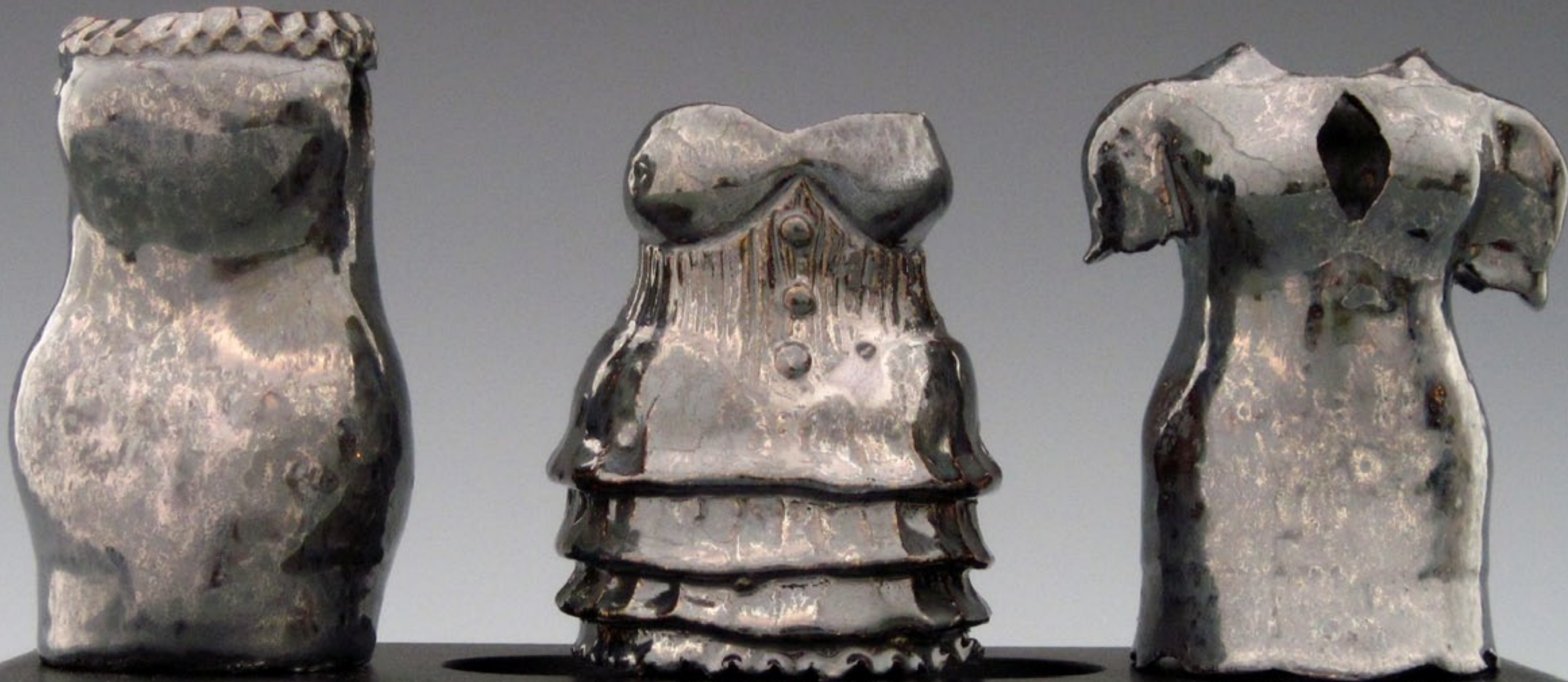
Little Black Dress, 2012, ceramic and wood, 7 x 11 x 3.5 in