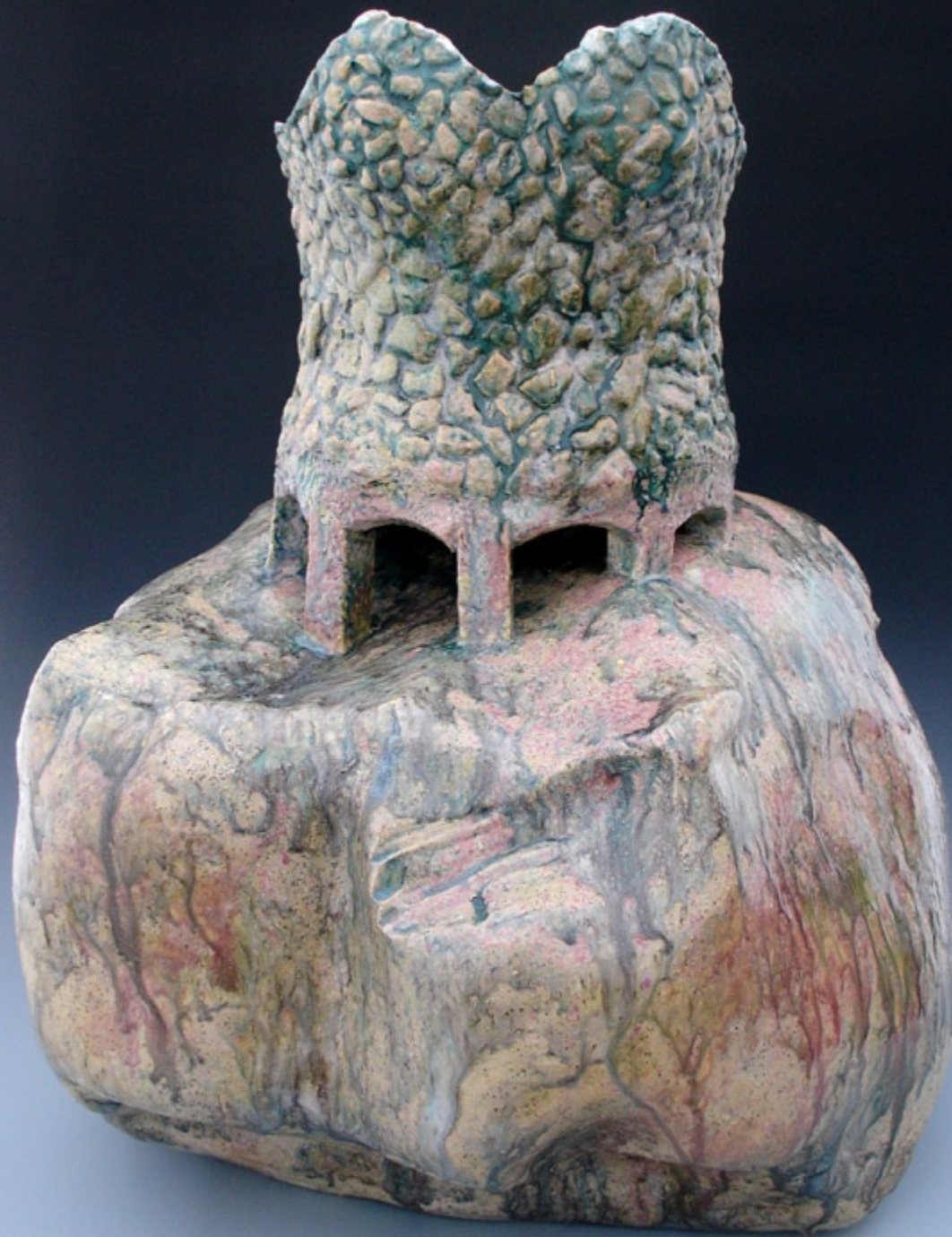
Rock 2012 ceramic with glaze 27.5 x 21 x 23 in