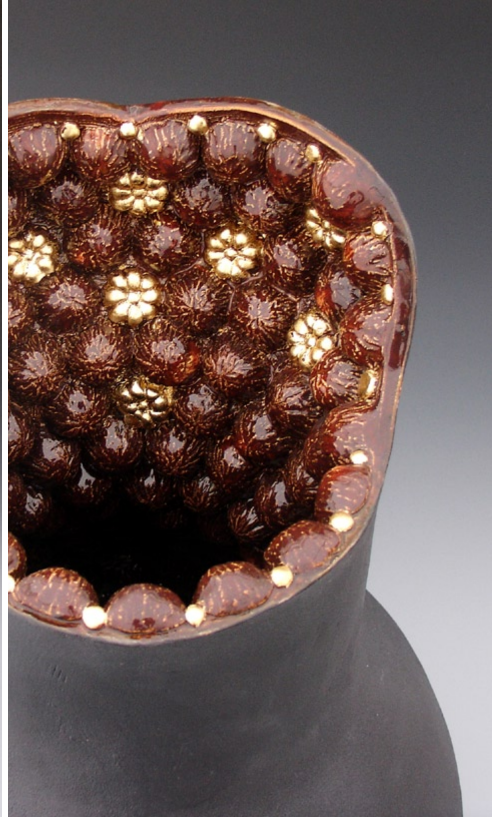
Introvert 2012 ceramic with glaze and gilded leaf 23 x 13 x 13 in