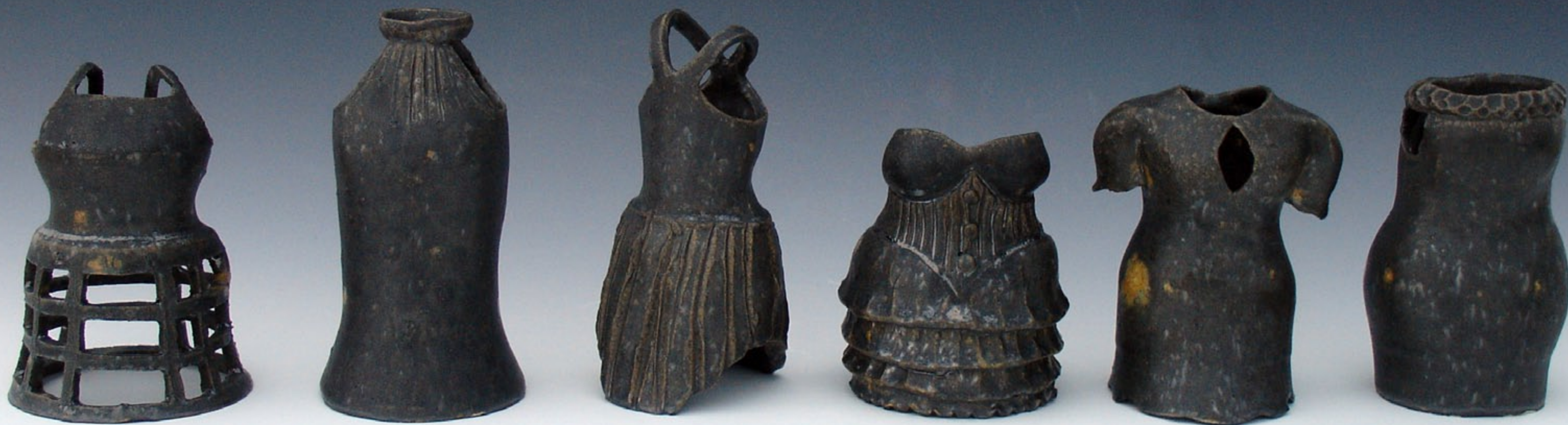
Little Black Dresses 2012 ceramic dimensions variable