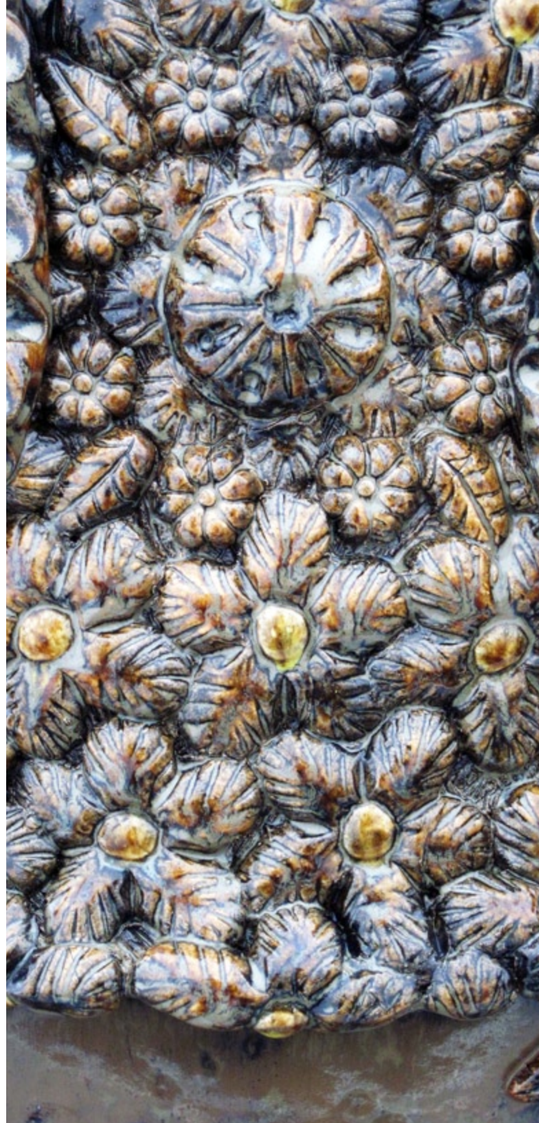
De Lucas 2012 ceramic with fiber and glaze 27.5 x 10 x 22 in