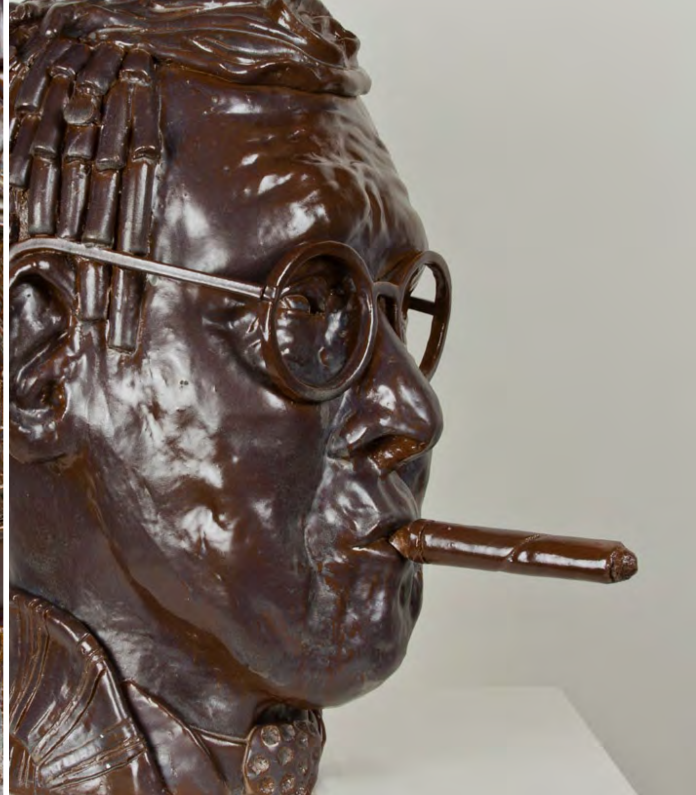
George Burns, 2011 18 x 13 x 19 in.

An American comedian, actor, and writer. His arched eyebrow and cigar smoke is a signature trademark of his embodied persona. On his mind, Gracie Allen adorns a martini glass paired with a couple of olives - class in glass. Deceased at age 100, he worked until the end. Have passion.