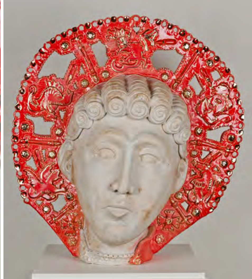
Saint George, 2011 24 x 23 x 13.5 in.

Saint George is seen as a Christian martyr and regarded as one of the most prominent military saints. Immortalized in the tale of Saint George and the Dragon, his courage saved the day and the girl. As dragons invade his halo, his face remains stoic. Be brave, sacrifice, and get the girl. Pride is not always a deadly sin.