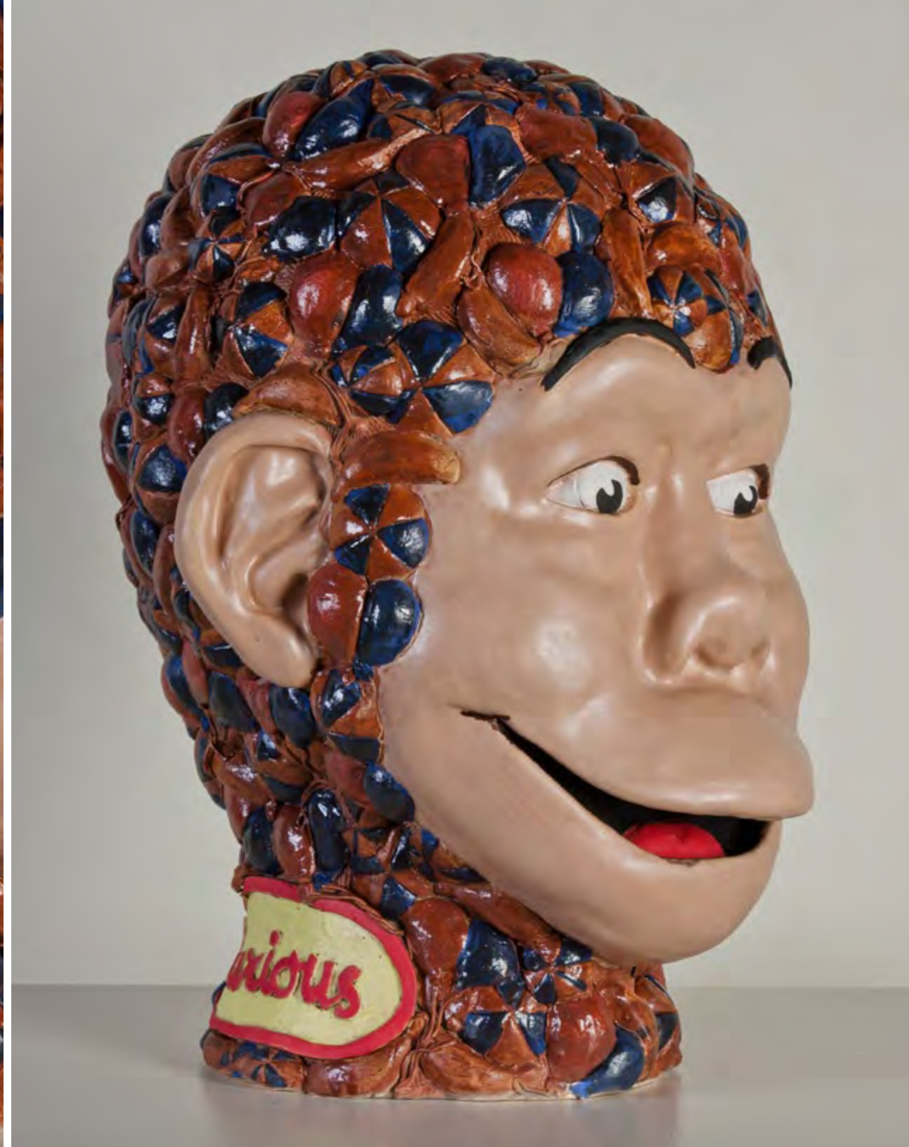
Curious George , 2011 18 x 14 x 16 in.

A curious little monkey. Brought to the big city by the "The Man with The Yellow Hat", the possibilities are endless. Jump, swing swing, sniff, poke, peek, and play. Curiosity killed the cat, but made the monkey grow. Cheerful and friendly - a sense of exploration is important.