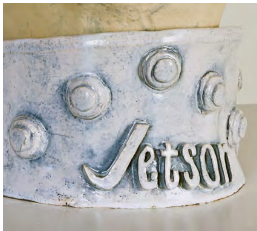
George J. Jetson , 2011 17.5 x 14 x 17 in.

A fictional character from the animated television series The Jetsons . Wife, daughter, son, dog and robot maid; he has it all. With the cosmos on his mind, and his temper running hot, he cares most about his family. I value family. Kindness and craziness fill my eyes. Focus is essential.