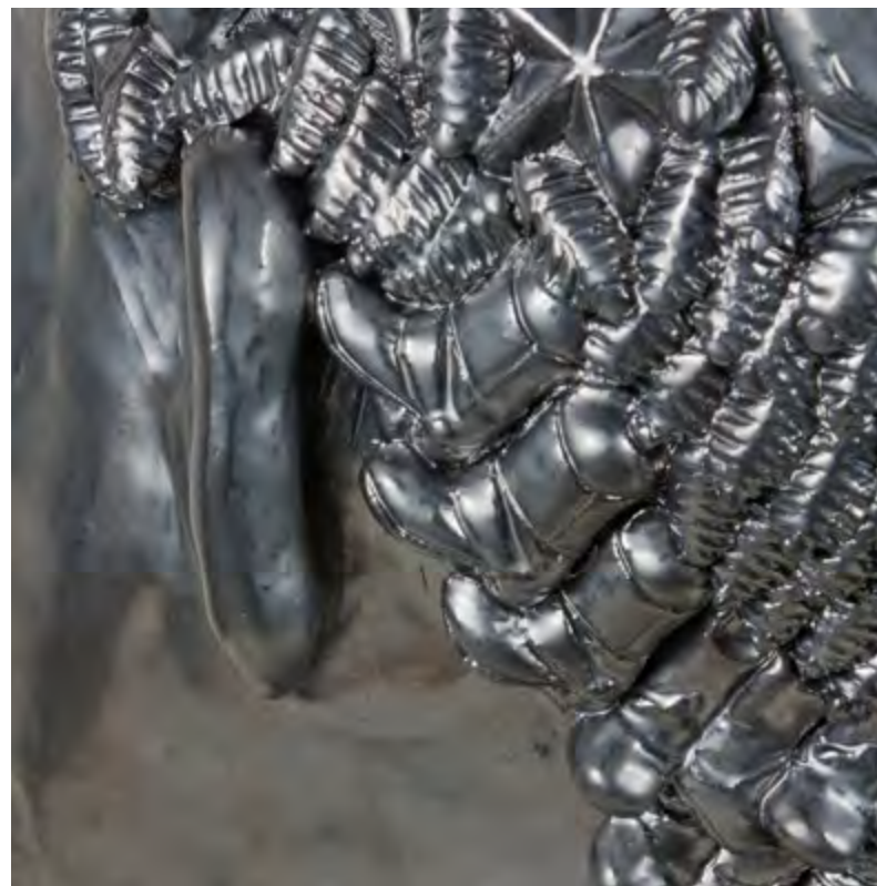
George Walker Bush , 2011 18.5 x 14 x 16 in.

Was the 43rd President of the United States and the 46th Governor of Texas. Boots, buckles, and buddies keep “W” company. Manny, Moe and Jack also stay near to help with mechanics. As my home state often chants, everything is bigger in Texas ... blunders included.