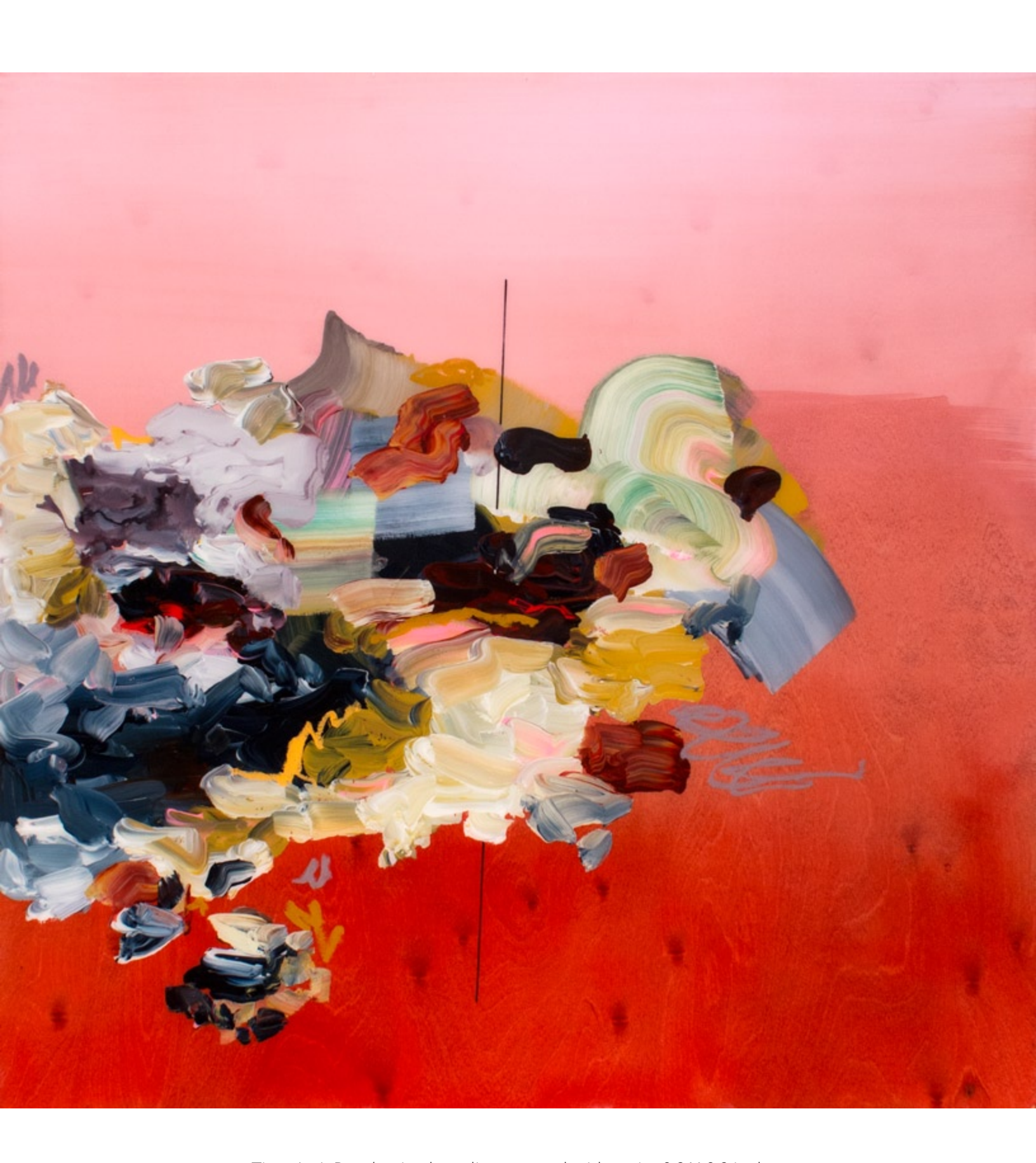
Time Is A Road, mixed media on panel with resin, 36 X 36 inches