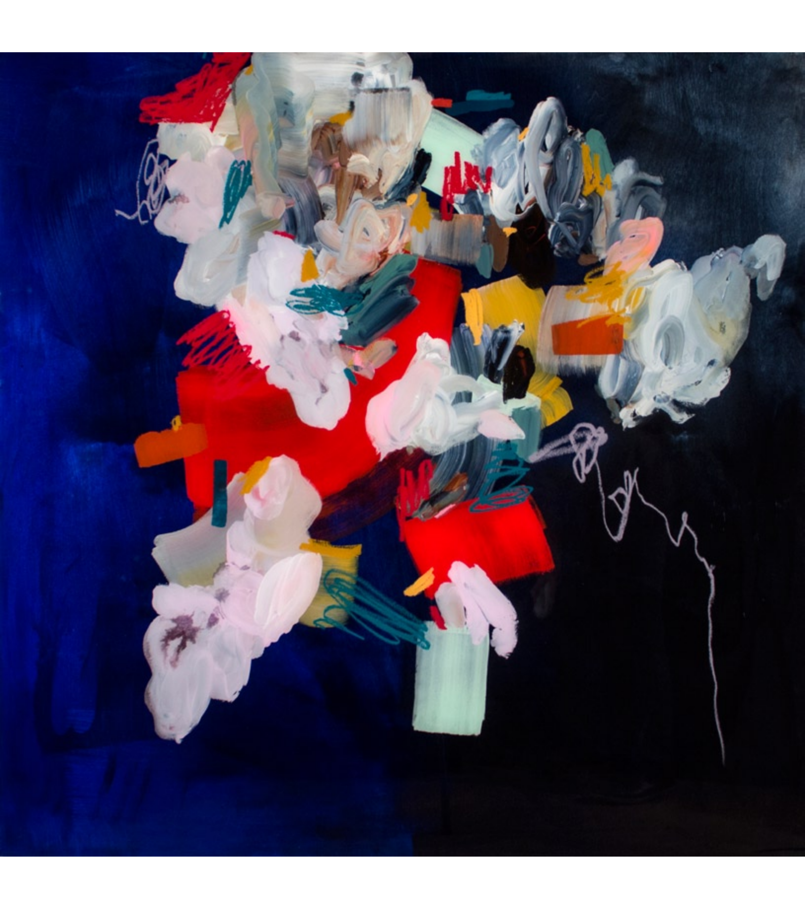
Inner Riots, mixed media on panel with resin, 48 X 48 inches