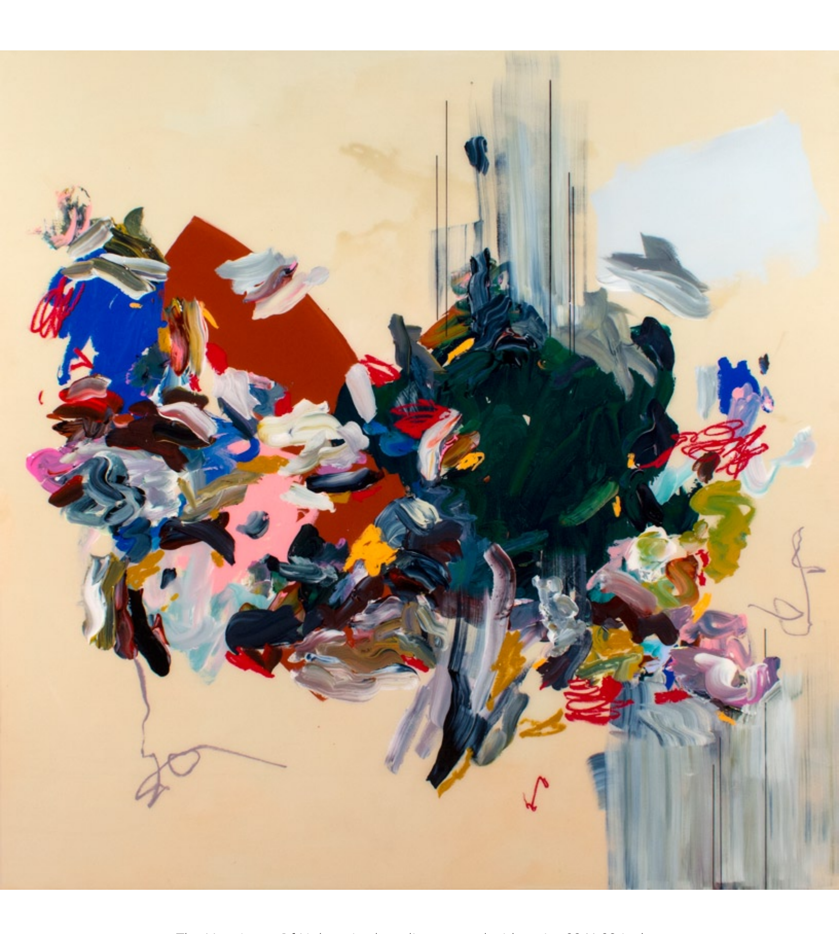
The Heaviness Of Light, mixed media on panel with resin, 60 X 60 inches