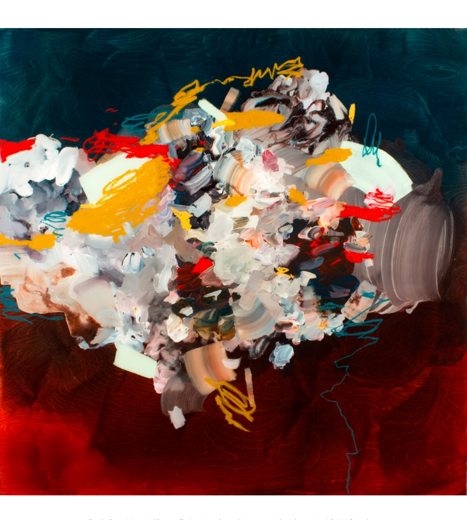
Each Day Has A Climax To It, mixed media on panel with resin, 48 X 48 inches