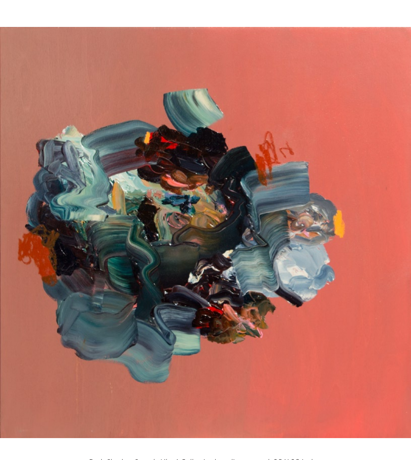
Each Shadow Sounds Like A Bell, mixed media on panel, 30 X 30 inches