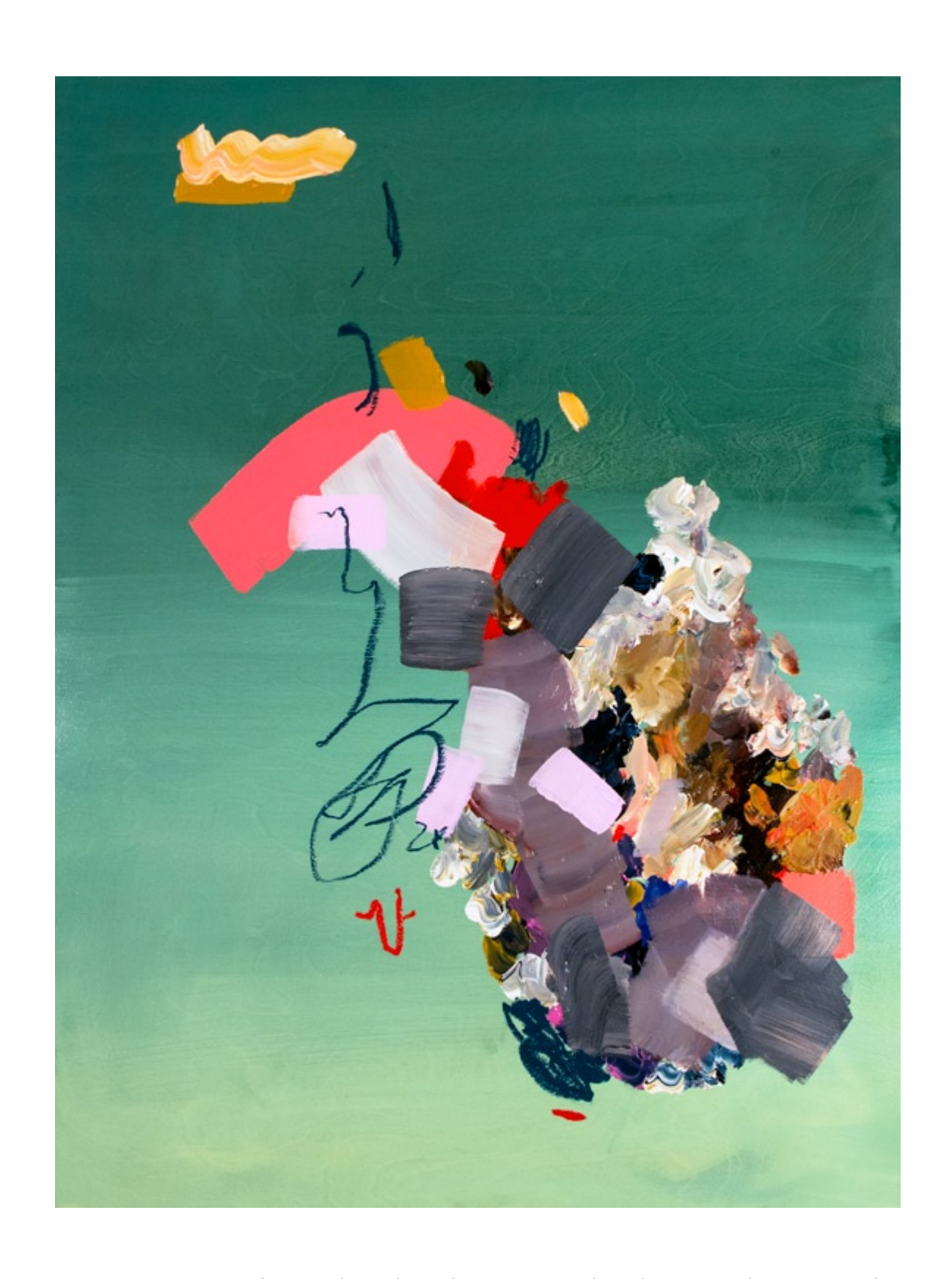
Cover image: Moon Blowing Through Dark Streets, mixed media on panel, 60 X 60 inches This page: Pilgrims Walk Slowly, mixed media on panel, 40 X 30 inches