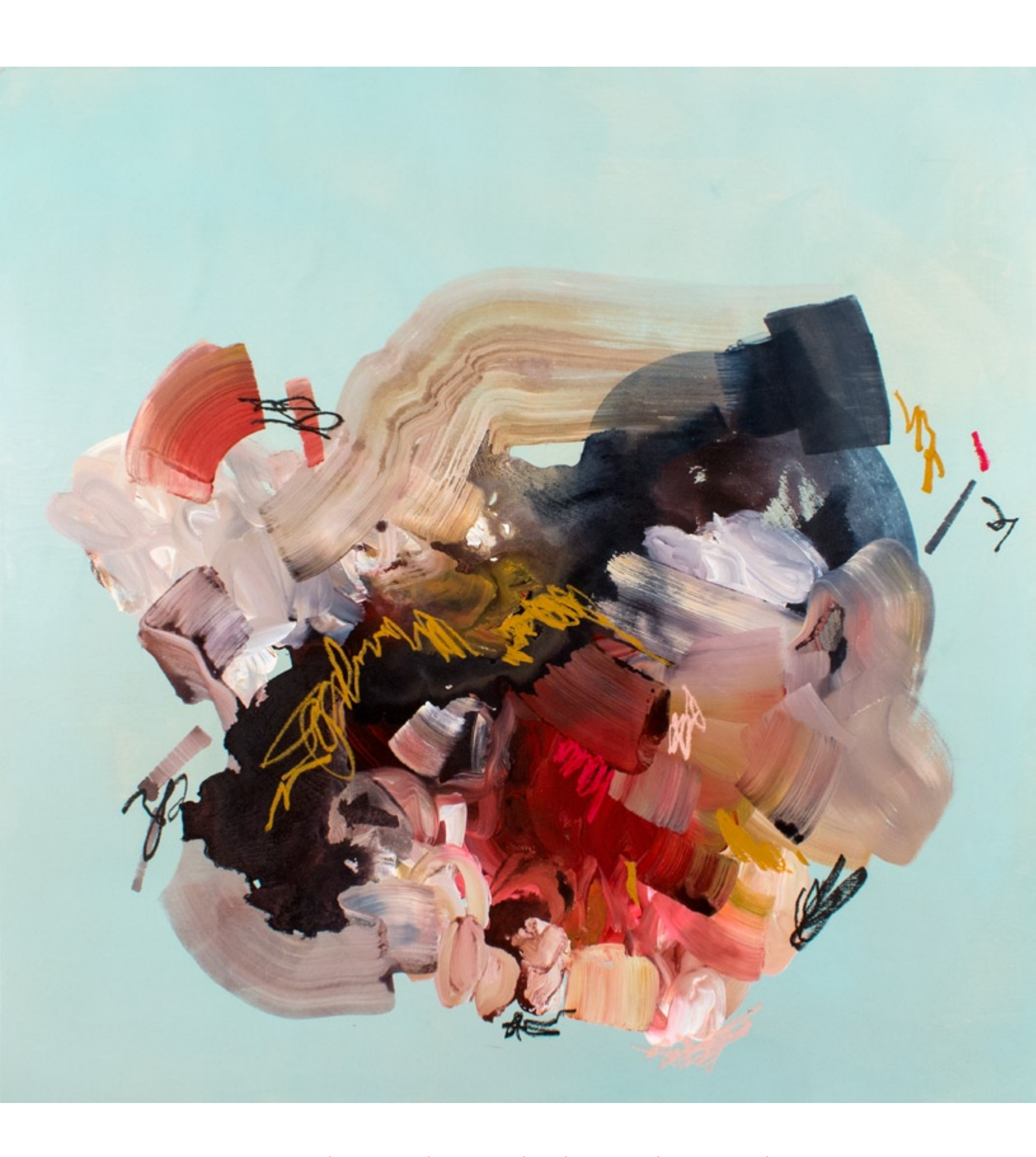
Water Is The First Medicine, mixed media on panel, 48 X 48 inches