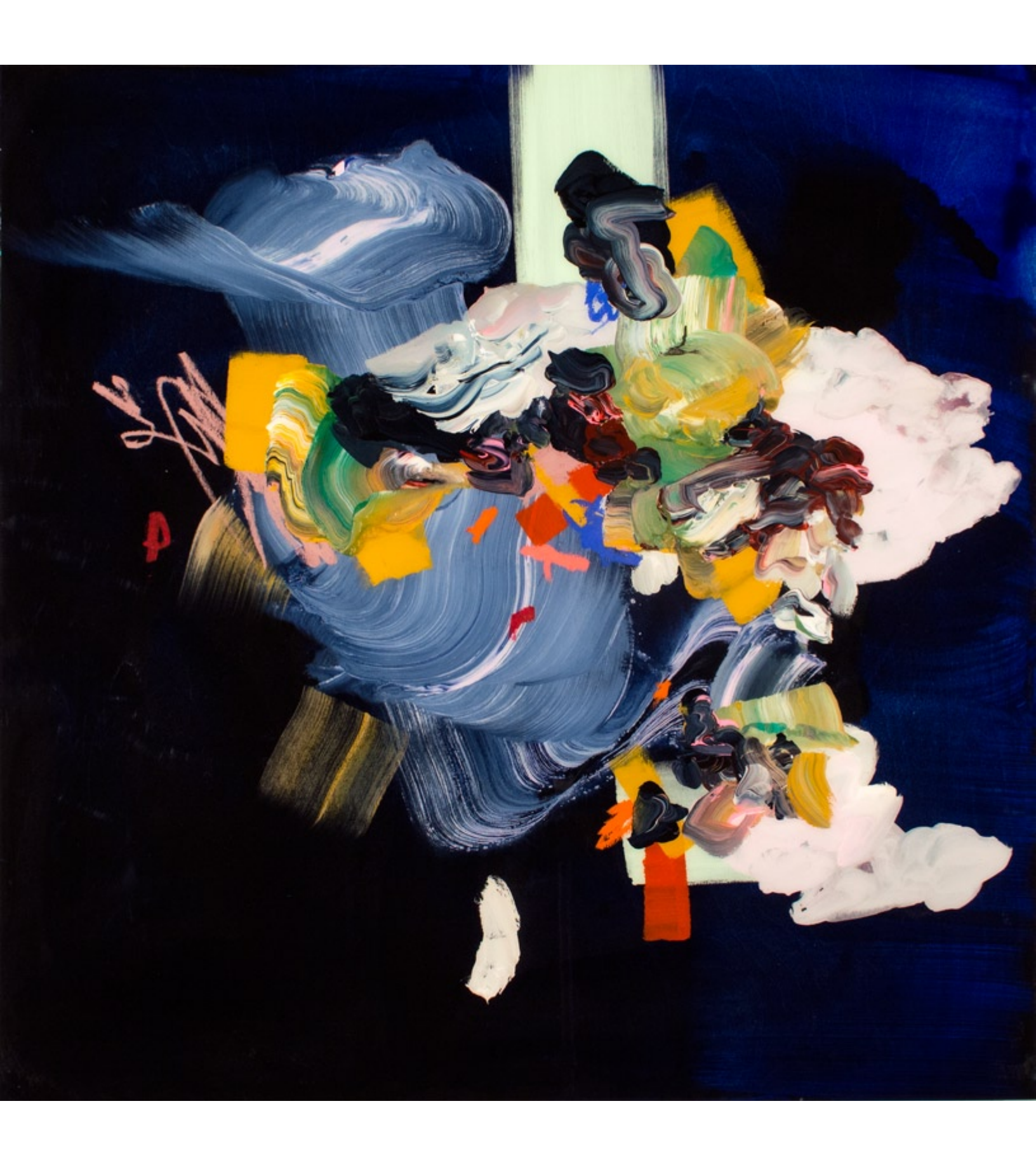
Moving Slowly In A Dark Room, mixed media on panel with resin, 36\ X\ 36 inches