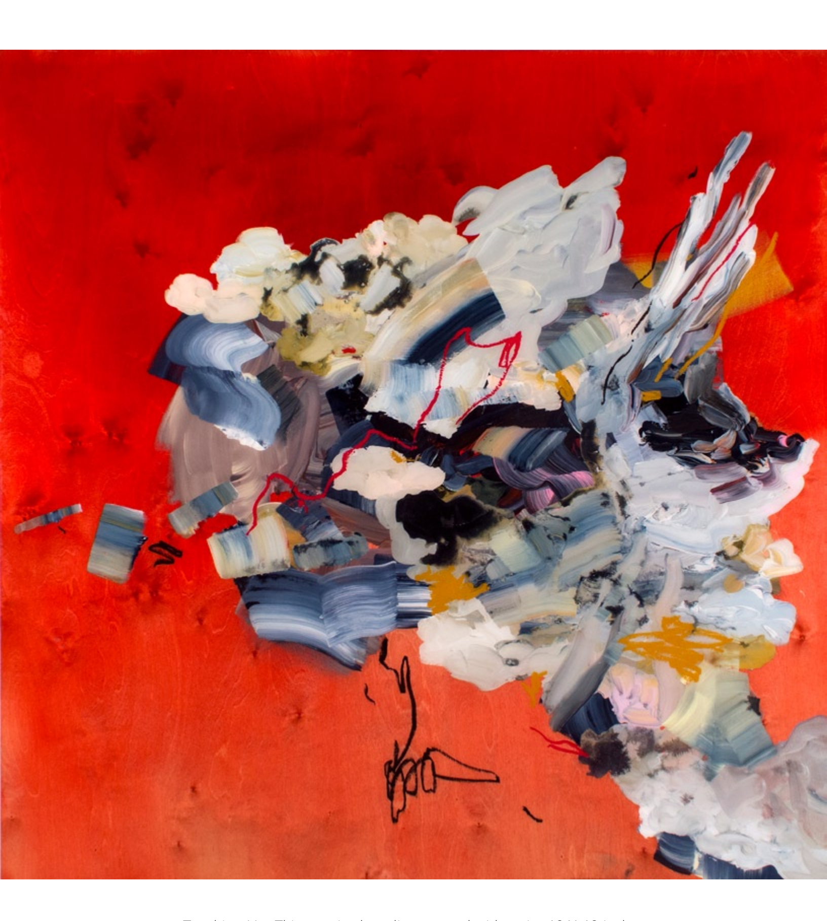
Touching Hot Things, mixed media on panel with resin, 48 X 48 inches