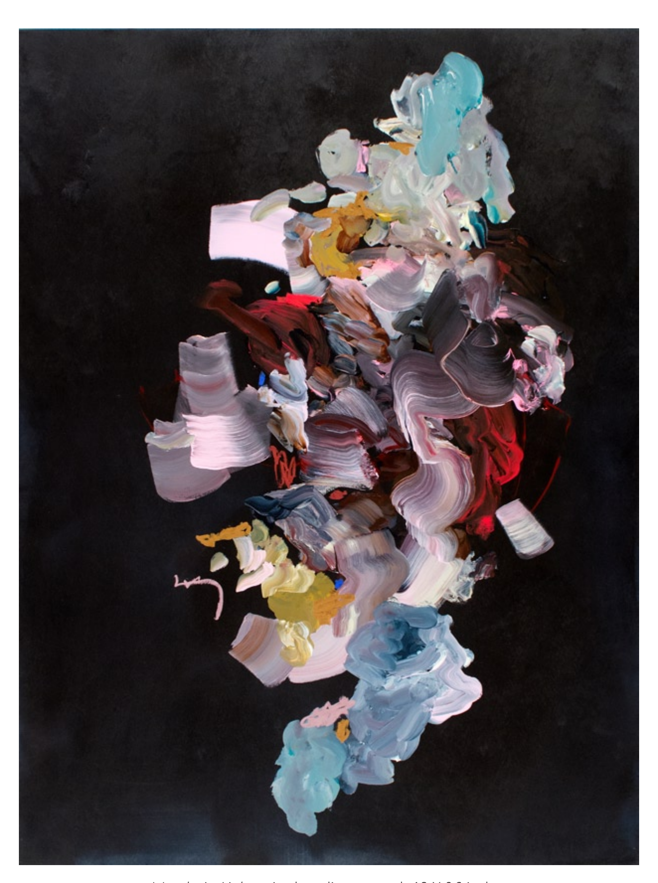
Moody \ As \ Light, \ mixed \ media \ on \ panel, 48 \ X \ 36 \ inches