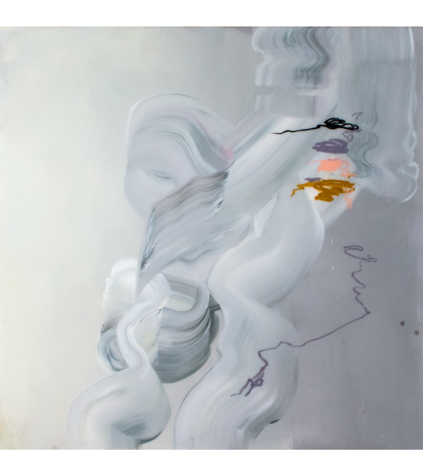
Let Down Light, mixed media on panel with resin, 48 X 48 inches