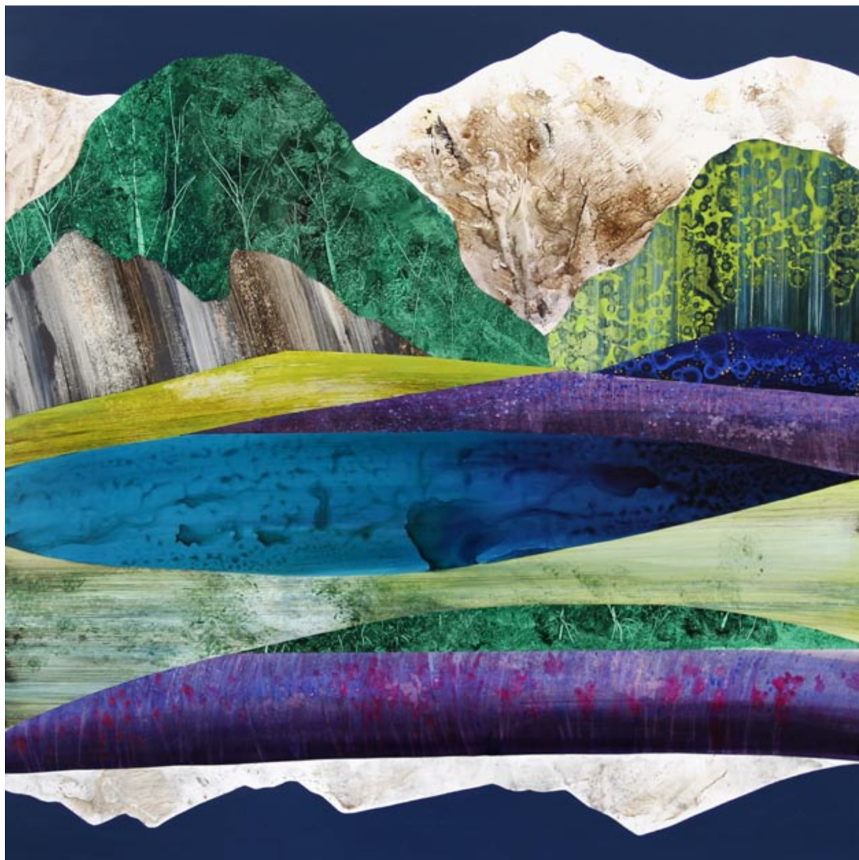
Mountain Alpine Lakes , acrylic on panel, 48 x 48 inches