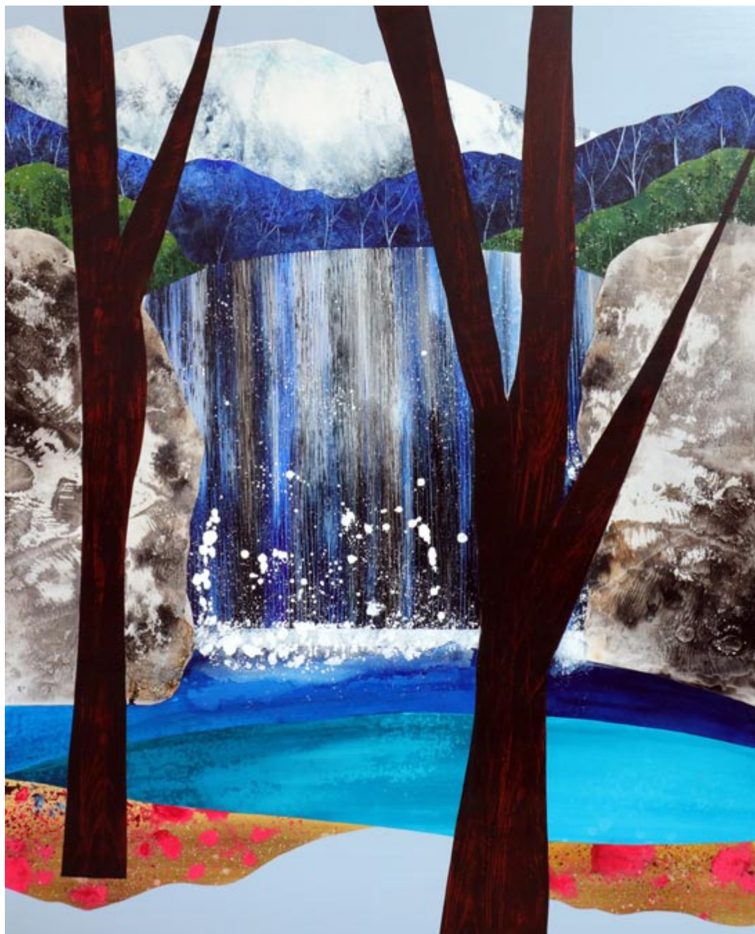
Beyond the Great Falls , acrylic on panel, 60 x 48 inches