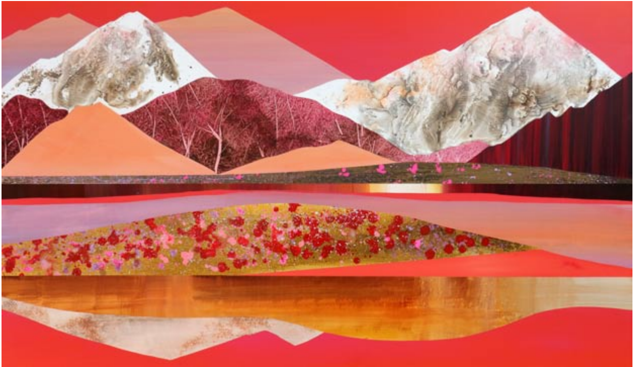
Mystic Mountain , acrylic on panel, 28 x 48 inches Cover image: Edge of the Wild , acrylic on panel, 60 x 60 inches

Inspired by the geology of the Cascade Mountains, Sarah Winkler continues her exploration of landscape with her distinctive layering process. She depicts the region's overlapping, collage-like terrain as a textured rise in elevation, with lowlands covered in coniferous forests, waterfalls, and wildflowers. Horizontal bands of meadows, alpine lakes, and glaciers characterize higher altitudes. Winkler mimics the process of erosion by applying paint to wood panels, then sanding back through layer after layer. Oscillating between abstraction and figuration, she pays close attention to borders, boundaries, and edges. Viewers get a sense of the landscape adapting and transitioning, beckoning toward adventure and exploration.