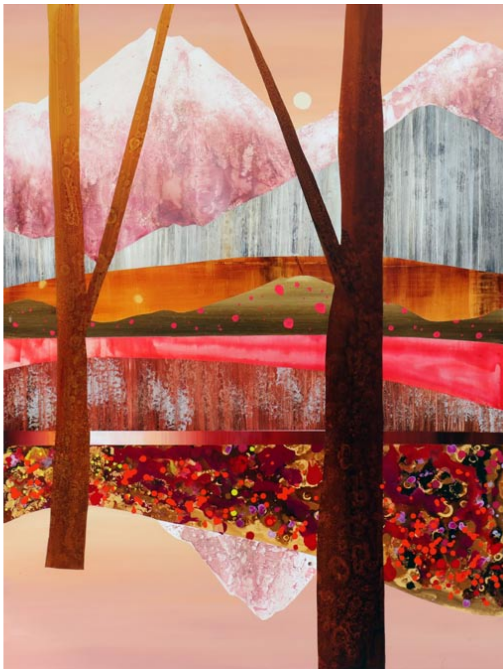
Gates of the Cascades , acrylic on panel, 48 x 36 inches