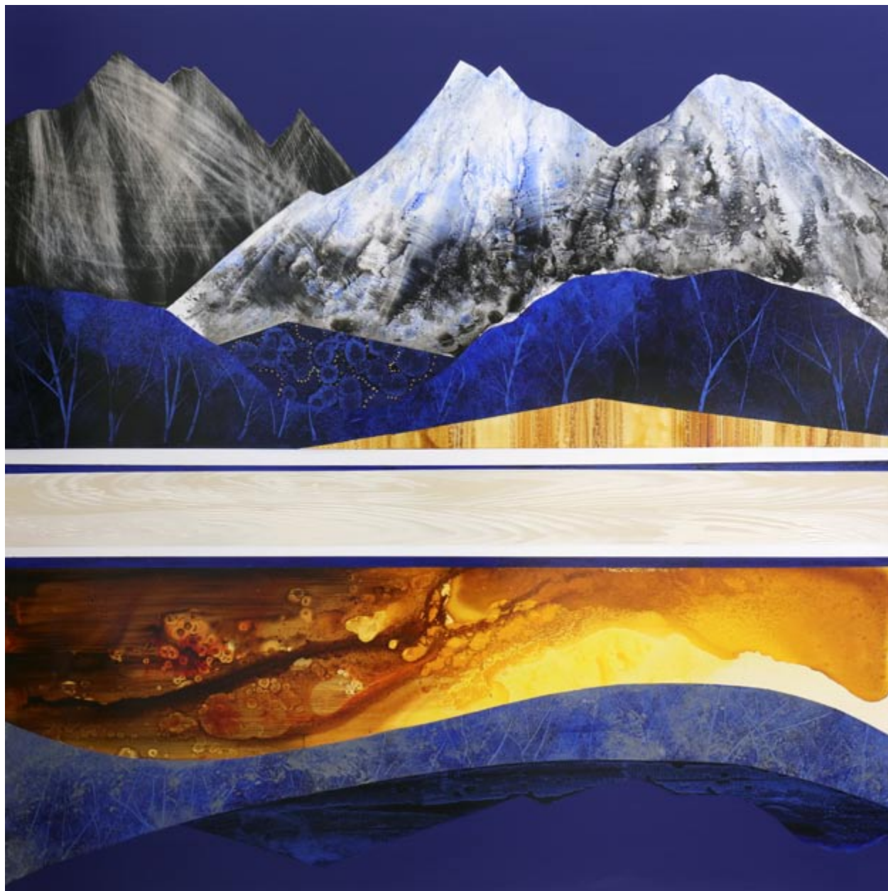
Magma Chamber , acrylic on panel, 48 x 48 inches