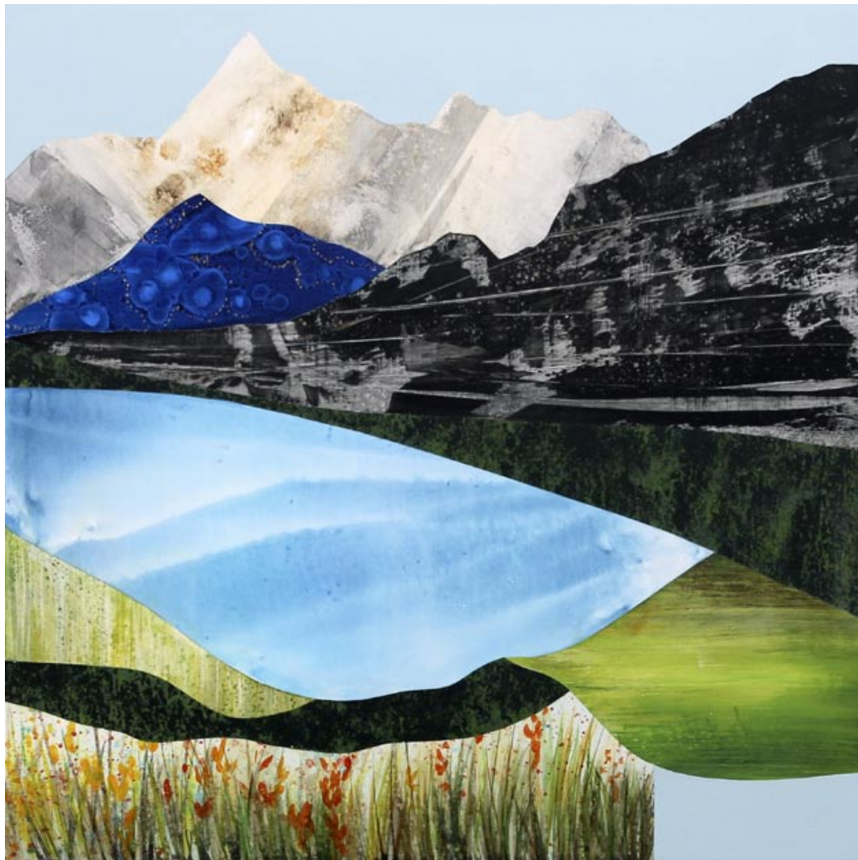
Spring Summits , acrylic on panel, 24 x 24 inches