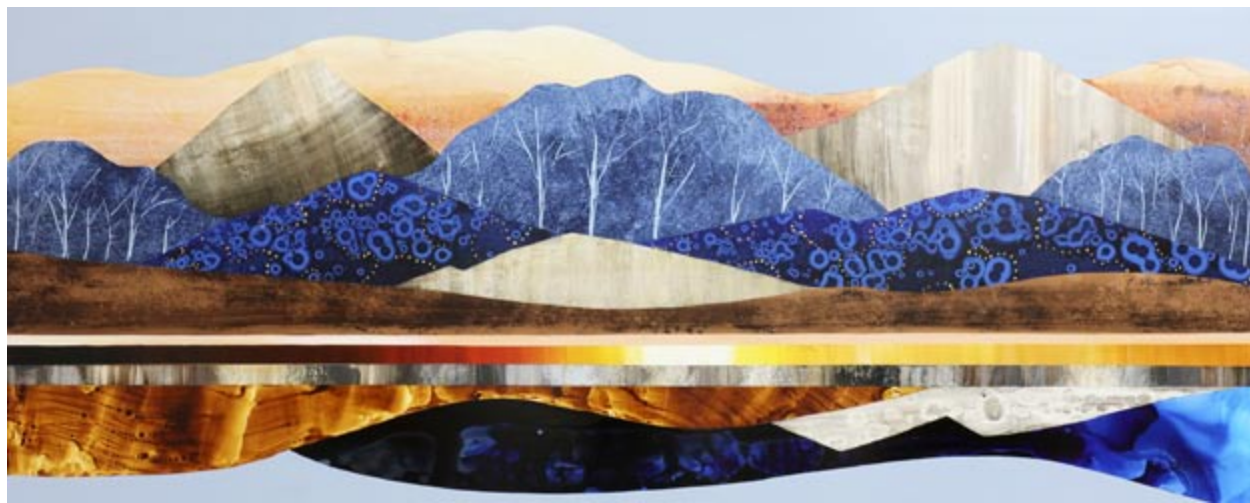
Sun Rests on Mountains Wide , acrylic on panel, 24 x 60 inches