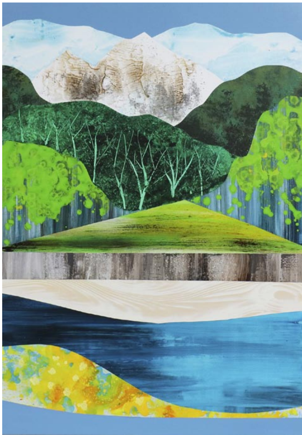
Verdant Valleys , acrylic on panel, 34 x 24 inches