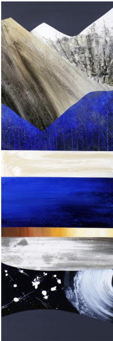
Layers of Winter, acrylic on panel, 60 x 19.5 inches