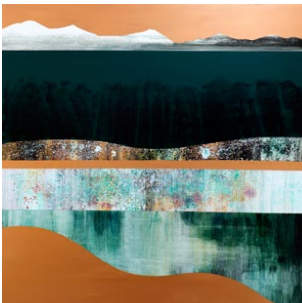
Lava Lake, acrylic on panel, 36 x 36 inches,