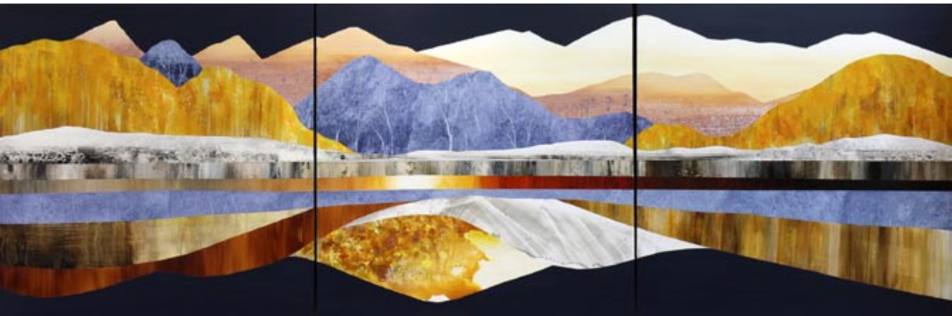
Neon Peach Snowlight Over The Valley , acrylic on panel, 48 x 144 inches