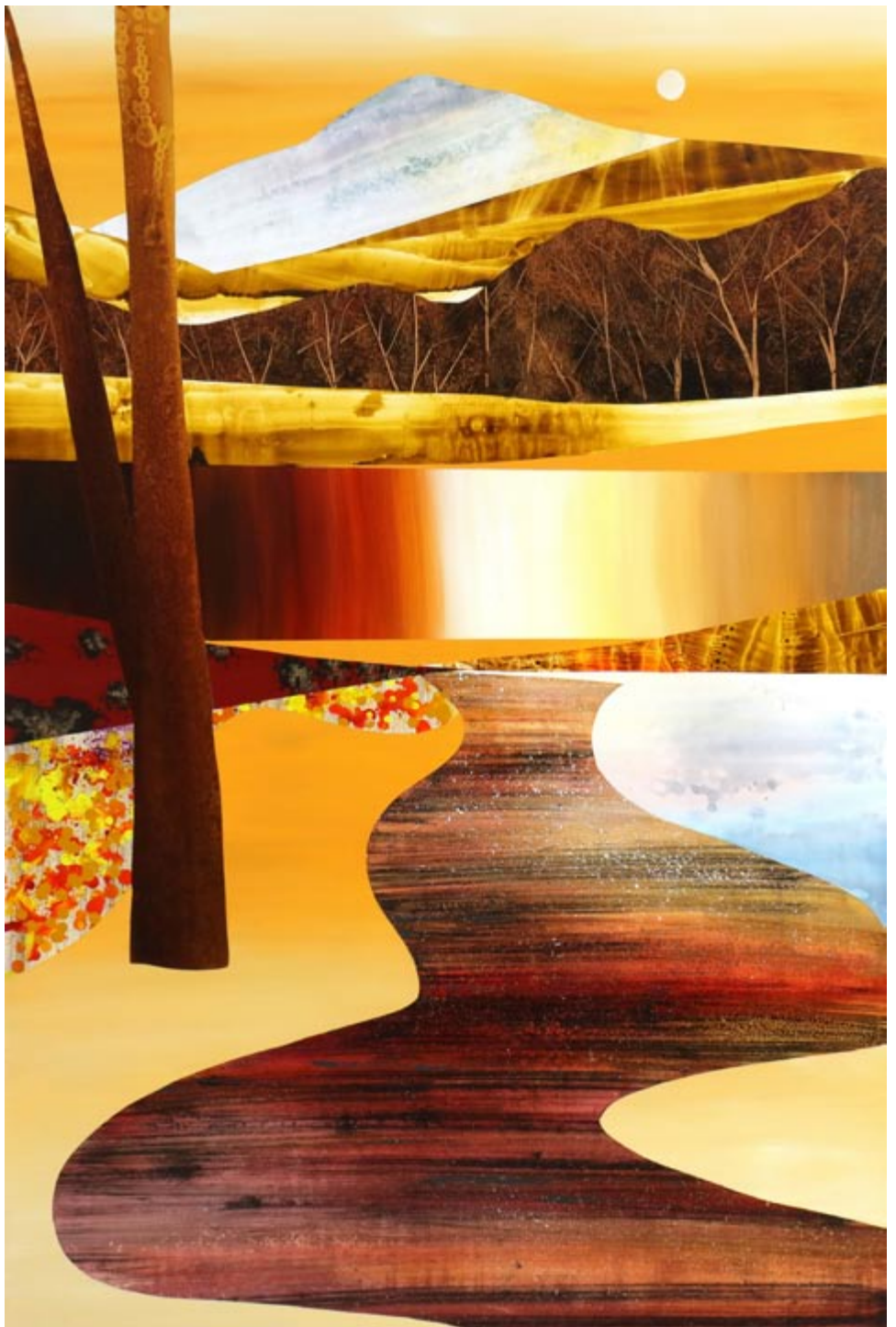
Sunrise Yellow, Yakima Valley, acrylic on panel, 60 x 48 inches