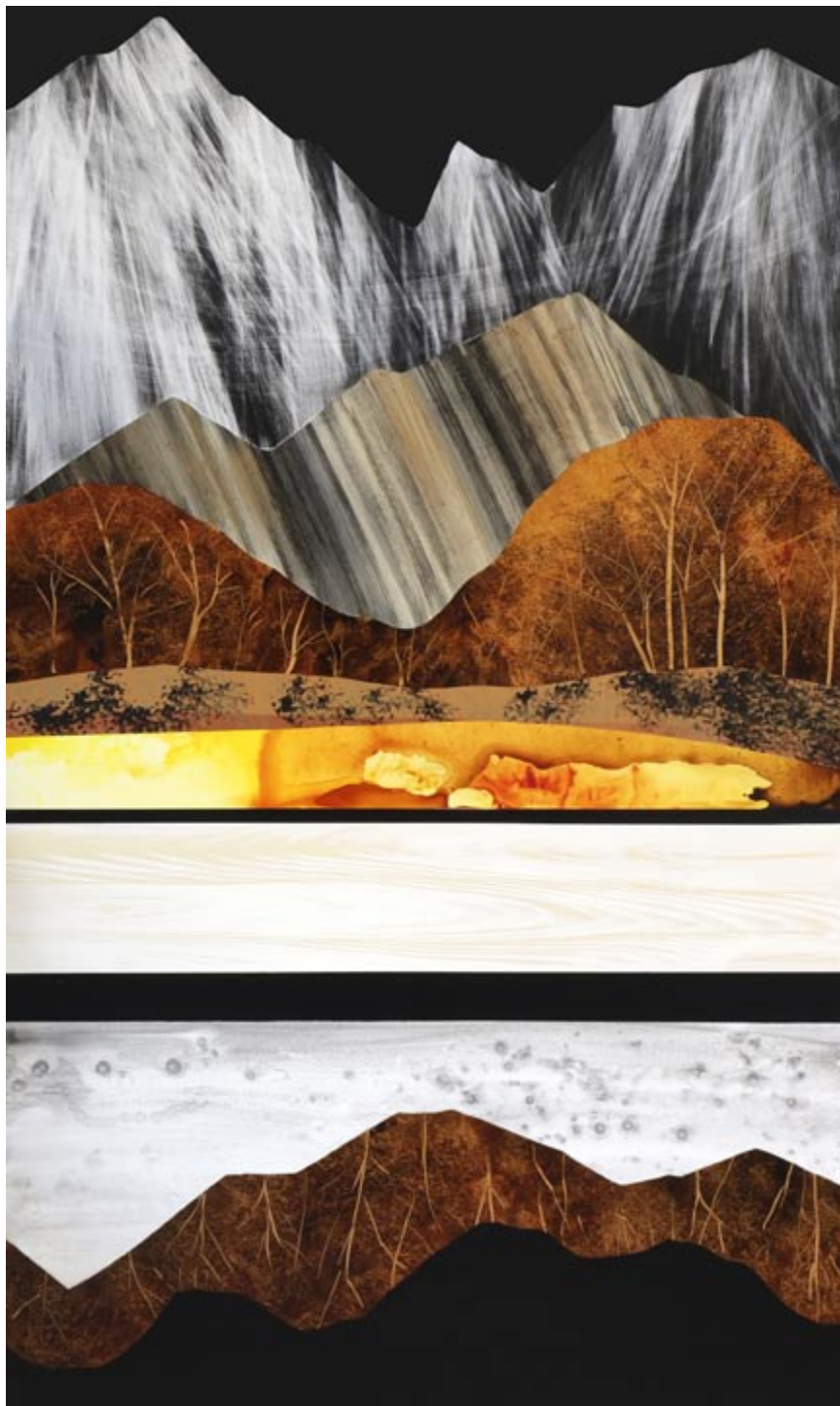
Cinder Cone, acrylic on panel, 60 x 36 inches