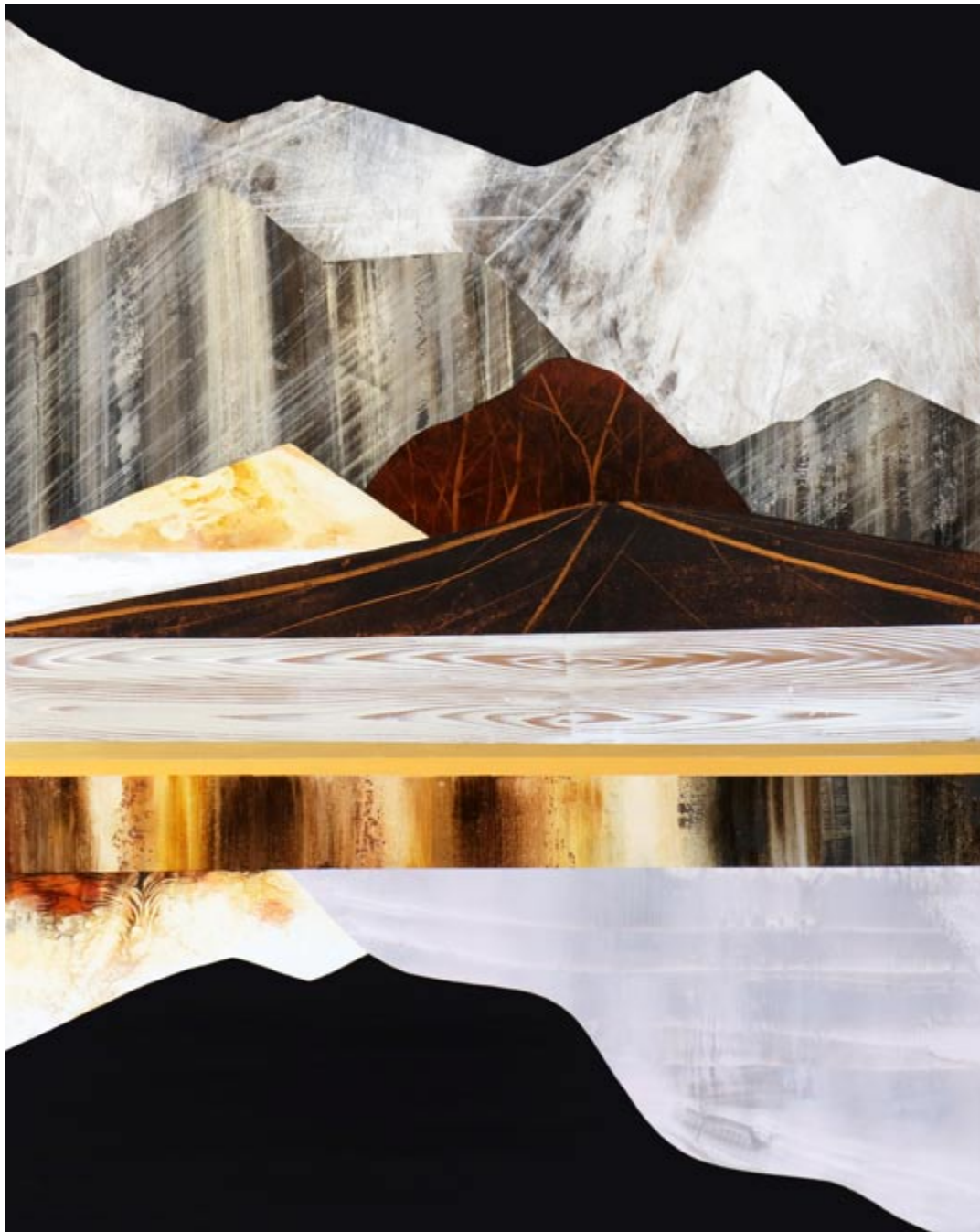
Sediments of Stillness acrylic on panel 60 x 48 inches