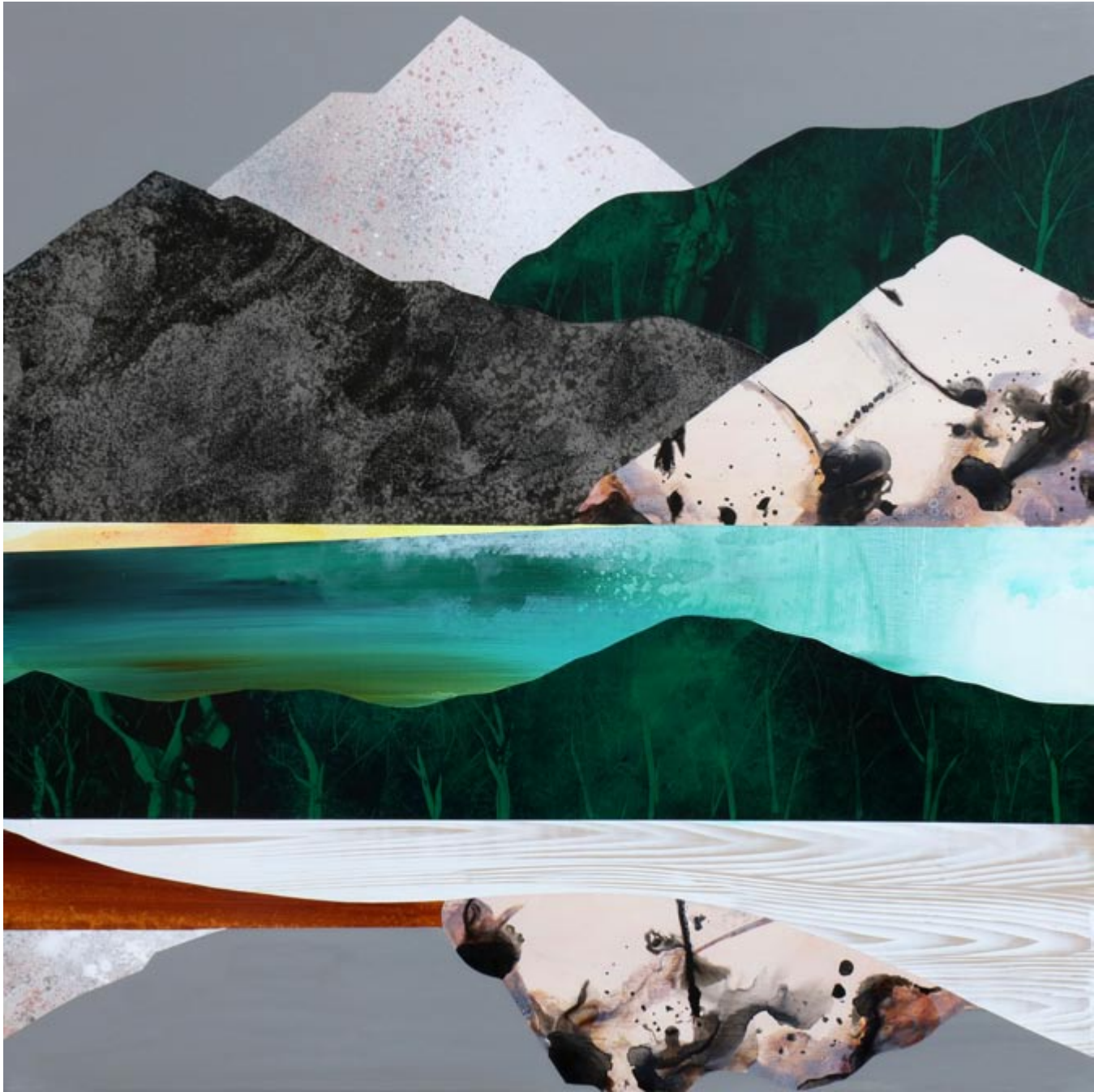
River Rock: Quartzite, Basalt, Moss Agate acrylic on panel 30 x 30 inches