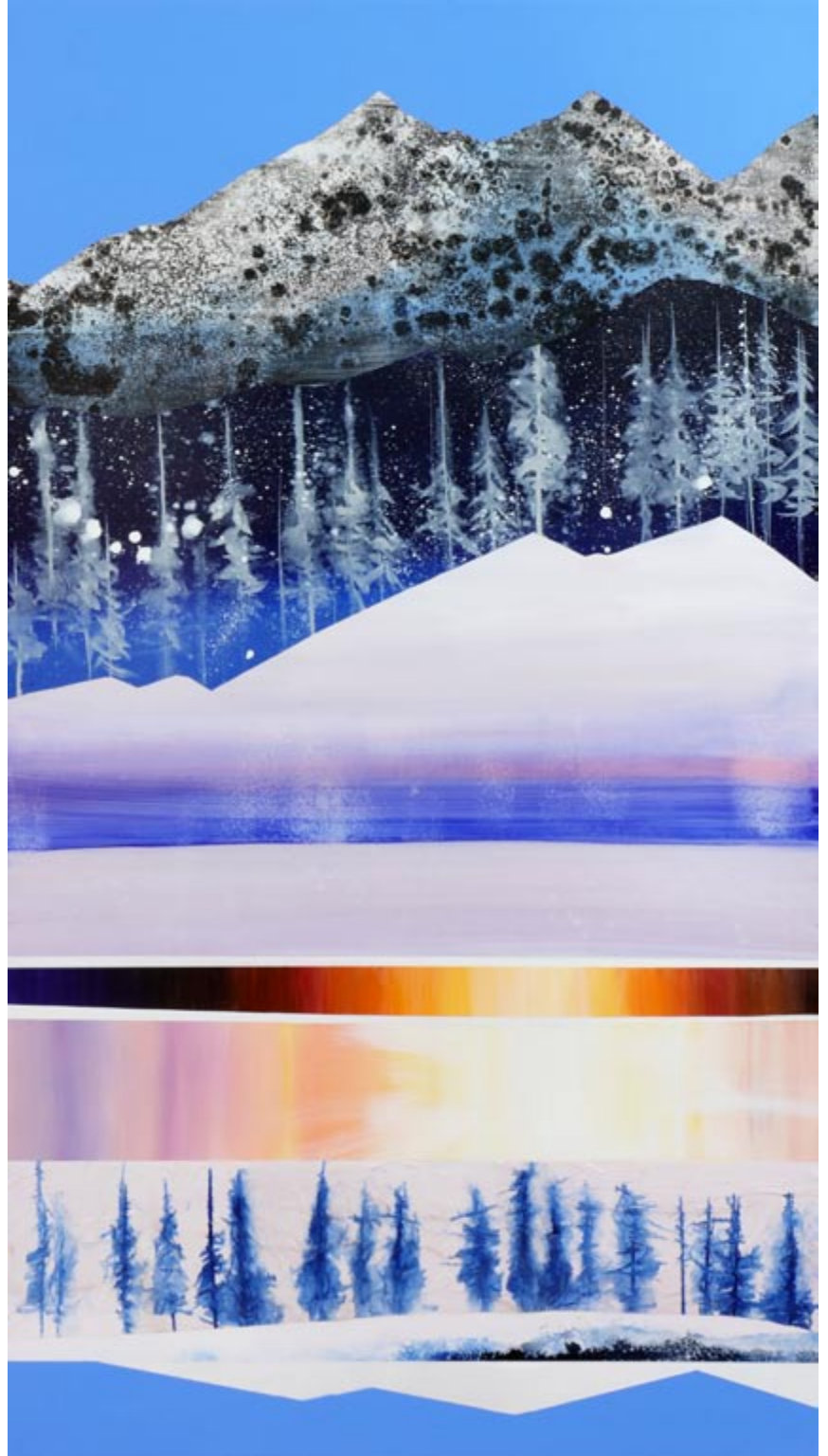
Blue Fir Silence acrylic on panel 60 x 34 inches