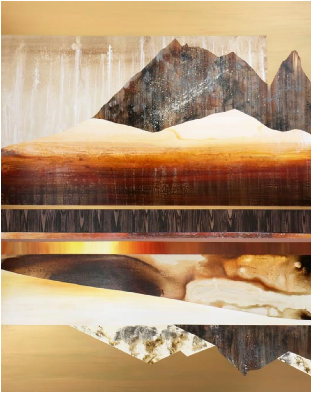
Alpine Timberline acrylic on panel 60 x 48 inches