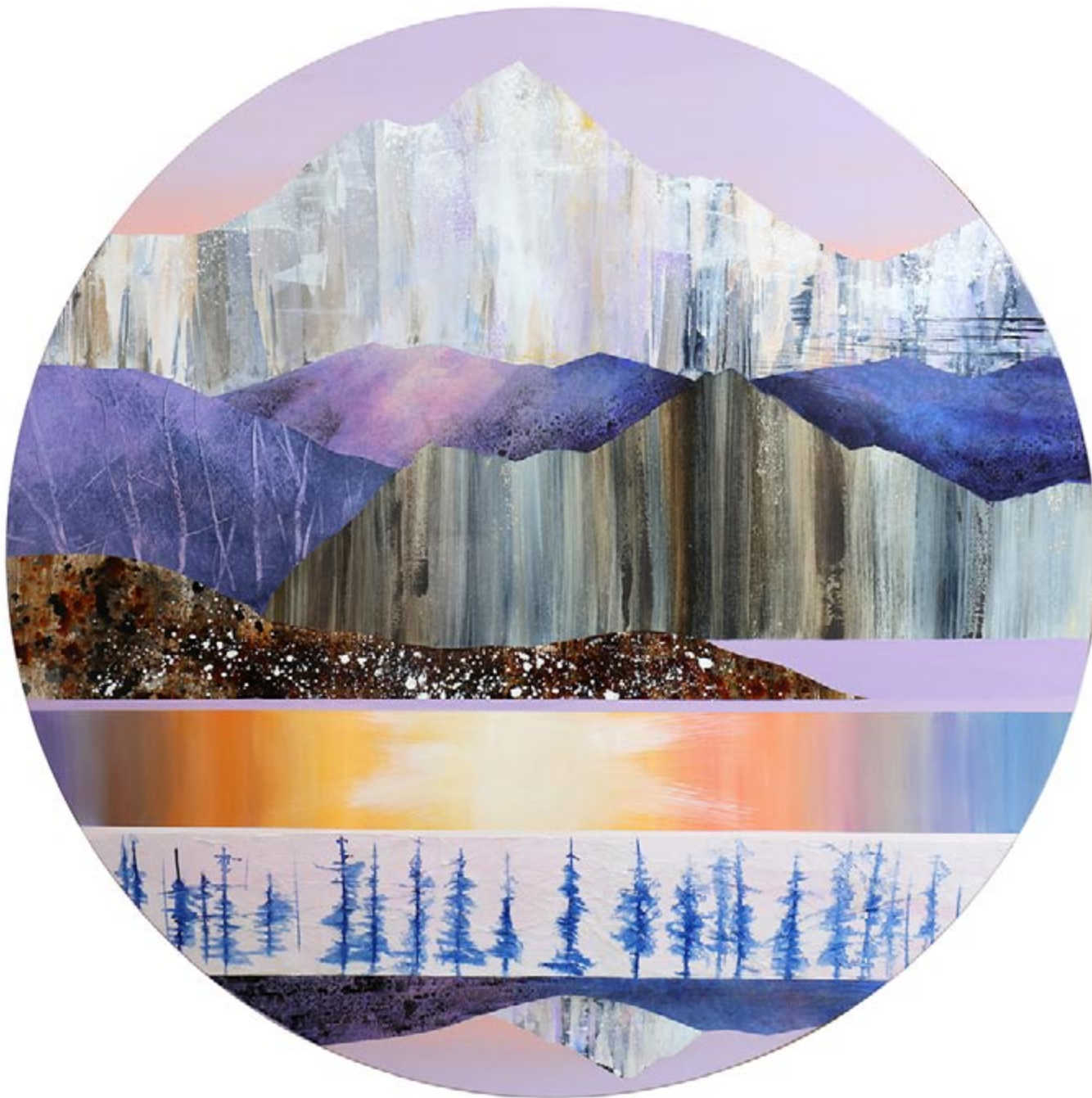
Ascent in Quartz and Cloud acrylic on panel 49.5 x 49.5 inches