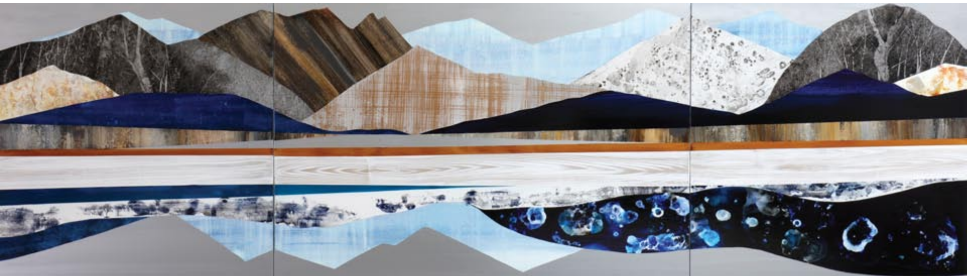
Above: Supermoon, Winter Valley , acrylic on panel, 32 x 112 inches Cover image: Coastal Range , acrylic on panel, 60 x 61.5 inches