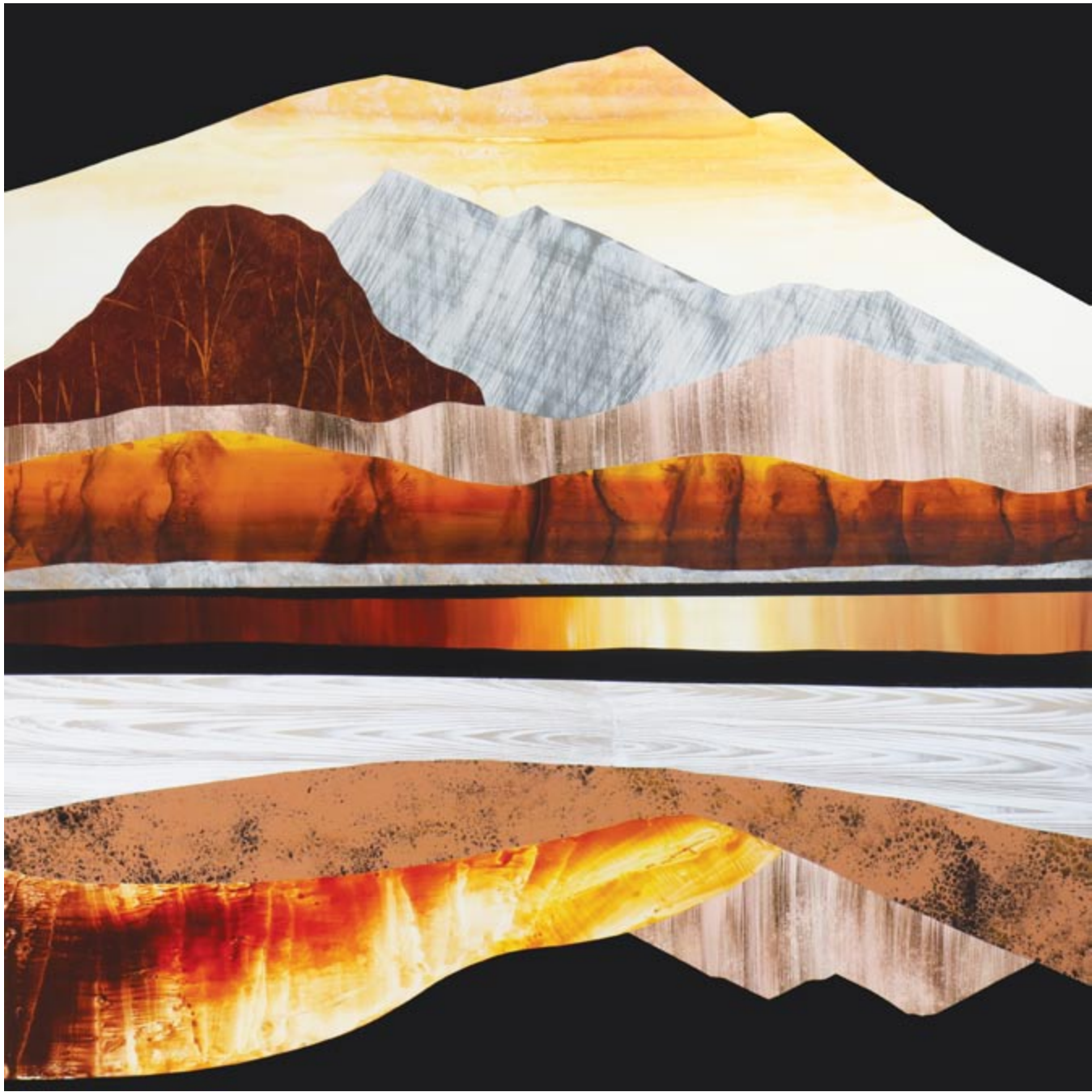
High Desert Expanse acrylic on panel 60 x 60 inches