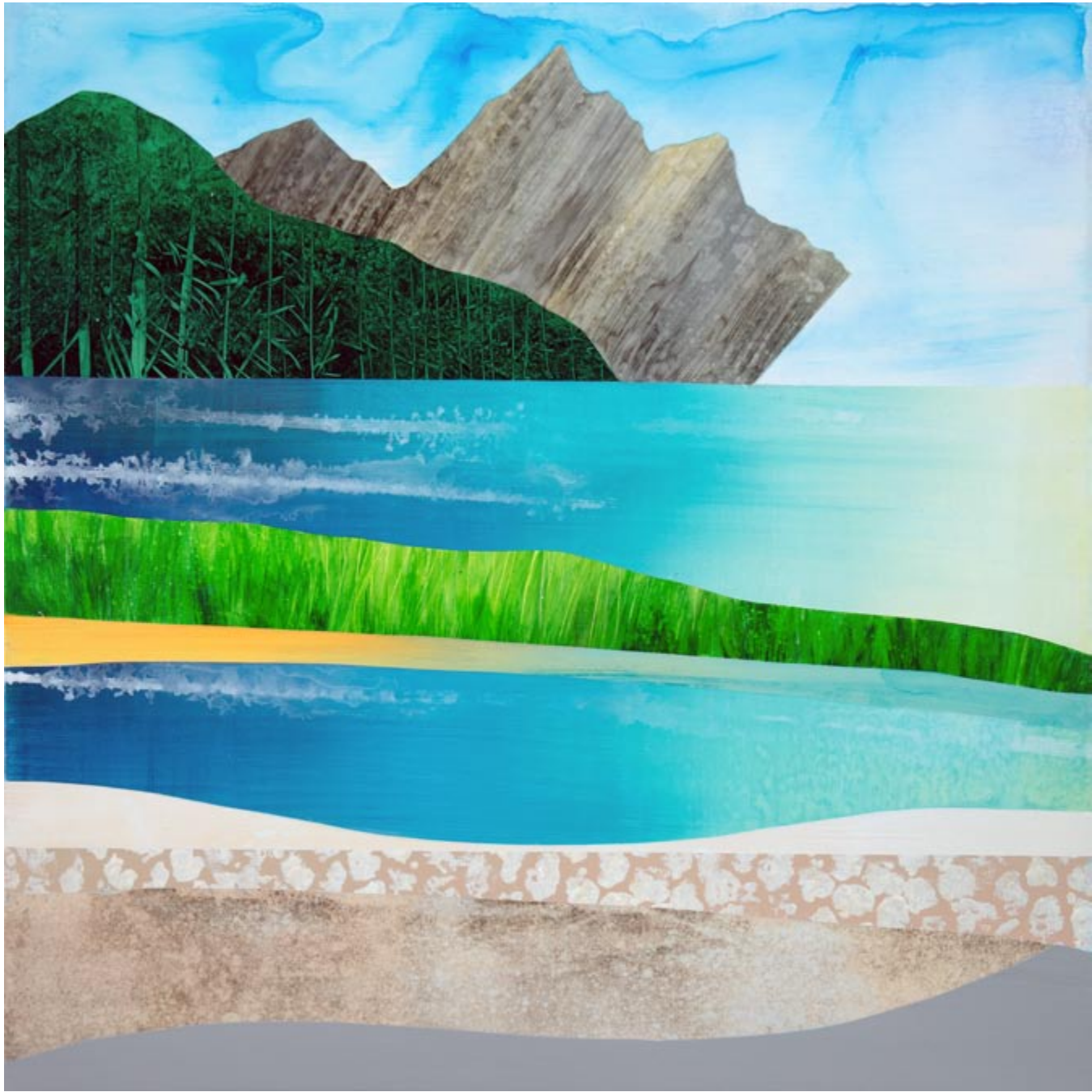
Peninsula acrylic on panel 20 x 20 inches