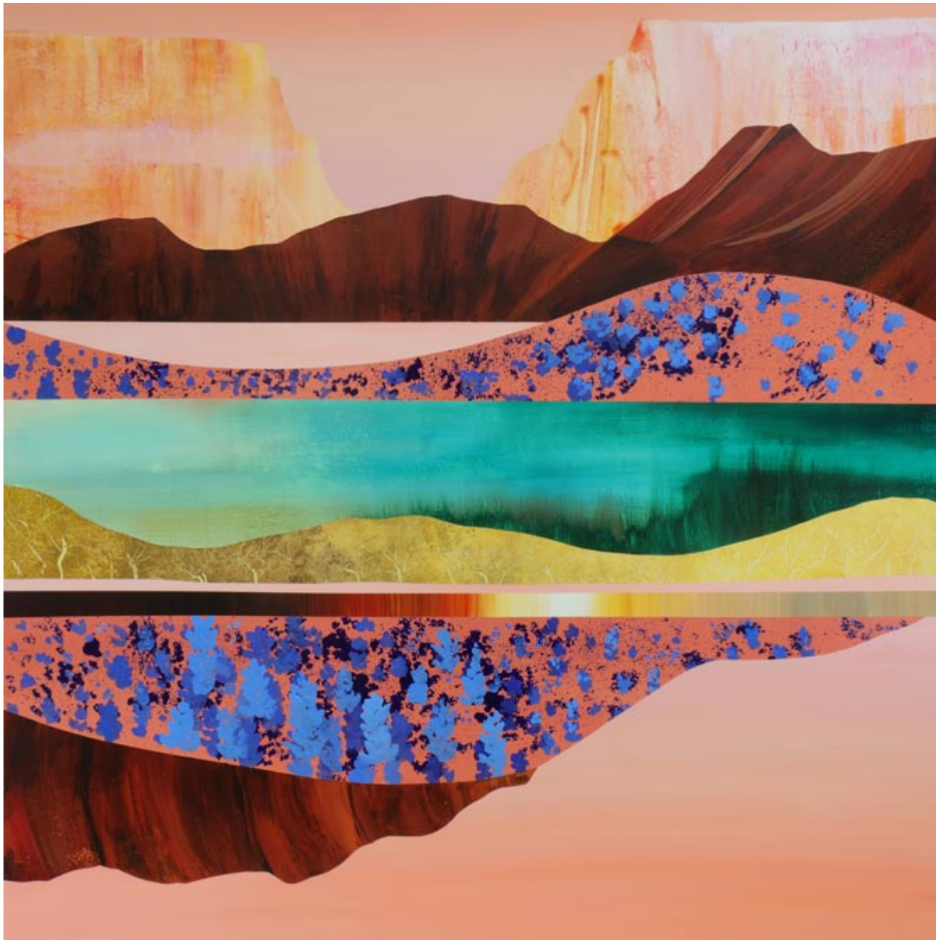
Bluebonnets on the Rio Grande acrylic on panel 60 x 60 inches