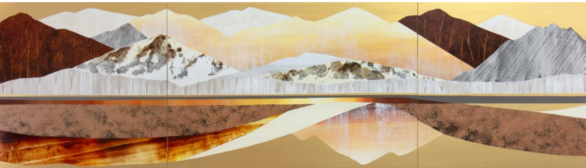
Aspens in Snowdrift acrylic on panel 32 x 112 inches