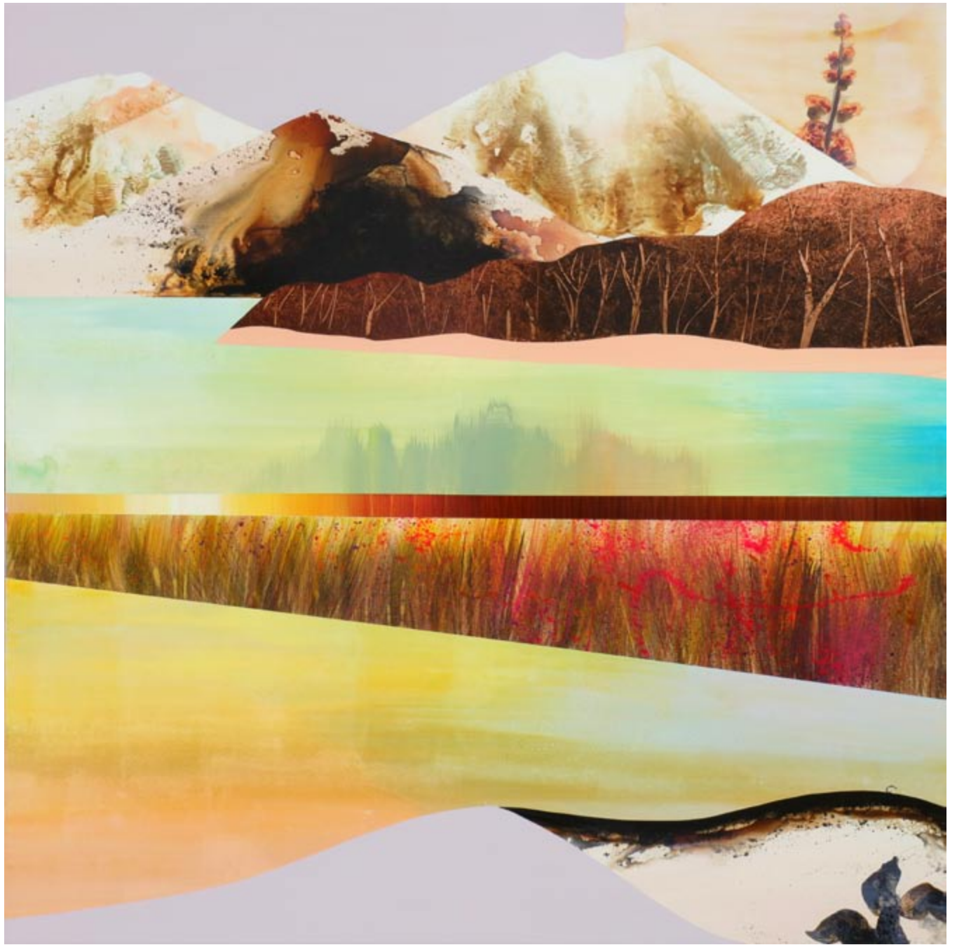
Montana Moss Agate River Scene acrylic on panel 42 x 42 inches