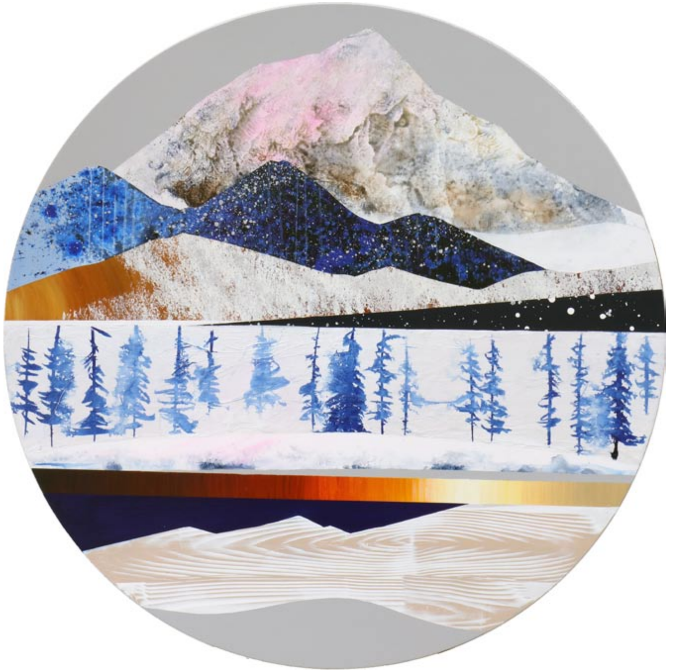
Pines Beneath Snowlight acrylic on panel 29.75 x 29.75 inches